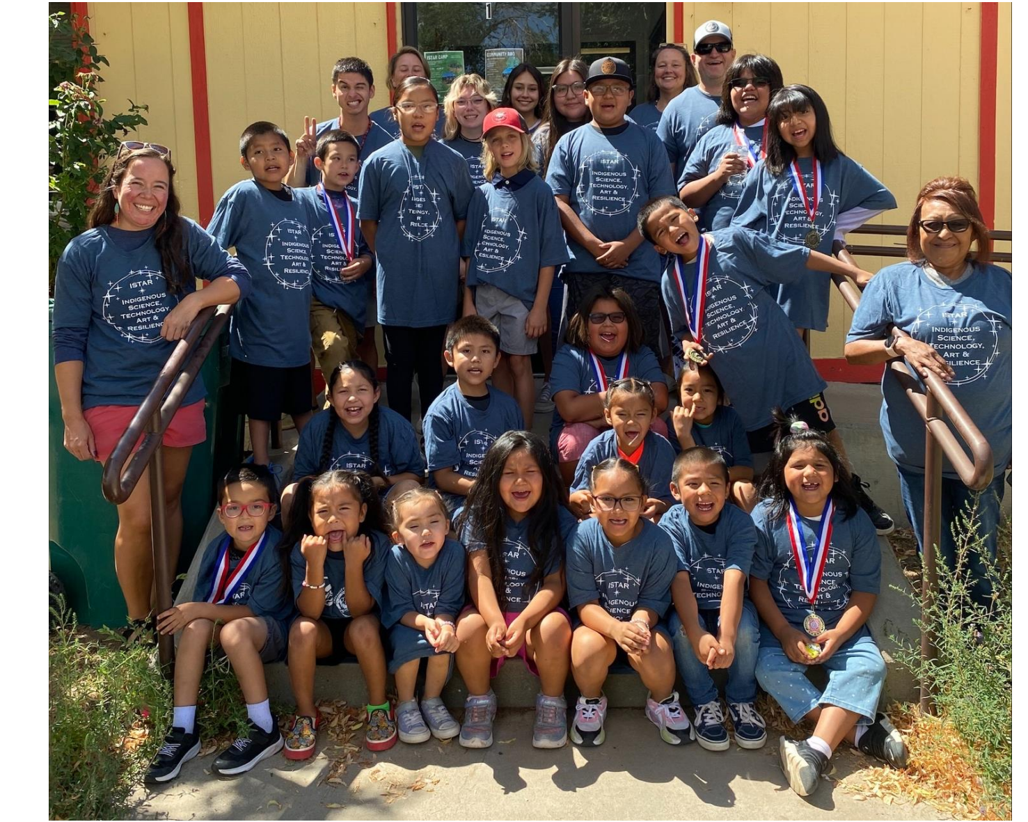
Helped with the ISTAR (Indigenous, Science, Technology, Art, and Resilience) Youth Camp.