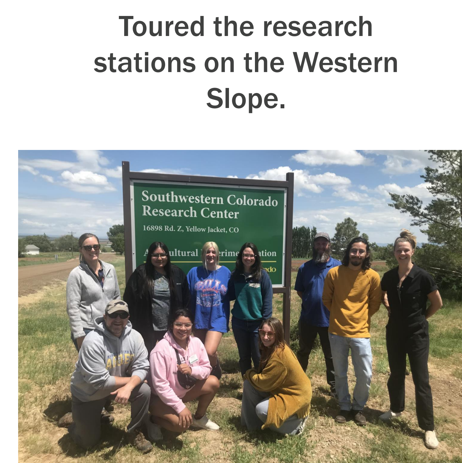
Toured the research stations on the Western Slope.