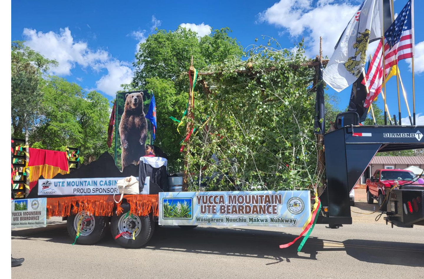
Attended the Bear Dance which is the celebration of spring.