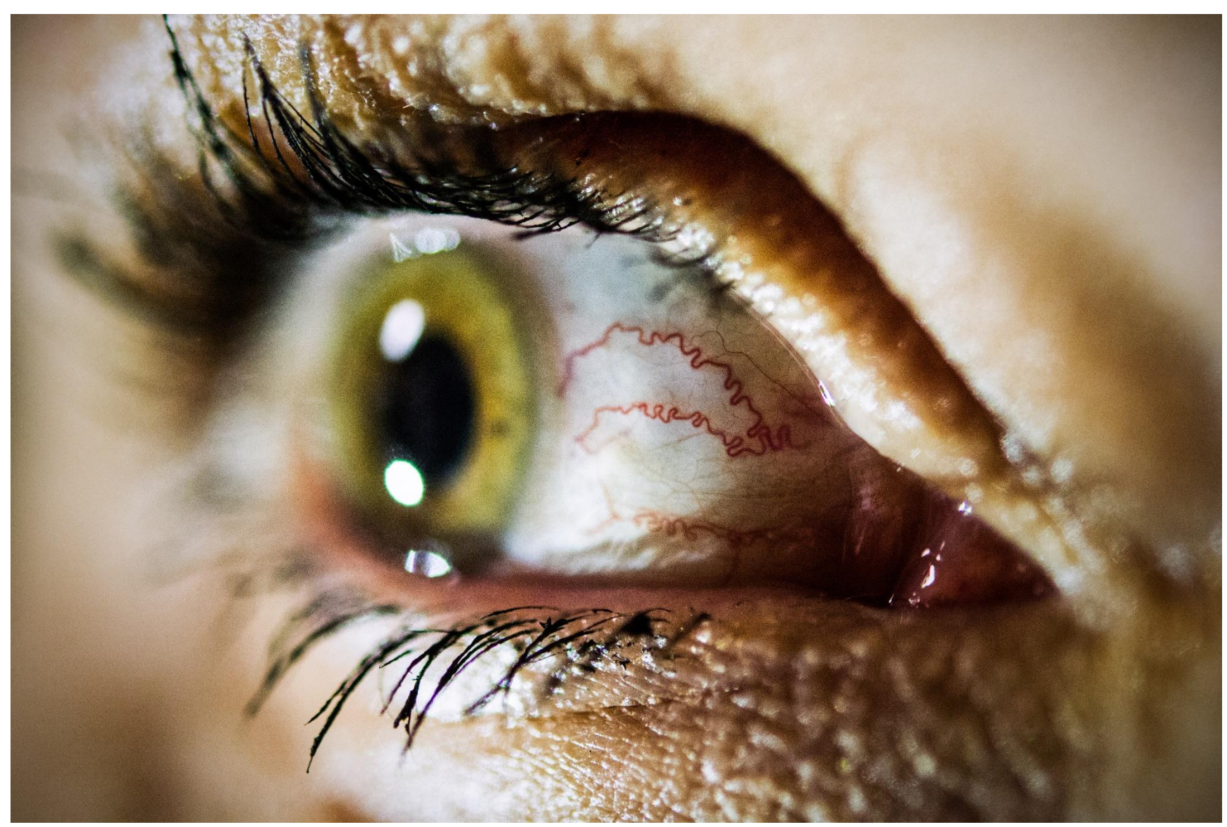
Figure 1: Lynn