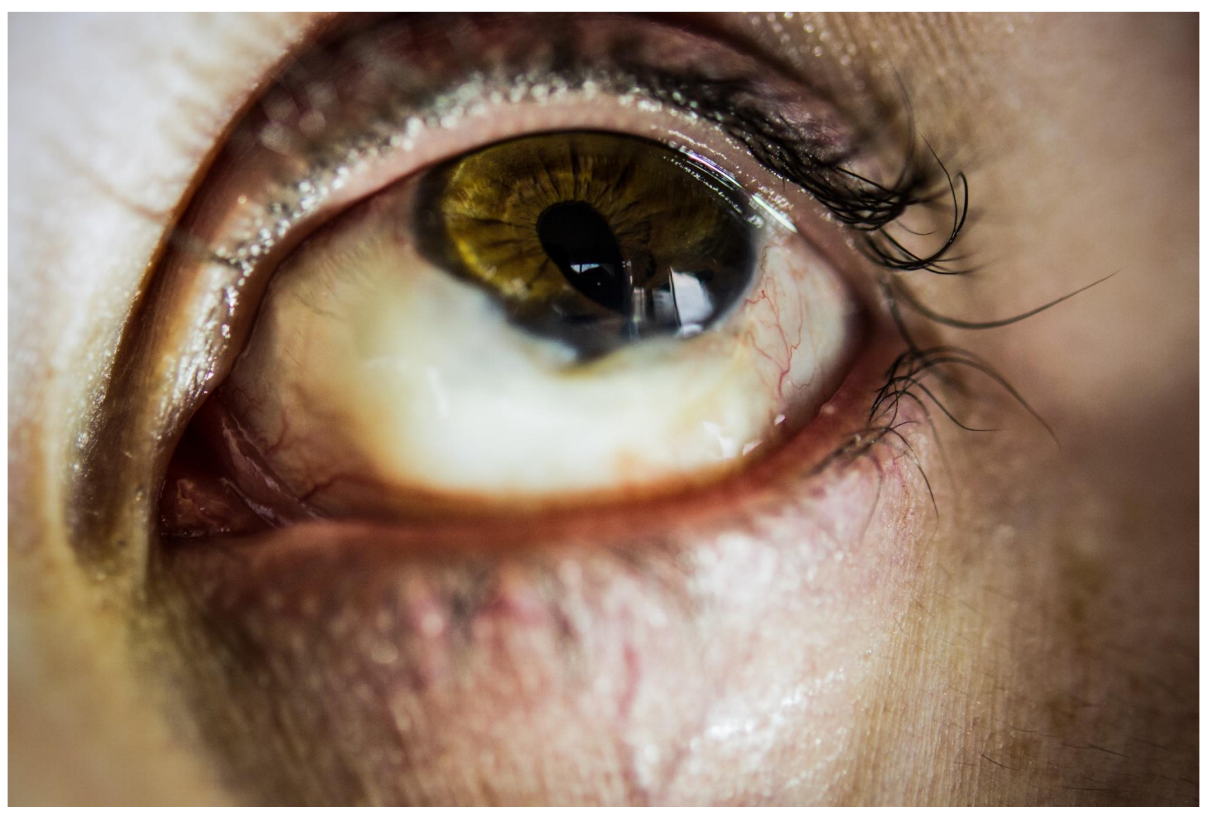
Figure 10: Tabythia After 2