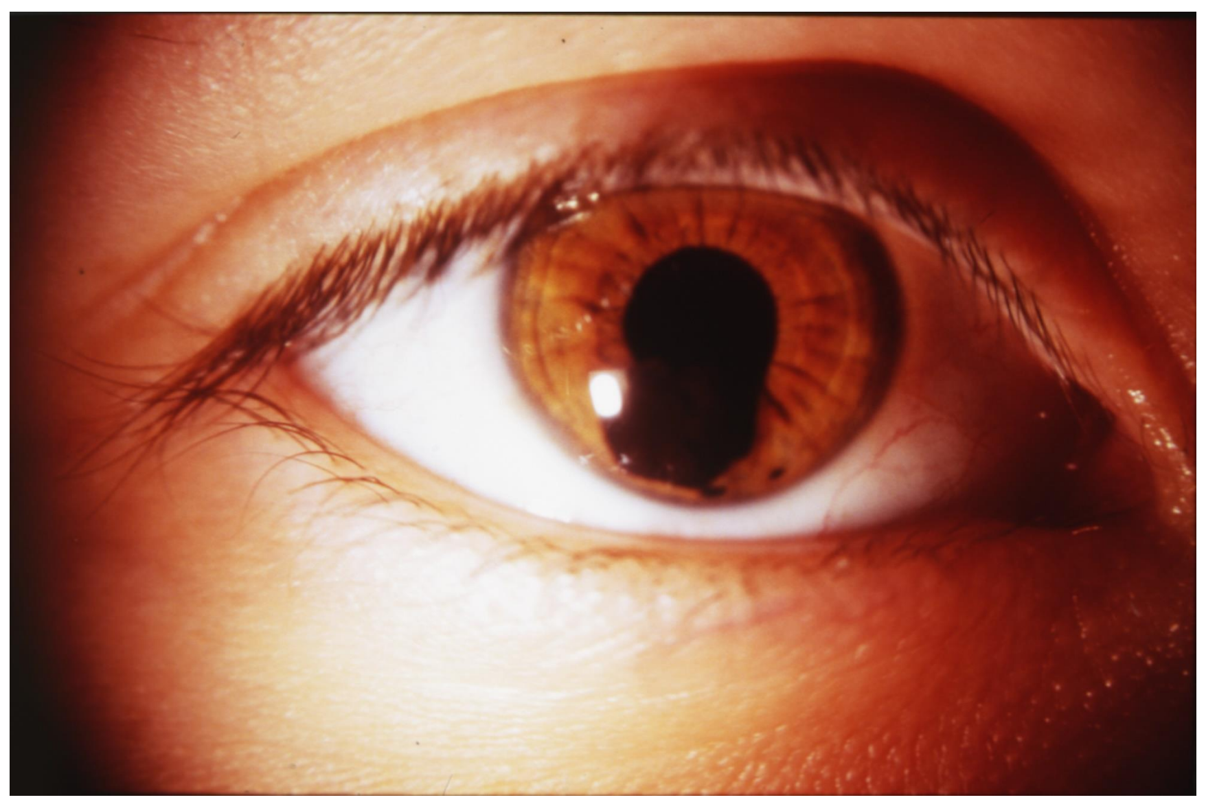
Figure 8: Tabythia Before