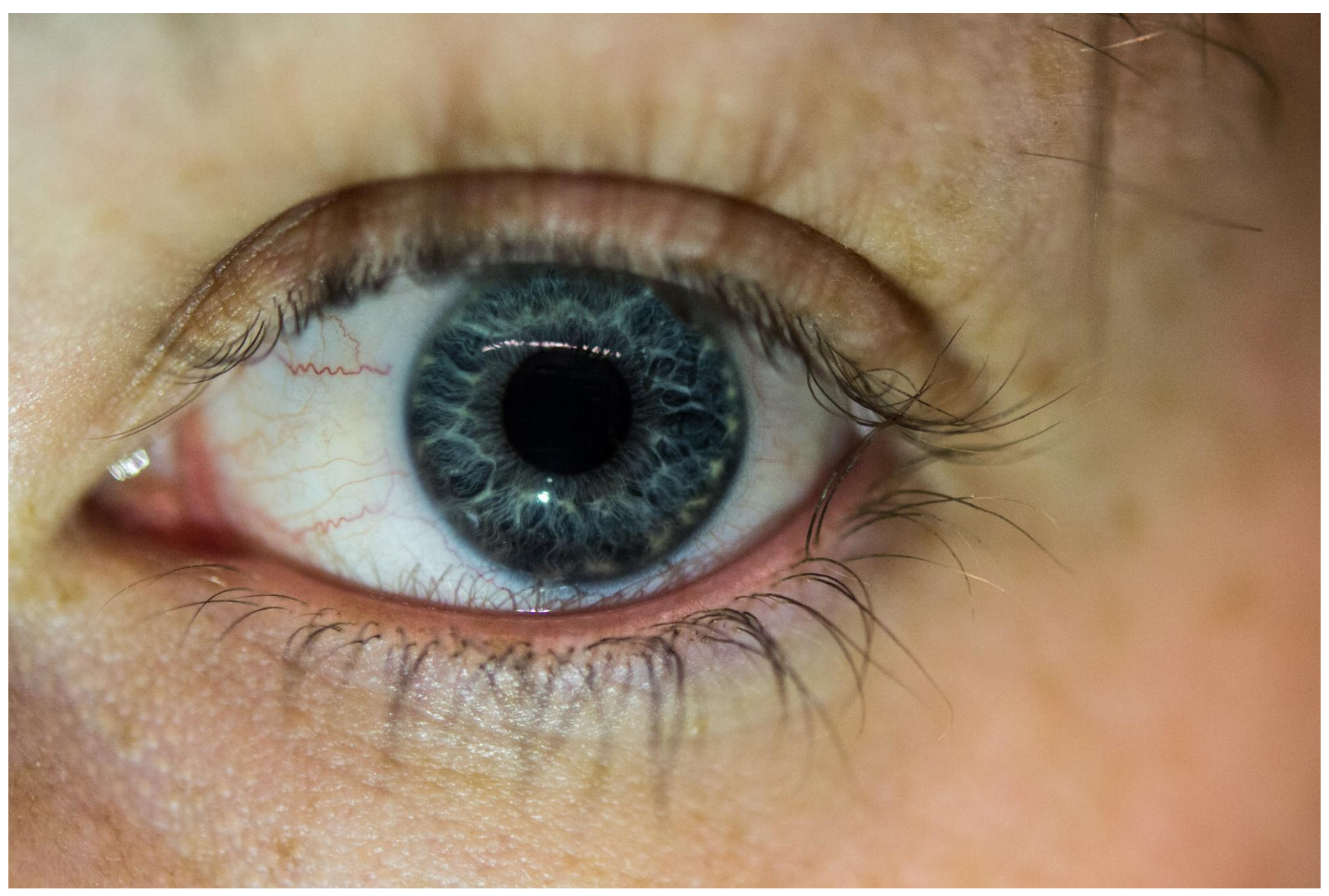
Figure 4: Rachel