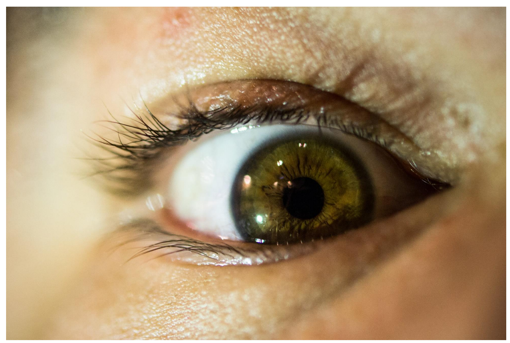
Figure 5: David