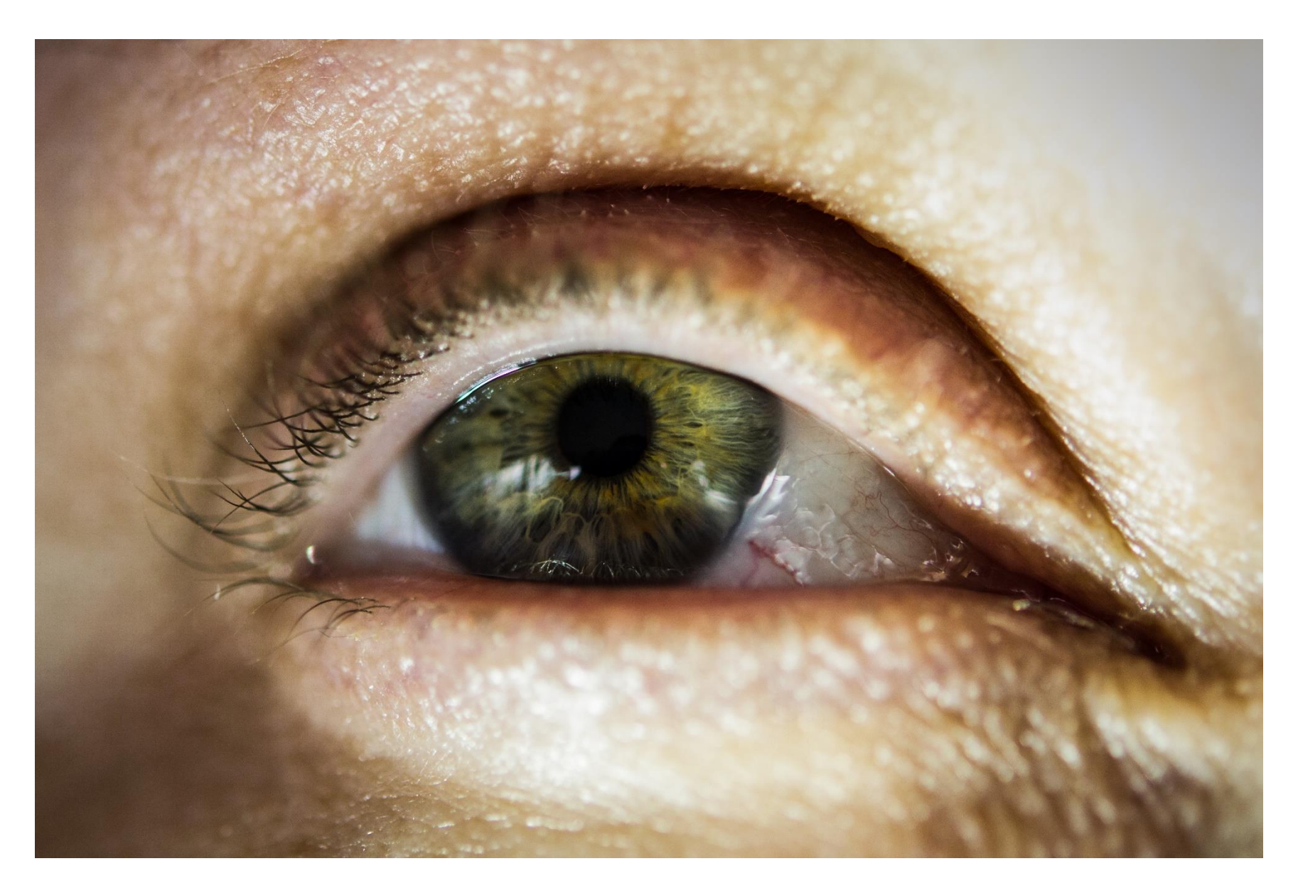
Figure 3: Kim