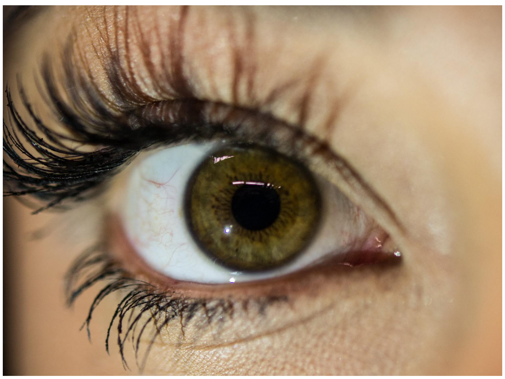
Figure 6: Emily