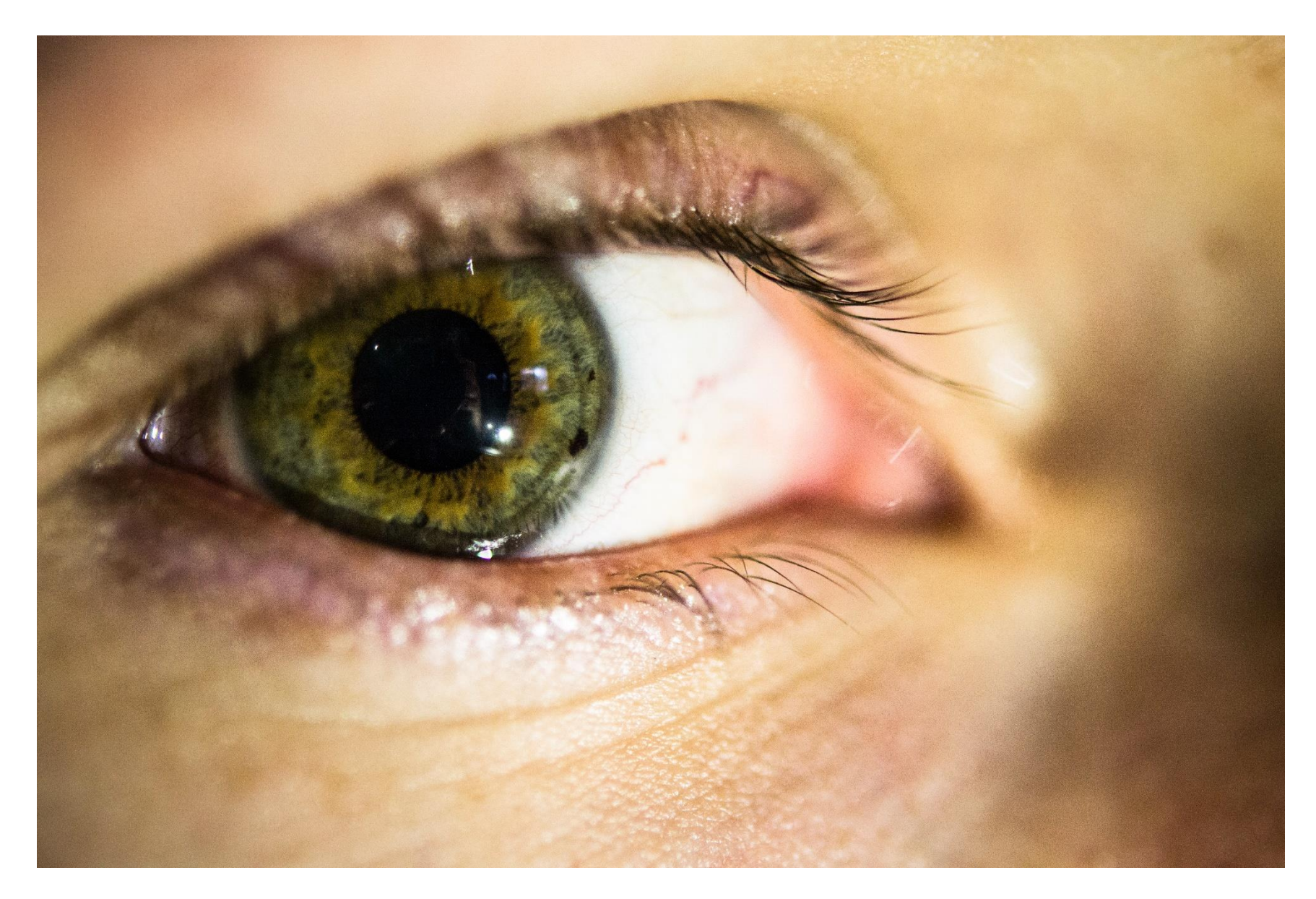
Figure 2: Trevor