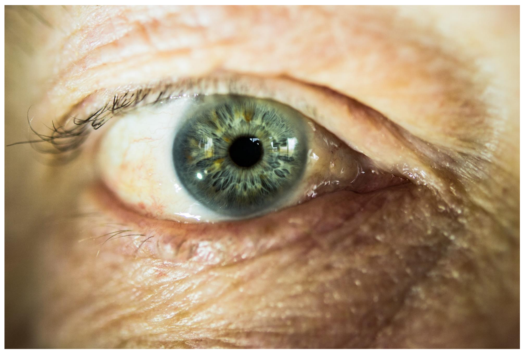
Figure 7: Curtis