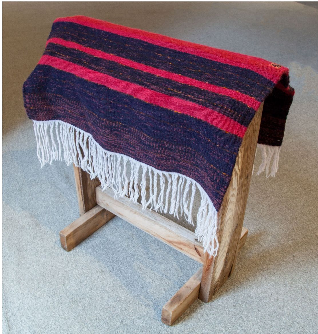
Figure 9: Two Rabbit Saddle Blanket