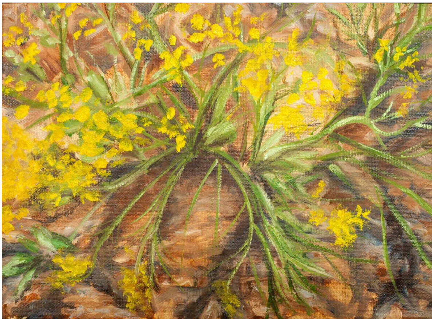
Figure 3: Red Road Along the Way