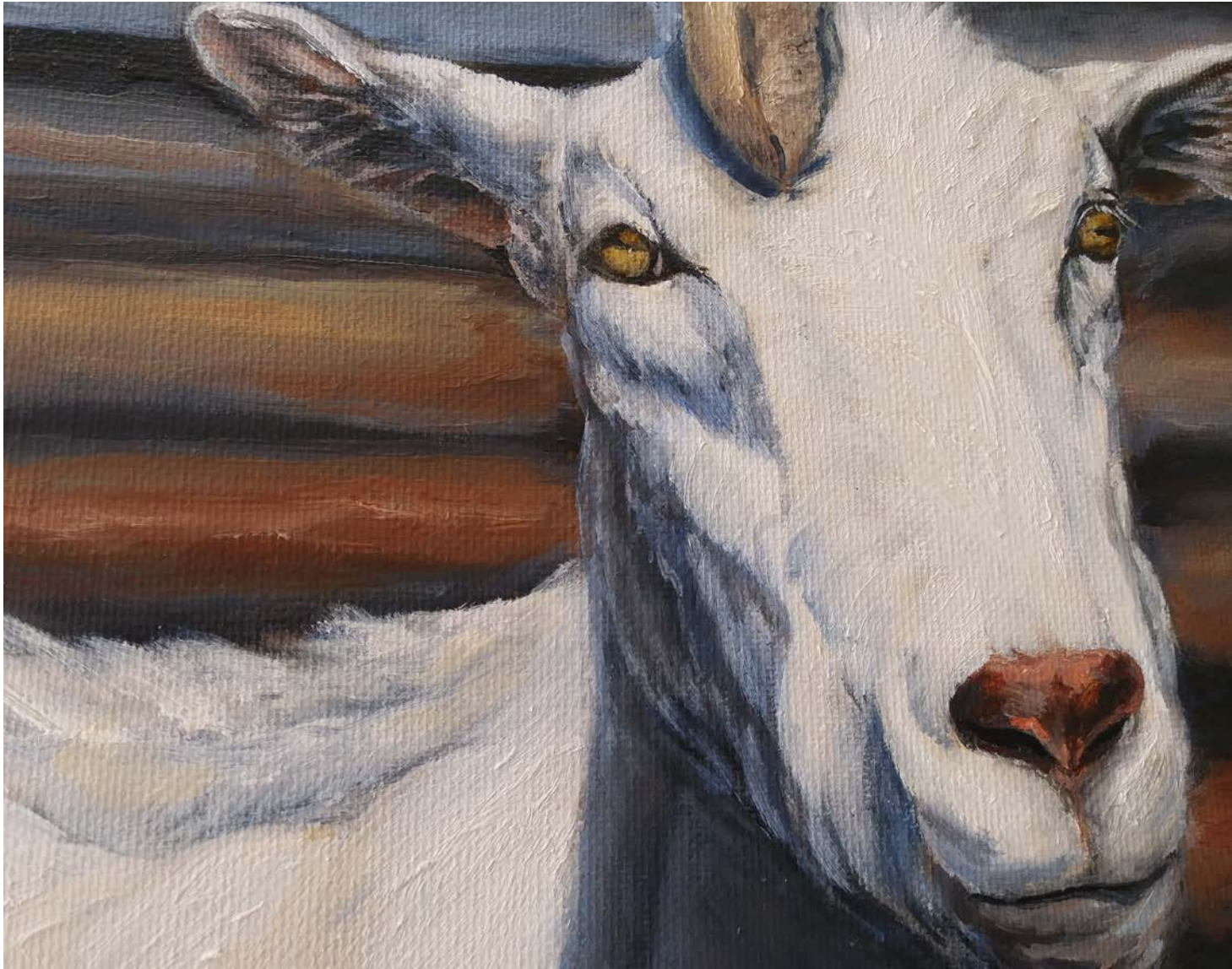
Figure 2: Unicorn detail