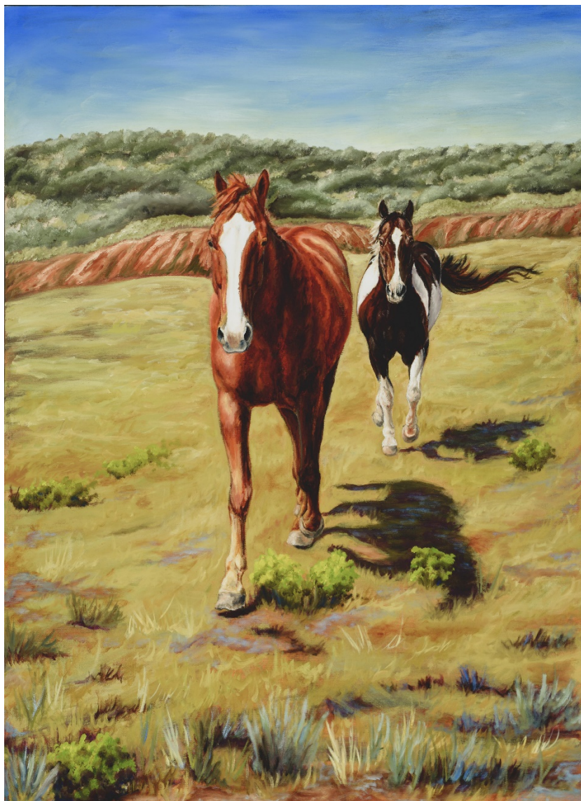
Figure 5: Red Road Hoof Beats