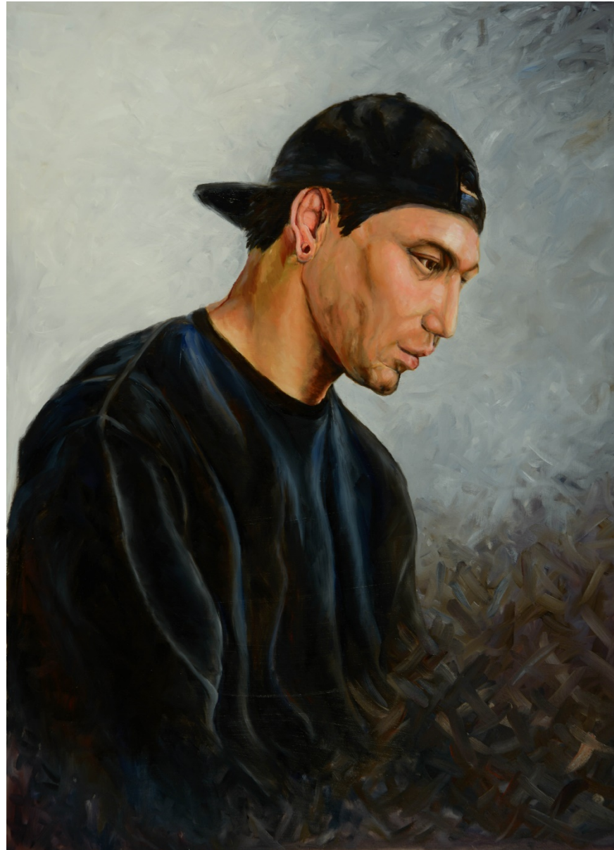
Figure 7: The Blessing of Wezhengke