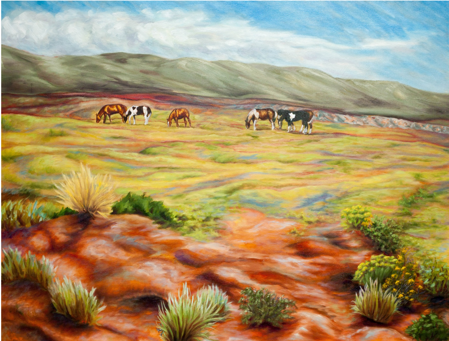
Figure 4: Red Road the Path