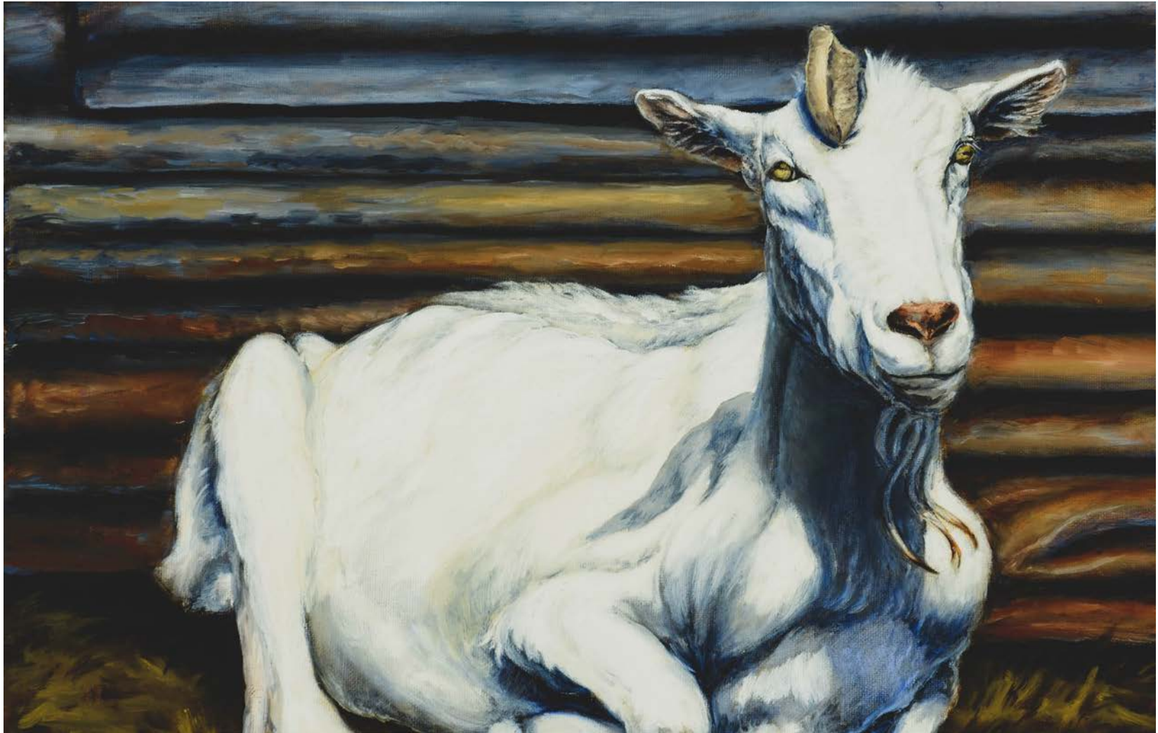
Figure 1: Unicorn