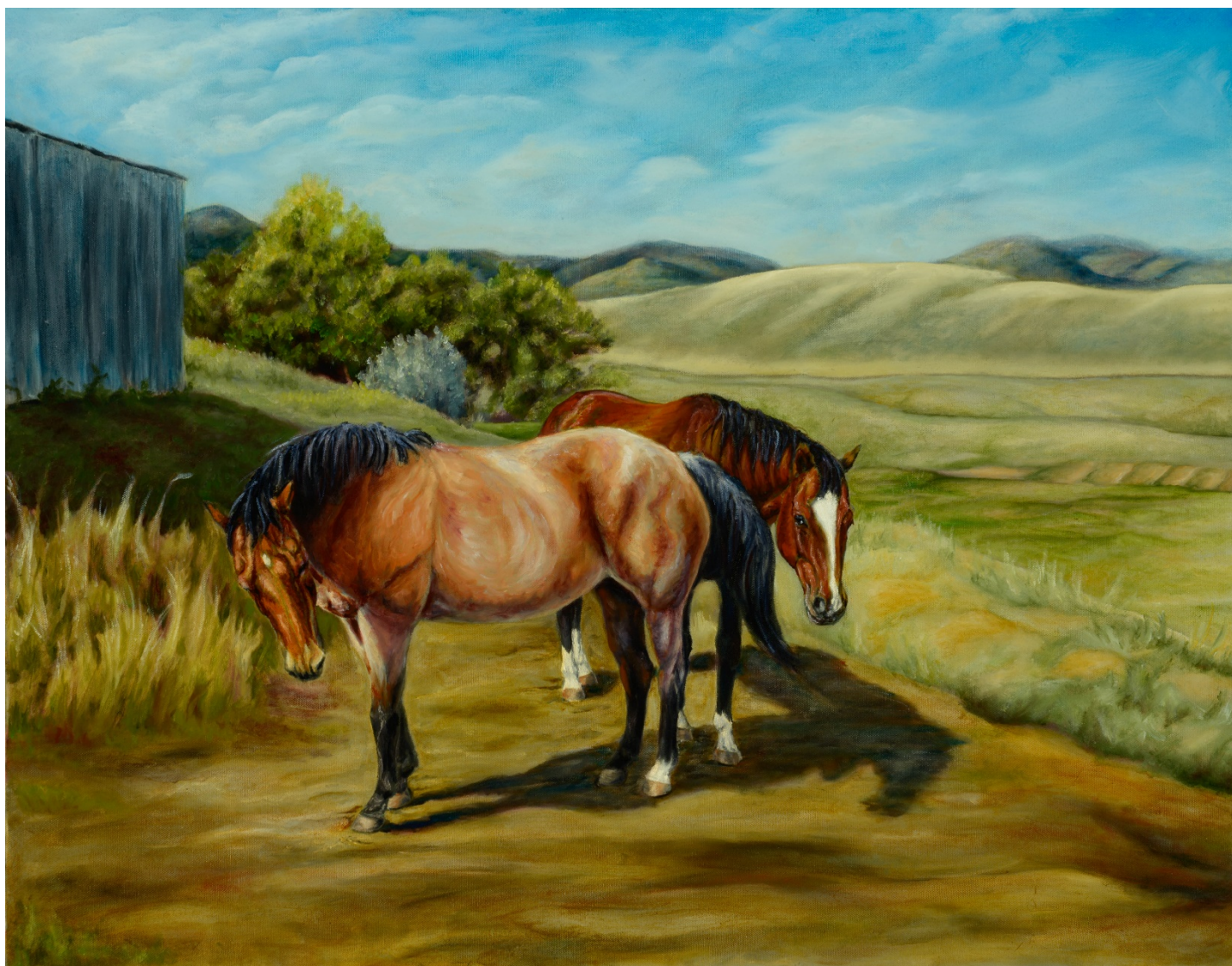
Figure 6: Red Road Westbound