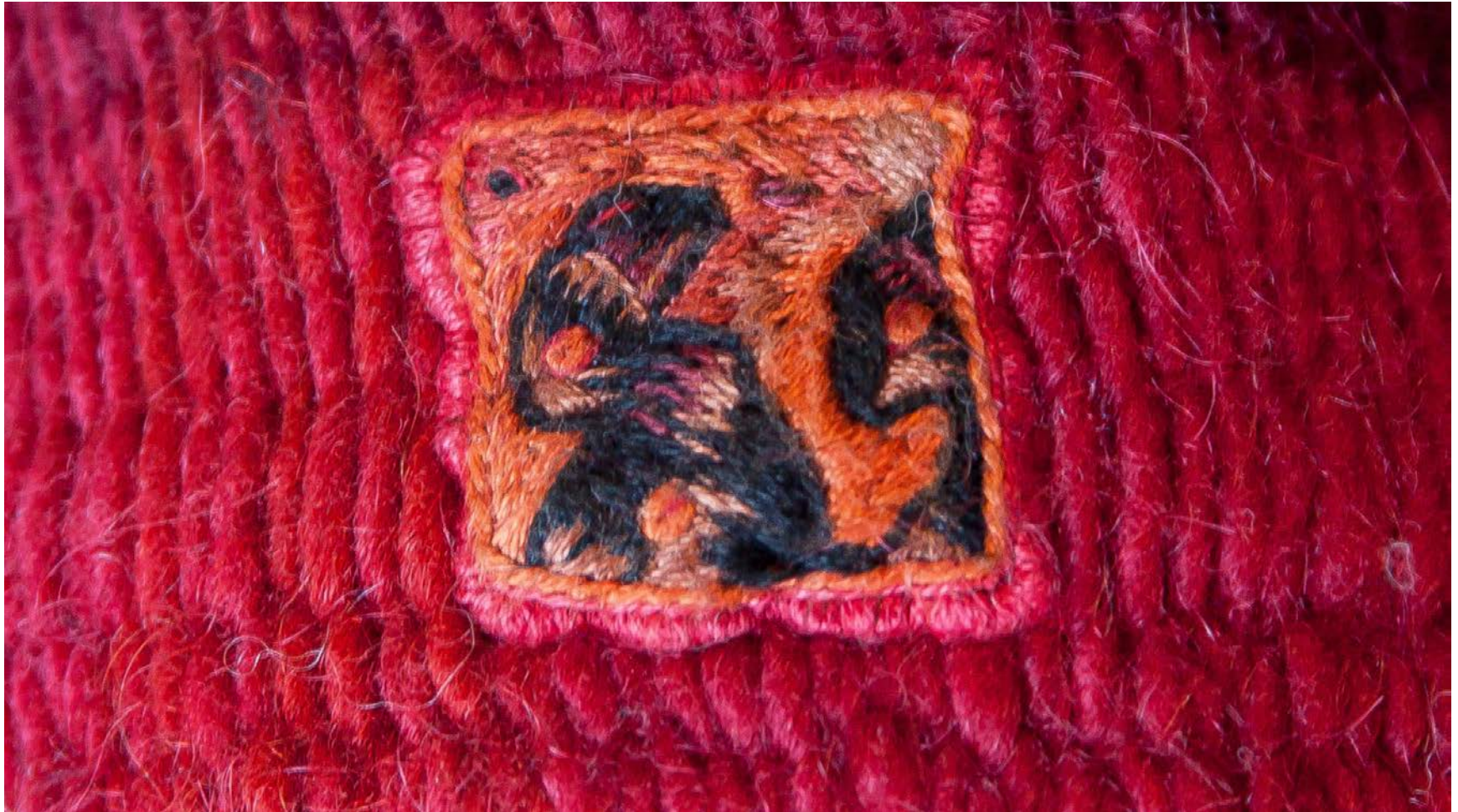
Figure10: Two Rabbit patch detail