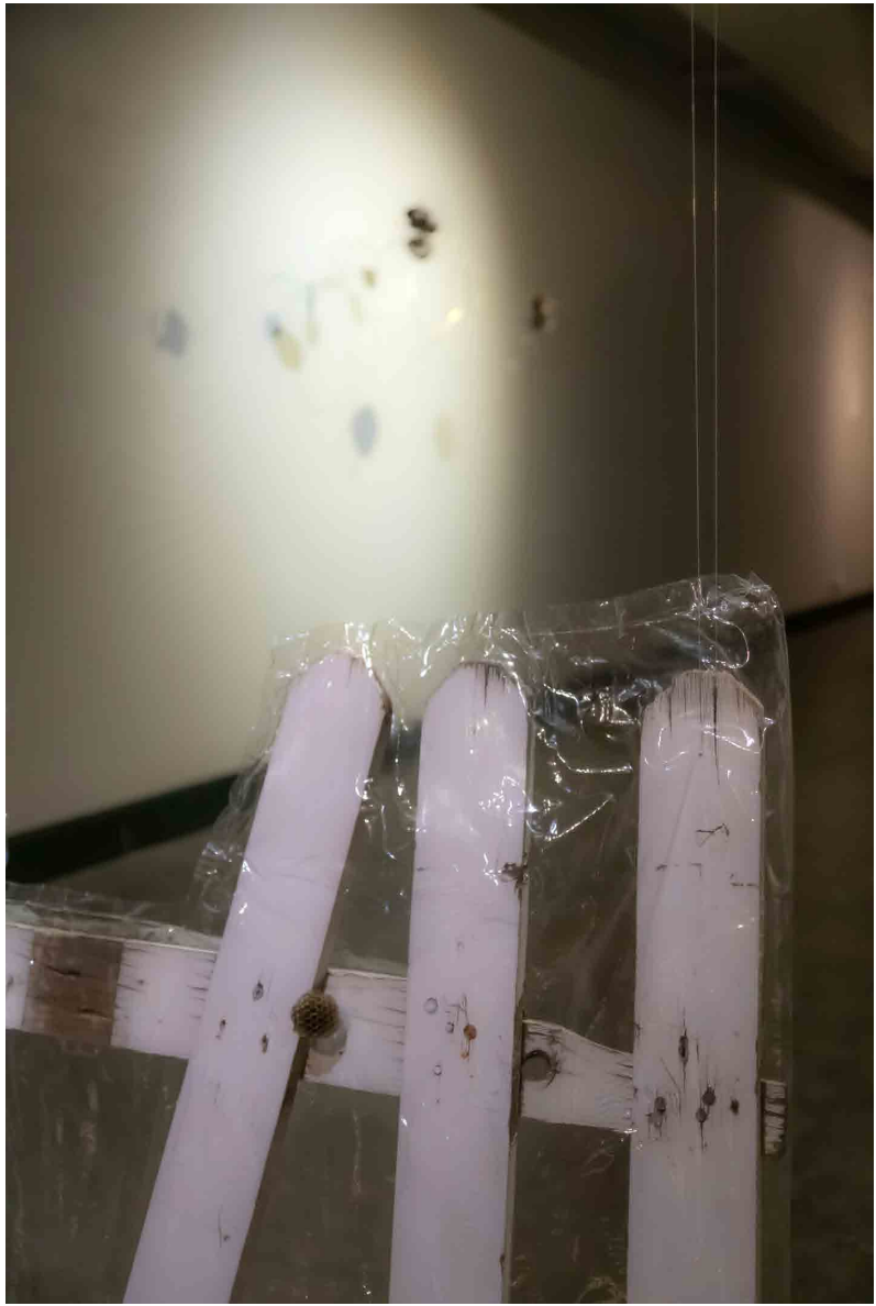
Figure 7: Leaned, detail