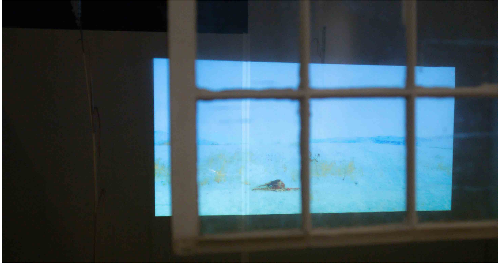
Figure 9: Outside Within, detail