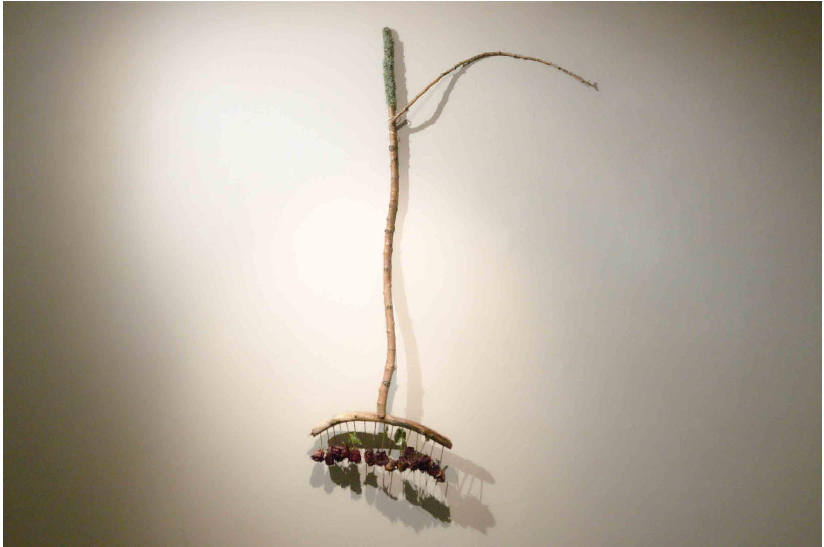
Figure 10: Rake