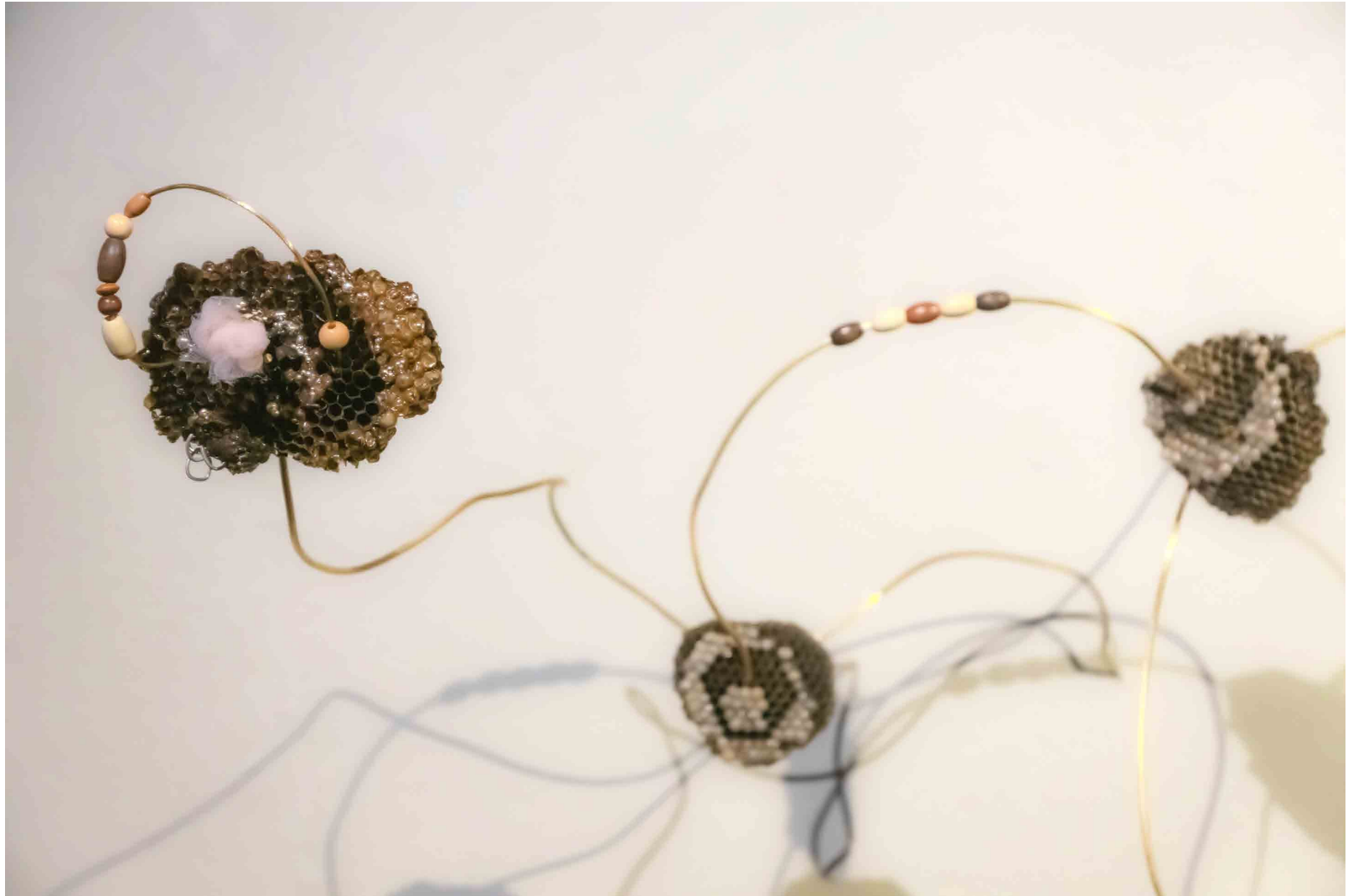
Figure 3: Brain Games, detail