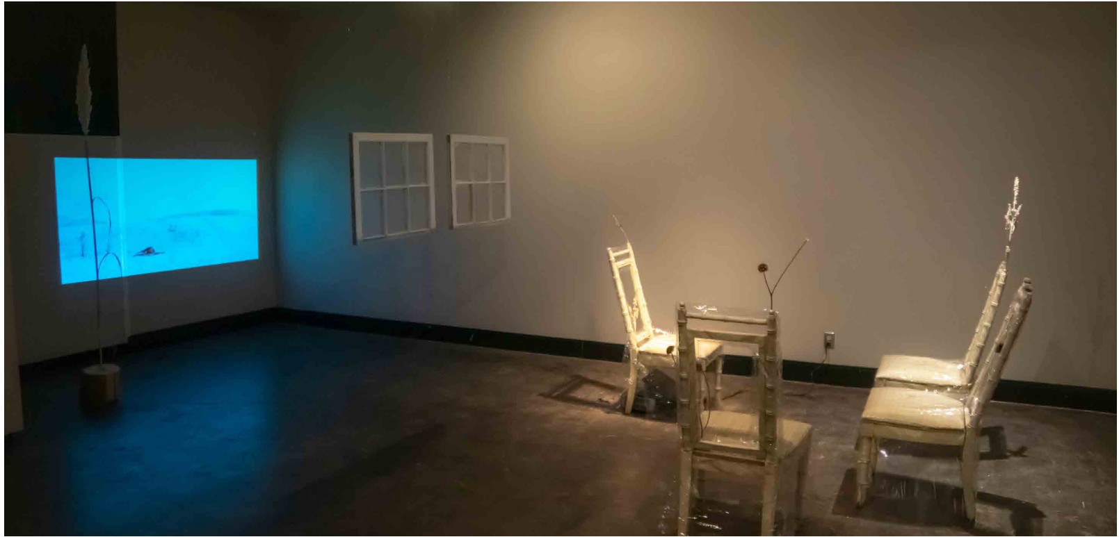
Figure 8: Outside Within