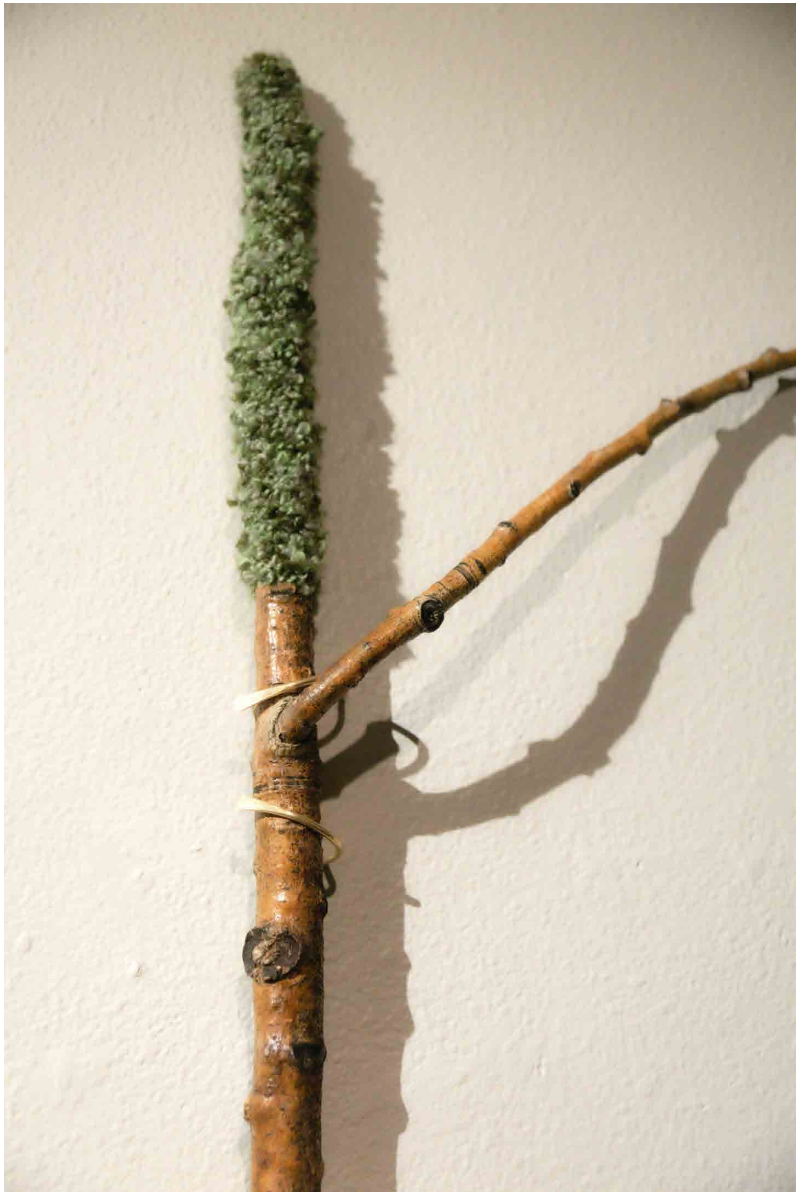
Figure 12: Rake, detail