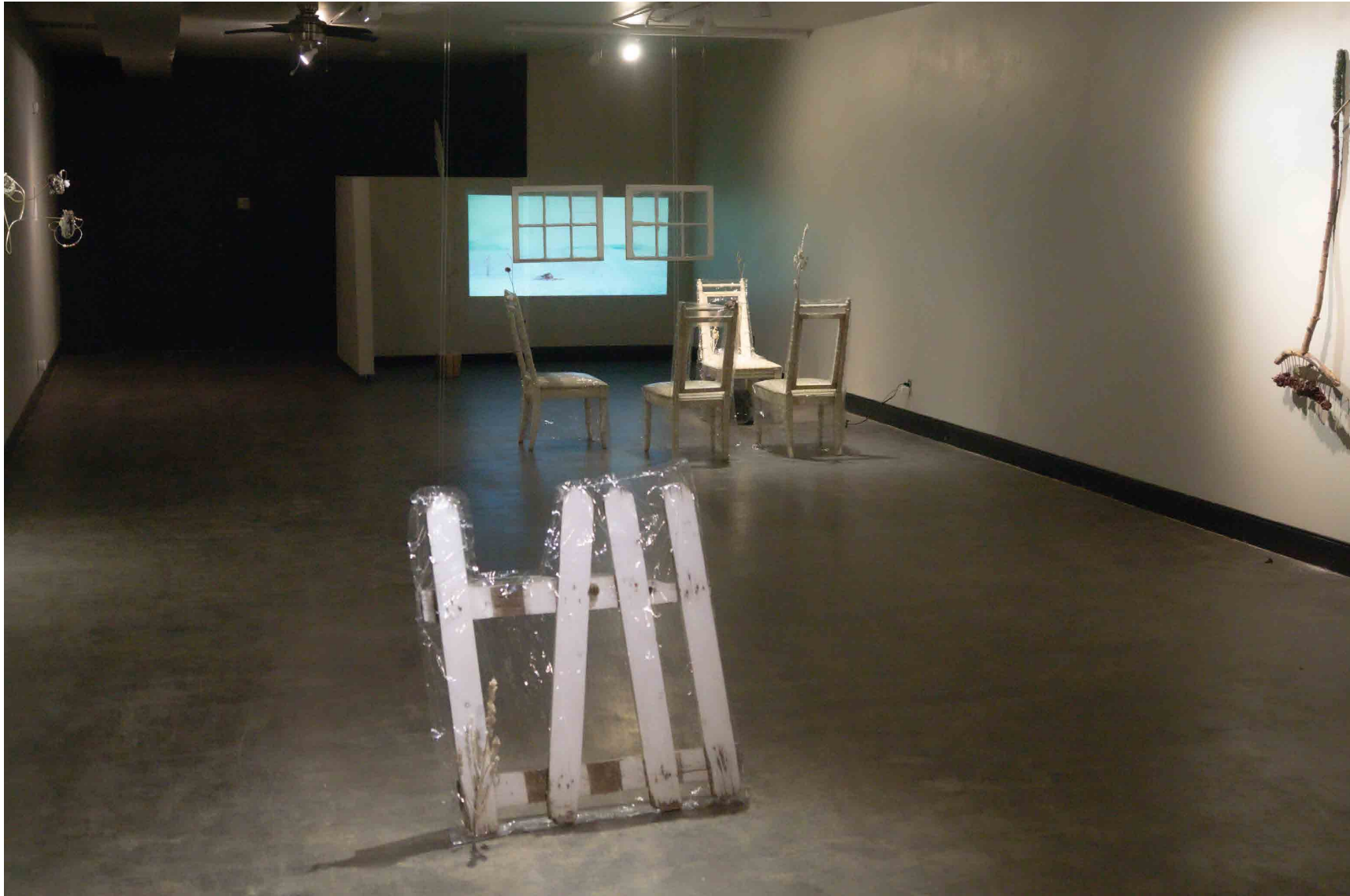
Figure 1: Re-flourished Installation