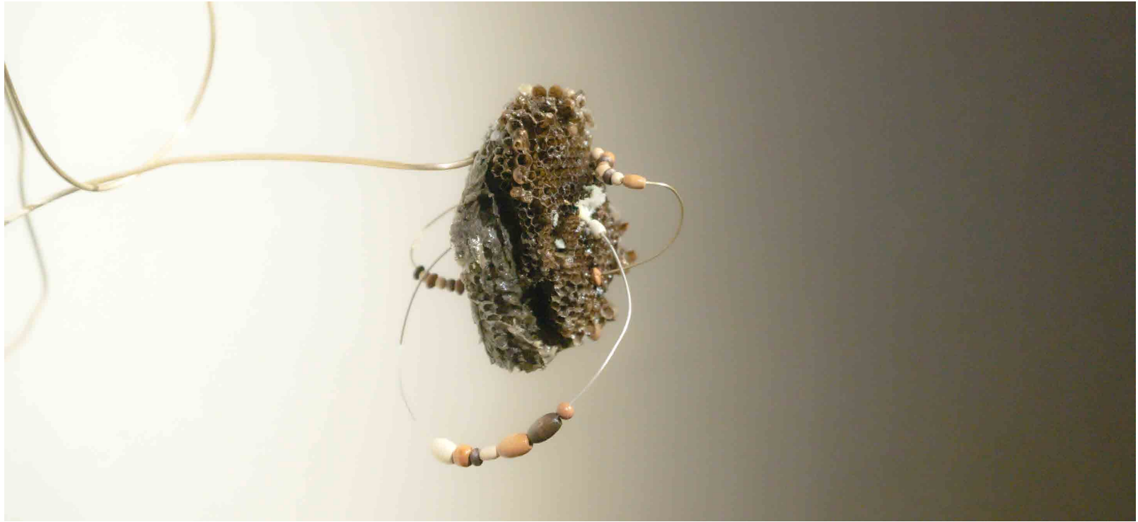
Figure 4: Brain Games, detail