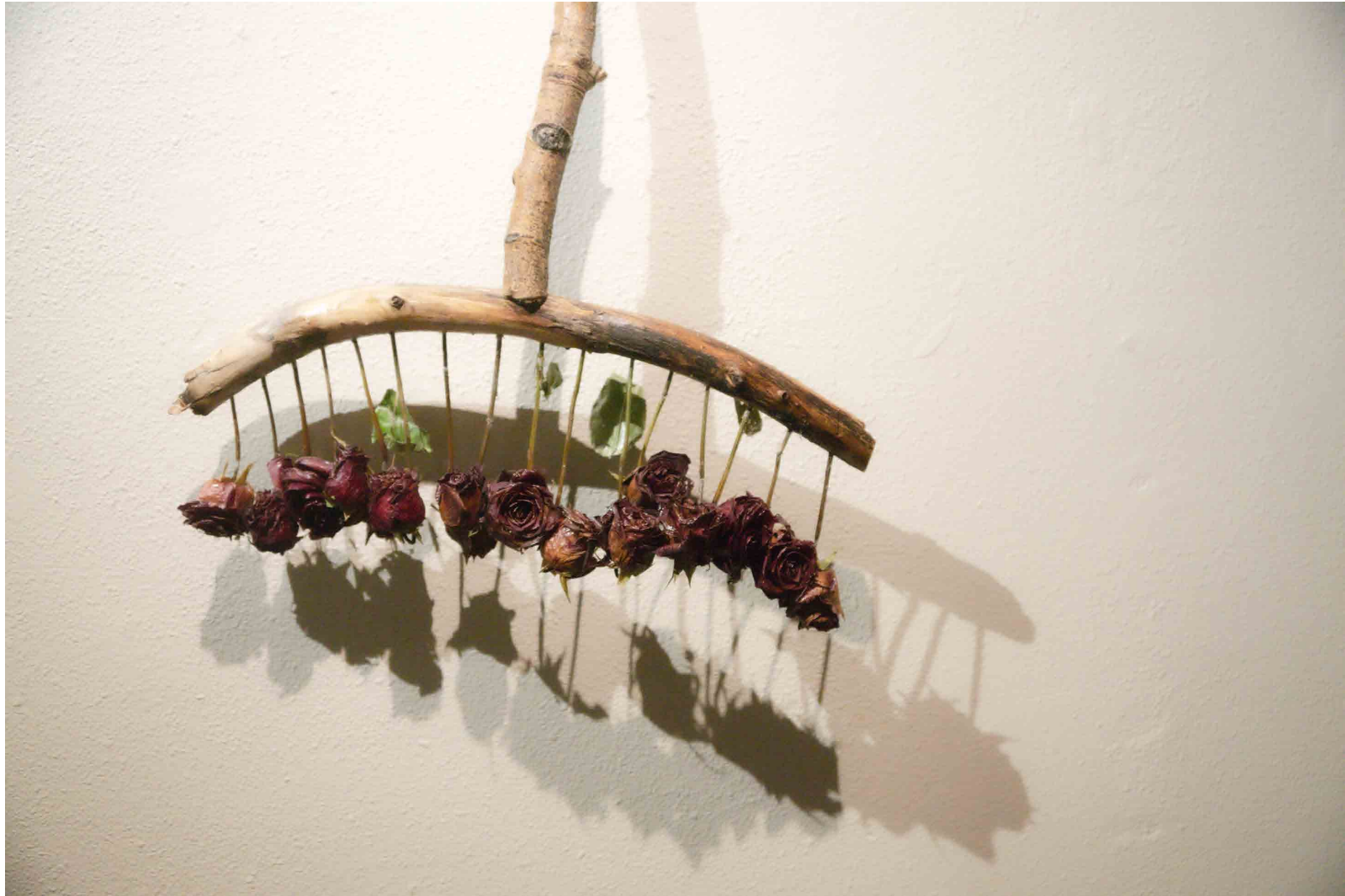
Figure 11: Rake, detail