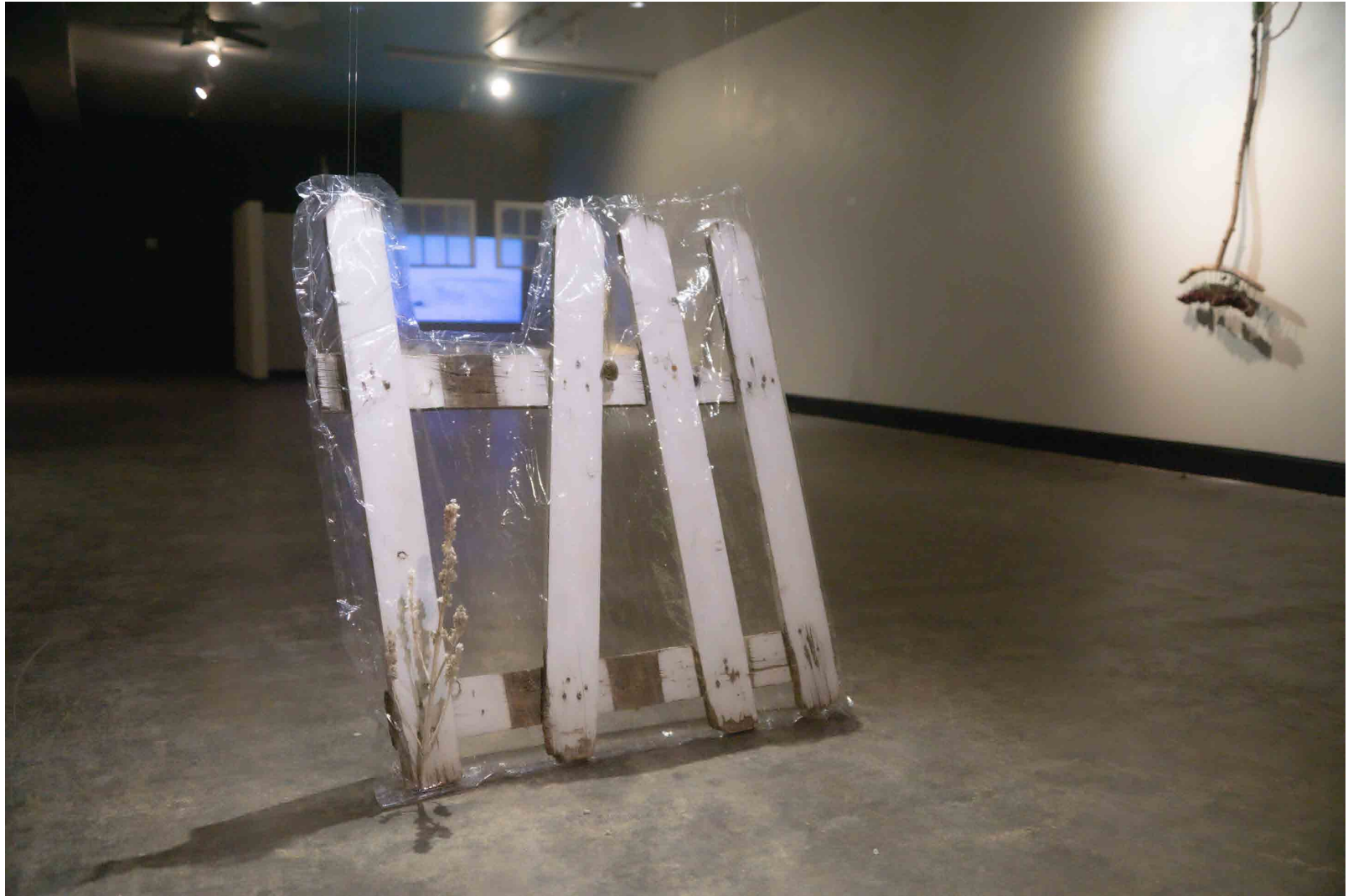
Figure 5: Leaned