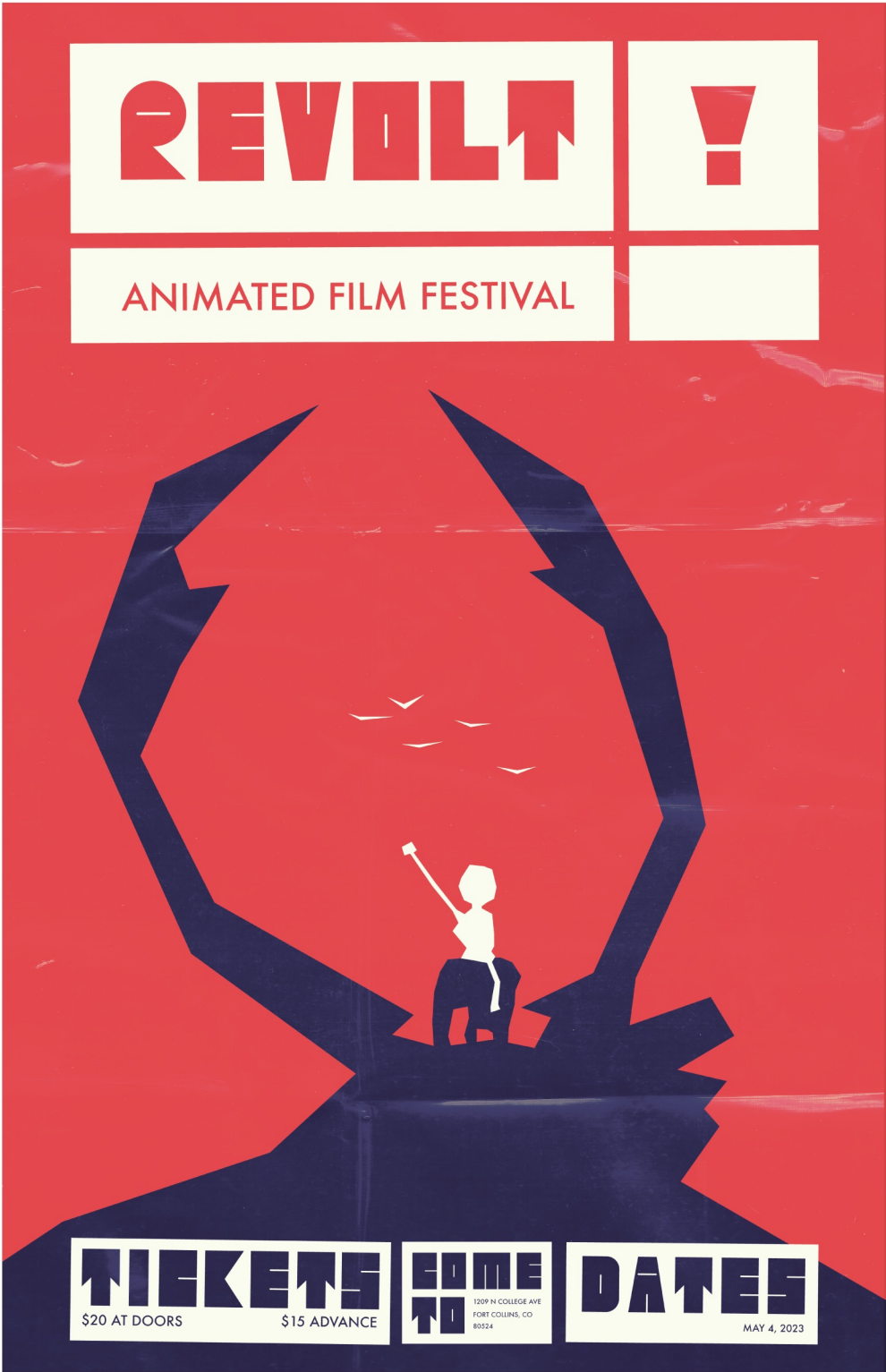
Figure 1: Revolt 1