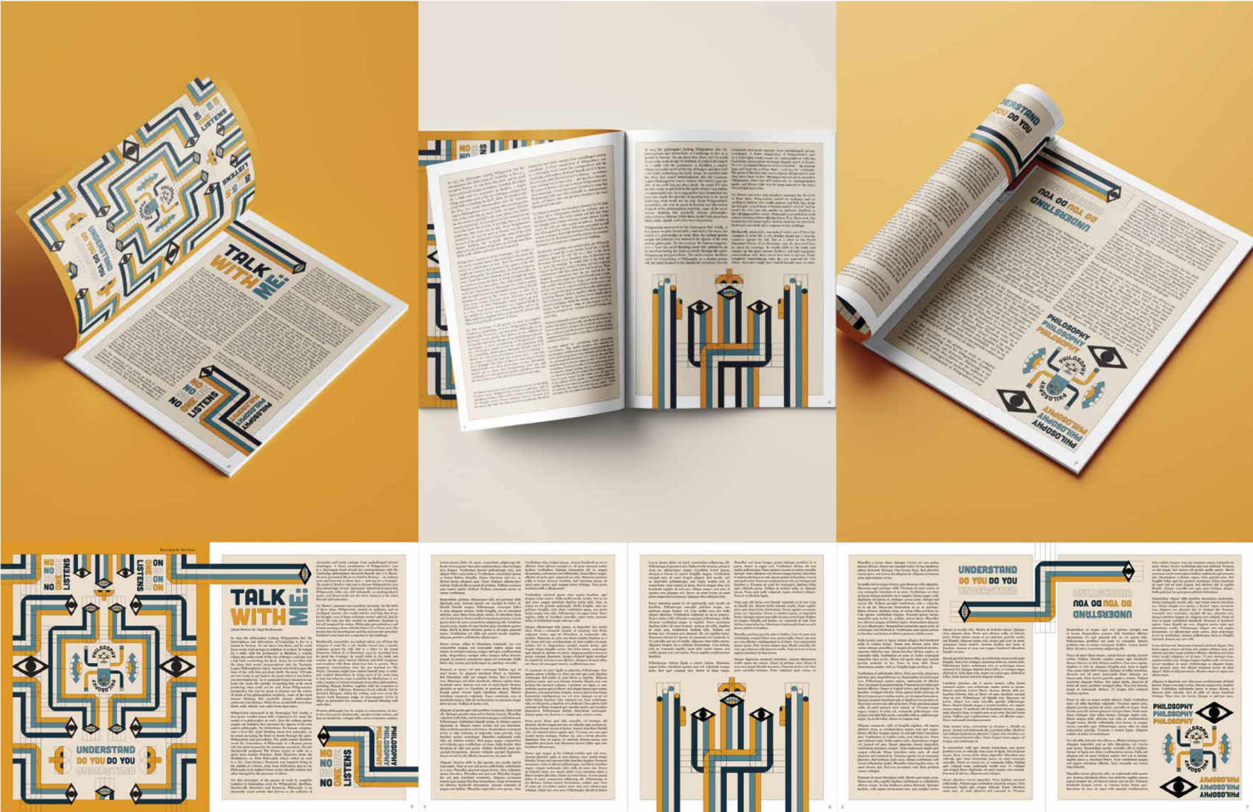
Figure 4: Aeon Mockup