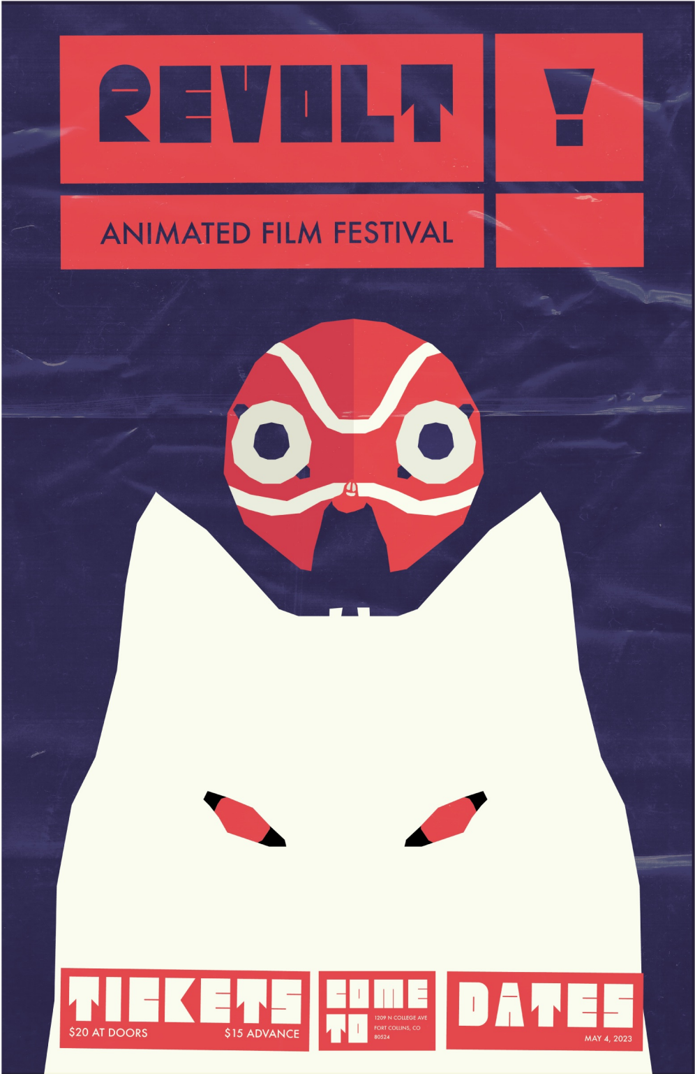
Figure 1: Revolt 2