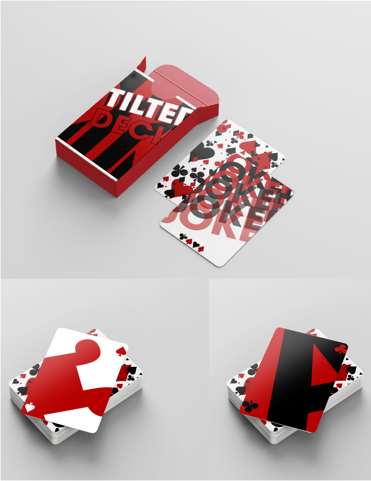
Figure 3: Tilted Deck