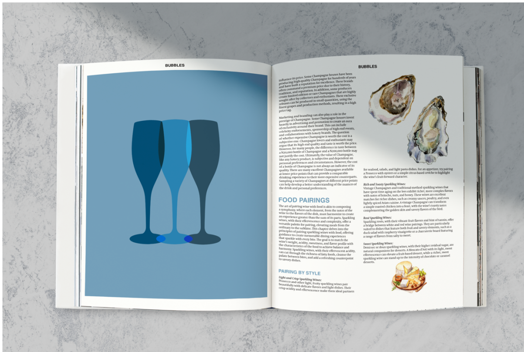
Figure 2: Happy Hour