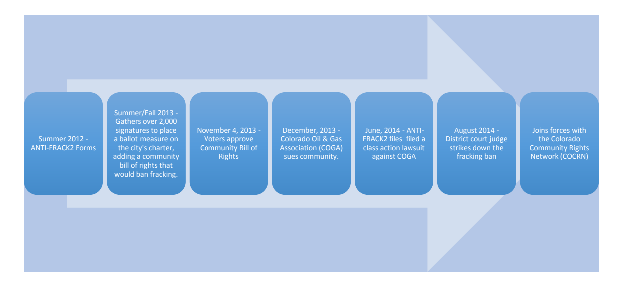
Figure 3.3 - Formation of Anti-Frack 2 1