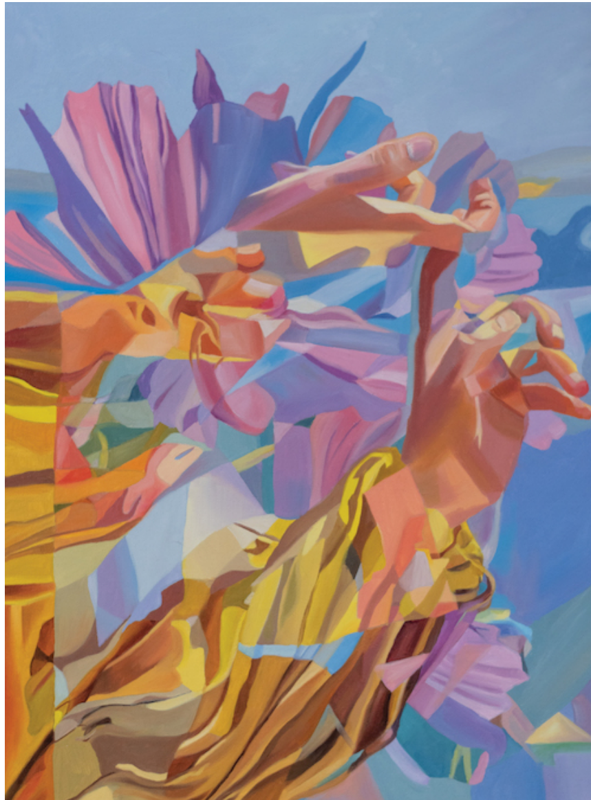
Figure 3: Tranquility