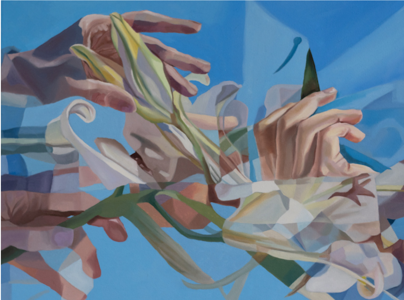
Figure 2: Desire