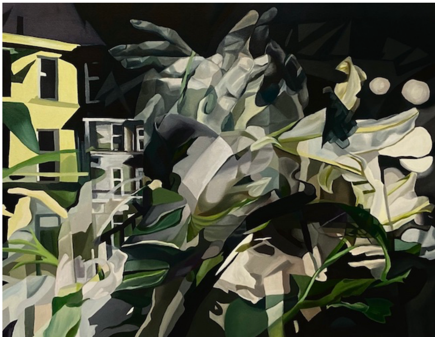
Figure 1: Daze