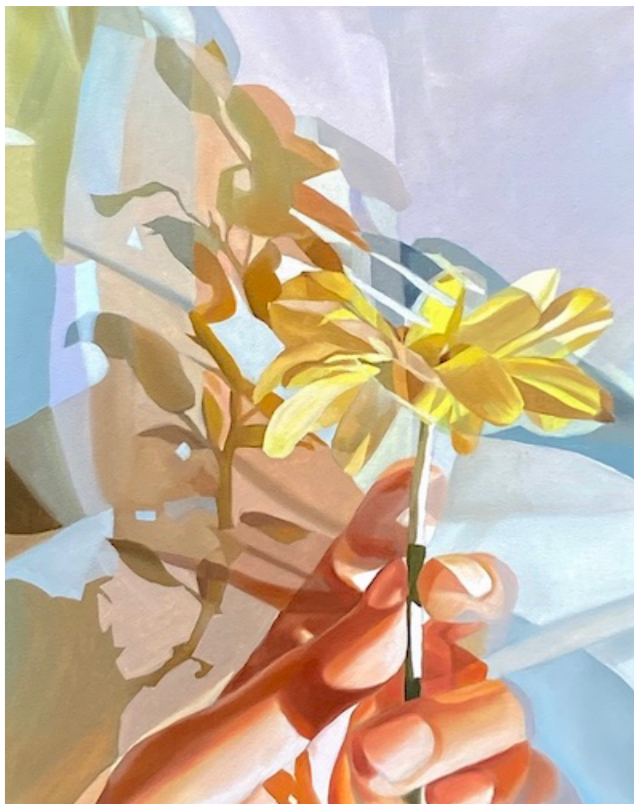
Figure 4: Lilly