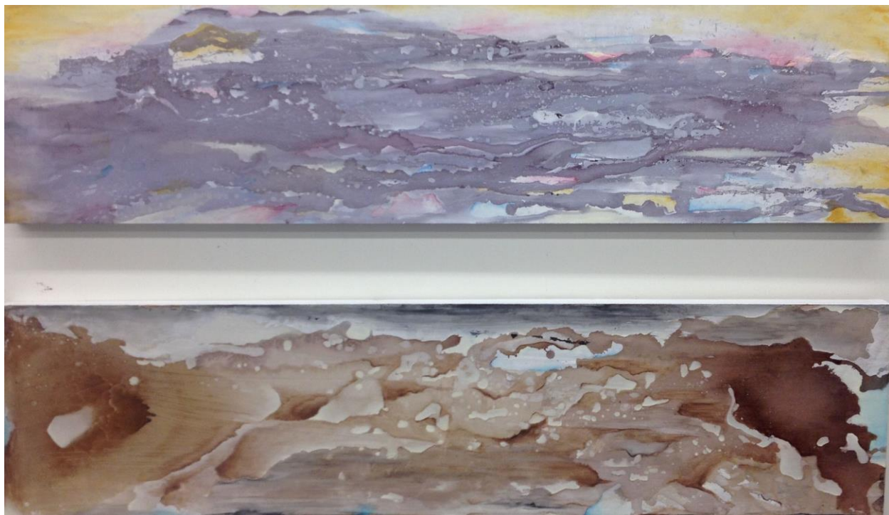
Figure 9: Coloration of Alcohol