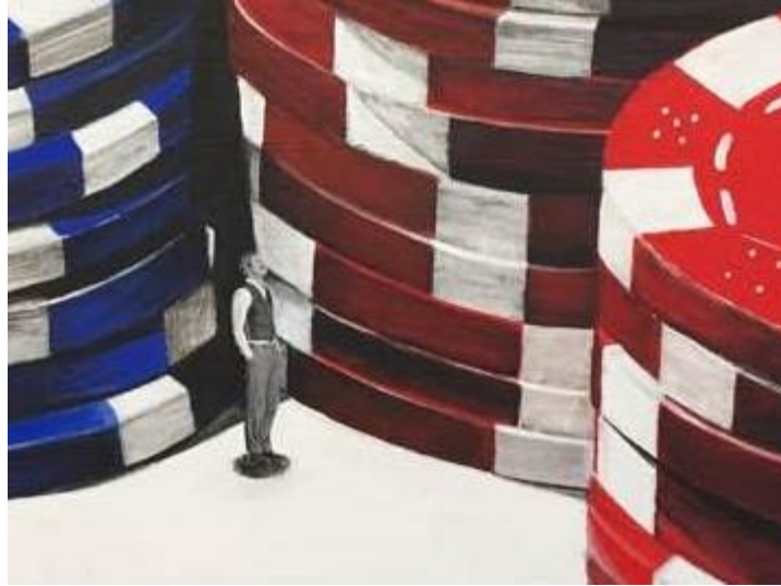
Figure 5: Detail of Overwhelmed