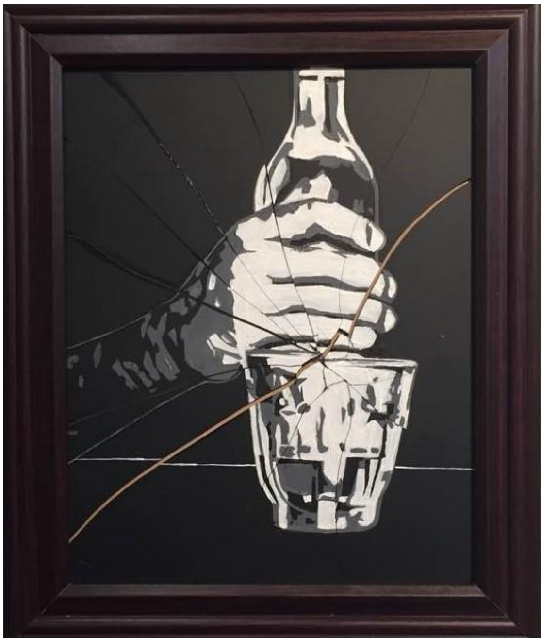
Figure 3: Alcohol