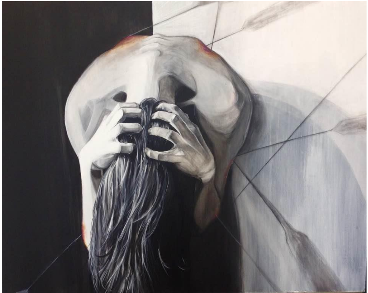
Figure 1: Injection