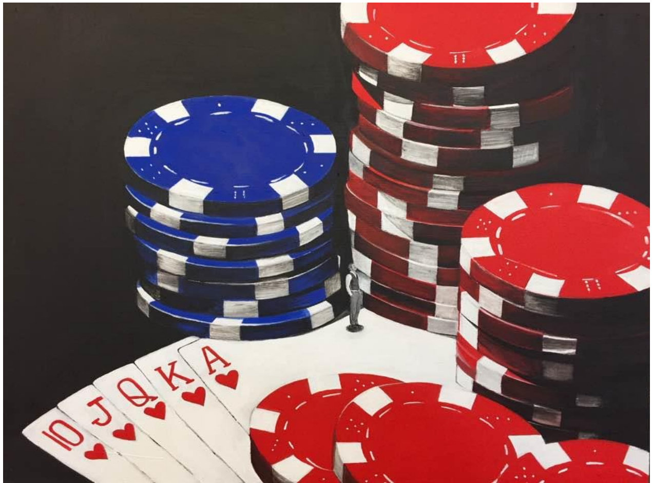
Figure 4: Overwhelmed