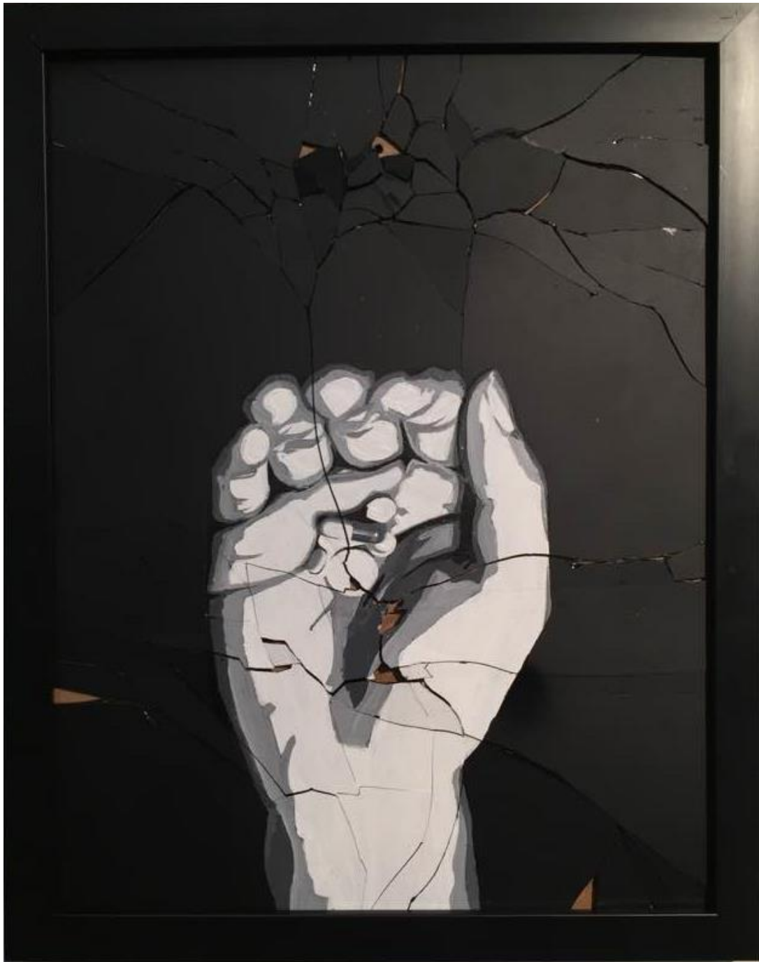
Figure 10: Prescription Pills