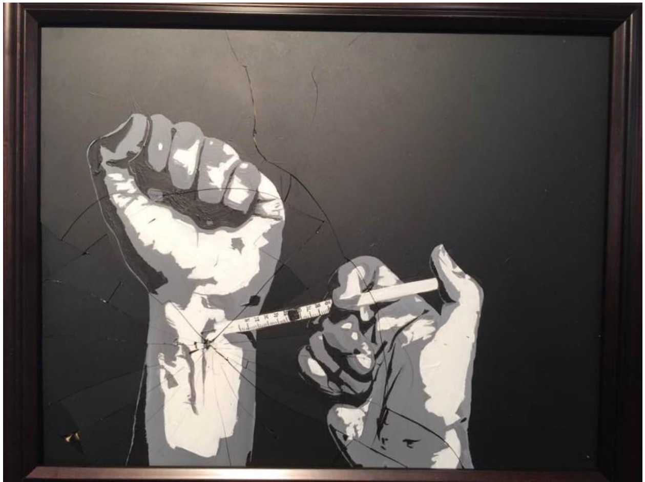
Figure 8: Heroin