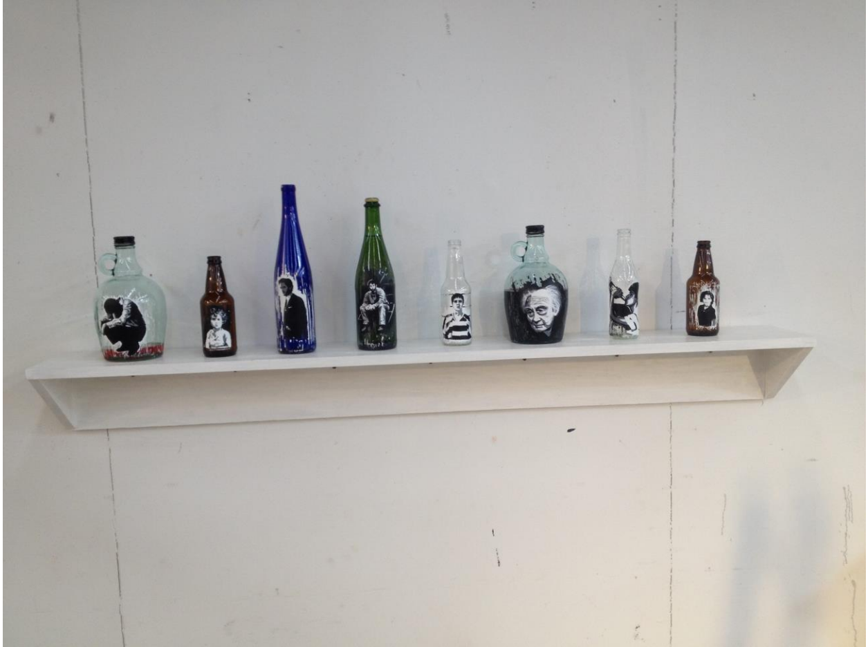
Figure 6: The Different Faces of Alcohol