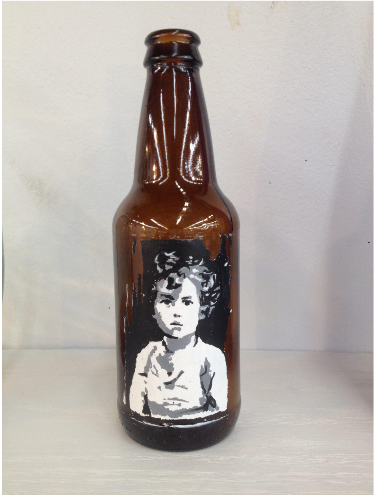
Figure 7: Different Faces of Alcohol (Detail of Bottle)