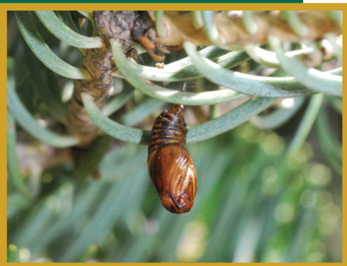
Figure 4. A western spruce budworm pupa.