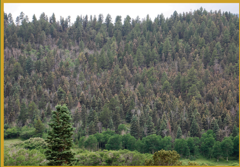
Figure 10. Western spruce budworm defoliation in the Taylor River drainage, Gunnison County.