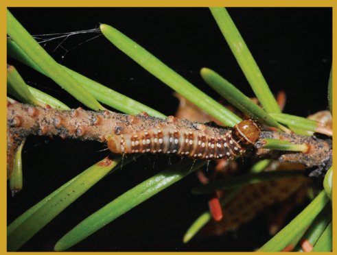
Figure 3. A caterpillar, or larva.