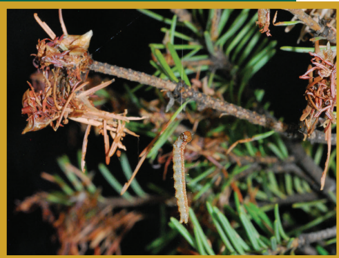
Figure 6. A larva ballooning on a strand of silk with associated severe defoliation.

Adult moths are about ½-inch (13 mm) long, with a wingspan of approximately 1 inch (22-28 mm). Both sexes are similar in appearance, although females may be slightly larger. The wings are variable in color, ranging from gray to orange-brown; they also may be banded or streaked, and some individuals may have a conspicuous white dot on the wing margin.