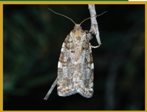
Figure 5. An adult moth.