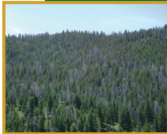
Figure 1. Tree mortality from western spruce budworm in Grand County.

Mature larvae tie the tips of twigs or foliage together with silk and pupate on the branch tips or elsewhere on the tree. Pupae are about ½-inch (13 mm) long and yellow-brown in color when first formed, later turning to red-brown. Pupation lasts about 10-15 days, followed by emergence of the adult moths.