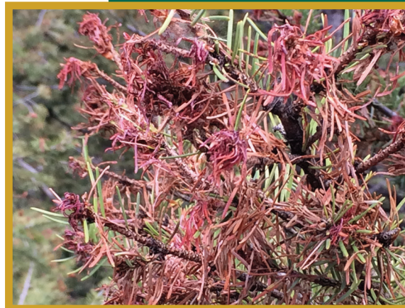
Figure 2. Discoloration from larvae feeding on new foliage.

This Quick Guide was produced by the Colorado State Forest Service to promote knowledge transfer.