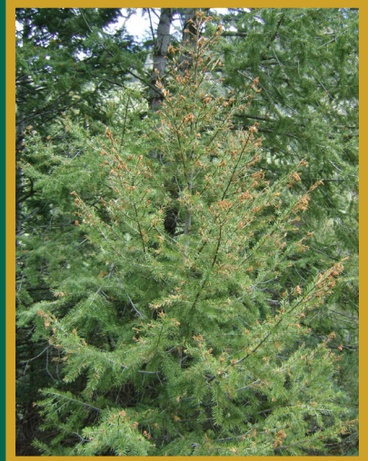
Figure 7. Light defoliation.

Colorado’s forests provide clean air and water, wildlife habitat, world-class recreational opportunities, wood products and unparalleled scenery. These benefits contribute to quality of life and are vital to state and local economies. Without careful management of forest resources, these assets and community safety are at risk. It is critical to proactively manage forests and for landowners and communities to remain informed about threats to their forests, to ensure healthy, resilient forests for present and future generations.