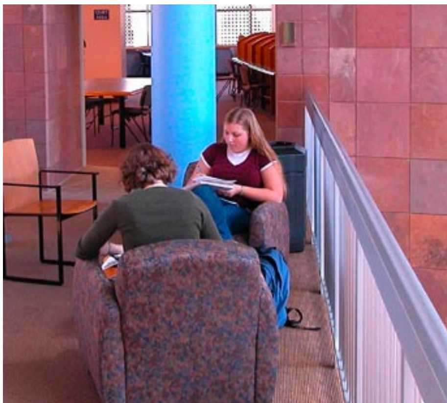
More than 40,000 students entered Morgan Library during this semester's first week of classes. Here, two of those students find a quiet place to study on the third floor.