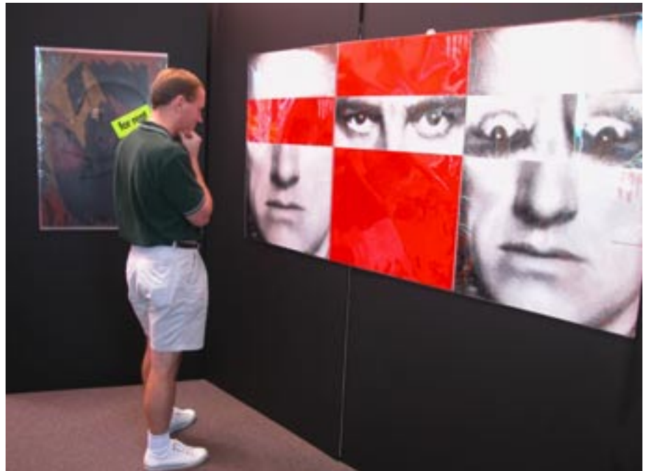
Posters on view in Morgan Library's First National Bank Gallery are the work of Russian artist Vladimir Chaika.

In addition, more than 200 recently digitized works are on display in the Libraries' online poster gallery. Receiving 400-450 hits per week, the International Poster Collection Web site offers online viewing of nearly 1,600 posters featured at CIIPE events since 1991. Physical copies of the posters