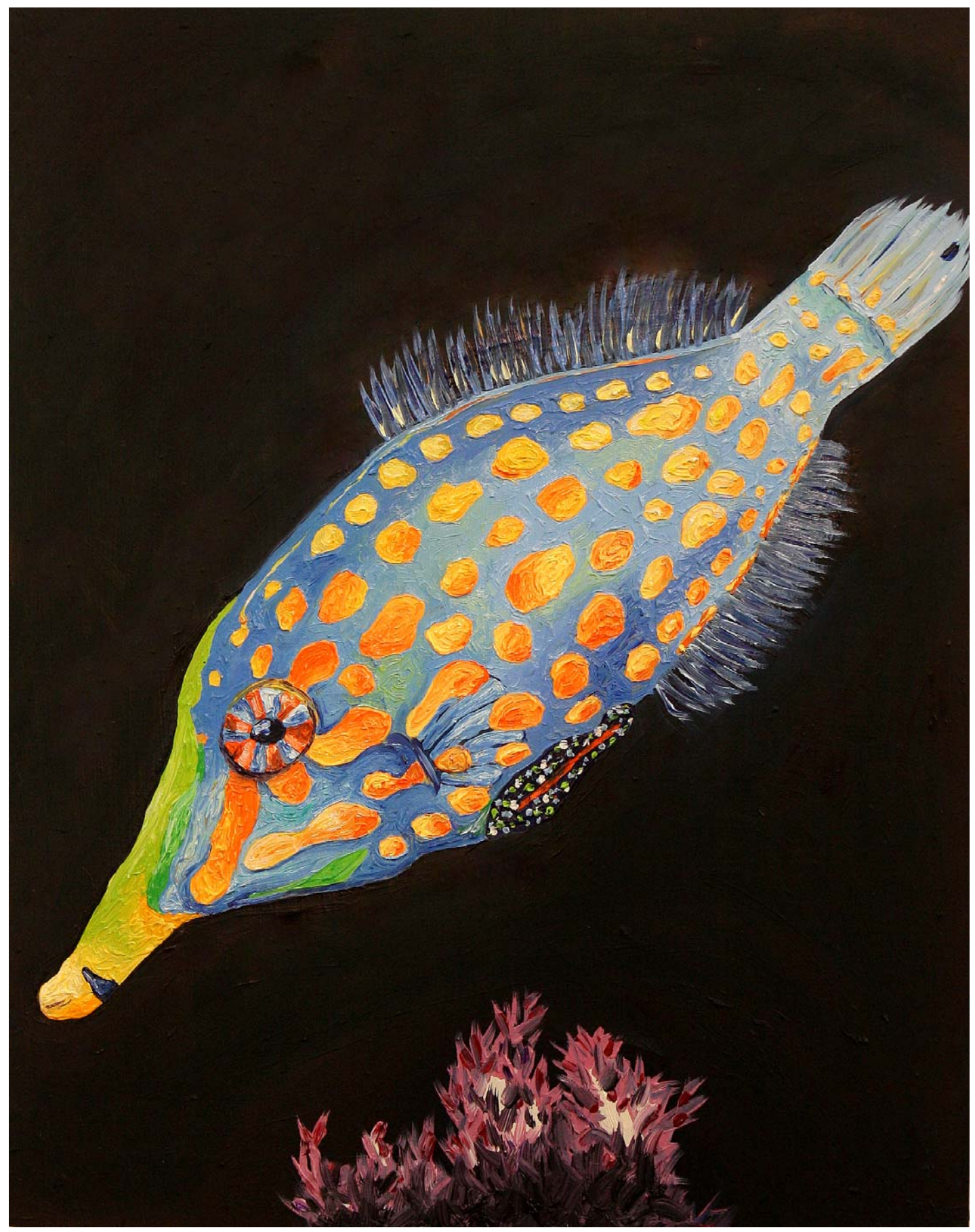
Figure 2: Orange Spotted Filefish, At Risk series.