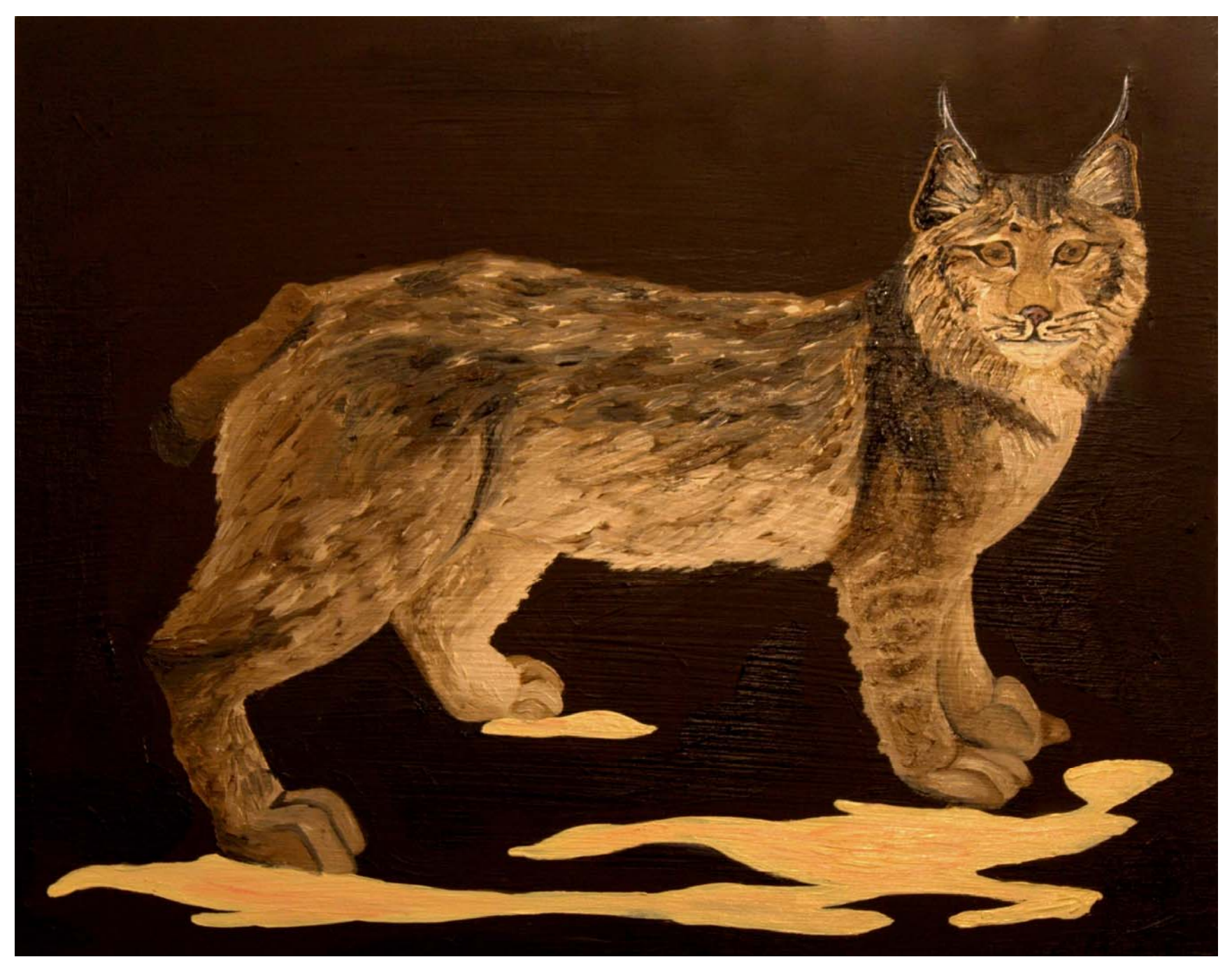
Figure 9: Canadian Lynx, At Risk series.