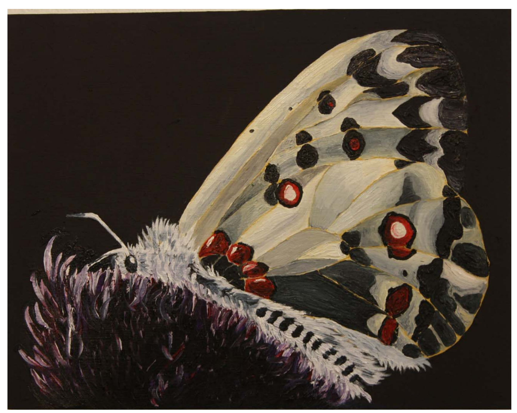
Figure 4: Apollo Butterfly, At Risk series.