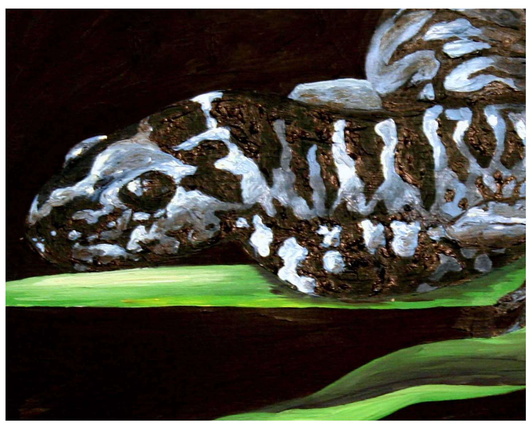
Figure 8: Reticulated Flatwoods Salamander, At Risk series, detail.