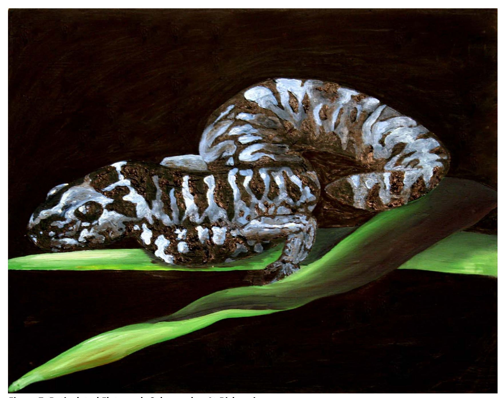
Figure 7: Reticulated Flatwoods Salamander, At Risk series.