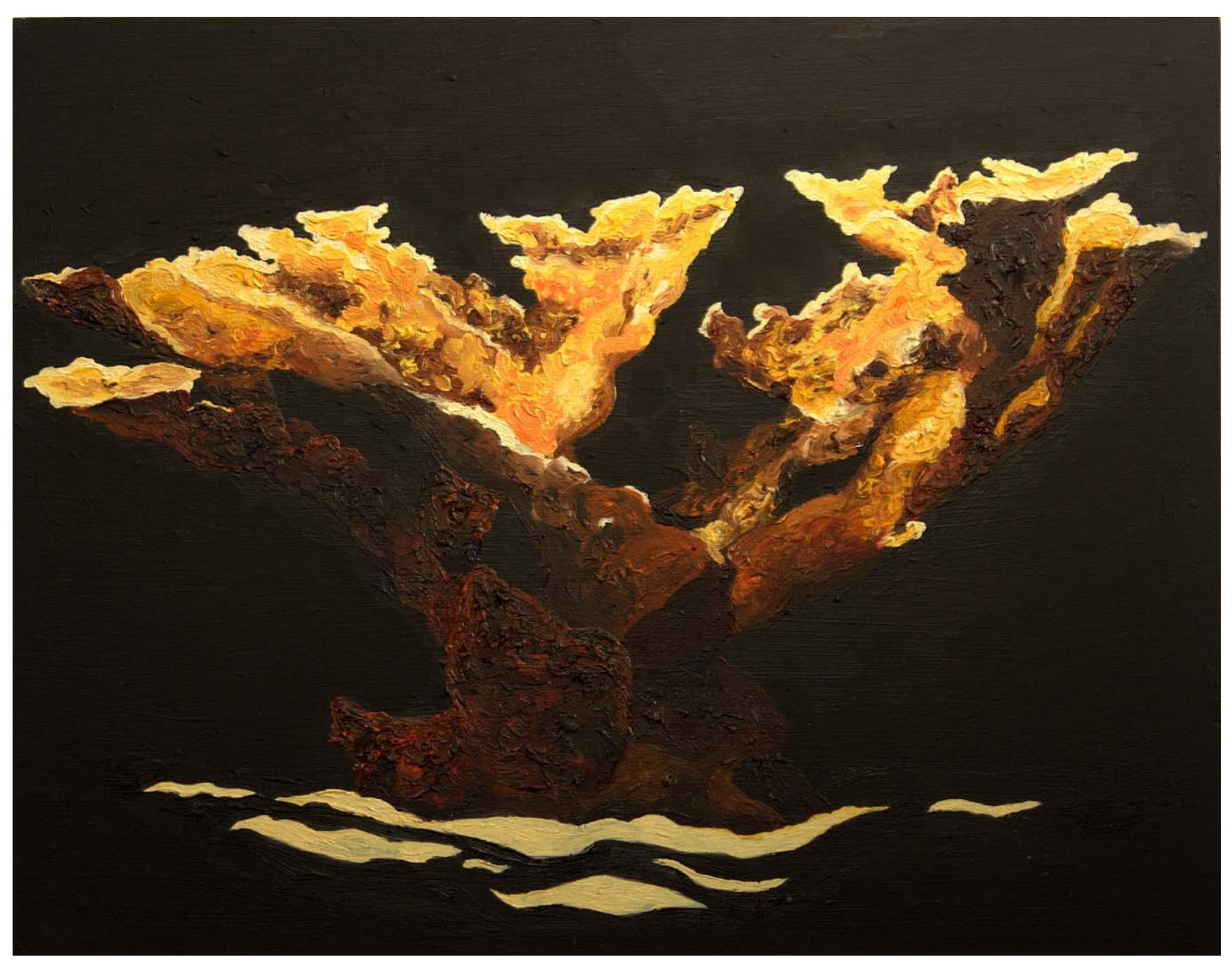
Figure 5: Elk Horn Coral, At Risk series.