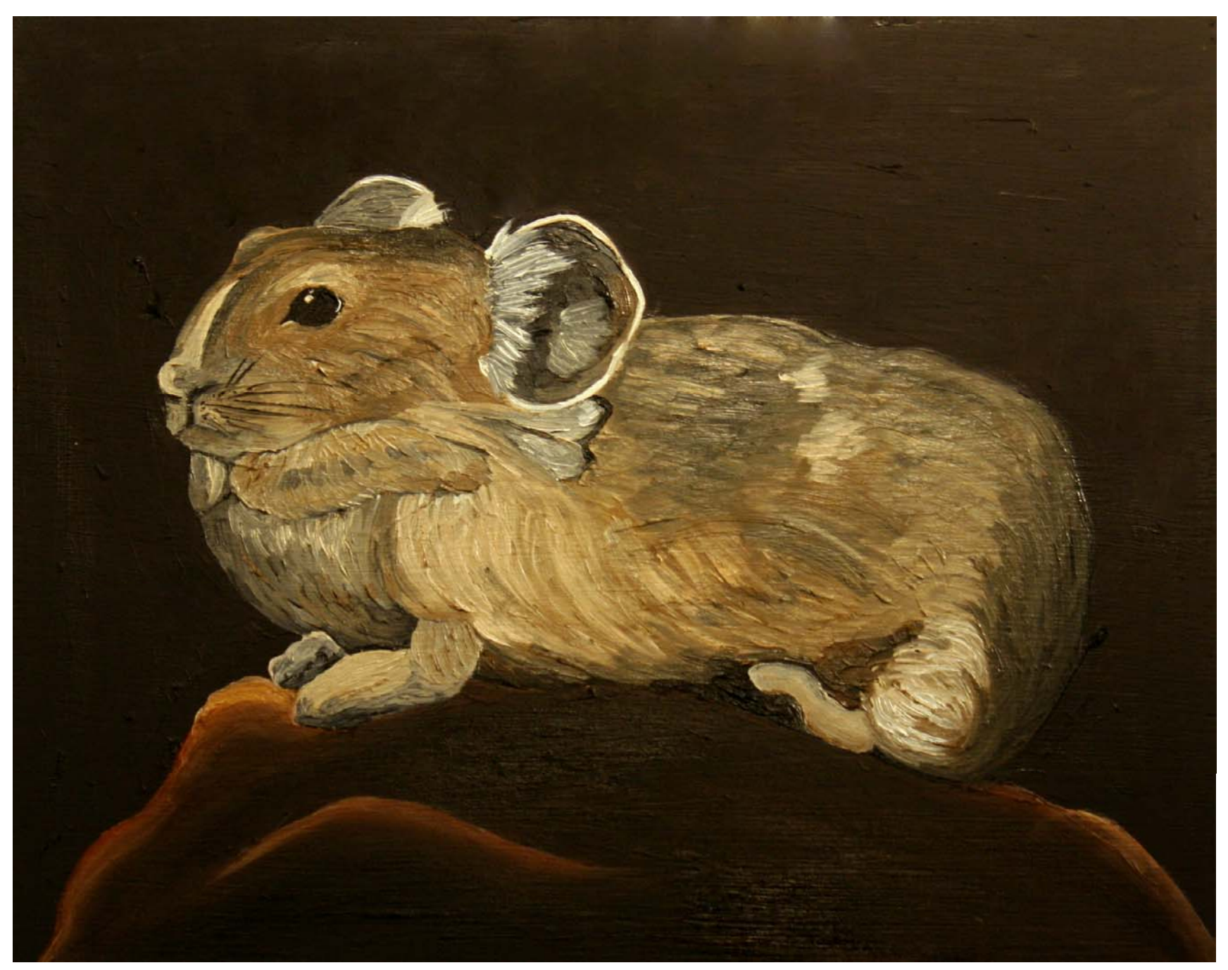
Figure 1: American Pika, At Risk series.