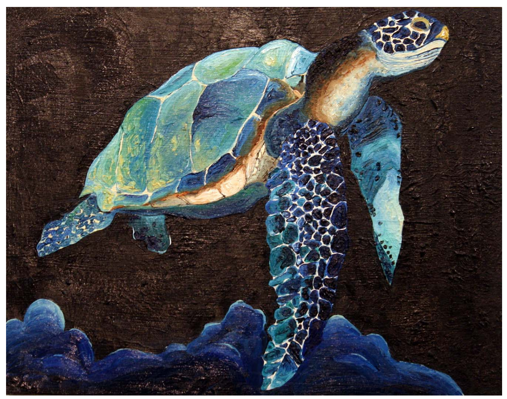
Figure 10: Green Sea Turtle, At Risk series.