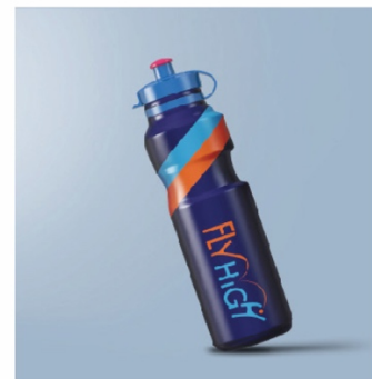
Figure 5: Fly High Trampoline Park Rebrand and Collateral