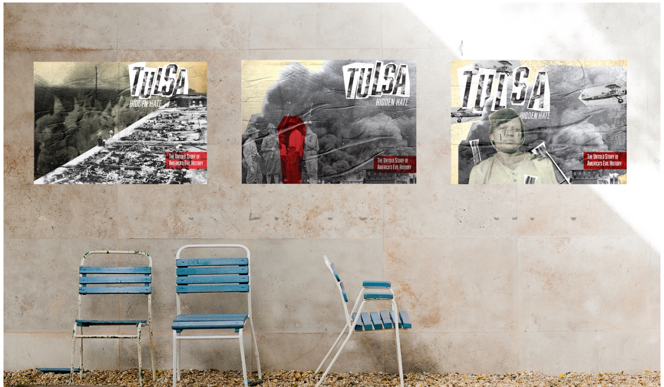
Figure 1: Tulsa: Hidden Hate Poster Series