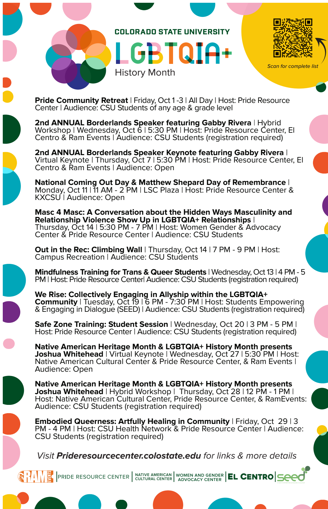
Figure 10: LGBTQIA+ History Month Event Schedule