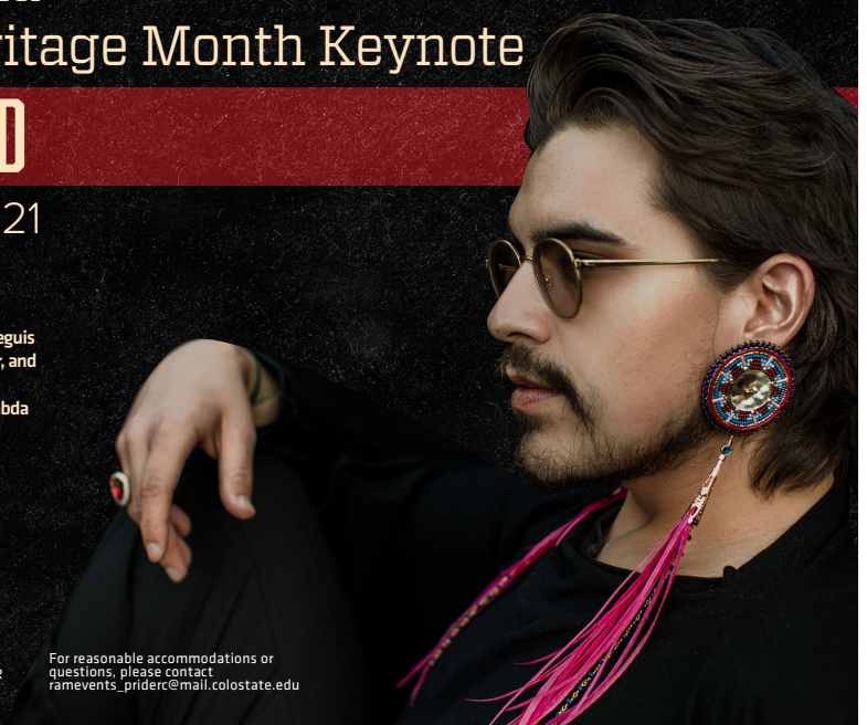
Figure 9: Keynote Speaker LCD Advertainment

For reasonable accommodations or questions, please contact ramevents_priderc@mail.colostate.edu