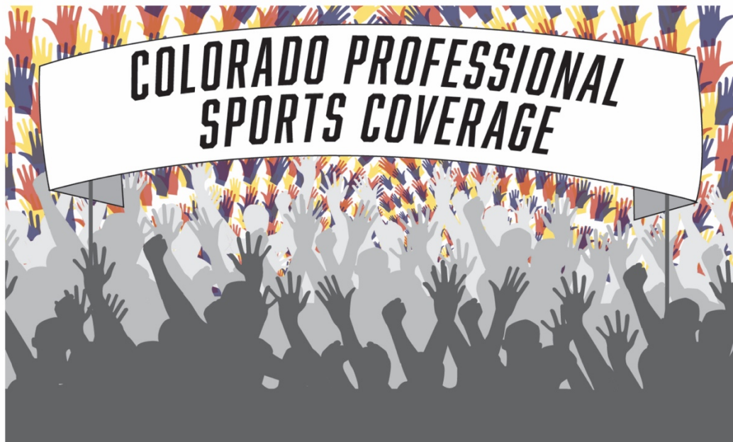
Figure 8: News Article Illustrations