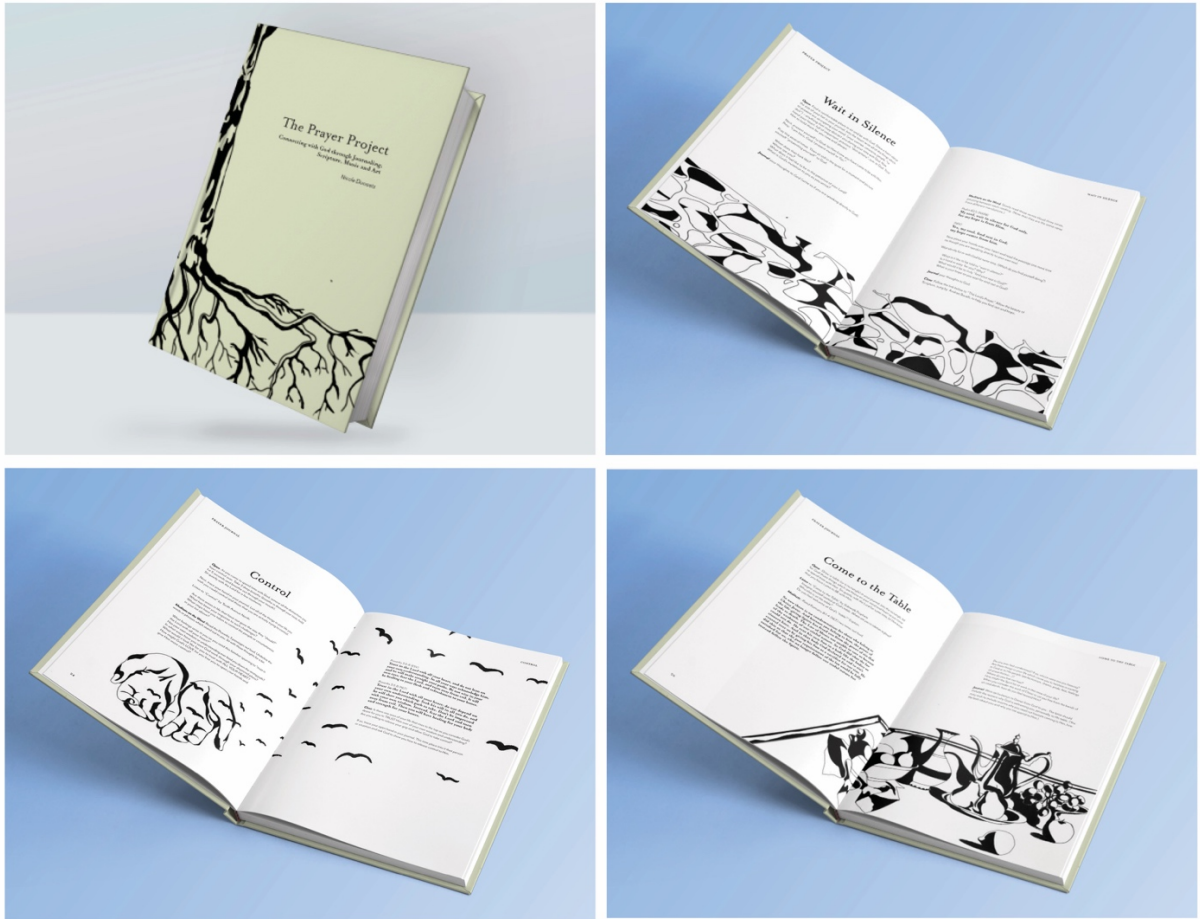
Figure 4: The Prayer Project Covers and Interior Design