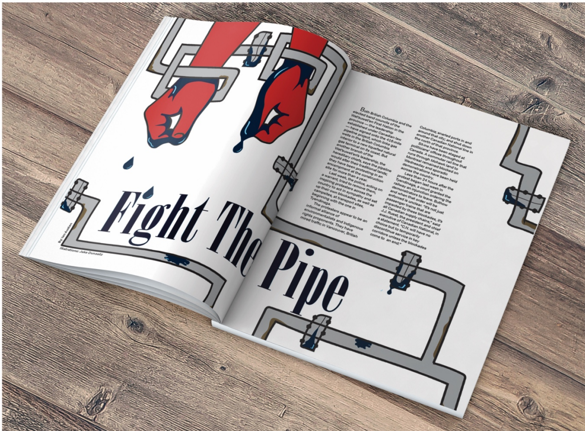
Figure 7: Fight The Pipe Spread