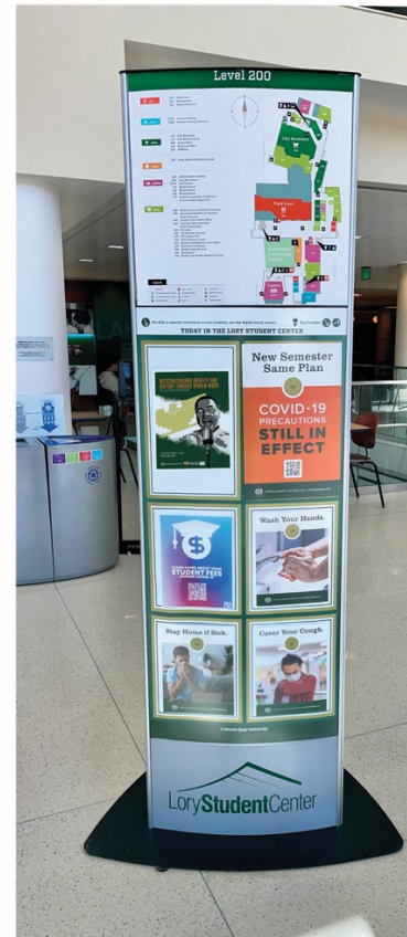
Figure 6: Spoken Word Event Poster