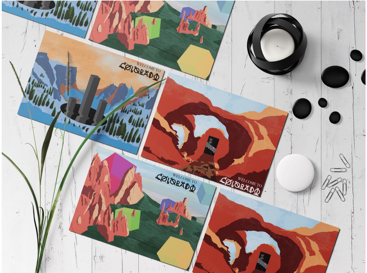
Figure 3: Surreal Postcard Series