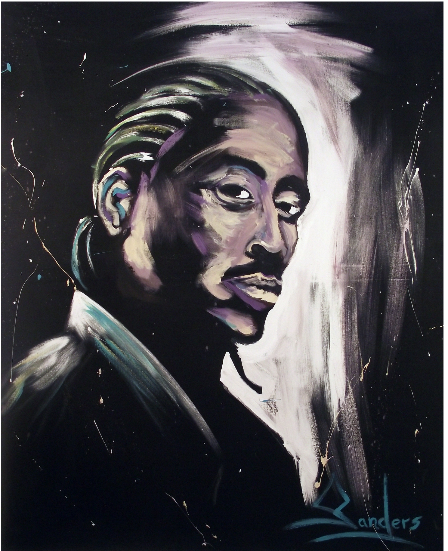
Figure 5: Ludacris.