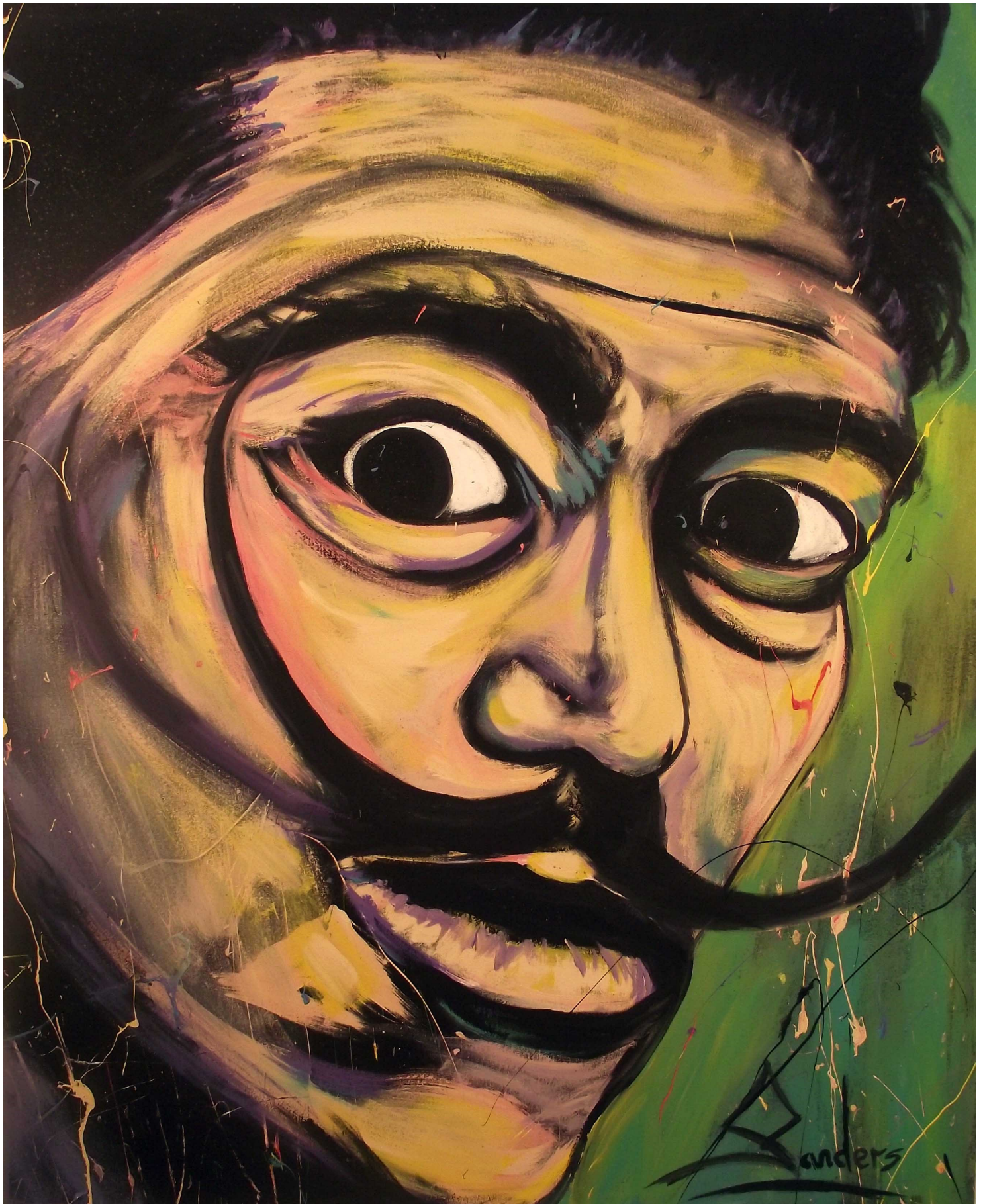
Figure 4: Dali.