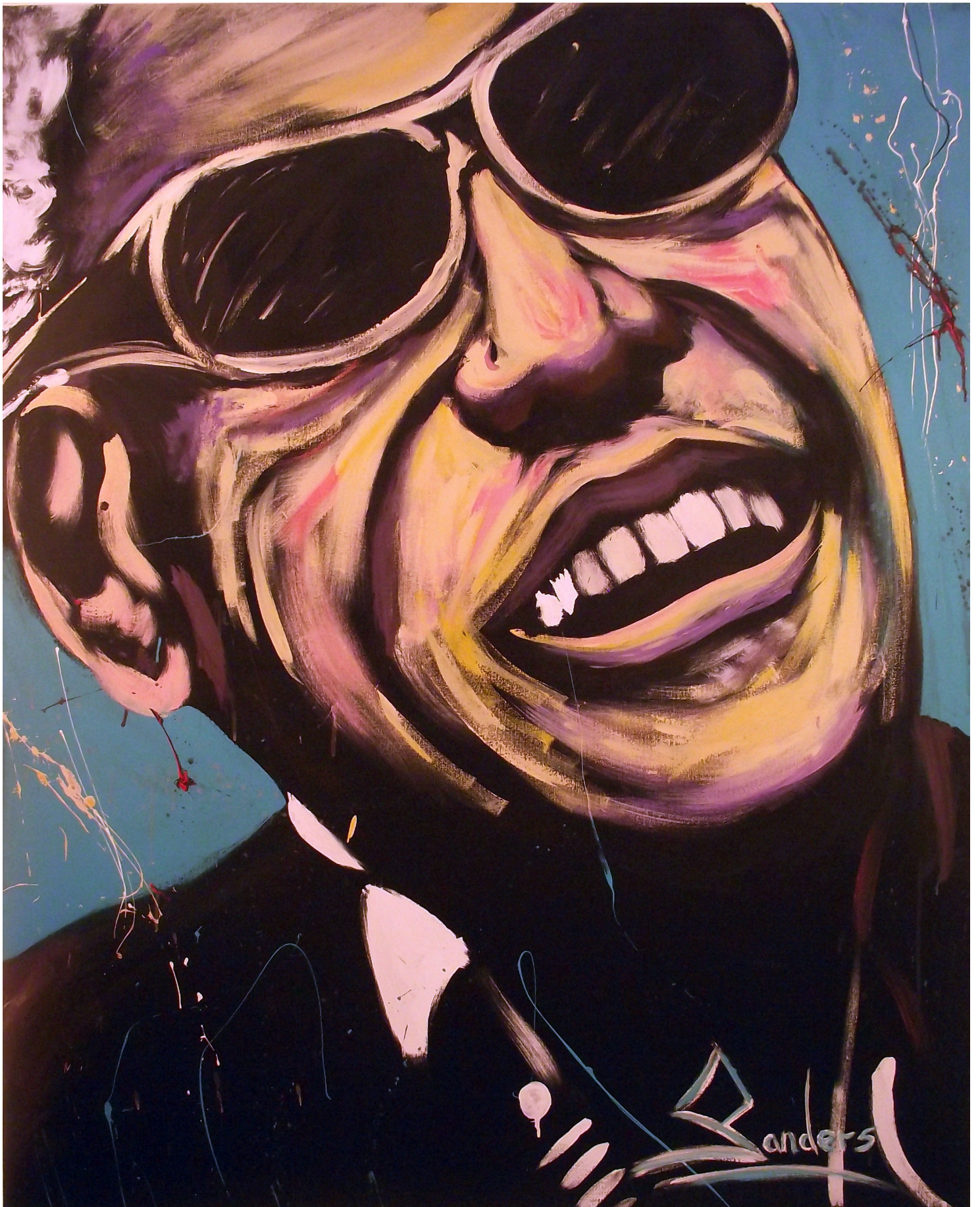
Figure 10: Ray Charles.