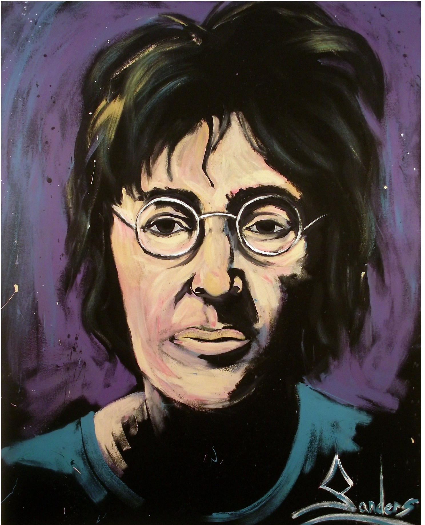
Figure 6: Lennon.