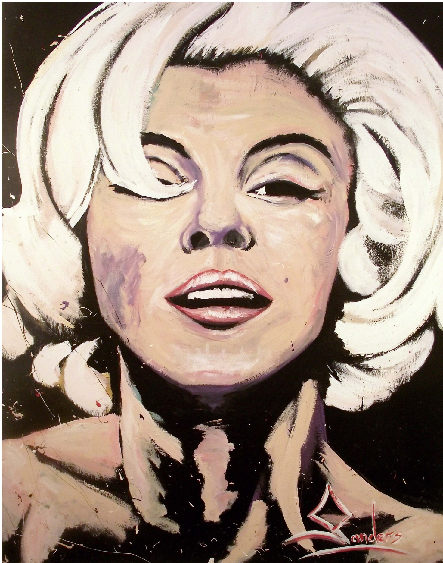
Figure 1: Monroe.