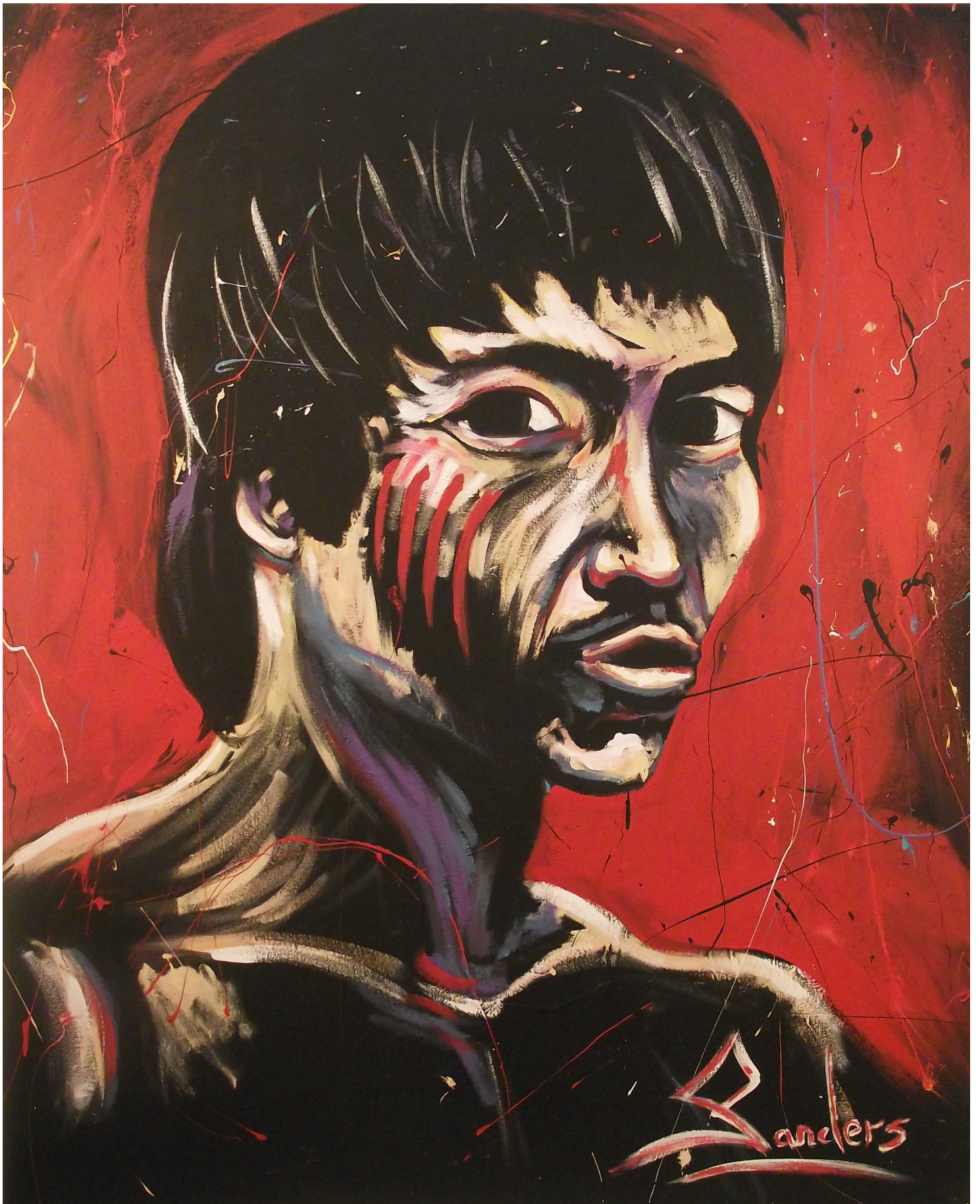
Figure 3: Bruce Lee.