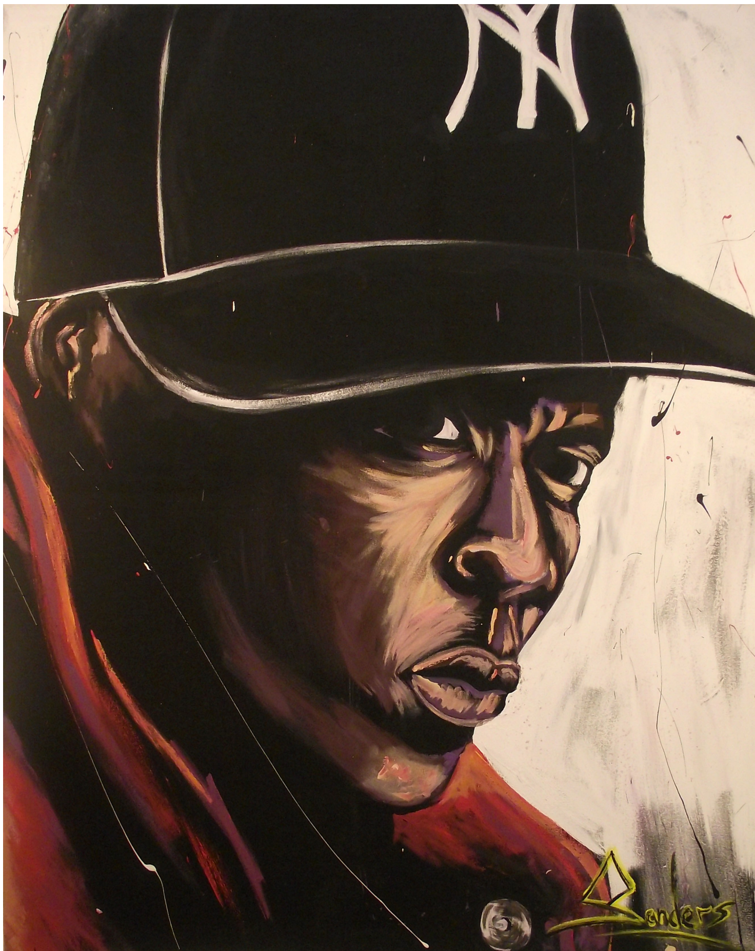
Figure 8: Jay Z.