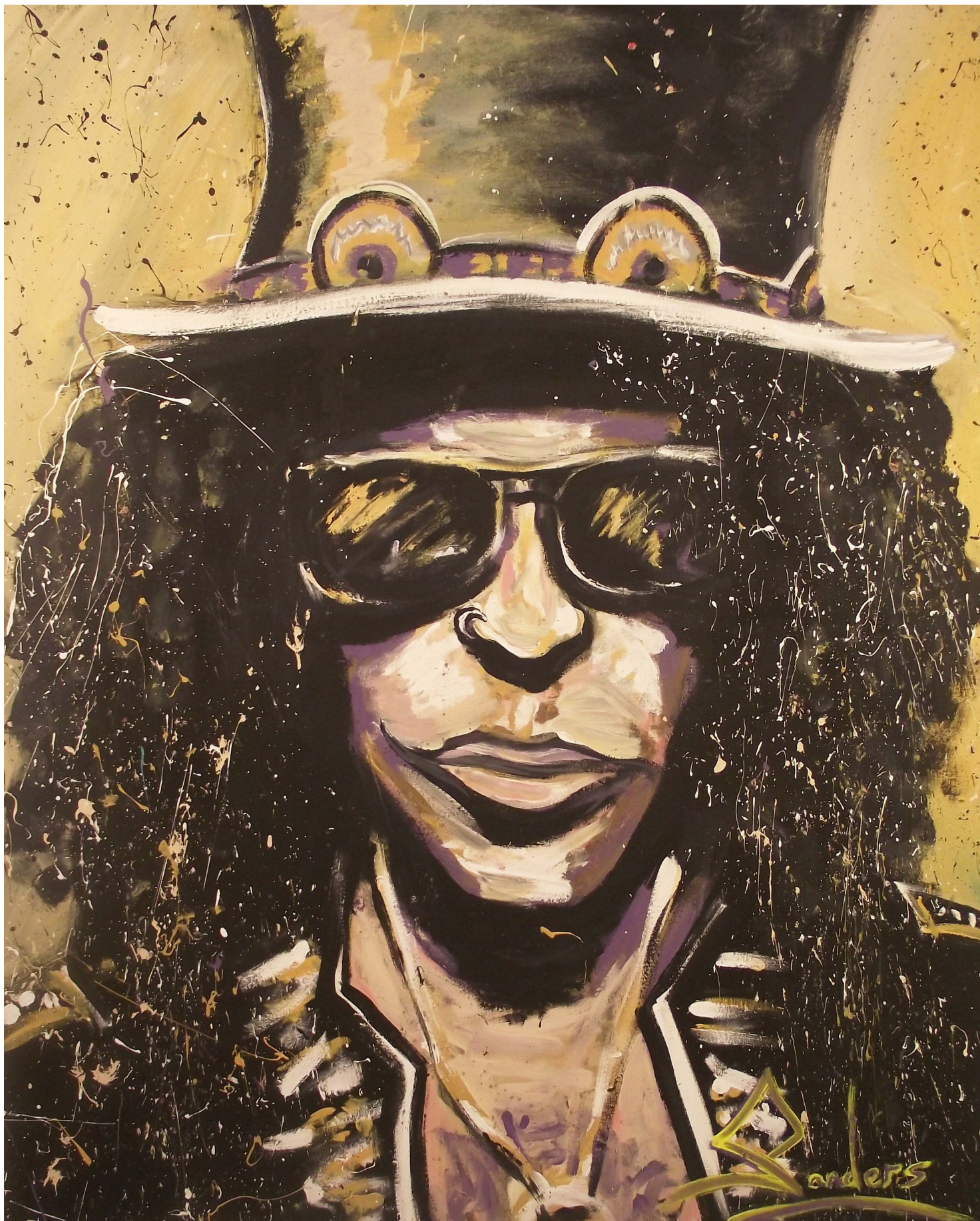
Figure 11: Slash.