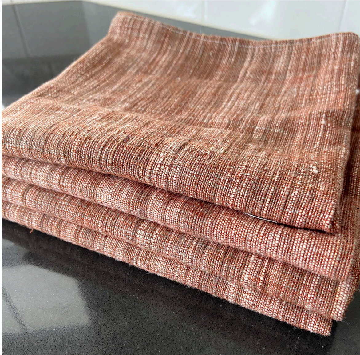
Figure 6: Untitled (Placemats)