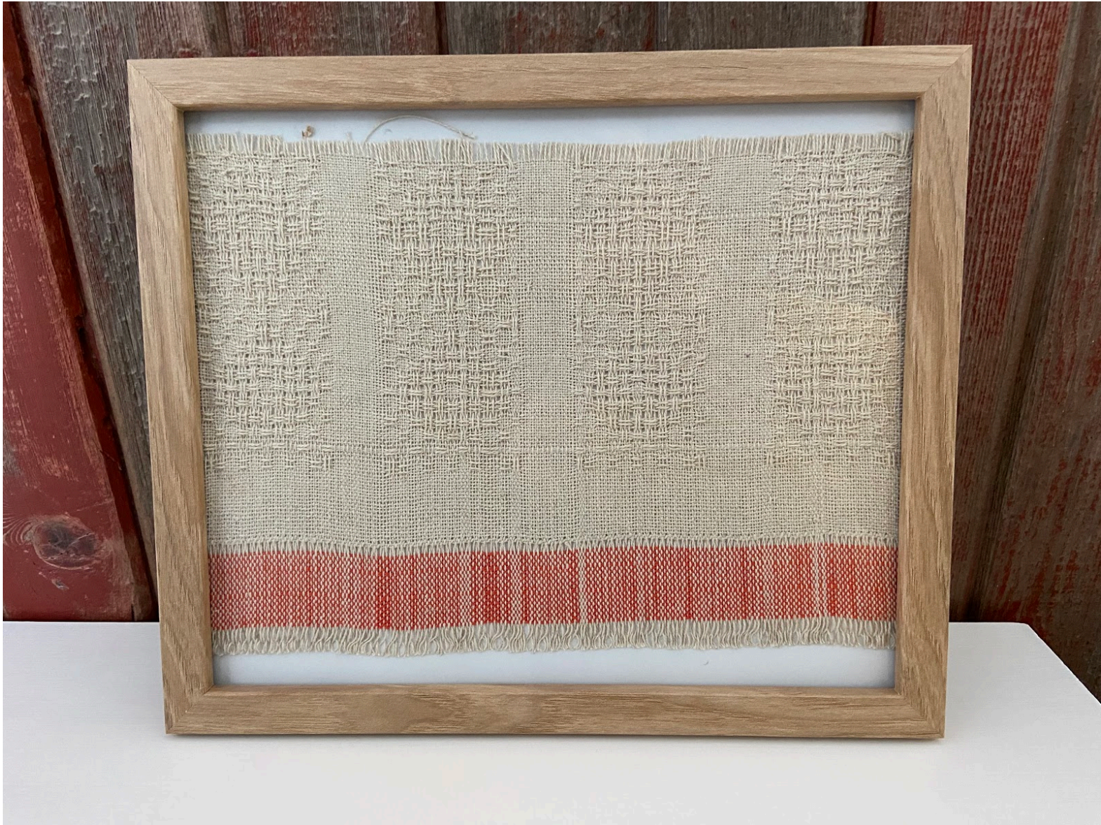
Figure 8: The Maggie Project