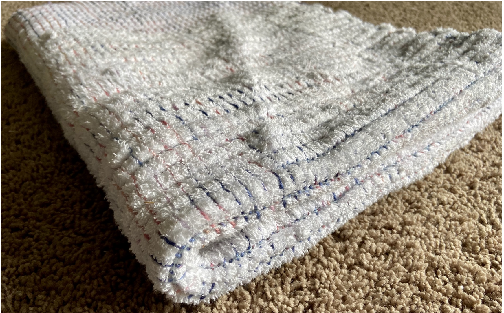
Figure 10: Bath Rag Rug