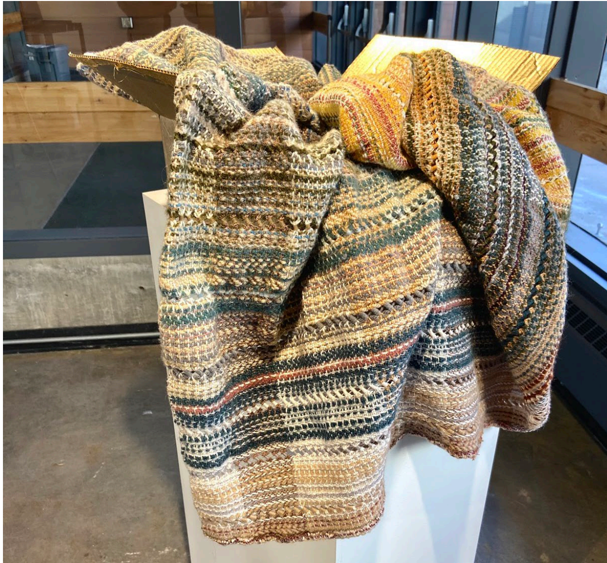
Figure 5: Untitled (Memory)