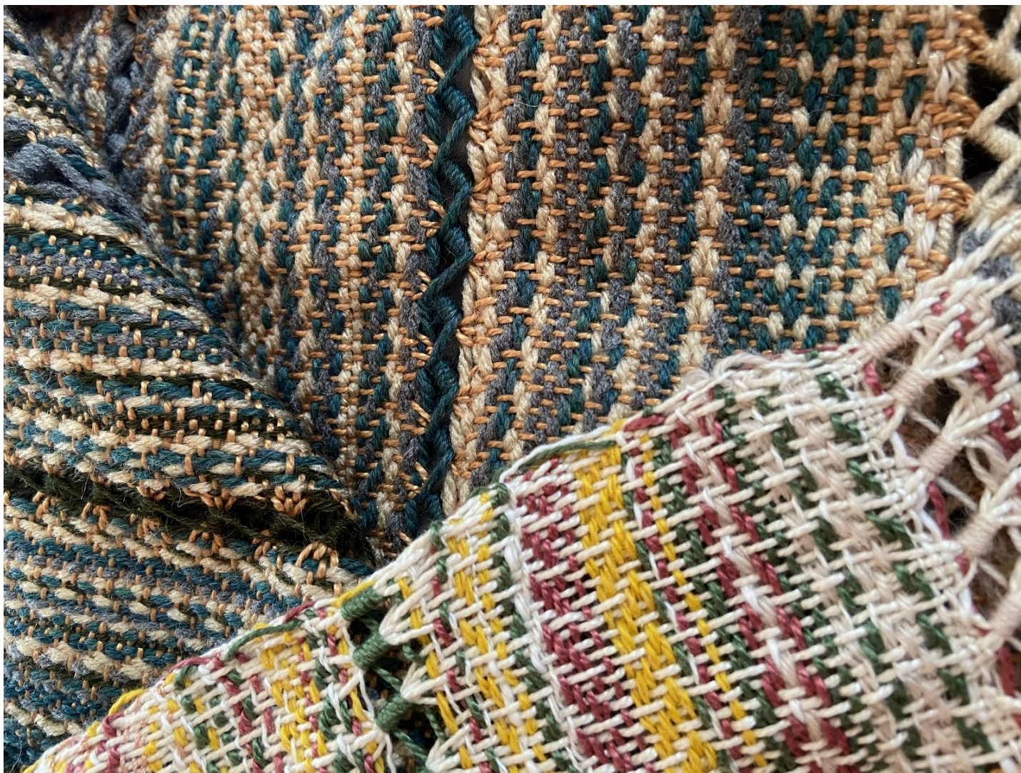
Figure 4: Untitled (Memory)