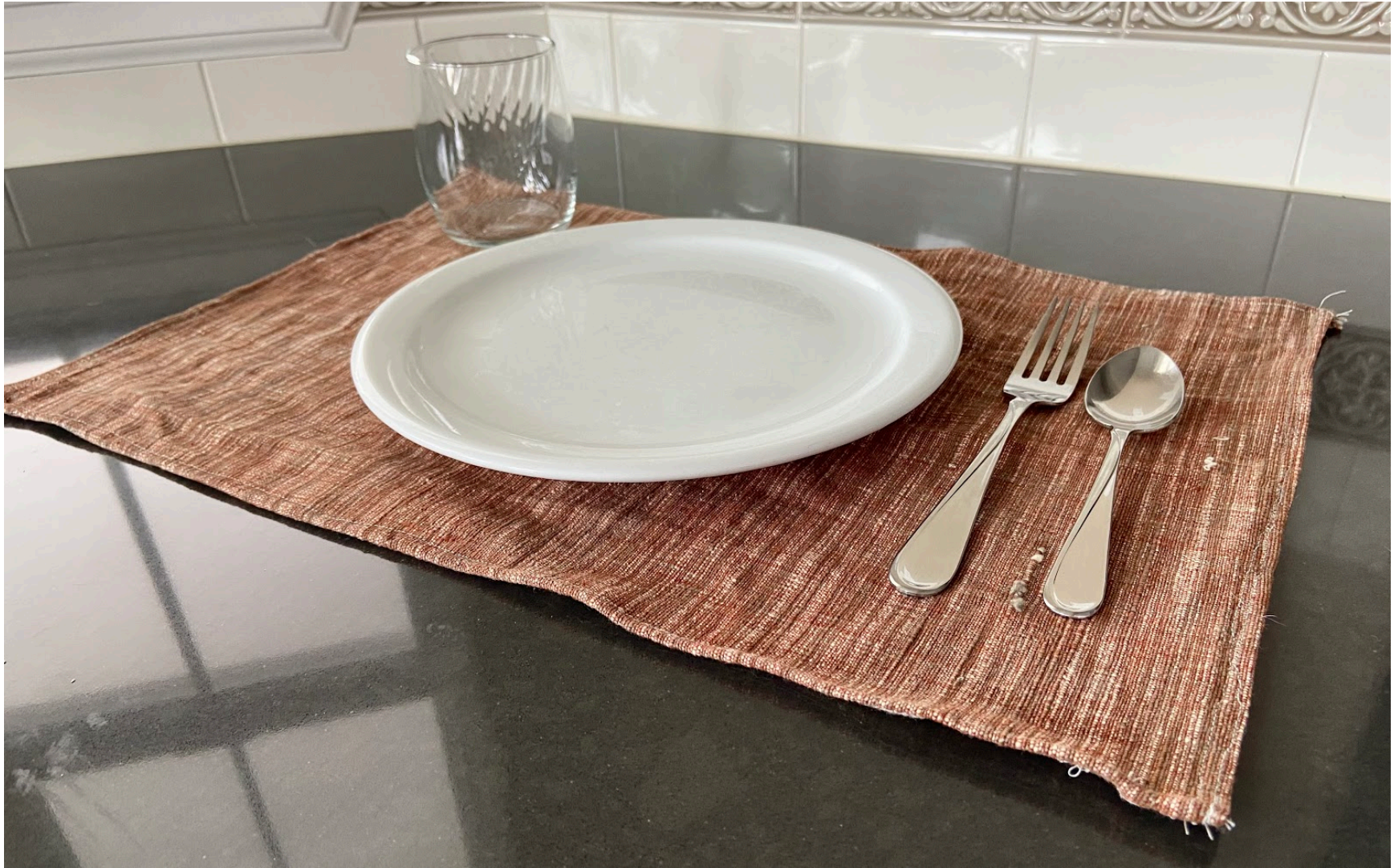
Figure 7: Untitled (Placemats)