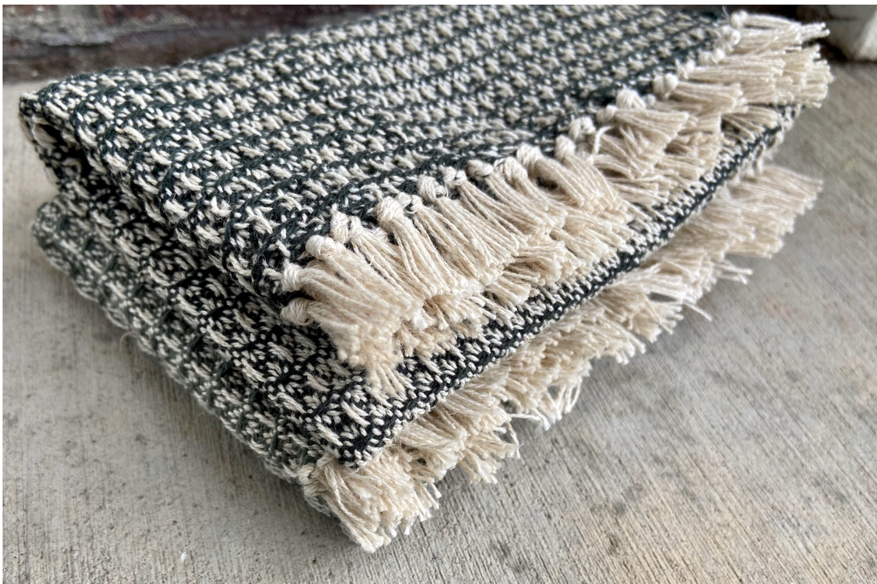
Figure 9: The Maggie Project