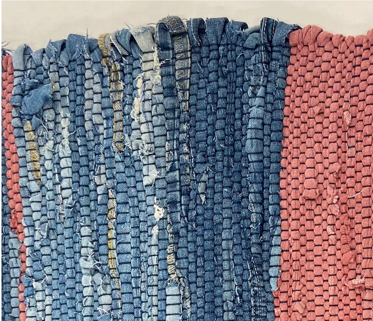
Figure 3: Rag Rug