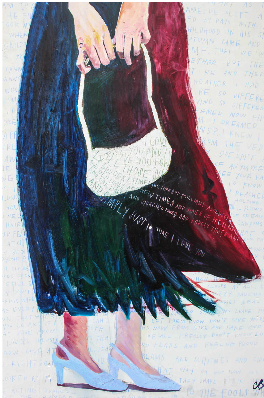
Figure 4: AnnMarie (In Time Gone By)