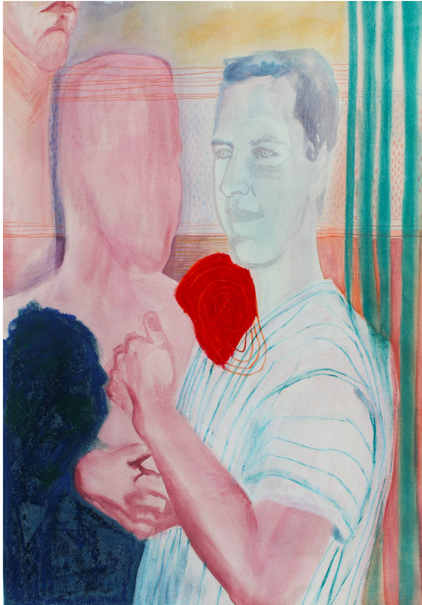
Figure 8: Reflections