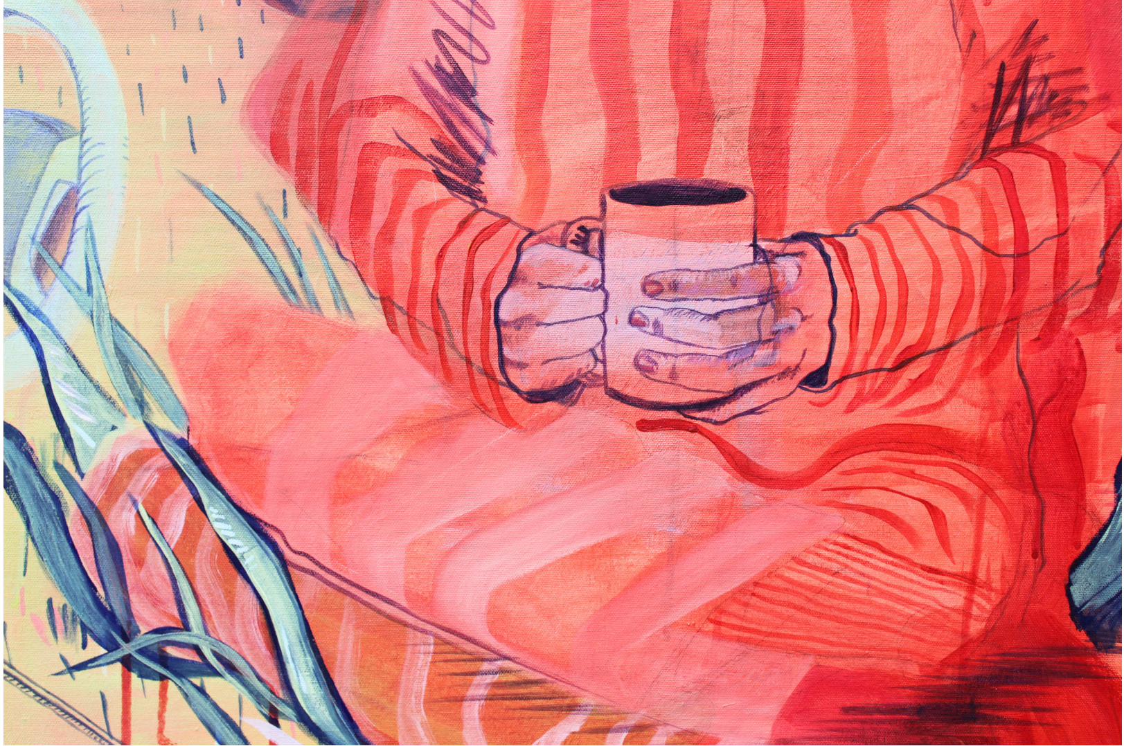
Figure 1: Ponder