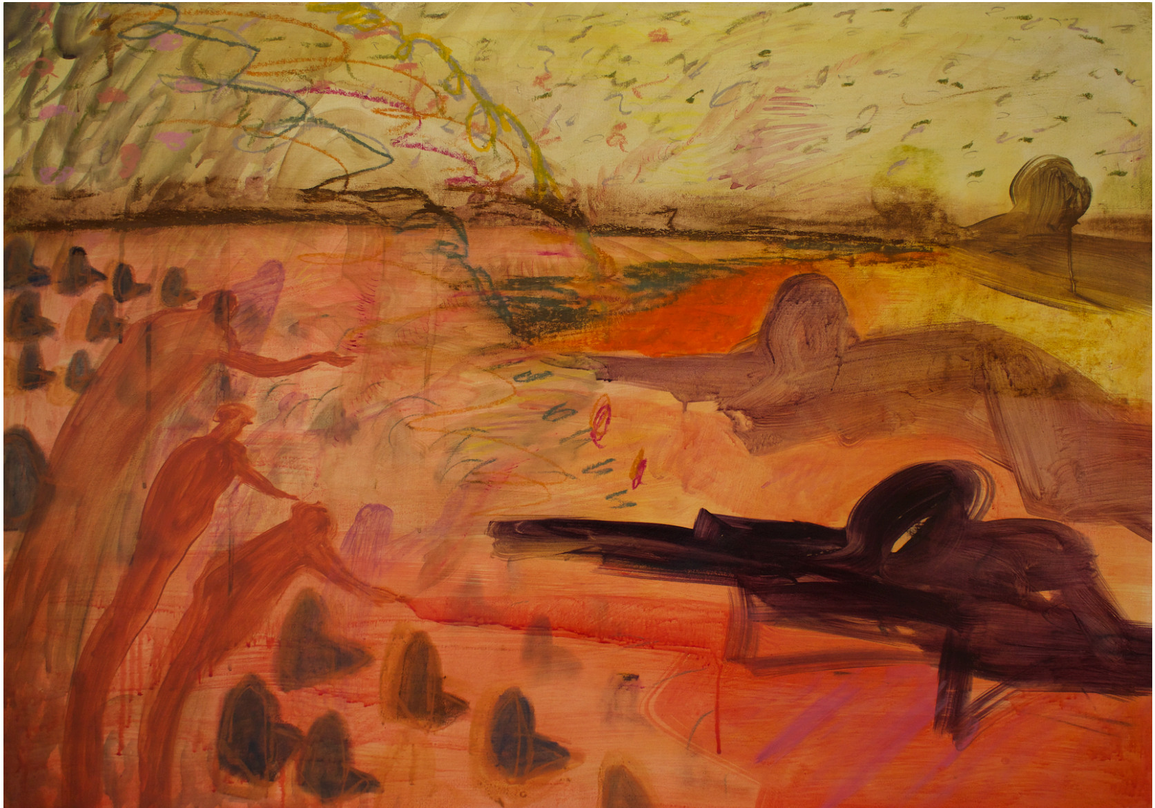
Figure 6: Not Against Flesh and Blood