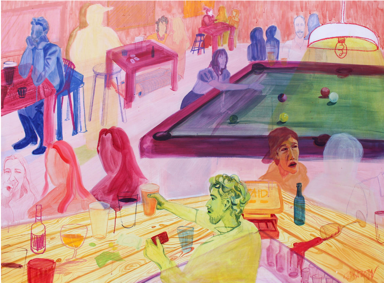
Figure 3: The Trailhead