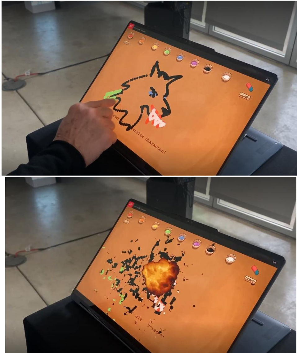
Figure 3: Explosive Surprise