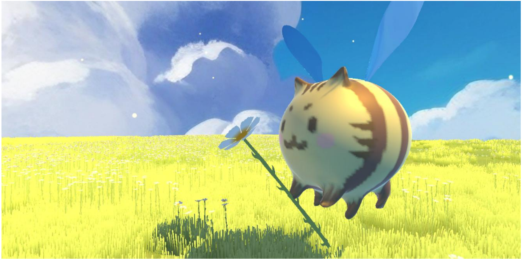
Figure 2: Utopian Solution – Beeline