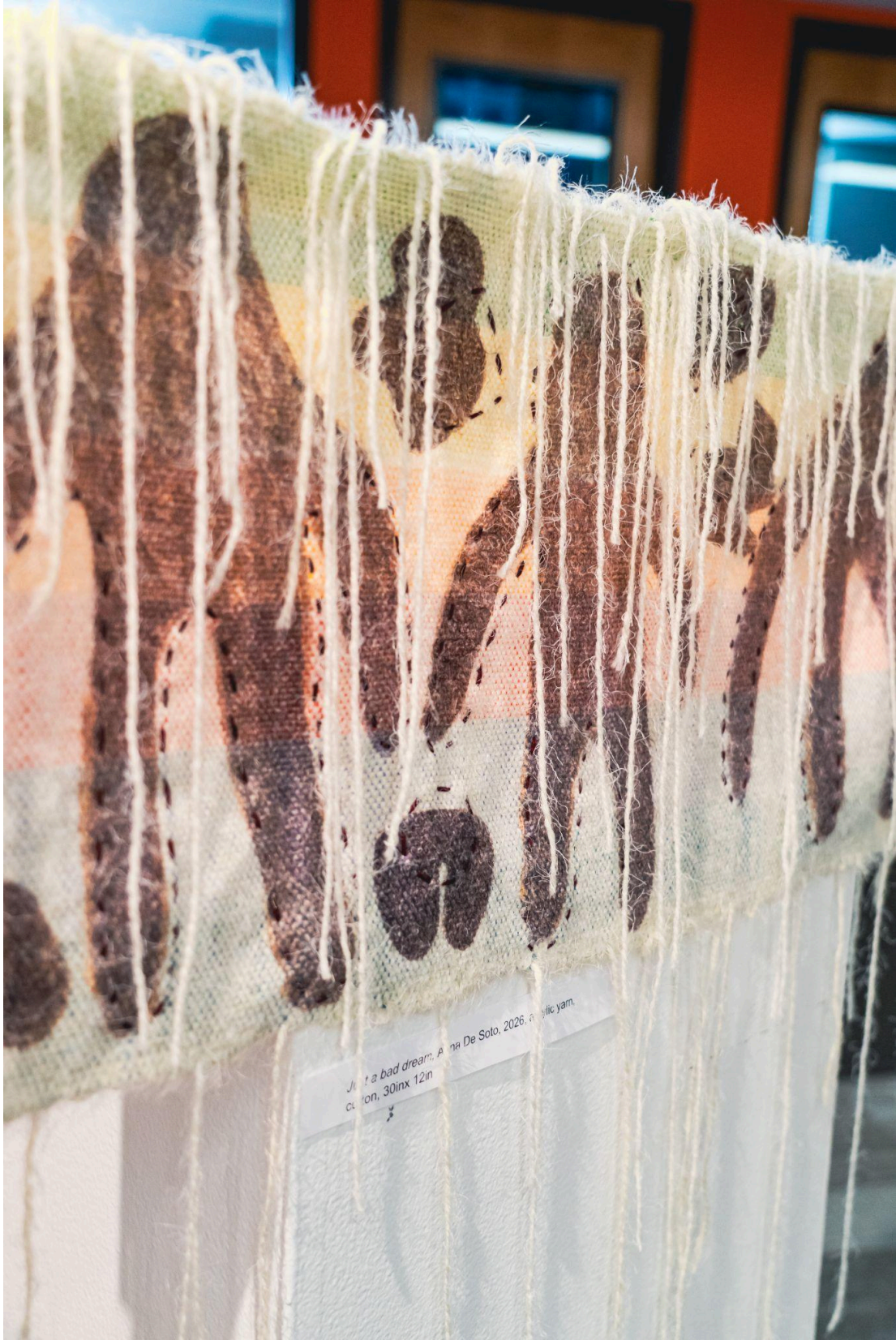
Figure 4: Bad Dreams