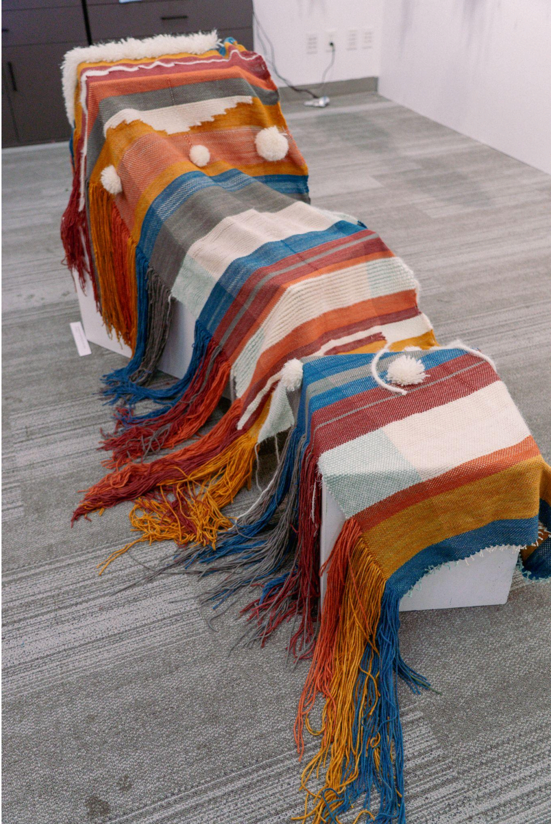
Figure 1: Blank Memories