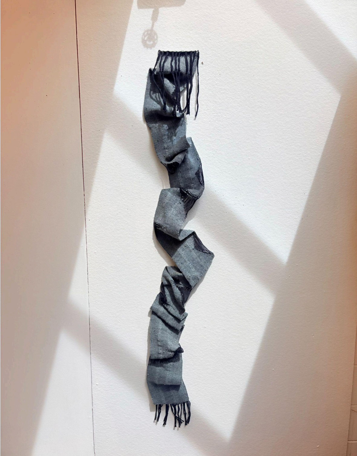
Figure 5: Rivers