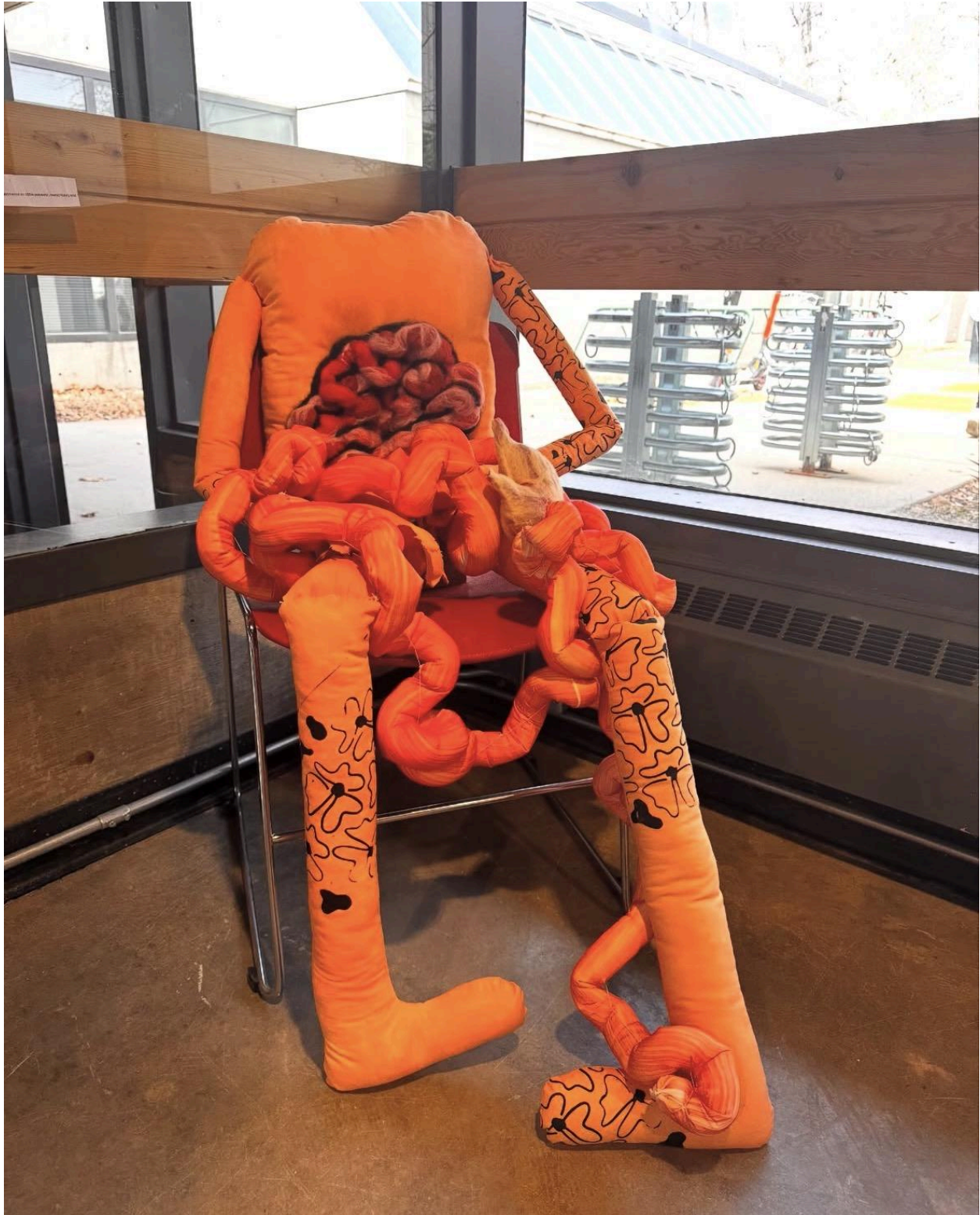
Figure 6: Spill My Guts