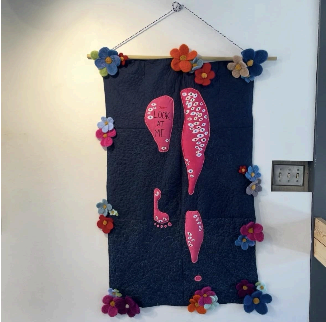
Figure 7: Don't Look at Me