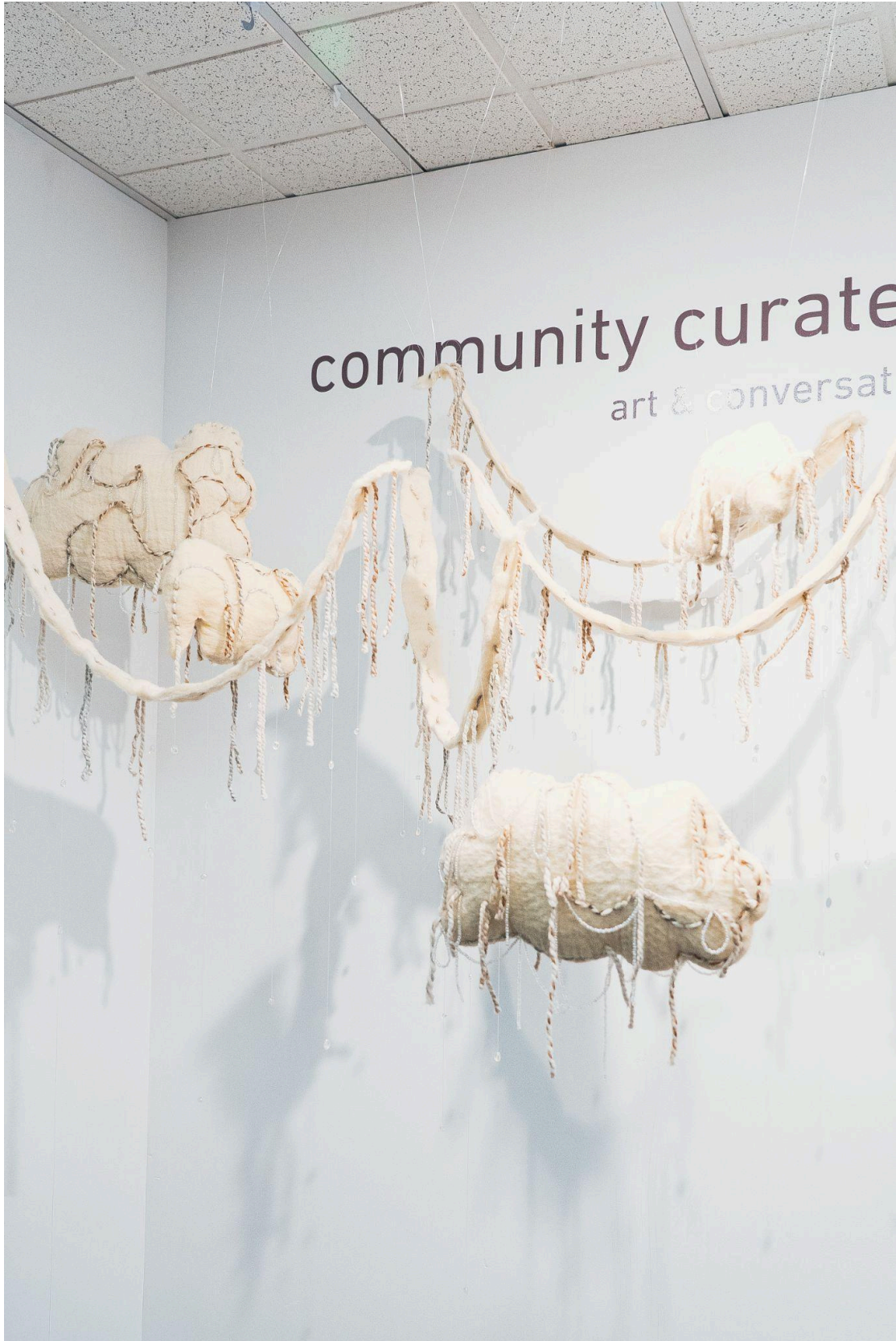
Figure2: Kinda Looks Like...