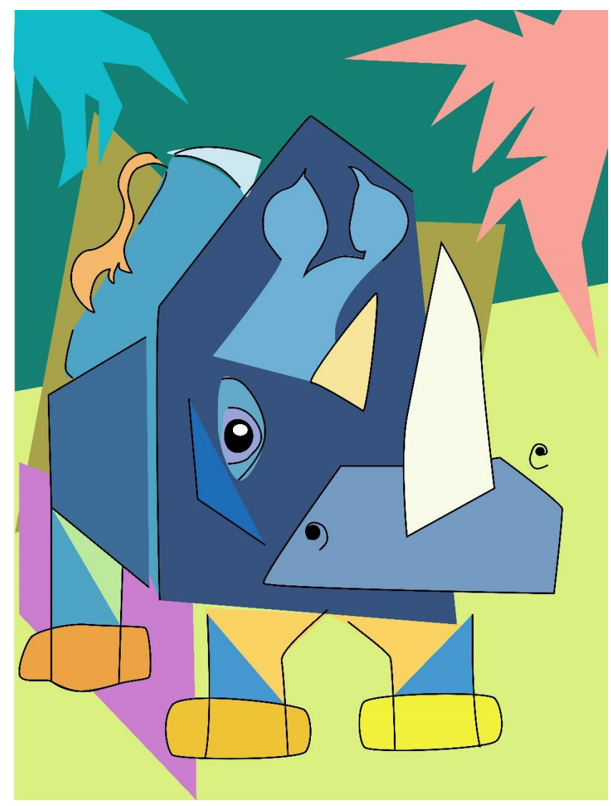
Figure 6: Abstract Rhino