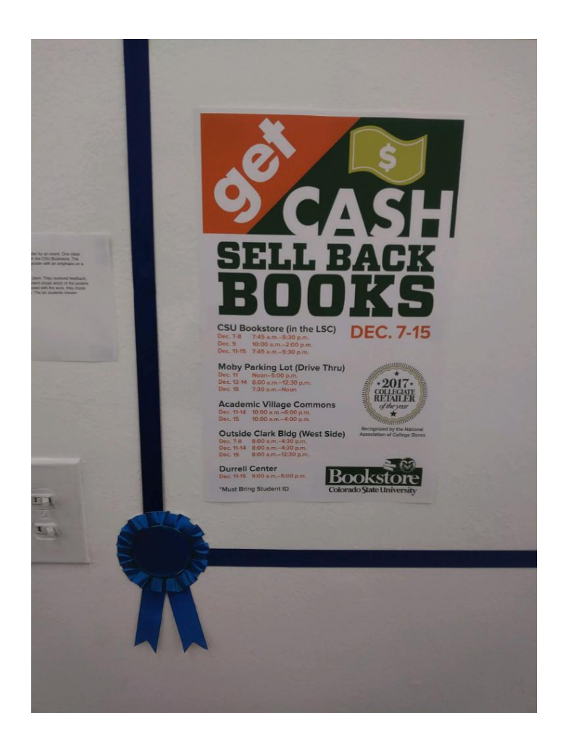
Figure 10: Lory Bookstore Sell Back Poster