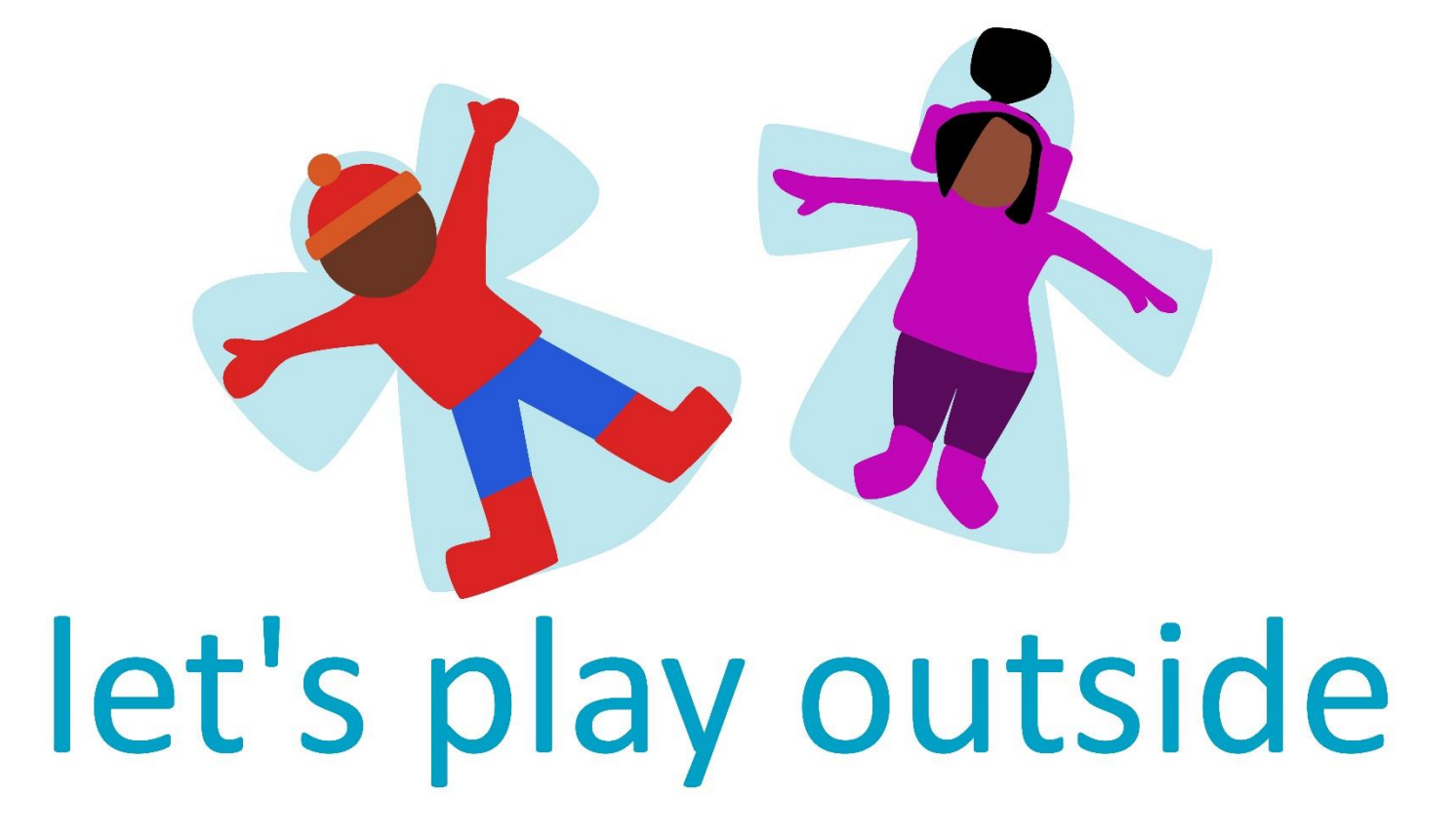
Figure 1: Children's Winter Town