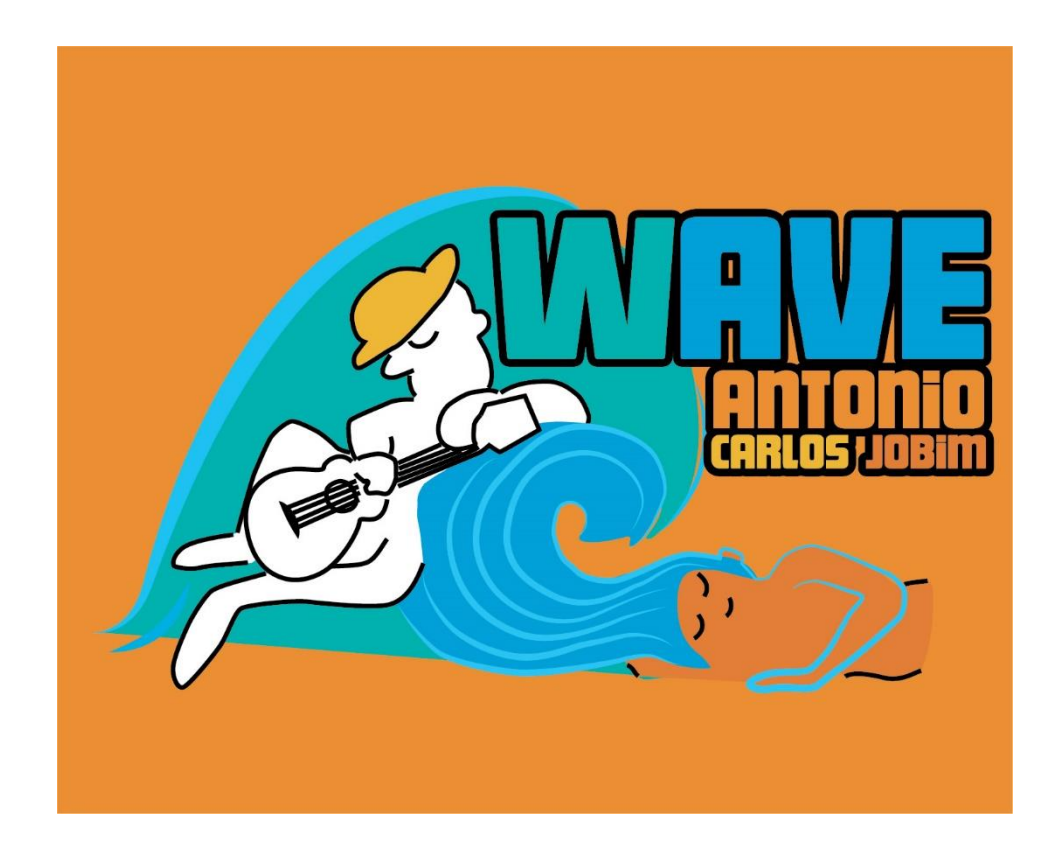
Figure 8: WAVE CD Cover