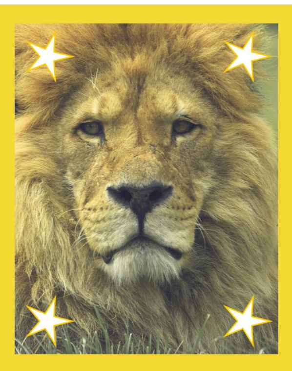
Figure 5: Victory Lion Song & p5 js

Press any Key to Play Lion Song Click to toggle Lion image