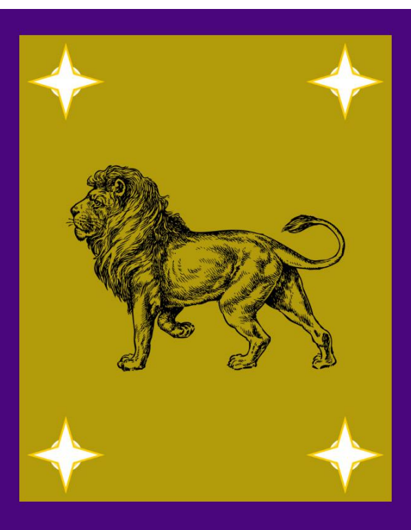
Figure 4: Royal Lion Song & p5 js

Press any Key to Play Lion Song Logo vector created by freepik - www.freepik.com