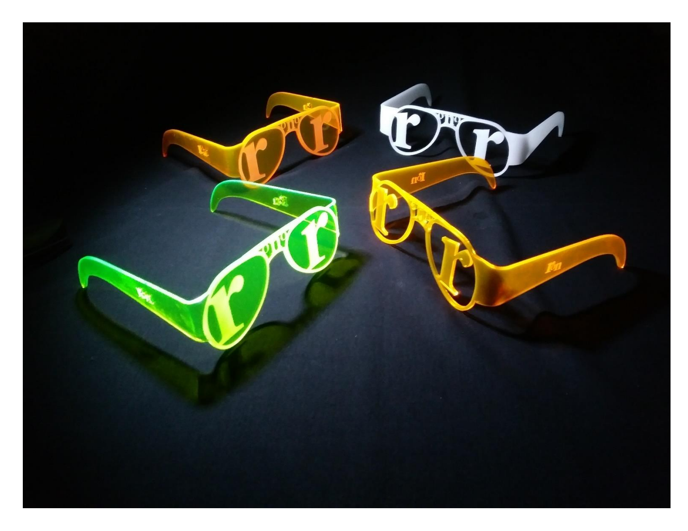
Figure 7: Acrylic Glasses