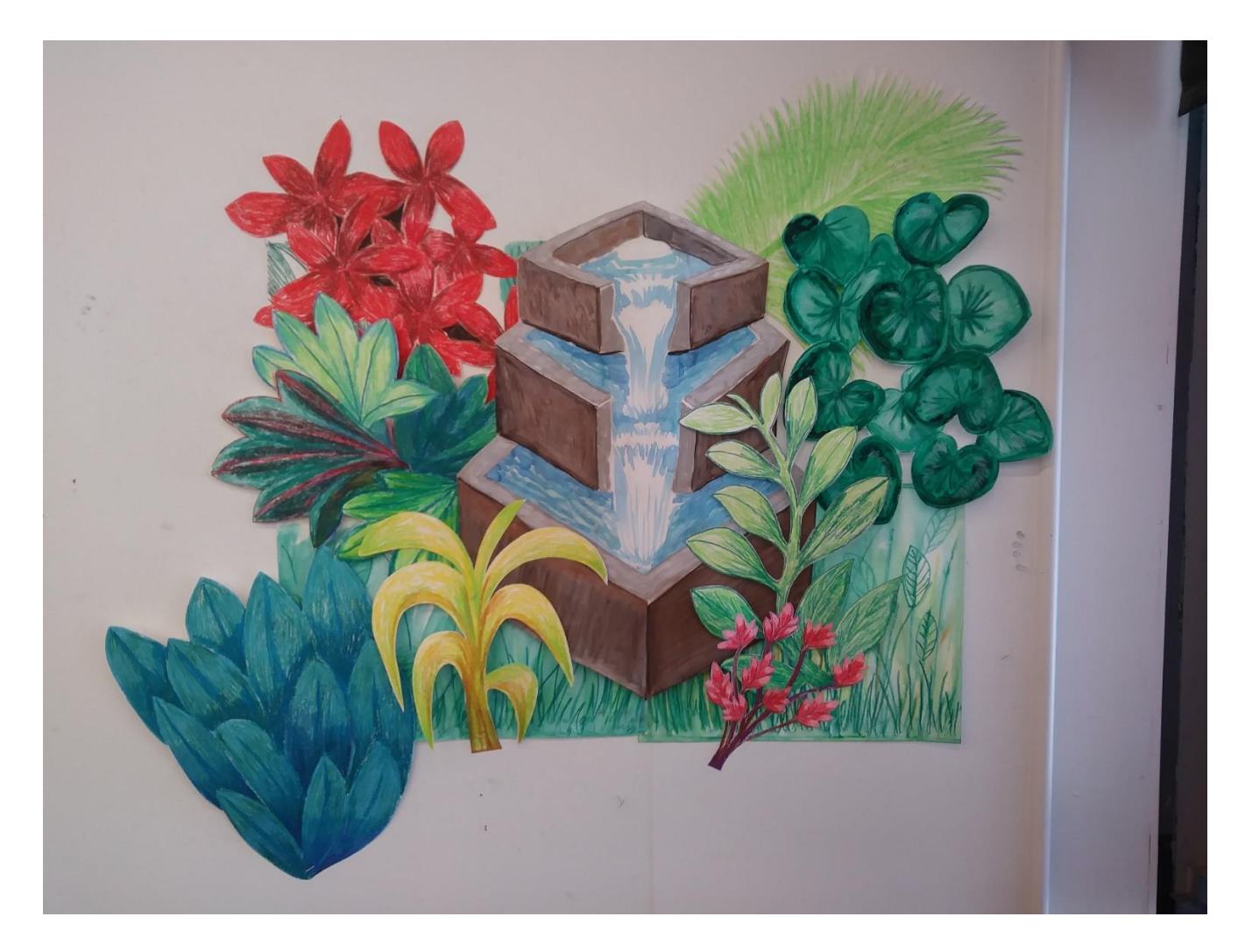
Figure 9: Nature vs Man Made