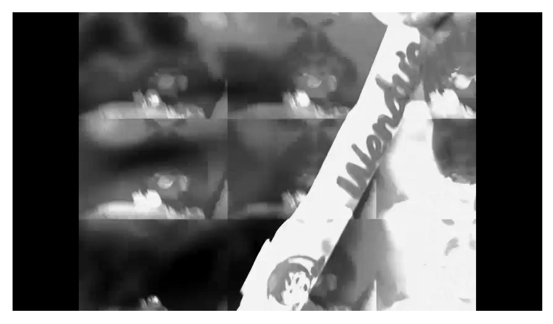
Figure 2: Habit Meal