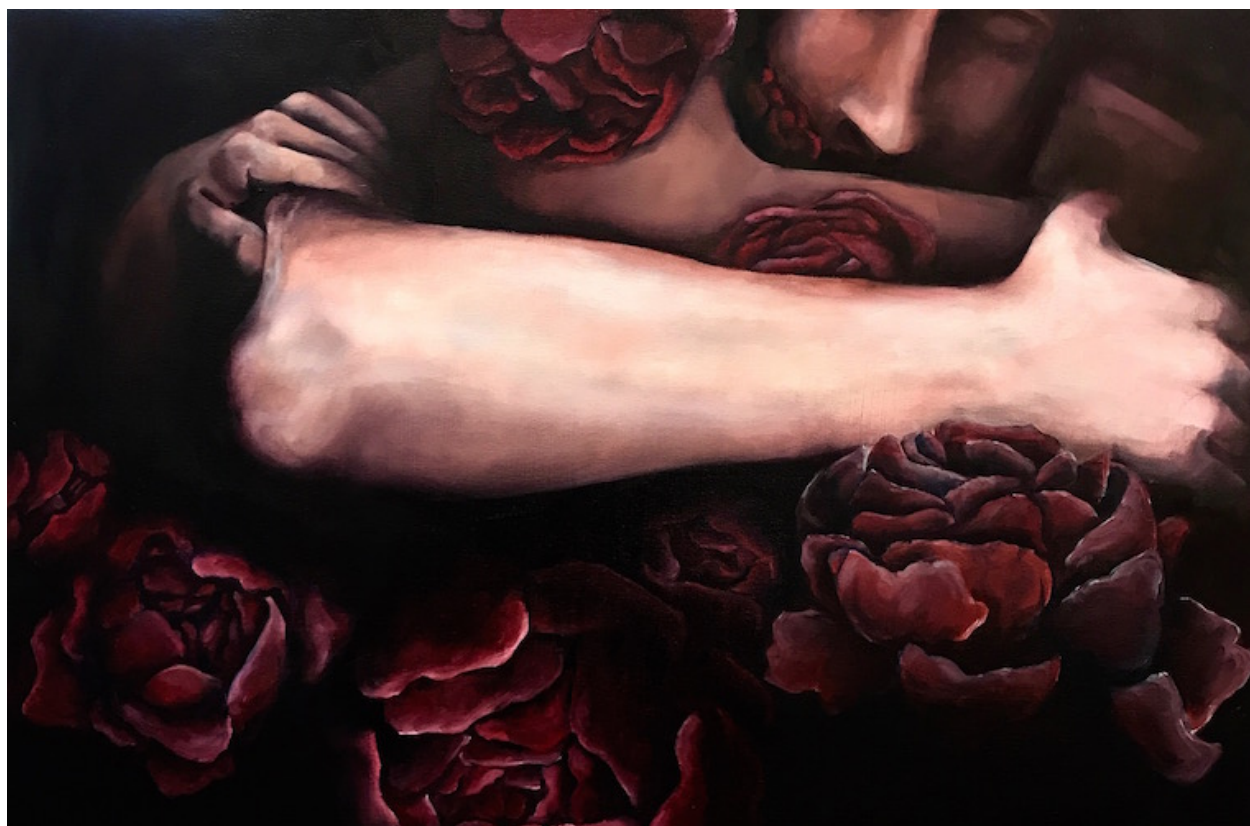
Figure 4: Eighteen Inches #2