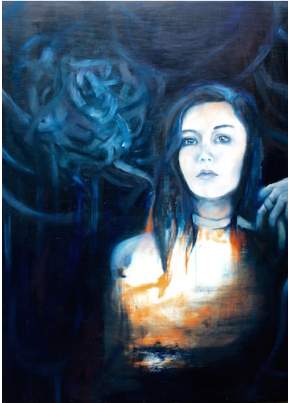
Figure 9: Better Love