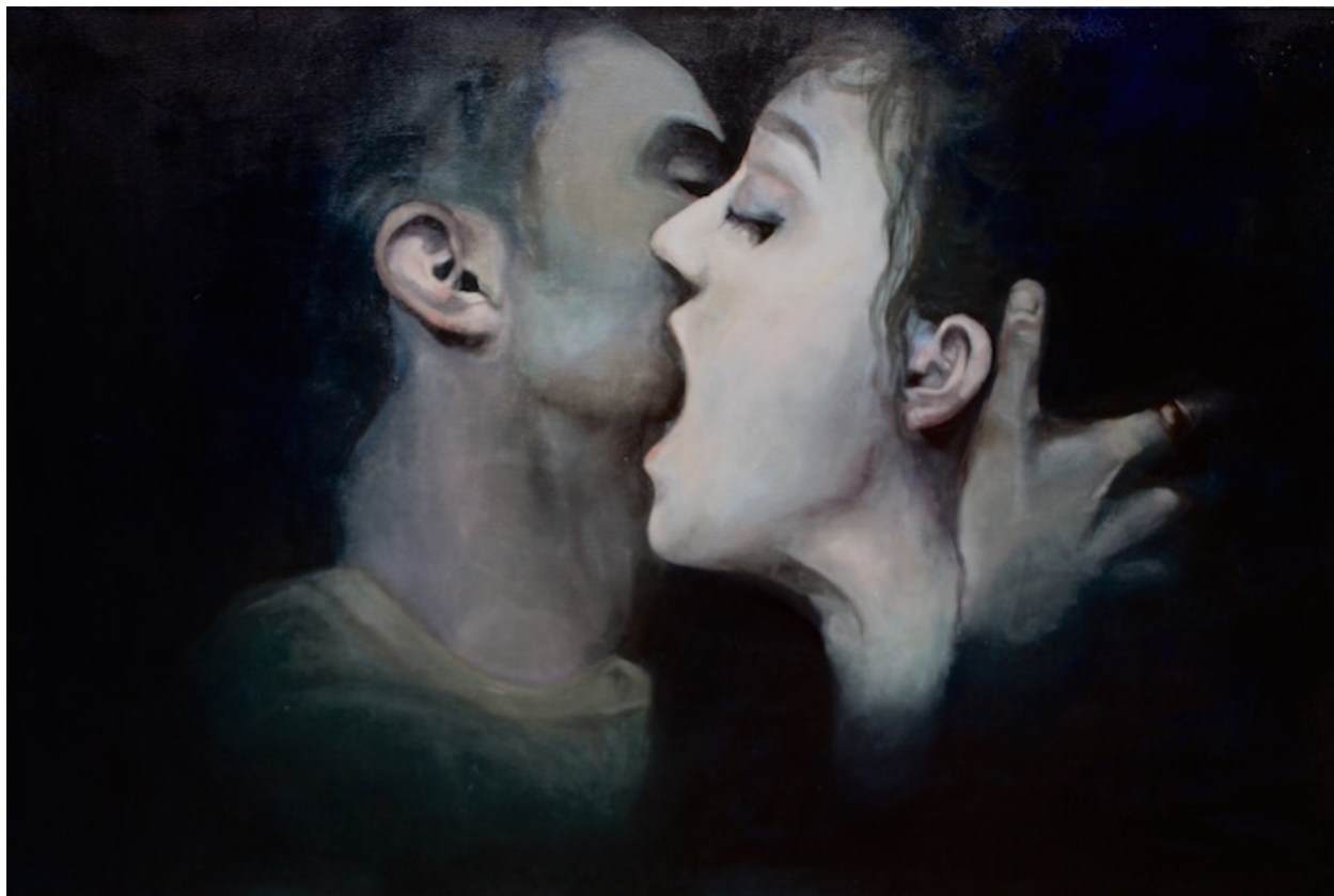
Figure 1: Intimate Dissonance