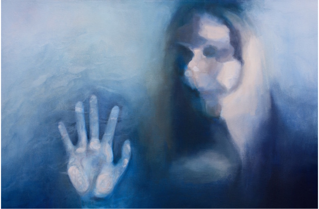
Figure 5: Barrier