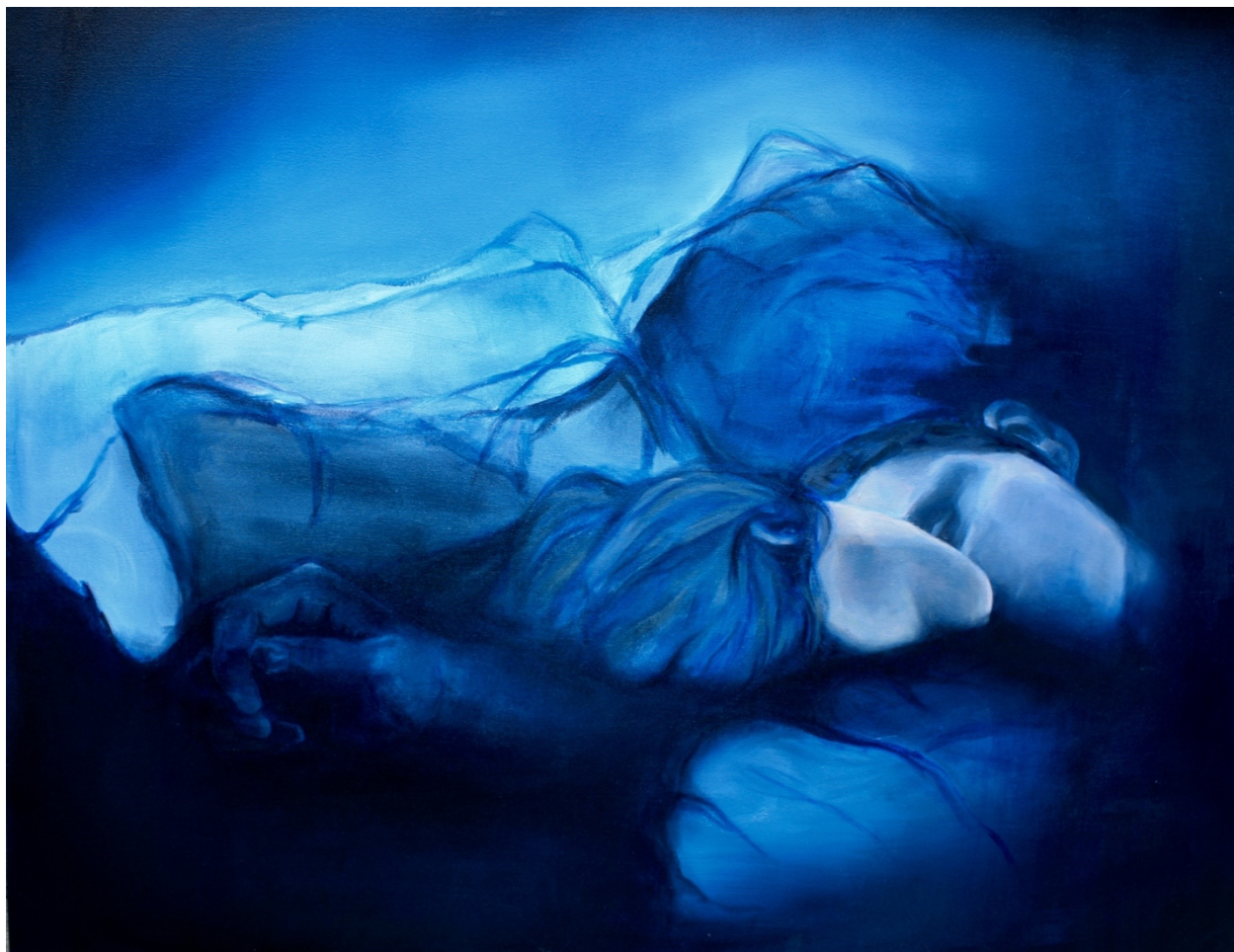
Figure 8: Rising Water