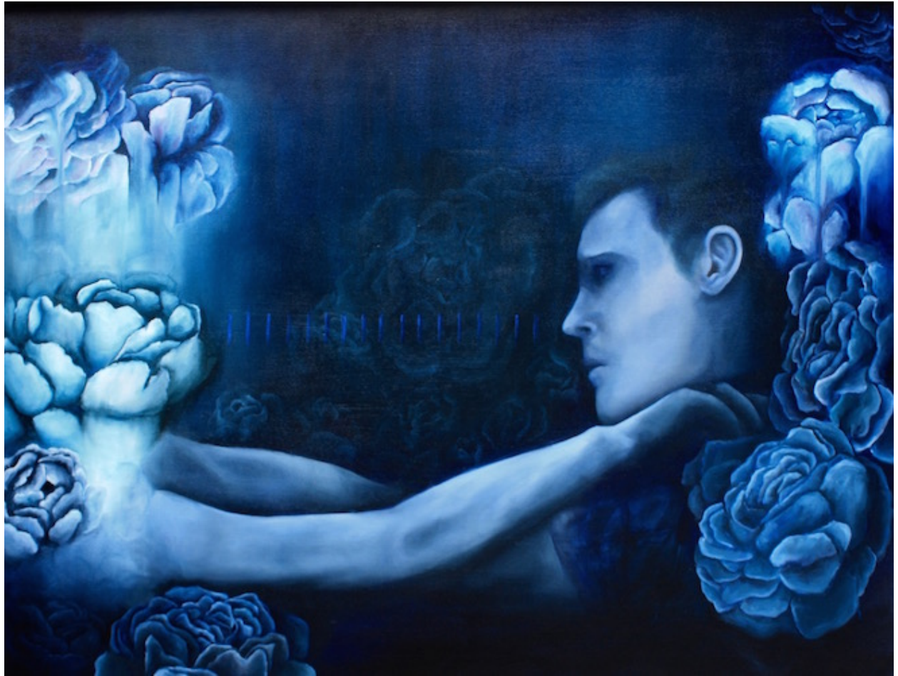
Figure 3: Eighteen Inches