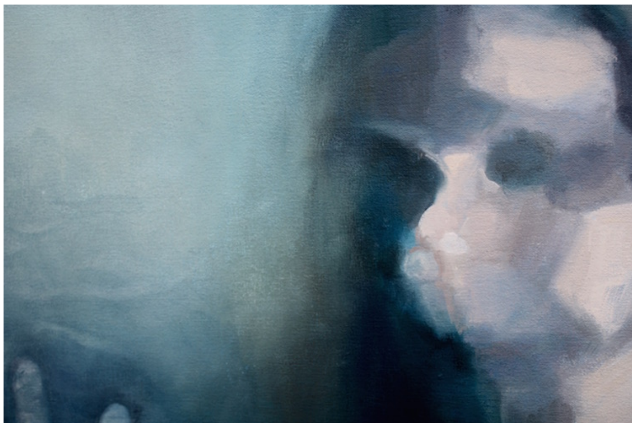
Figure 6: Barrier (detail)