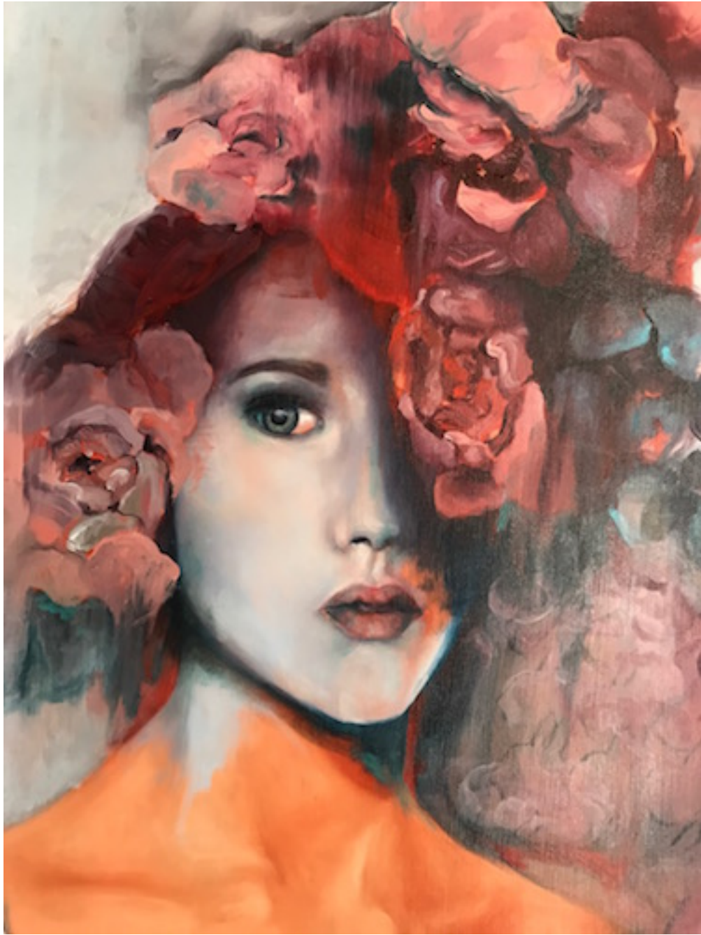
Figure 7: Undress