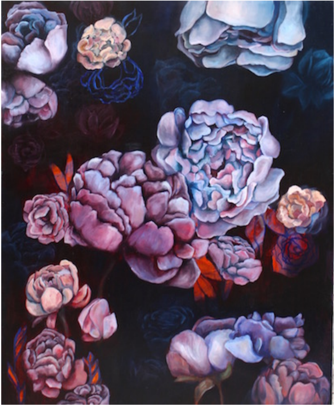
Figure 2: The Self Portrait