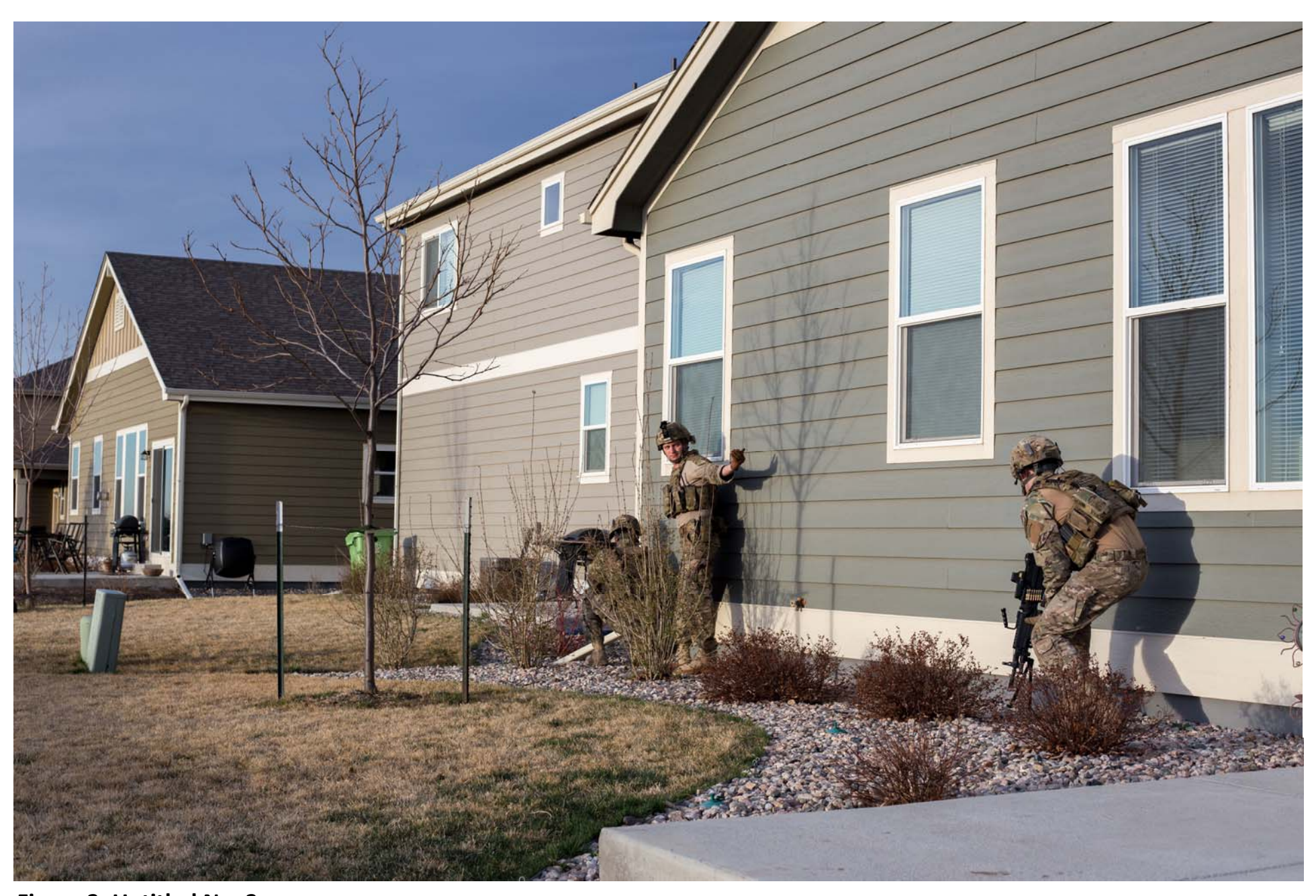
Figure 3: Untitled No. 3.