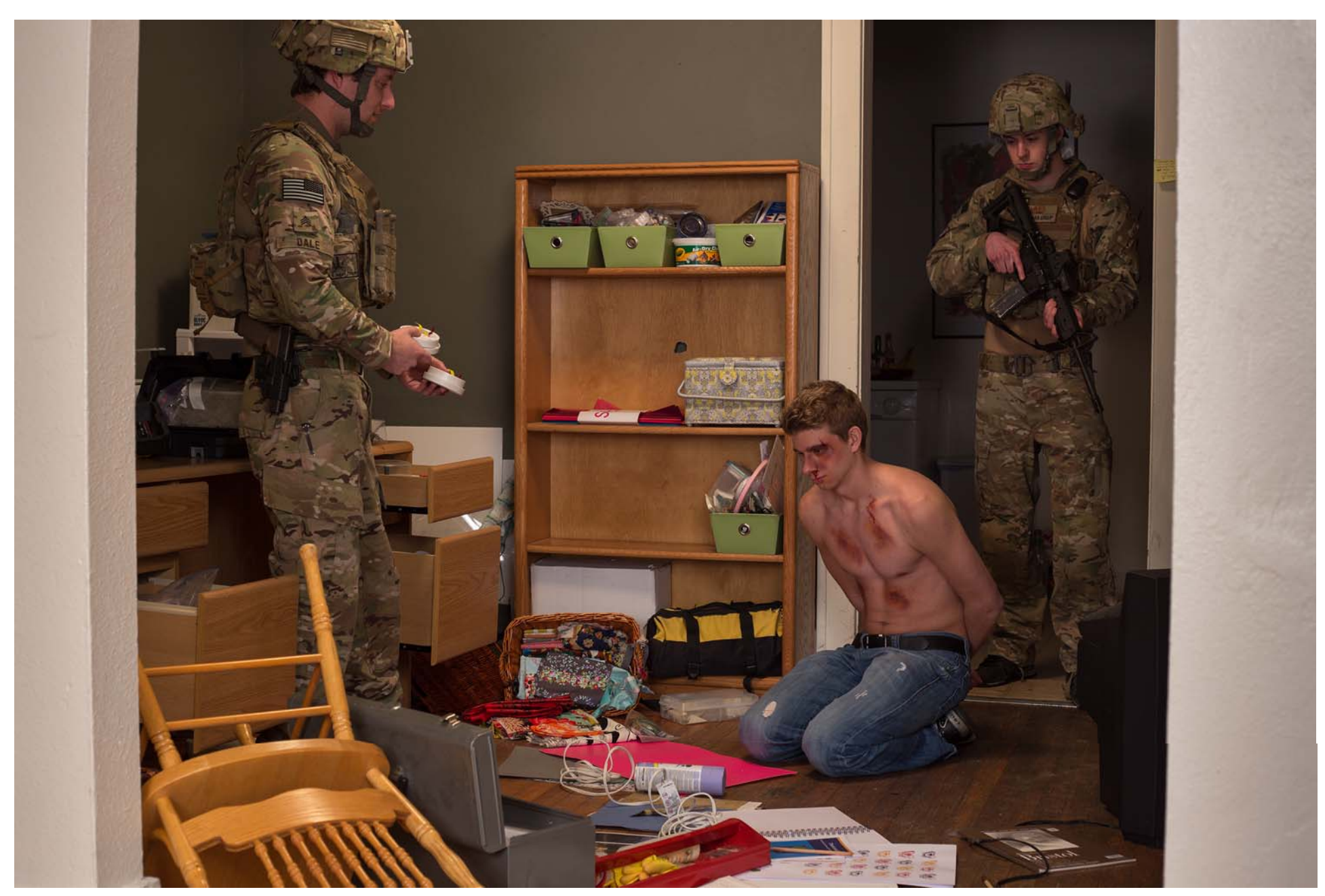
Figure 8: Untitled No. 8.