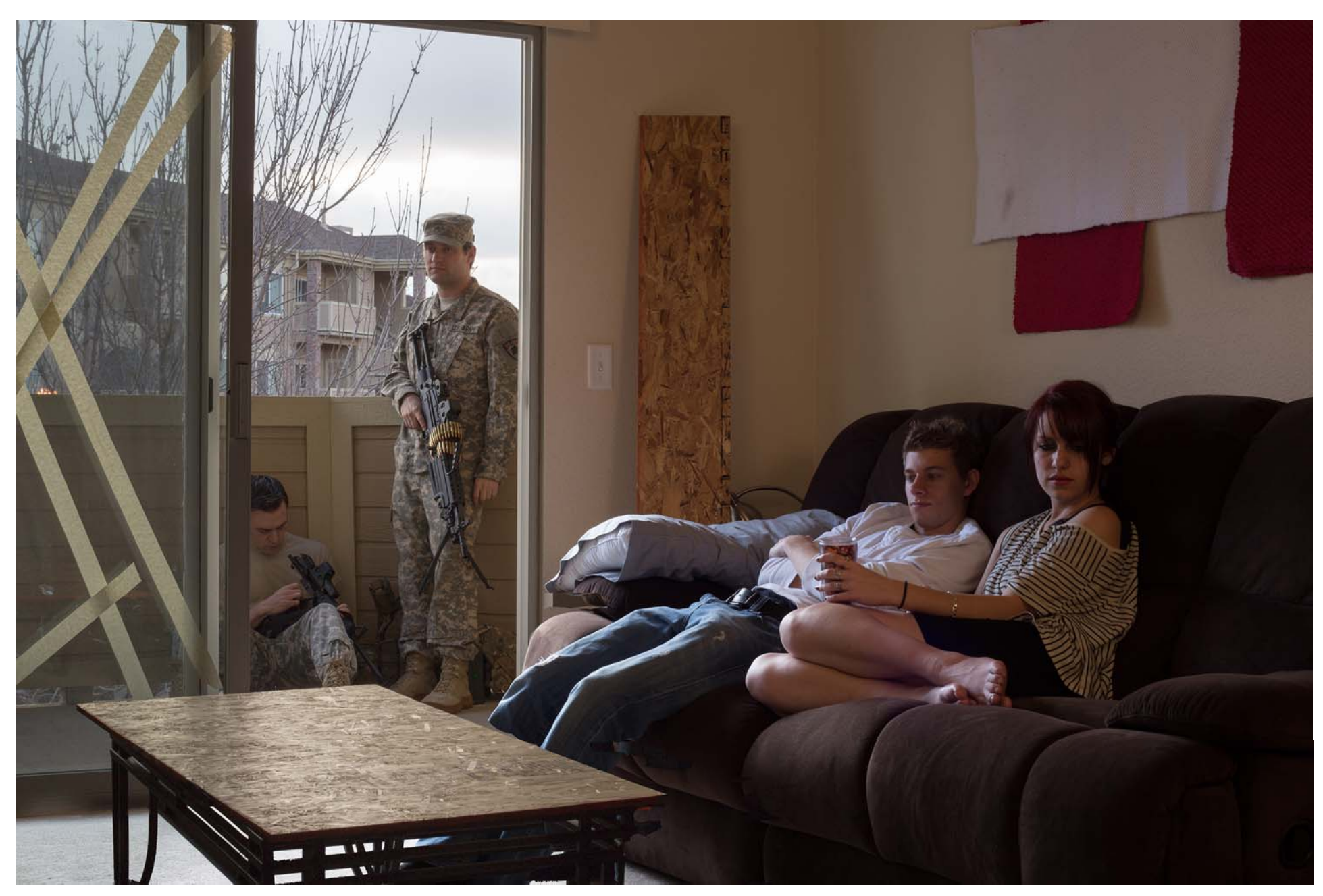
Figure 10: Untitled No. 10.