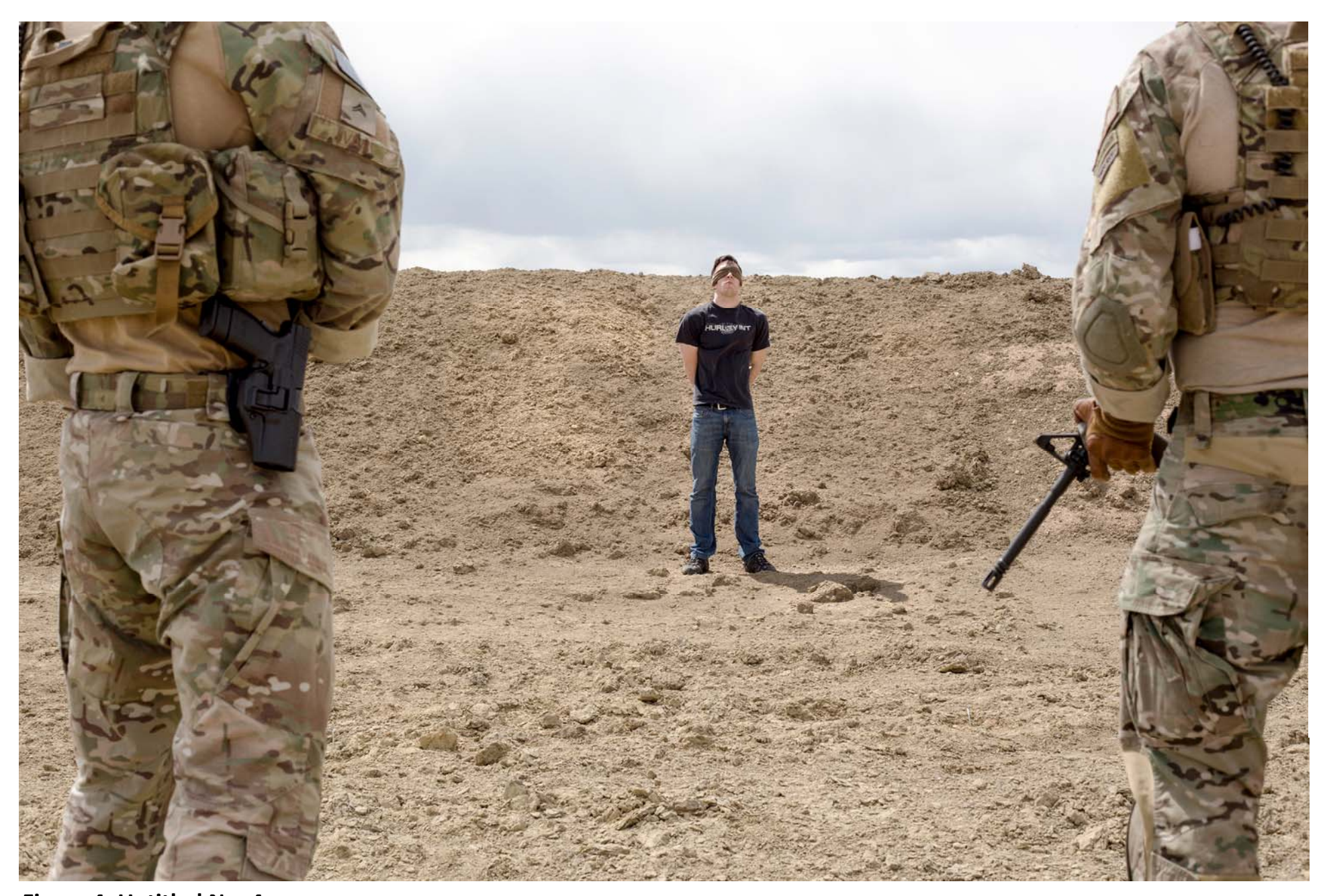
Figure 4: Untitled No. 4.