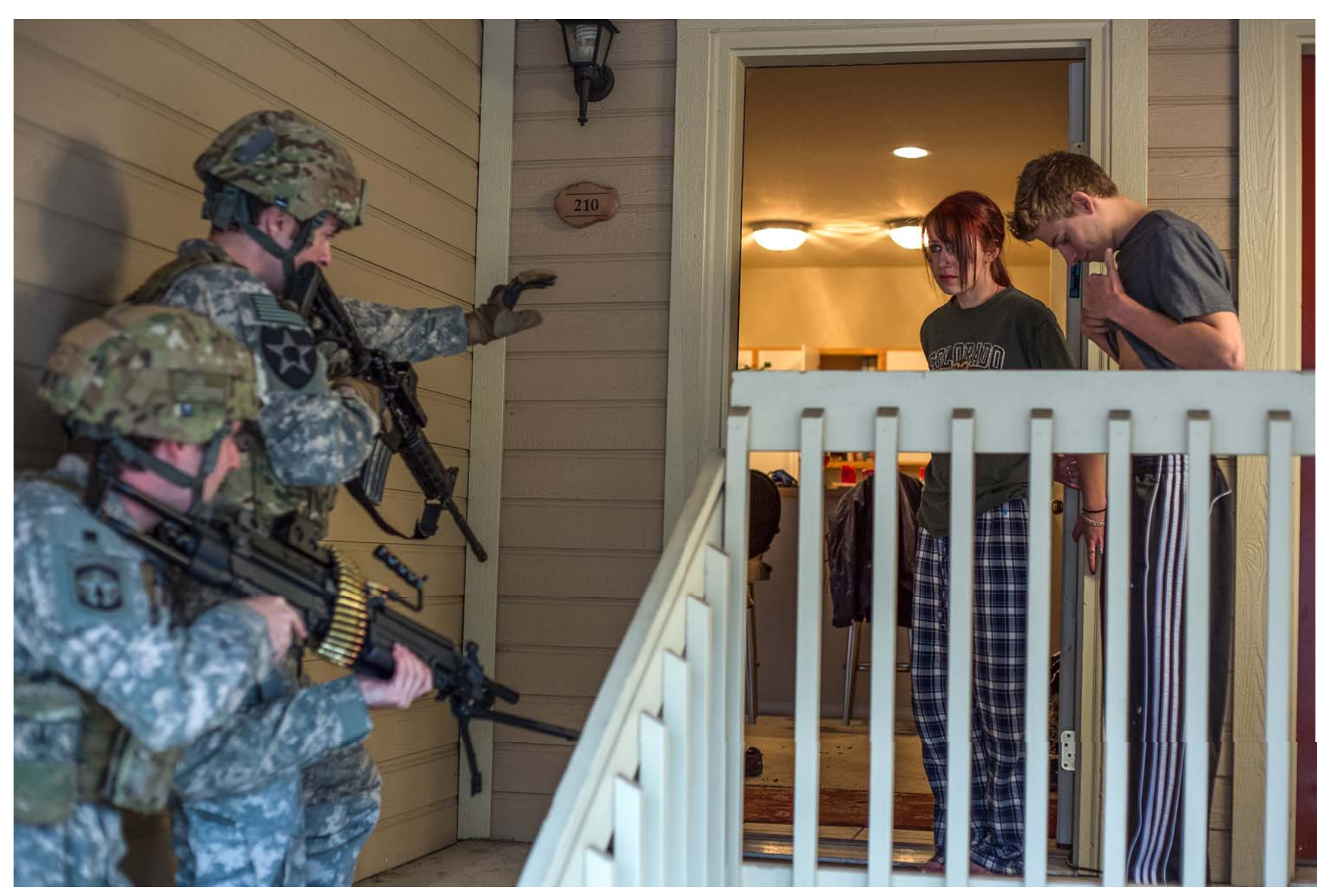
Figure 9: Untitled No. 9.