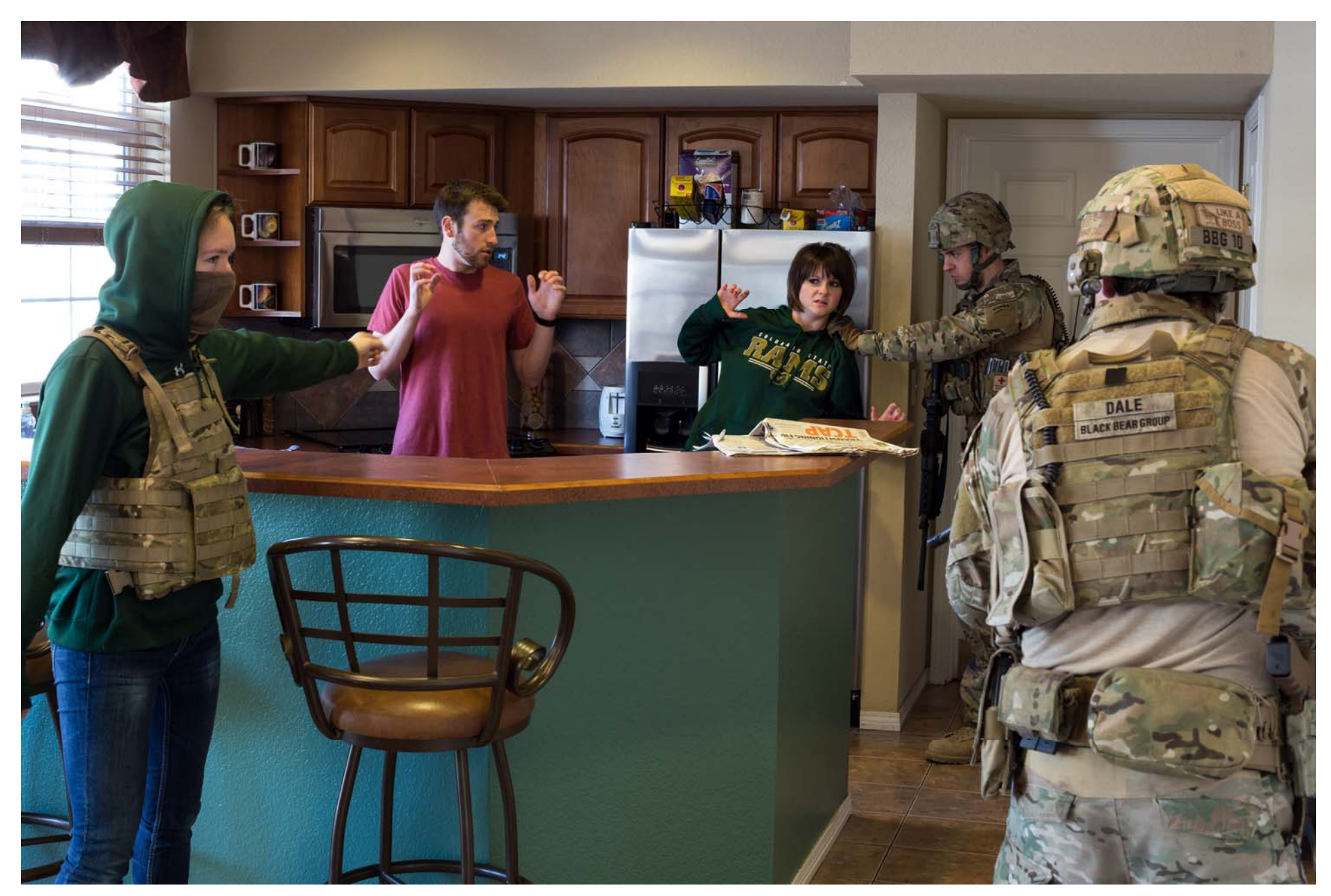
Figure 7: Untitled No. 7.