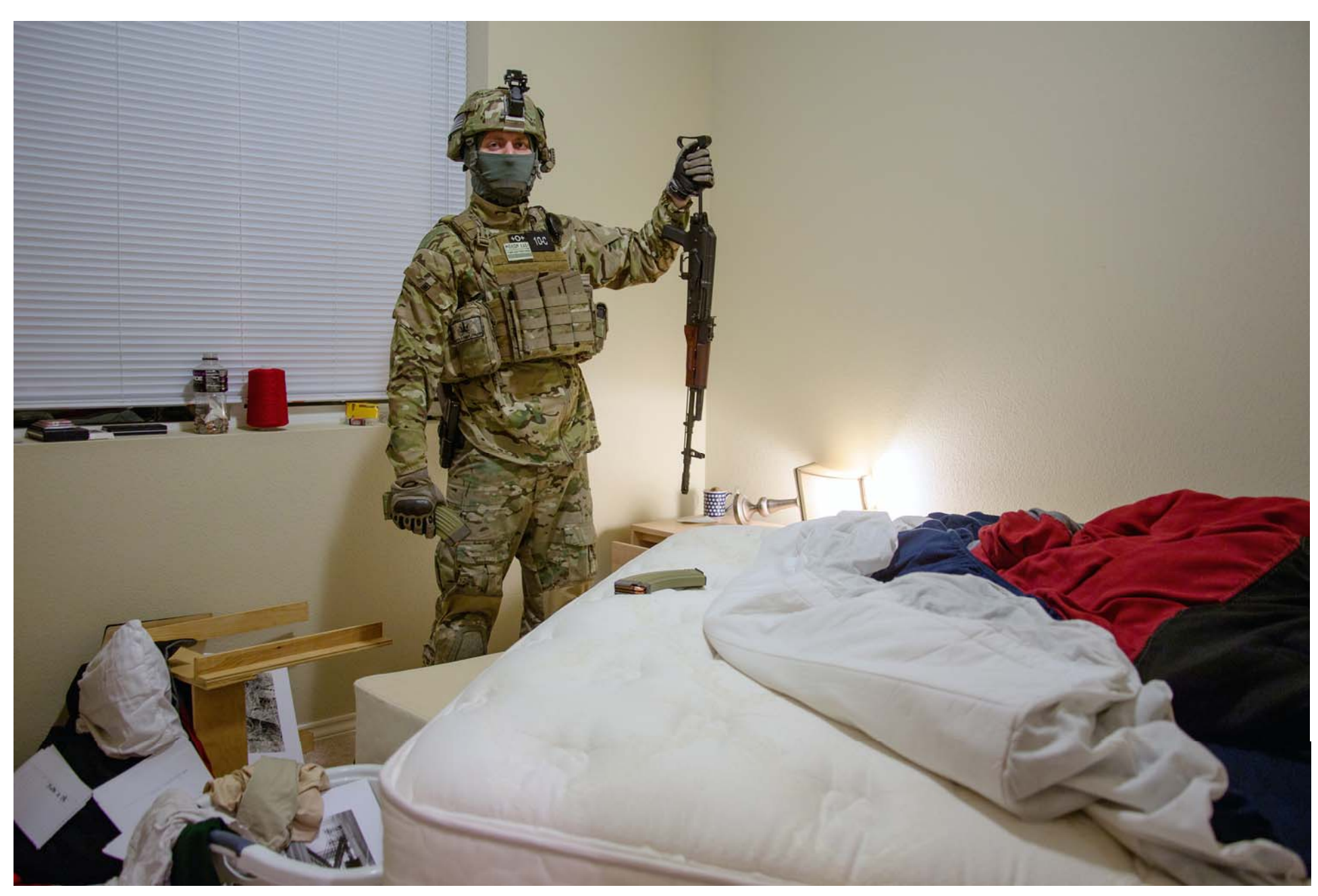
Figure 5: Untitled No. 5.