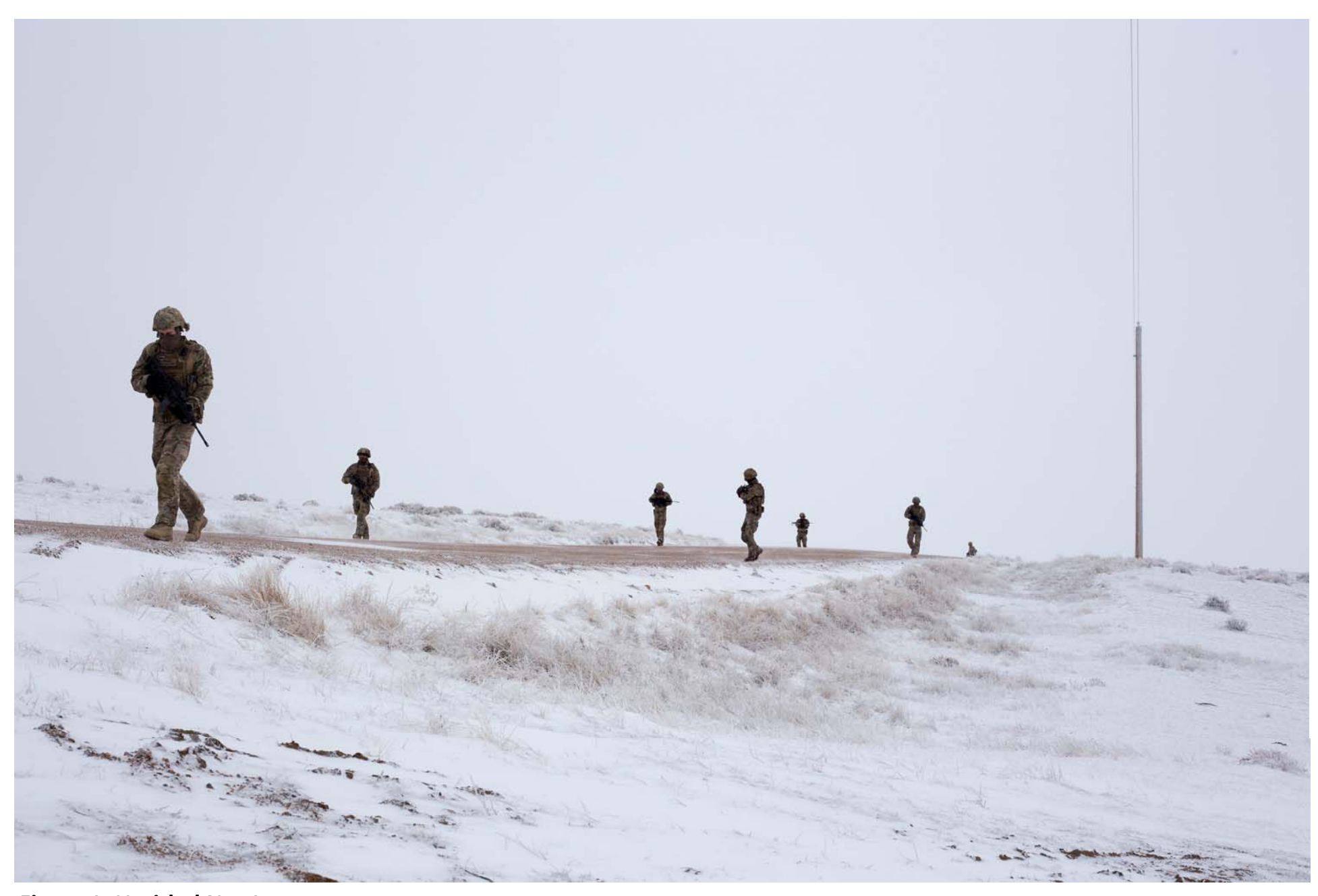
Figure 1: Untitled No. 1.