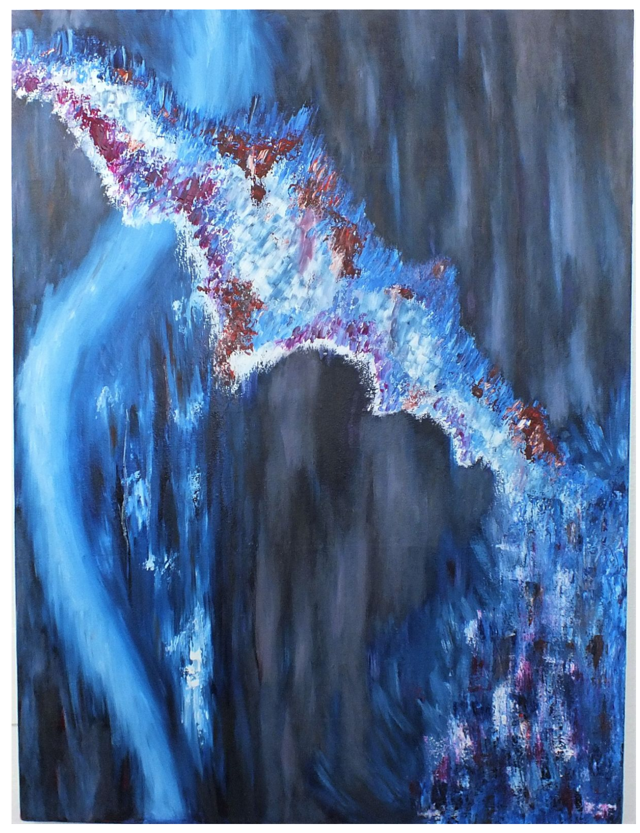
Figure 2: Glass Bridge