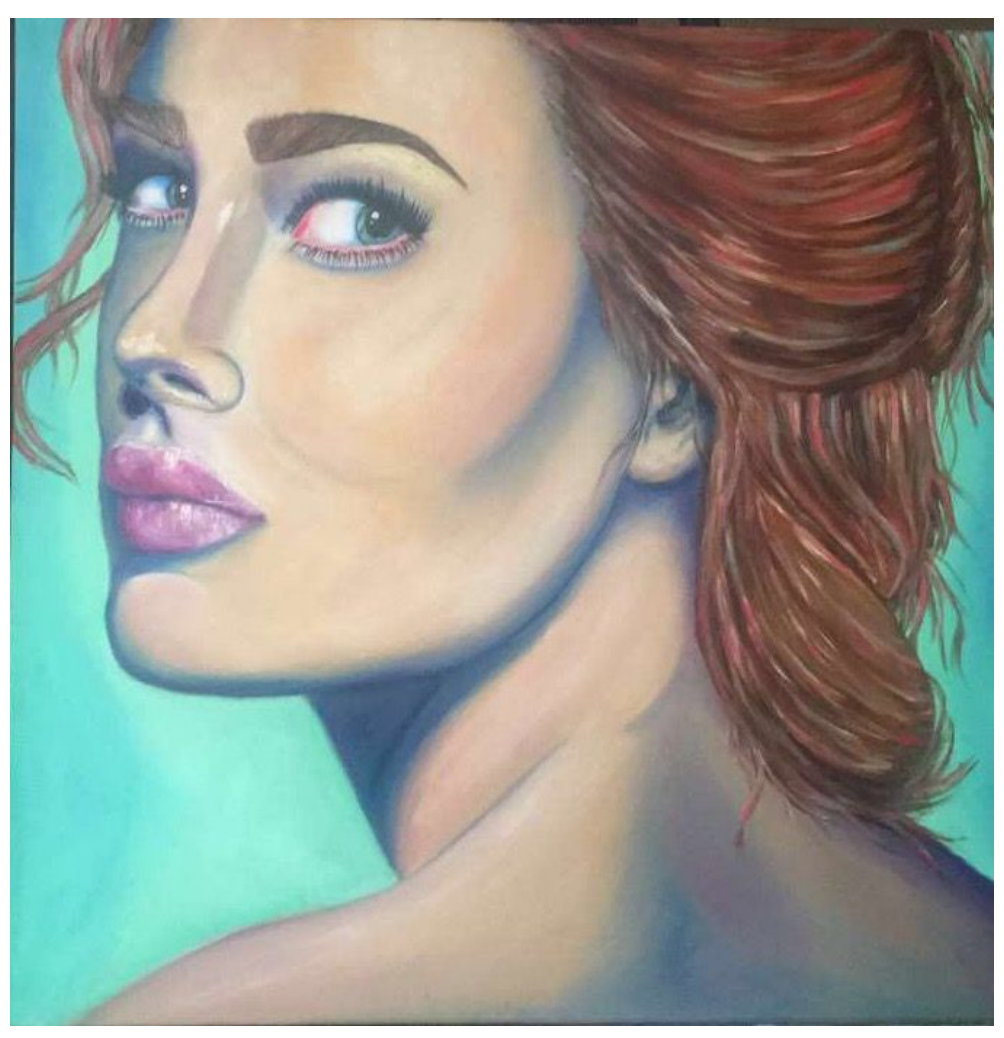
Figure 10: Untitled (Woman)