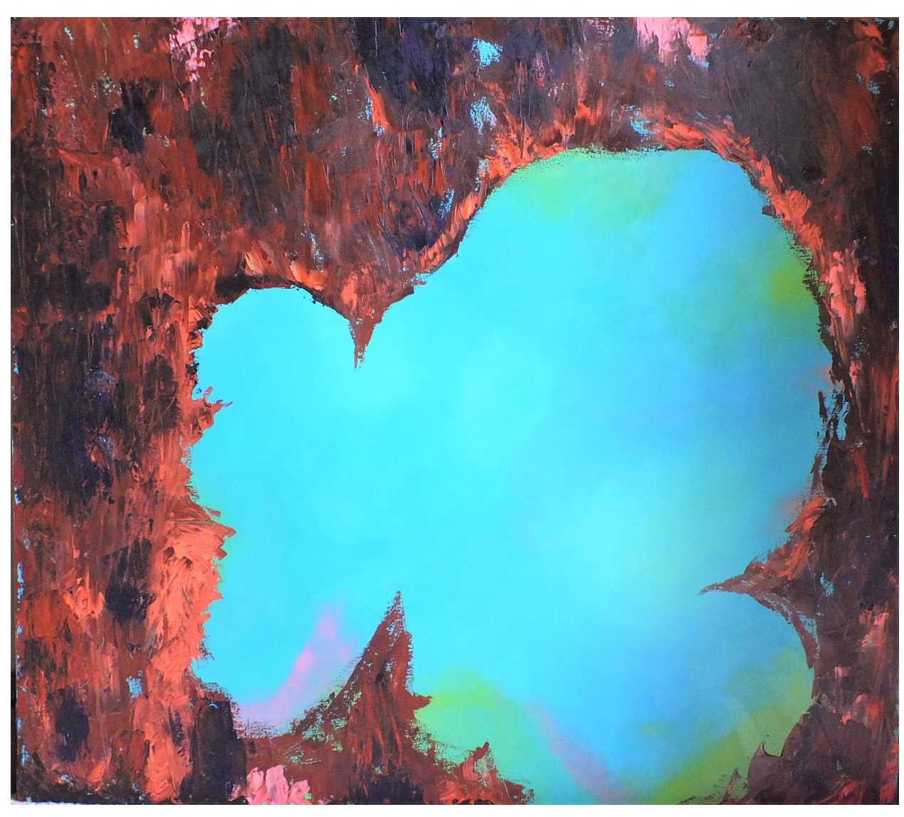
Figure 3: Peaking Sky