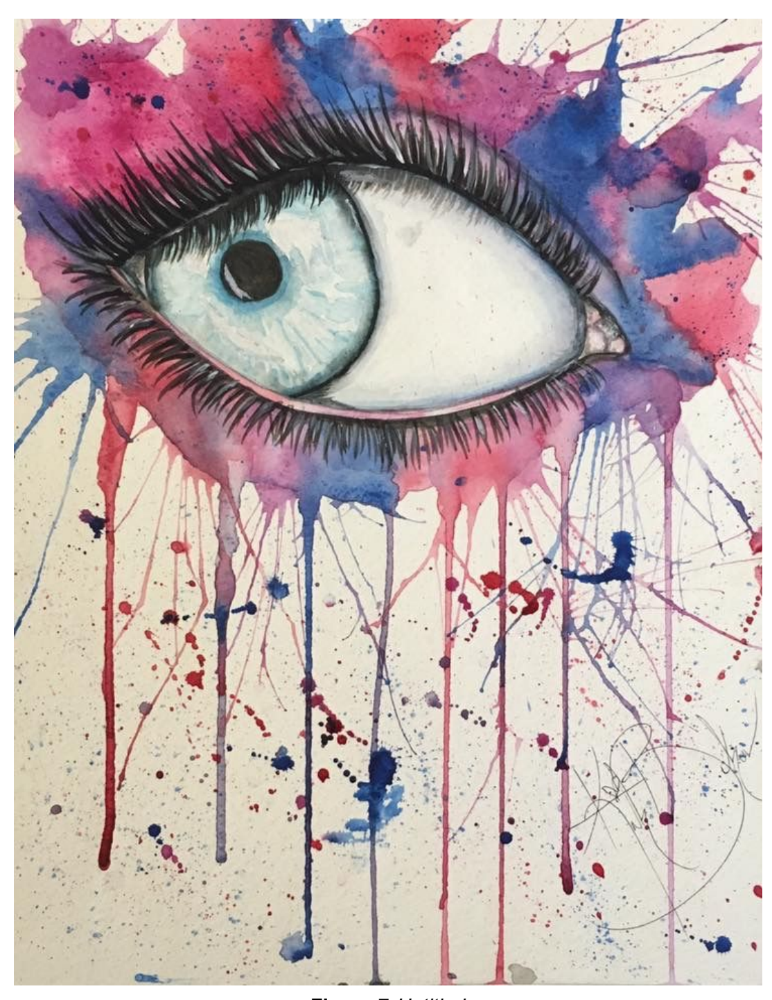
Figure 7: Untitled