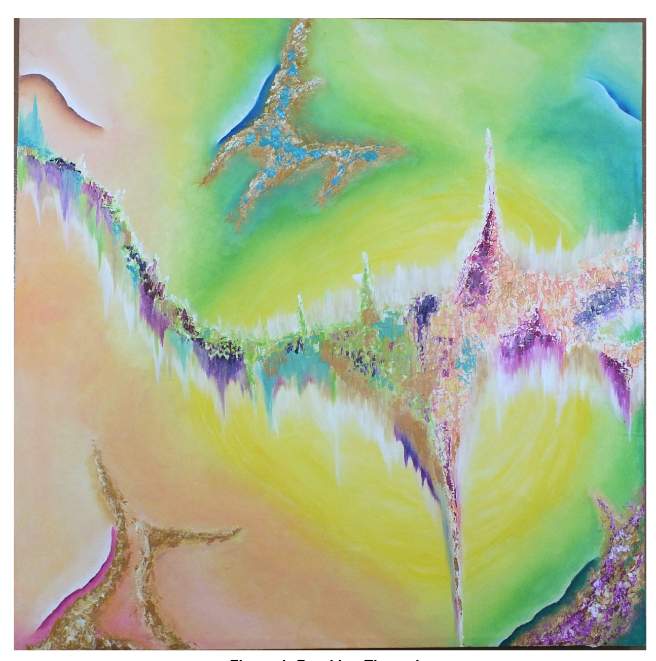
Figure 1: Breaking Through