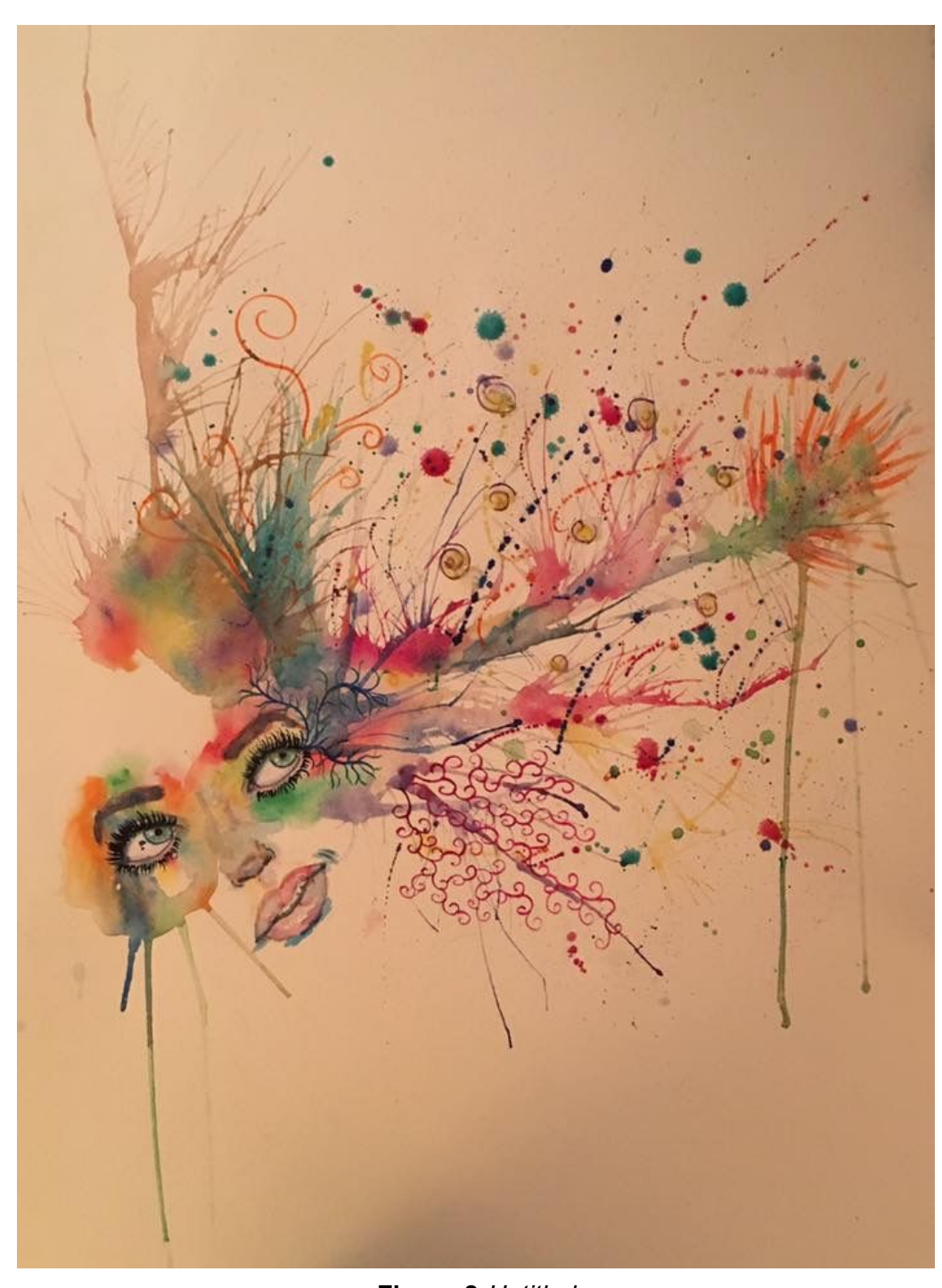
Figure 8: Untitled