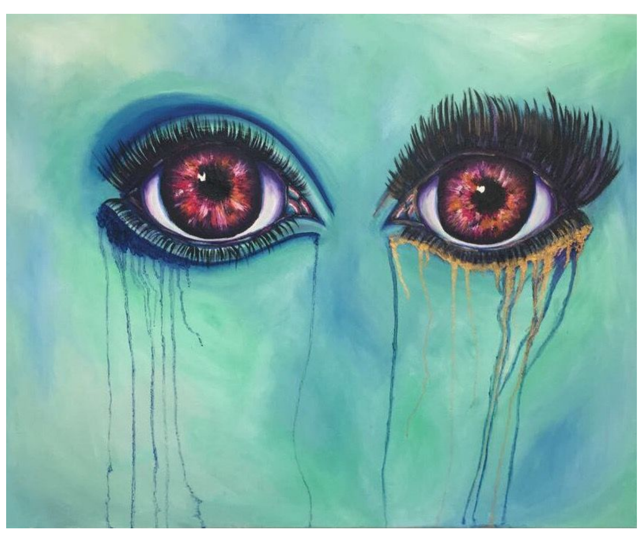
Figure 9:Untitled (Eyes)