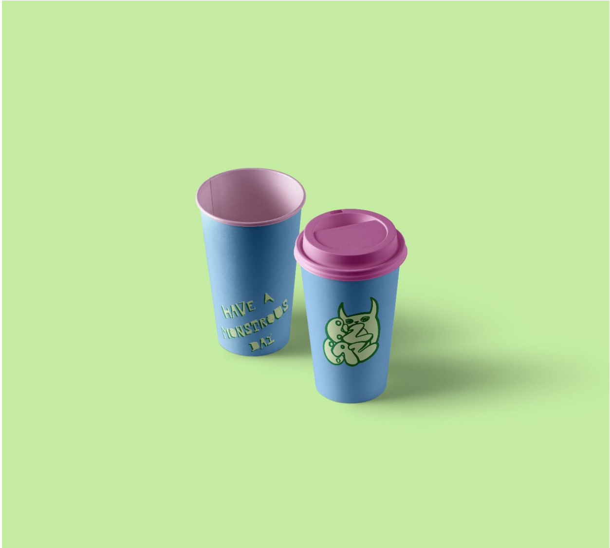
Figure 2: BizBaz Coffee