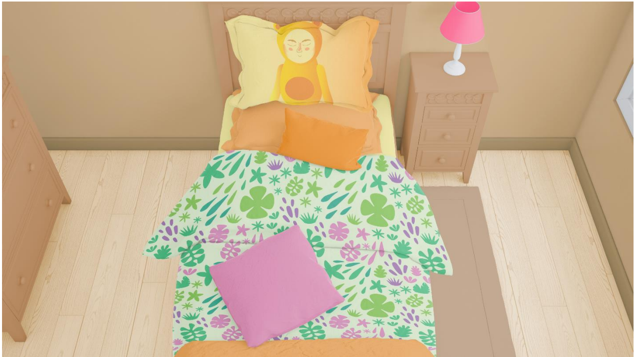
Figure 5: Jungalow Kids Bed Set