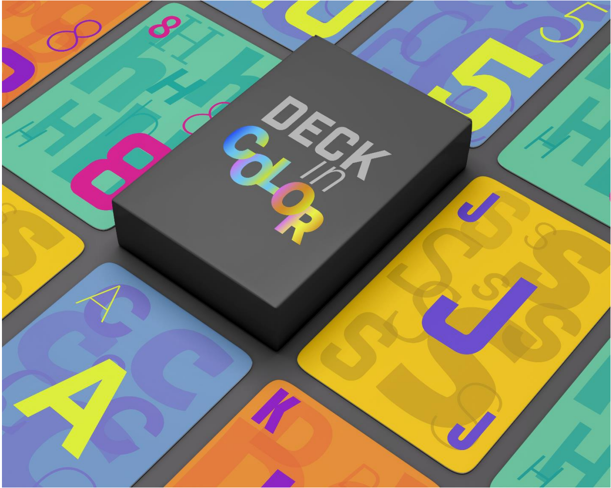
Figure 4: Card Deck