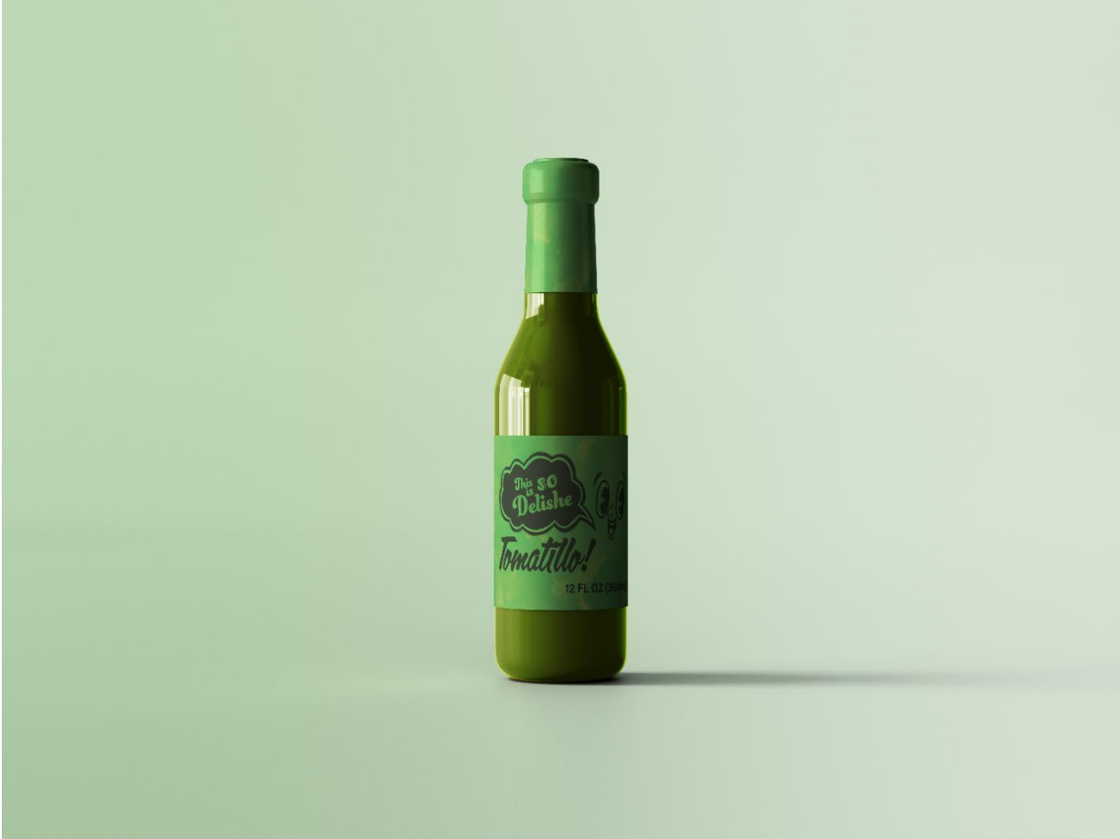
Figure 1: Hot Sauce