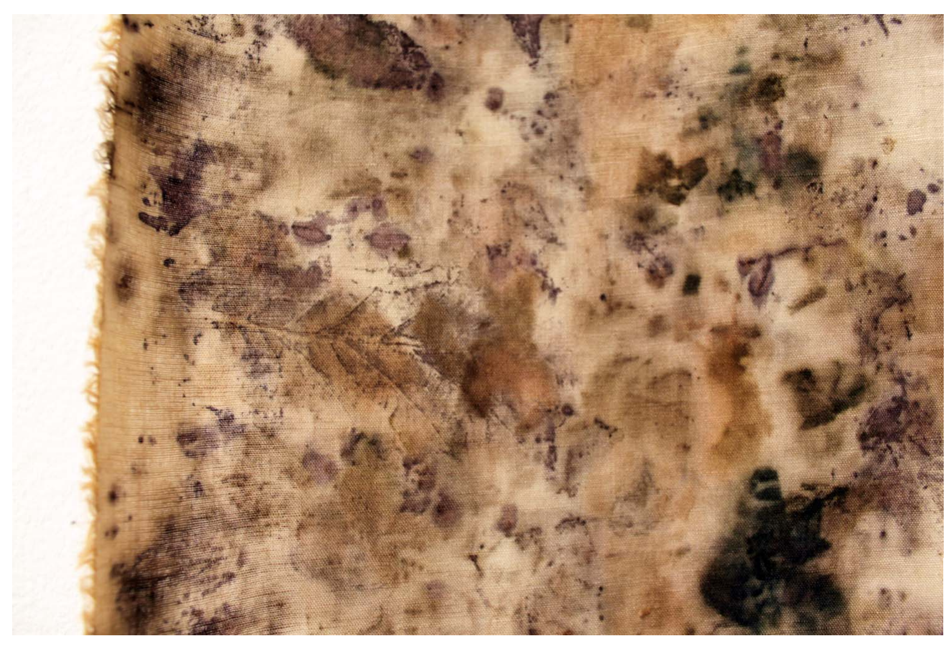
Figure 14: Eco-Print Scarf Series, Fall Scarf, detail.