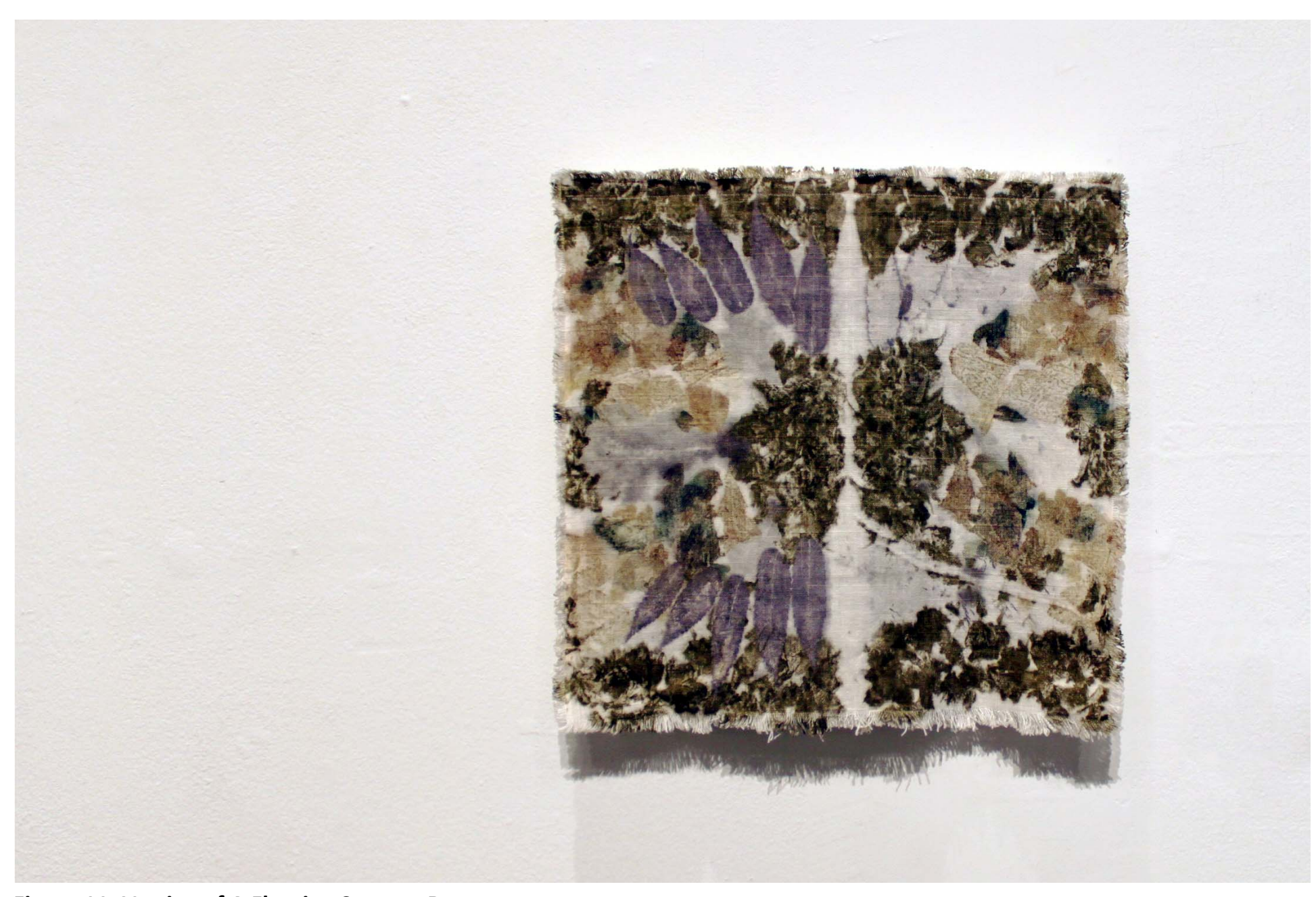
Figure 11: Vestige of A Fleeting Season: Retreat.