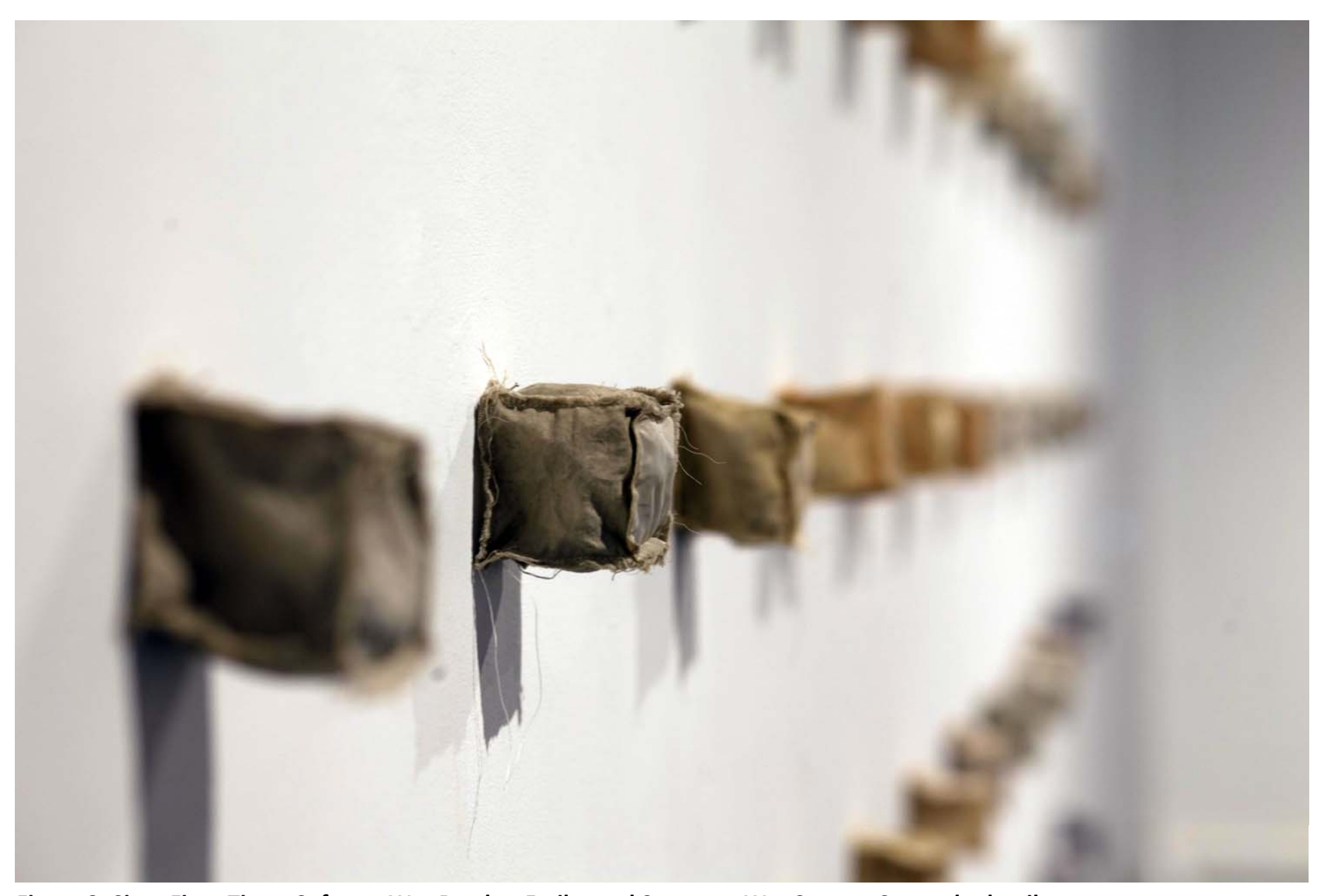
Figure 2: Sixty-Fives Times Softness Was Read as Frailty and Structure Was Seen as Strength, detail.