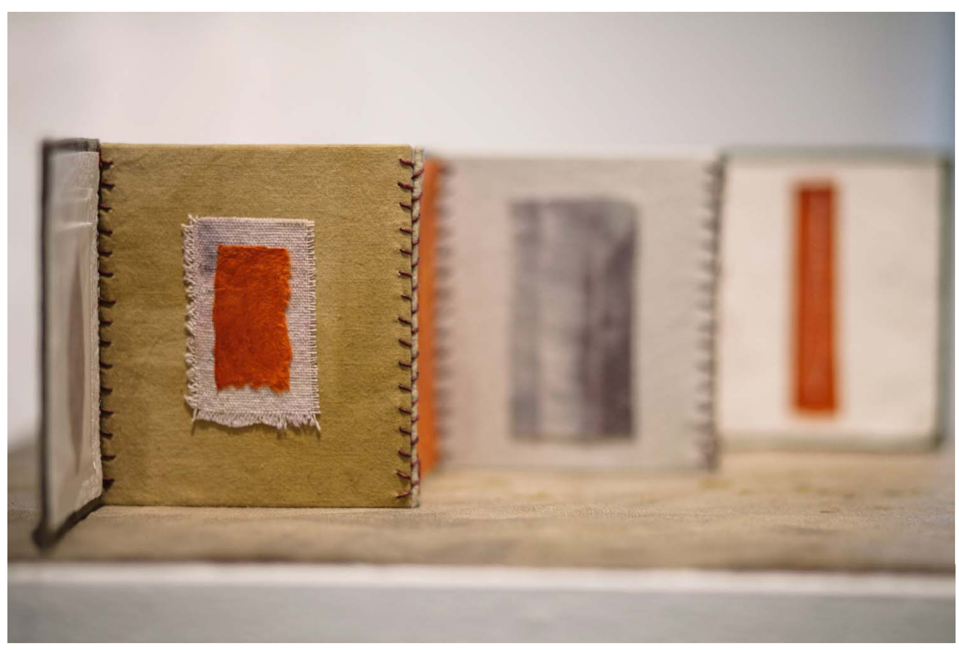
Figure 9: Soft Earth Memory Vessel, detail.