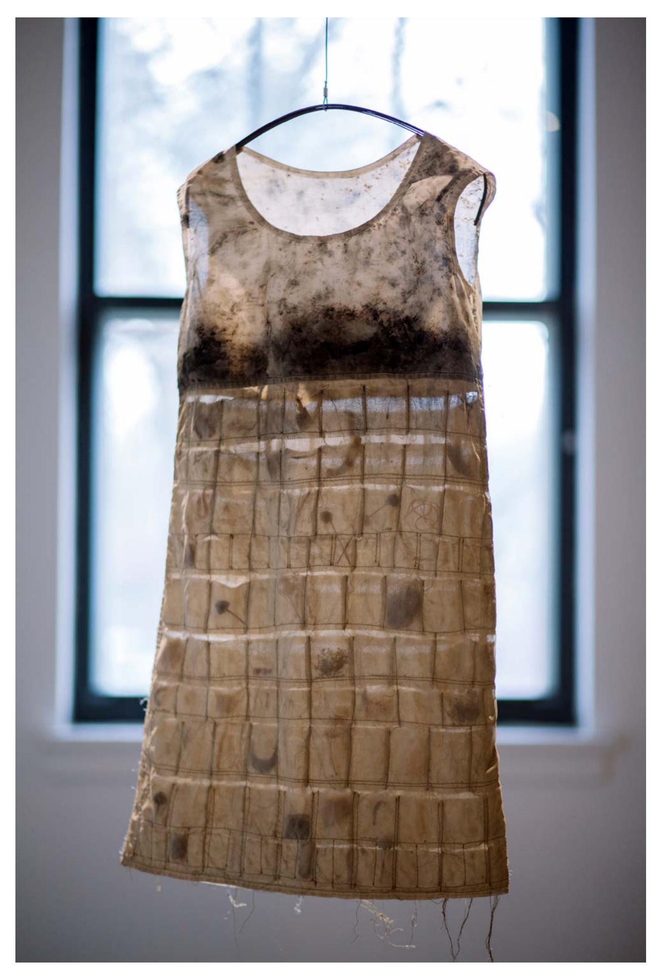
Figure 4: Letting Go of Holding On.