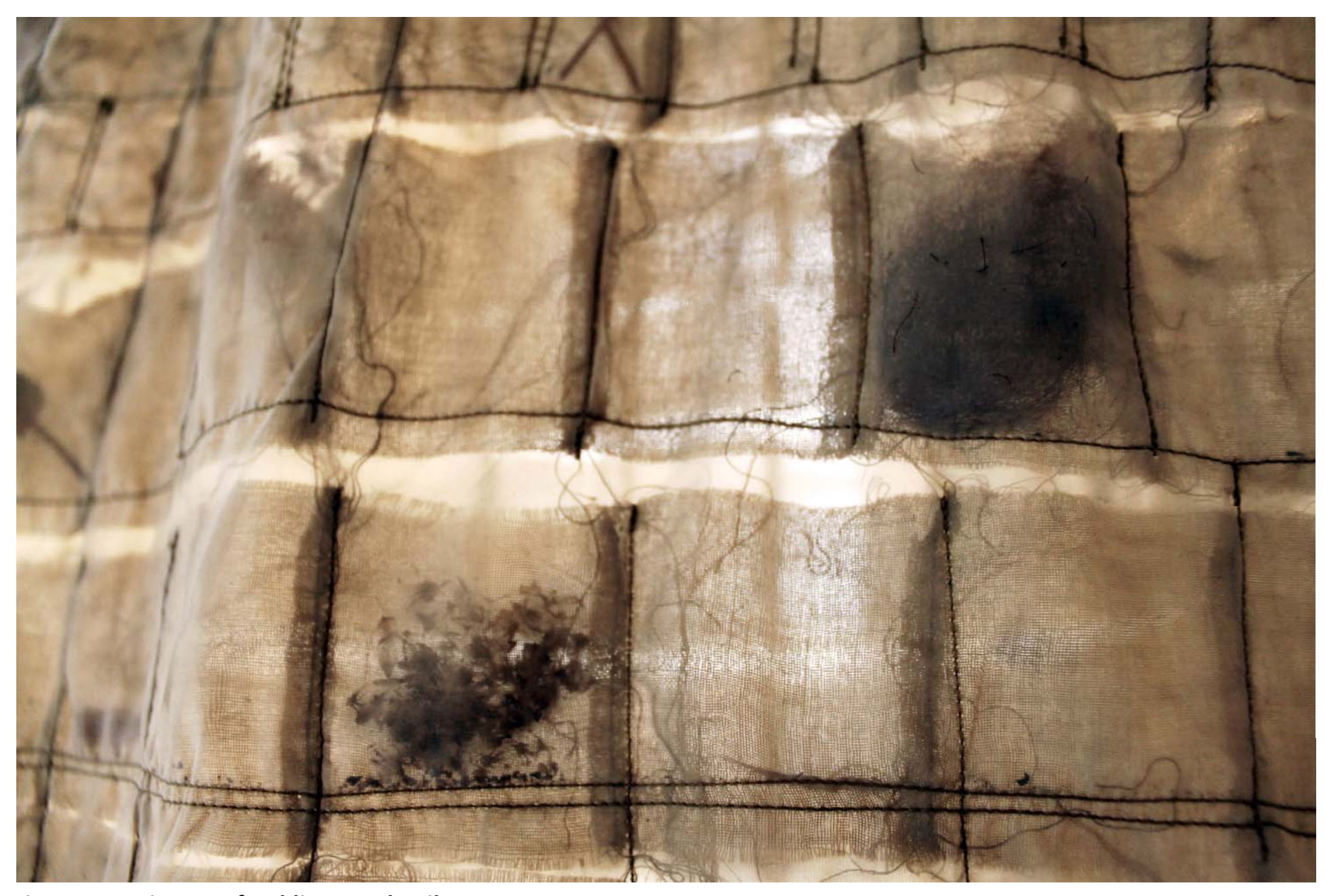
Figure 6: Letting Go of Holding On, detail.