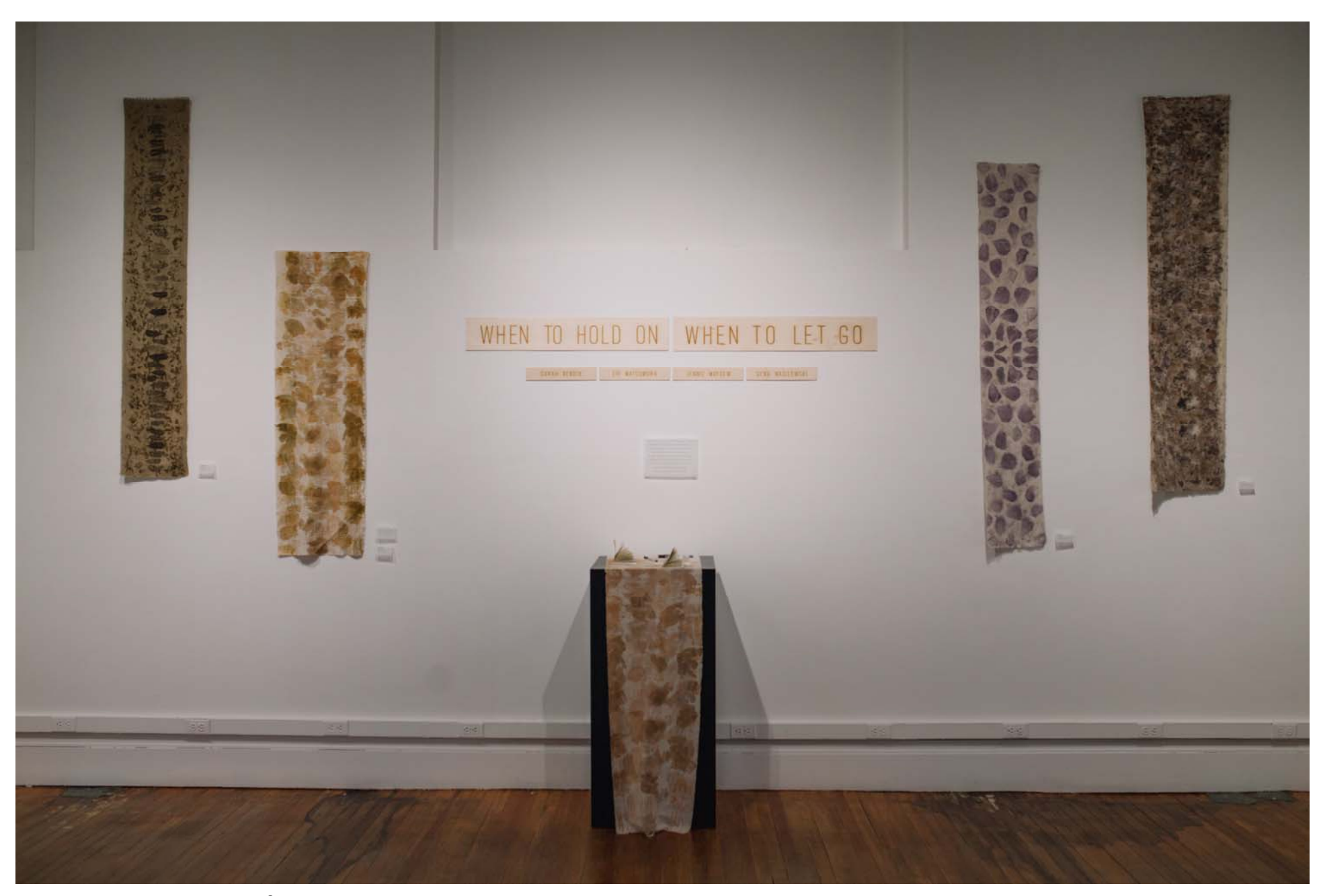
Figure 13: Eco-Print Scarf Series.