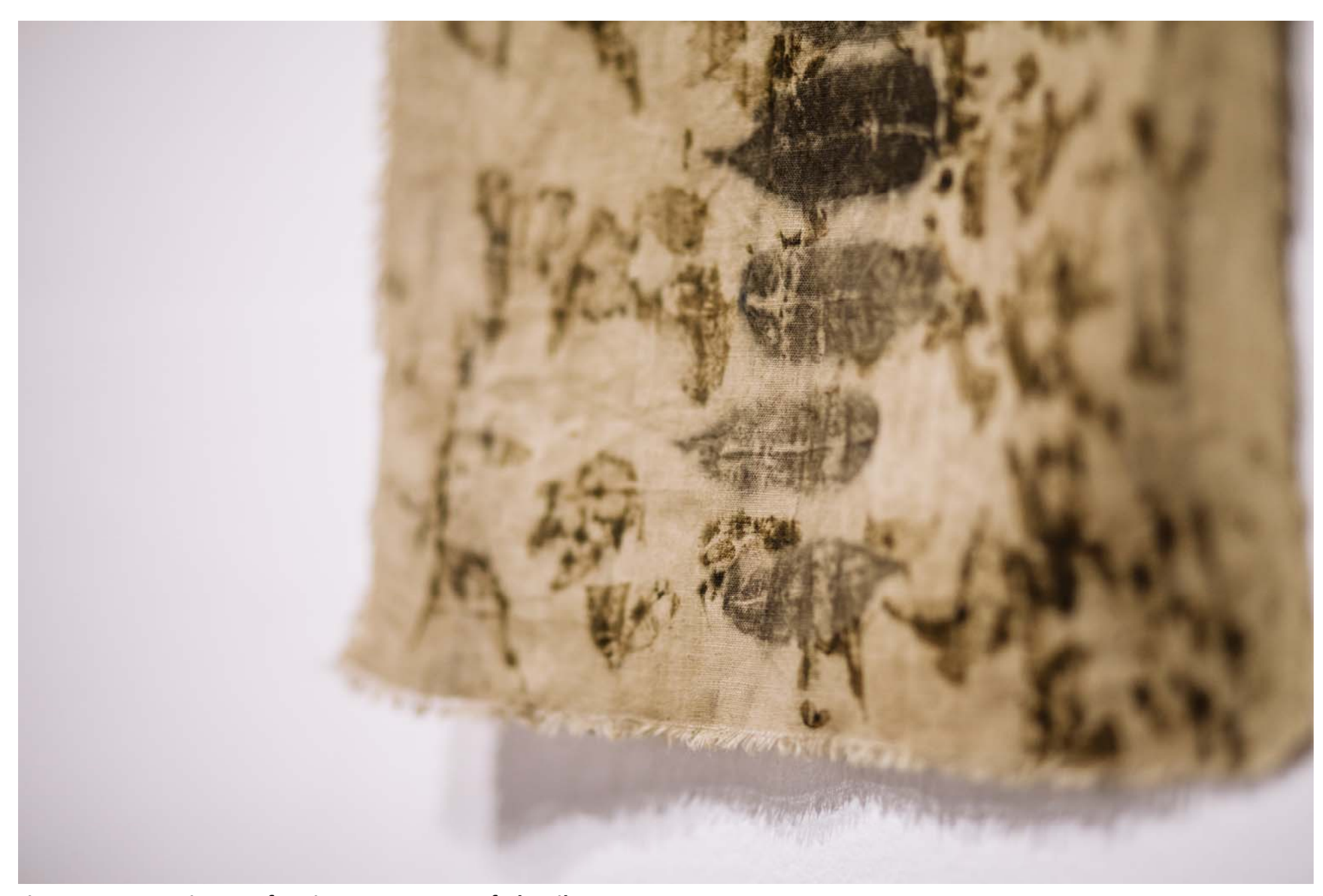
Figure 15: Eco-Print Scarf Series, Summer Scarf, detail.