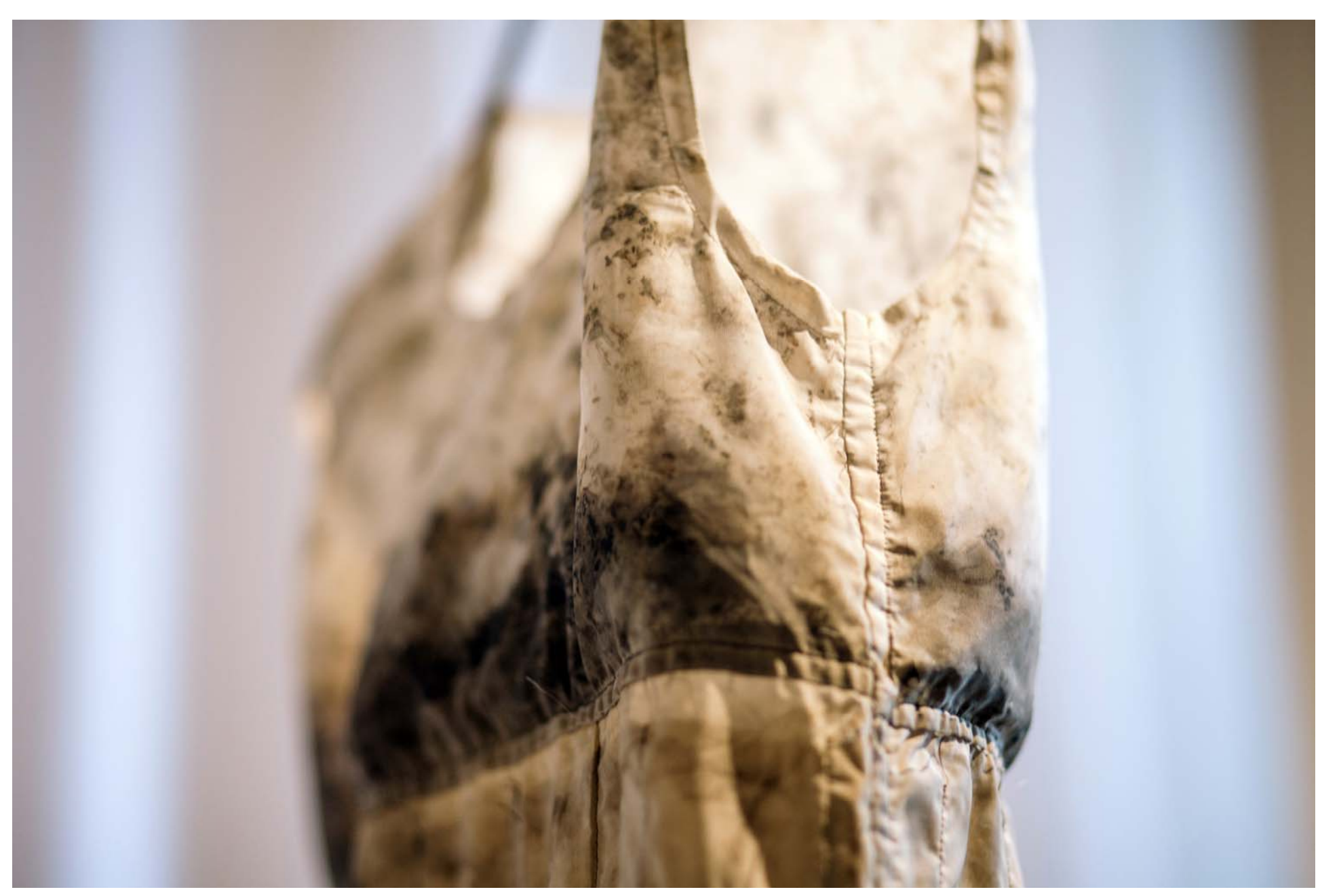
Figure 5: Letting Go of Holding On, detail.