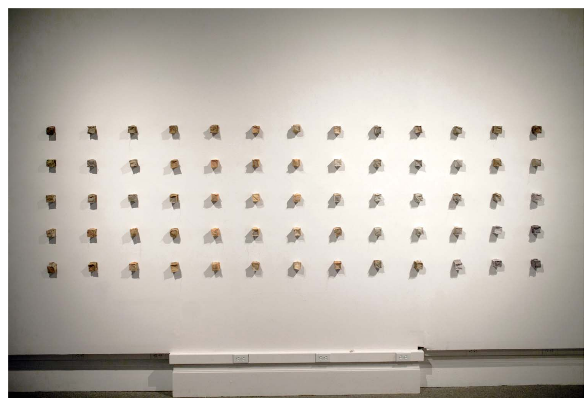
Figure 1: Sixty-Fives Times Softness Was Read as Frailty and Structure Was Seen as Strength.