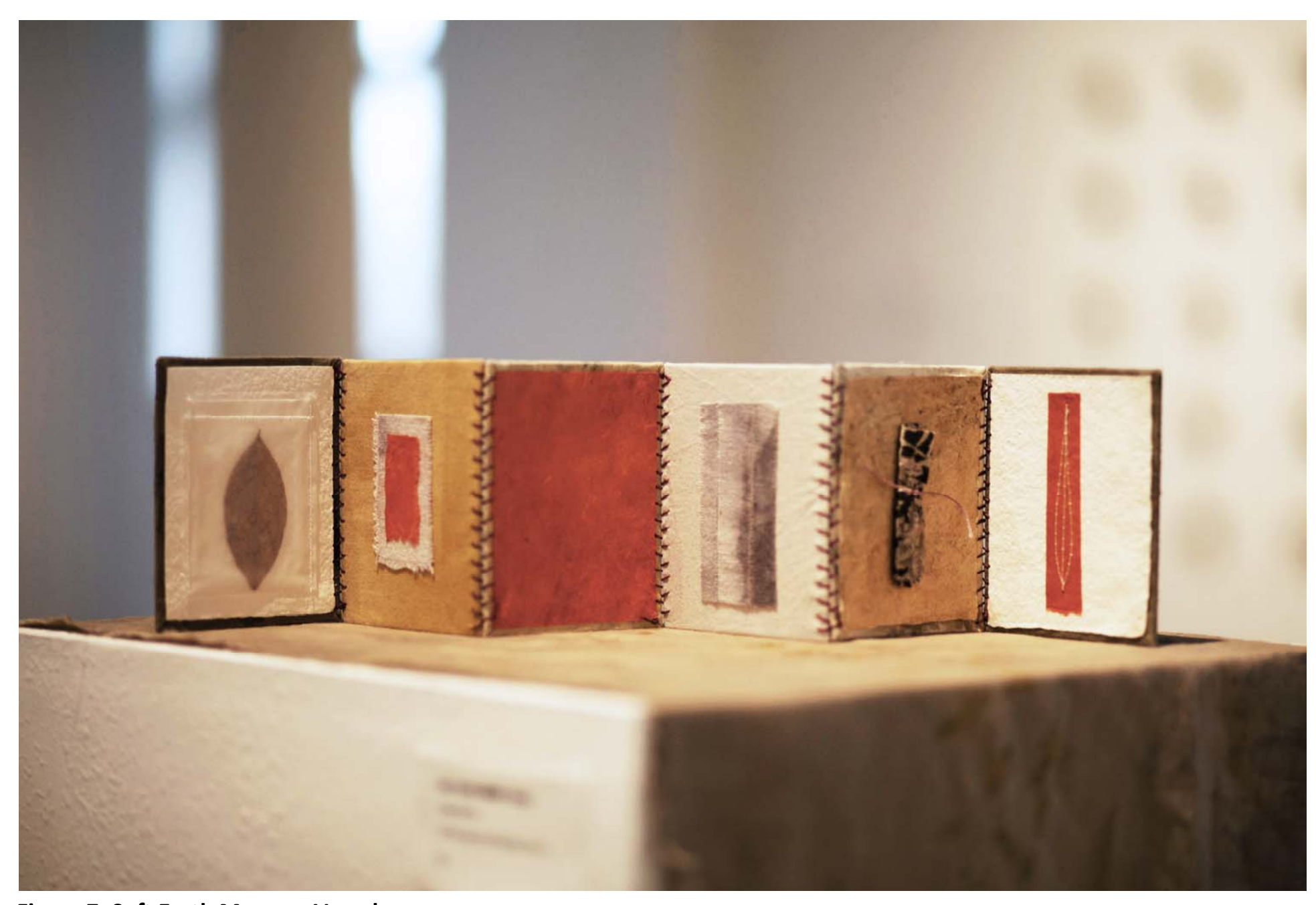
Figure 7: Soft Earth Memory Vessel.