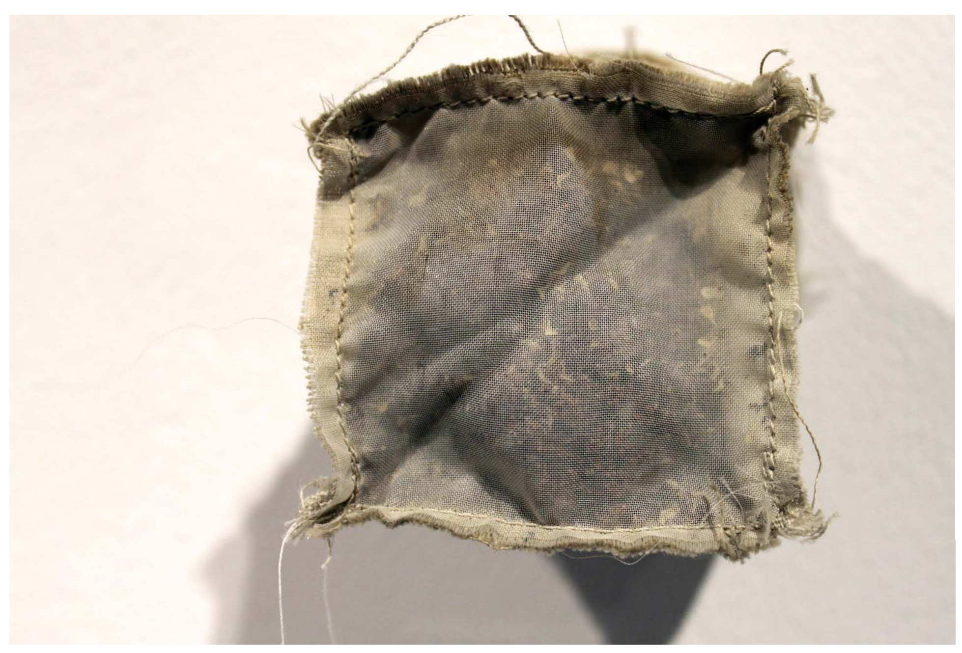
Figure 3: Sixty-Fives Times Softness Was Read as Frailty and Structure Was Seen as Strength, detail.