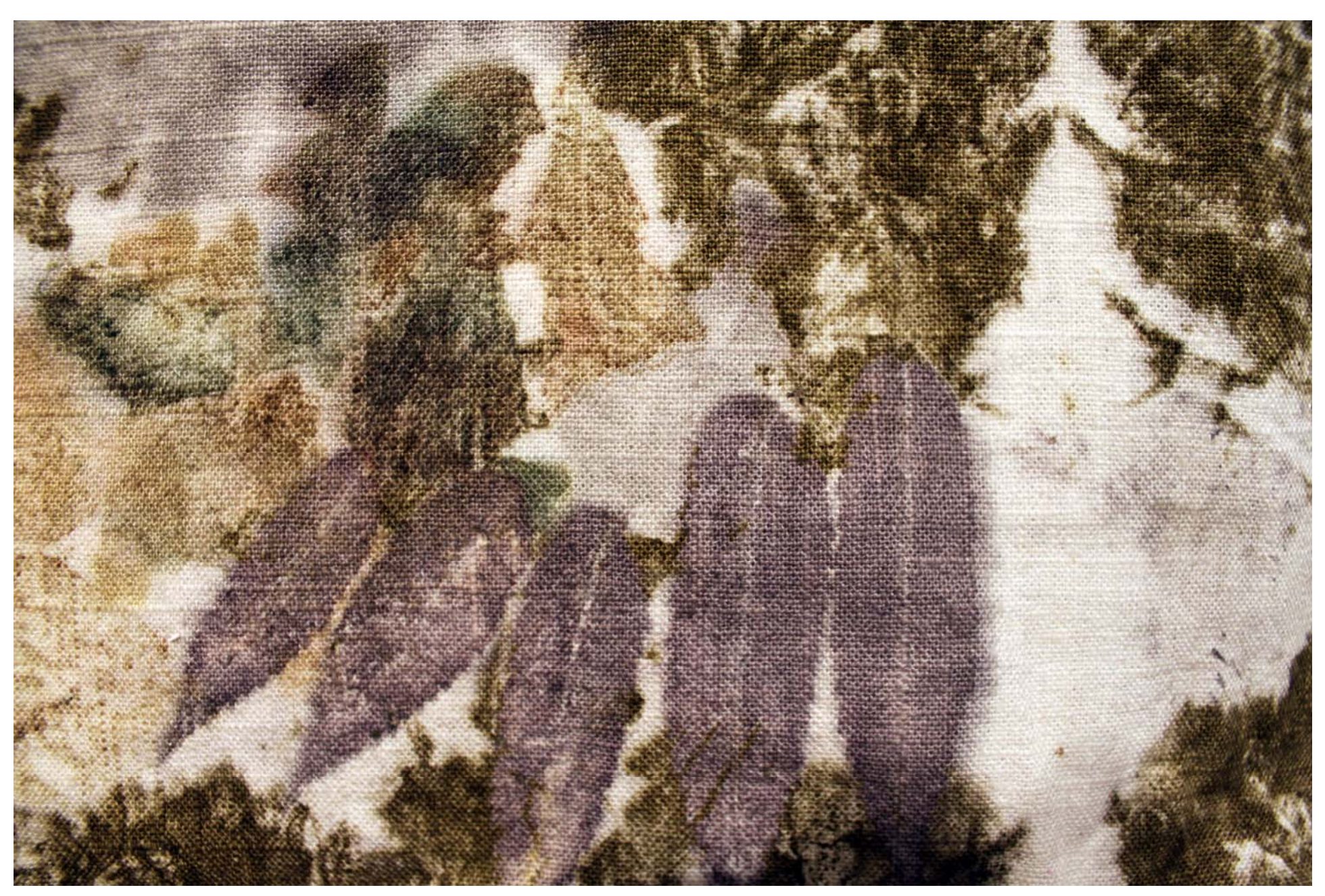
Figure 10: Vestige of A Fleeting Season: Retreat, detail.