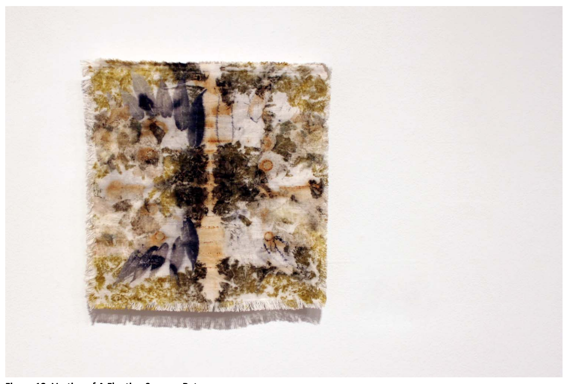
Figure 12: Vestige of A Fleeting Season: Return.