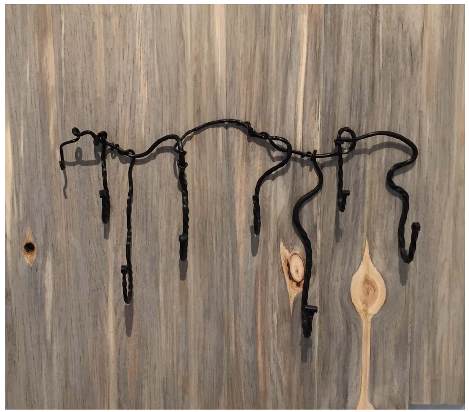
Figure 15: Forged Vine Hooks.