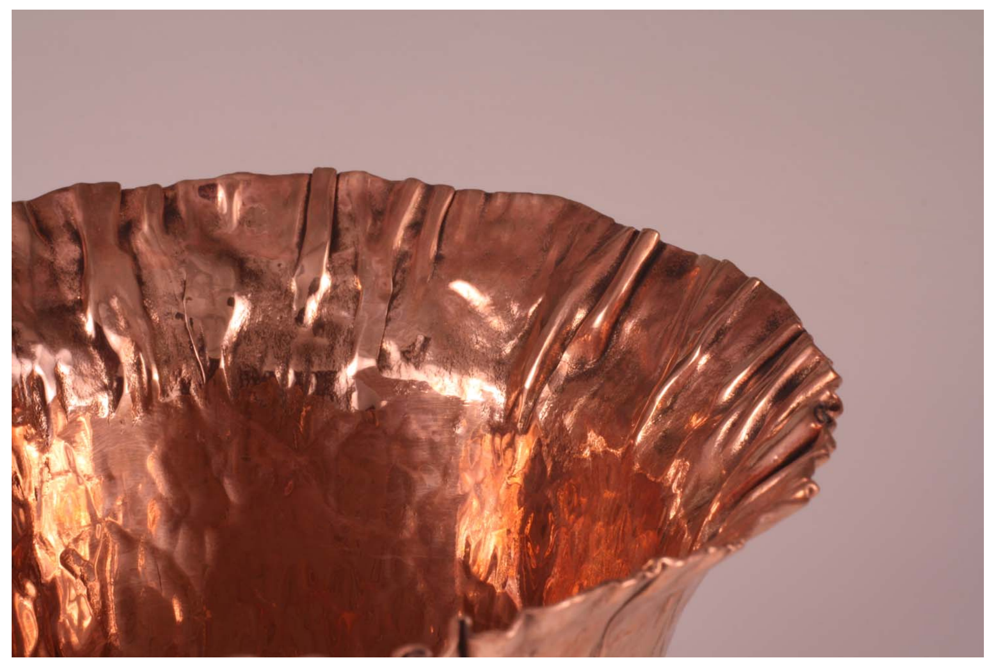
Figure 18: Stress Relief-detail.