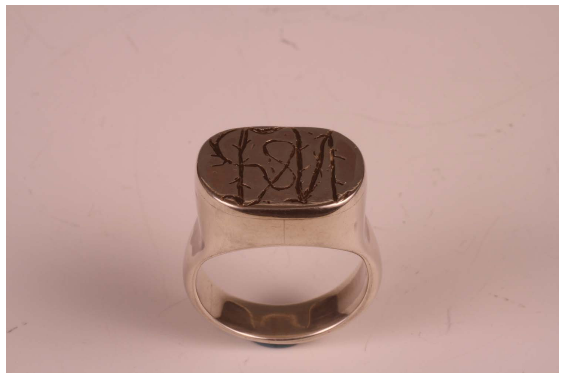
Figure 13: Wedding Invitation Signet Ring.