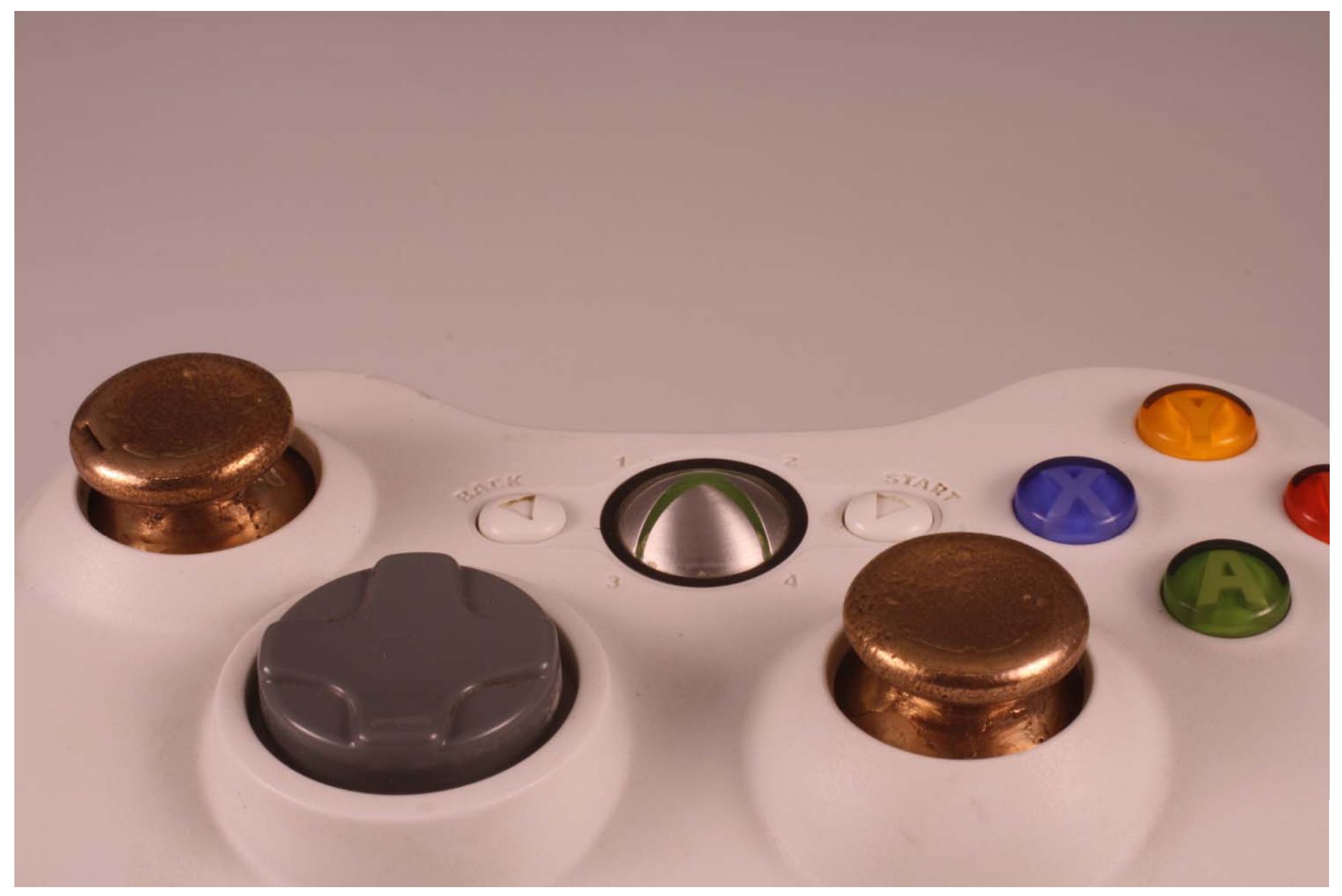
Figure 8: Brass Thumb Sticks - Detail.