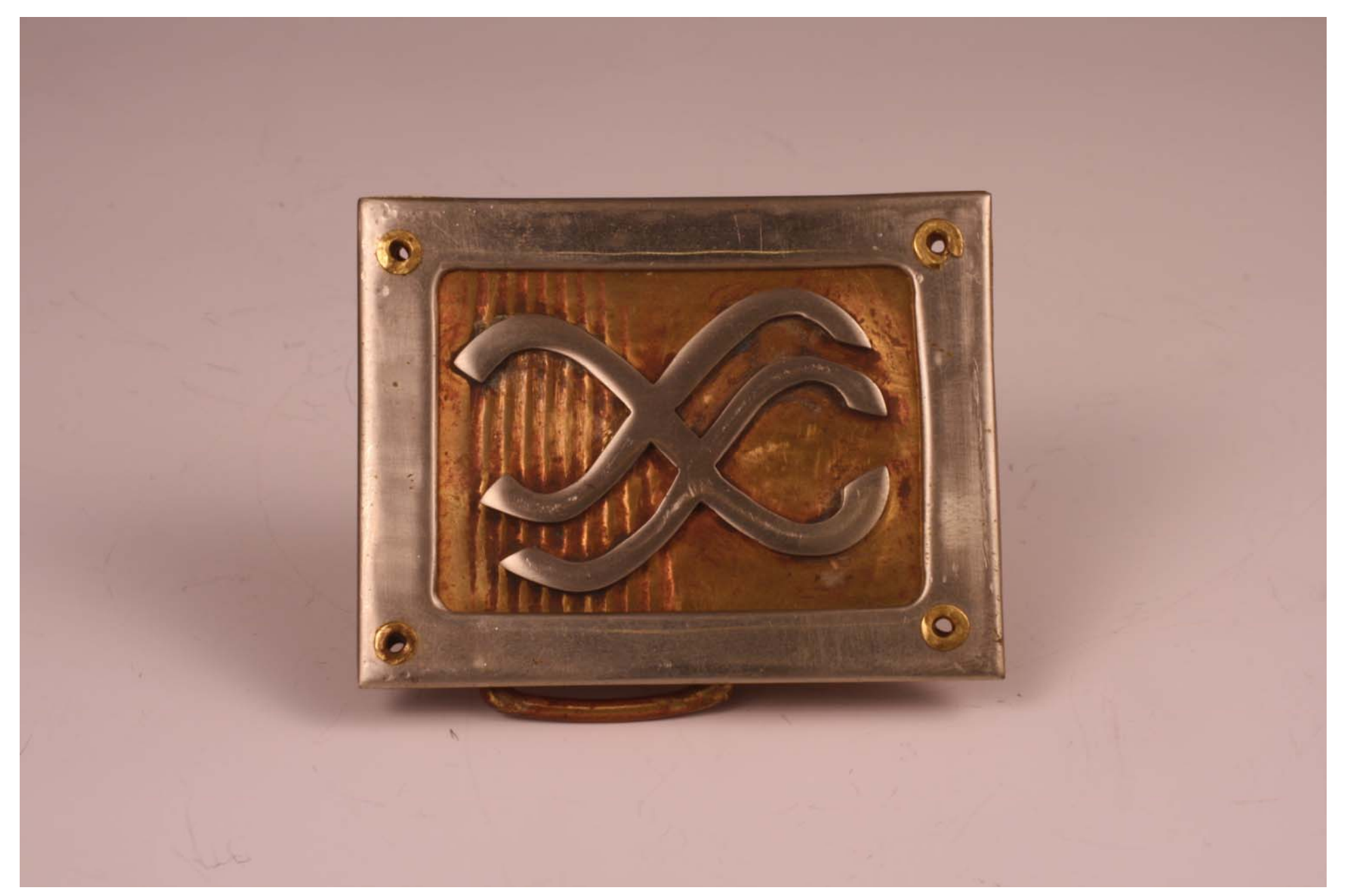
Figure 3: Rustic Country Buckle.