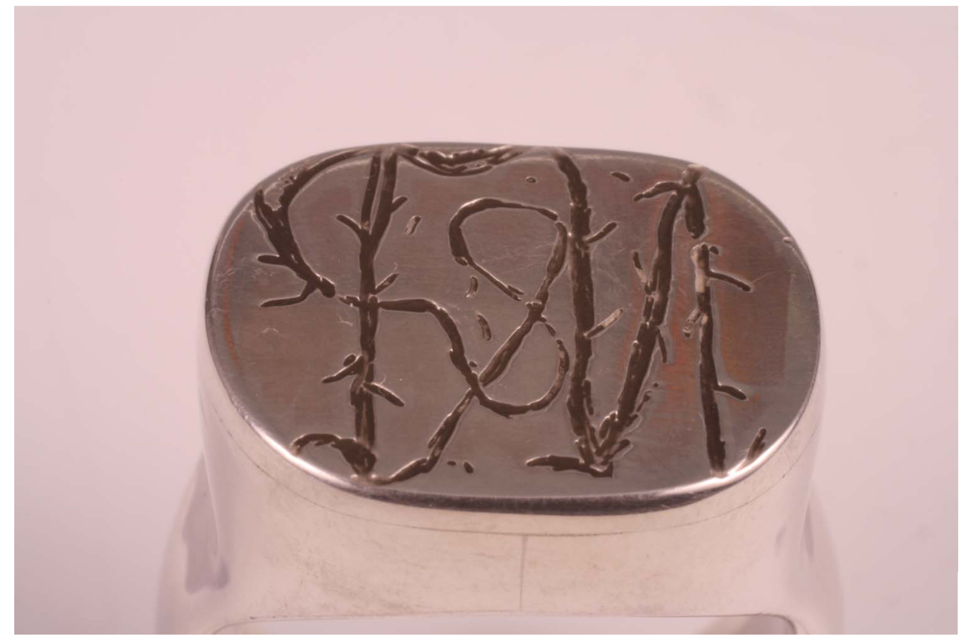
Figure 14: Wedding Invitation Signet Ring-detail.