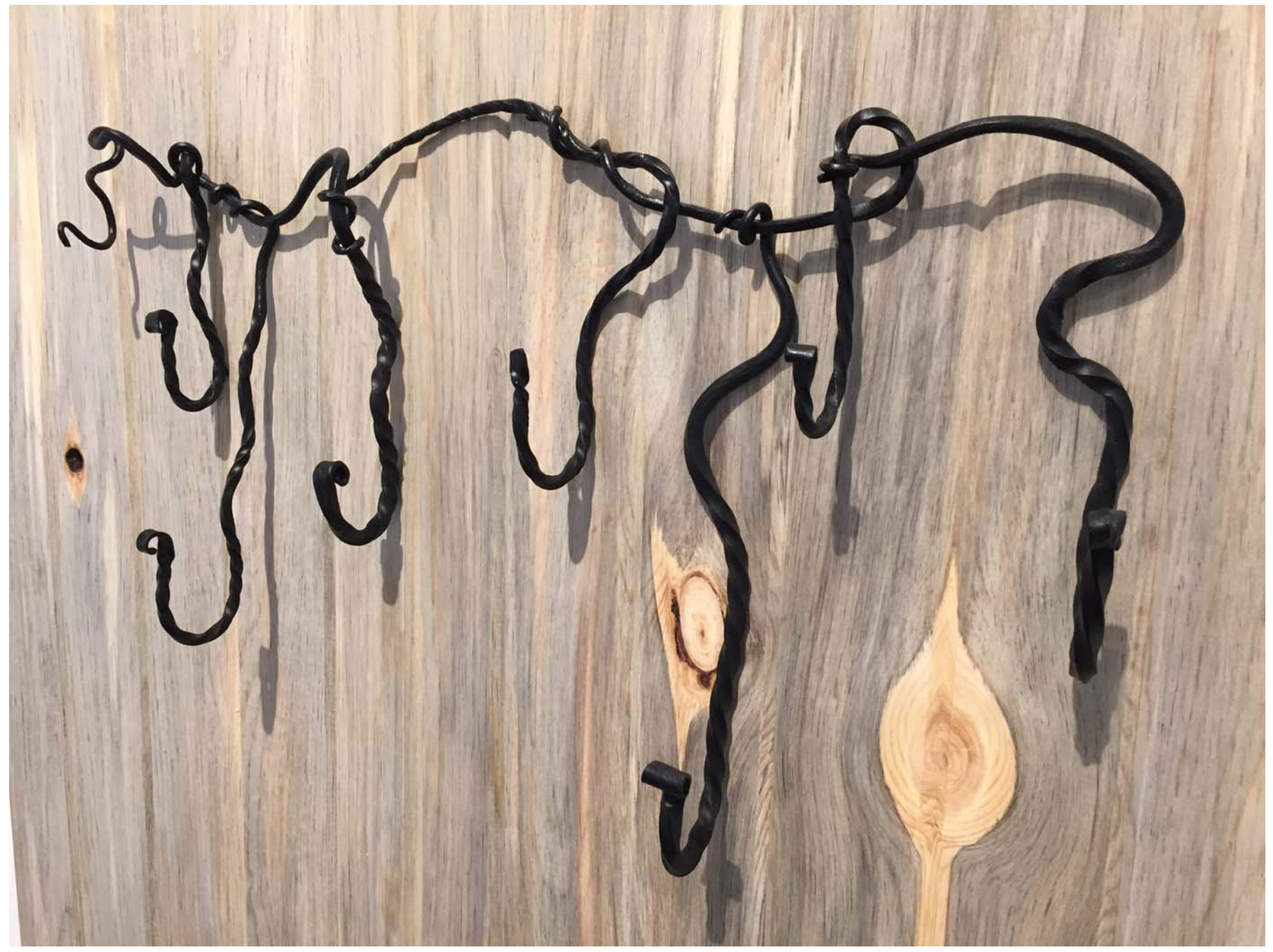
Figure 16: Forged Vine Hooks-detail.