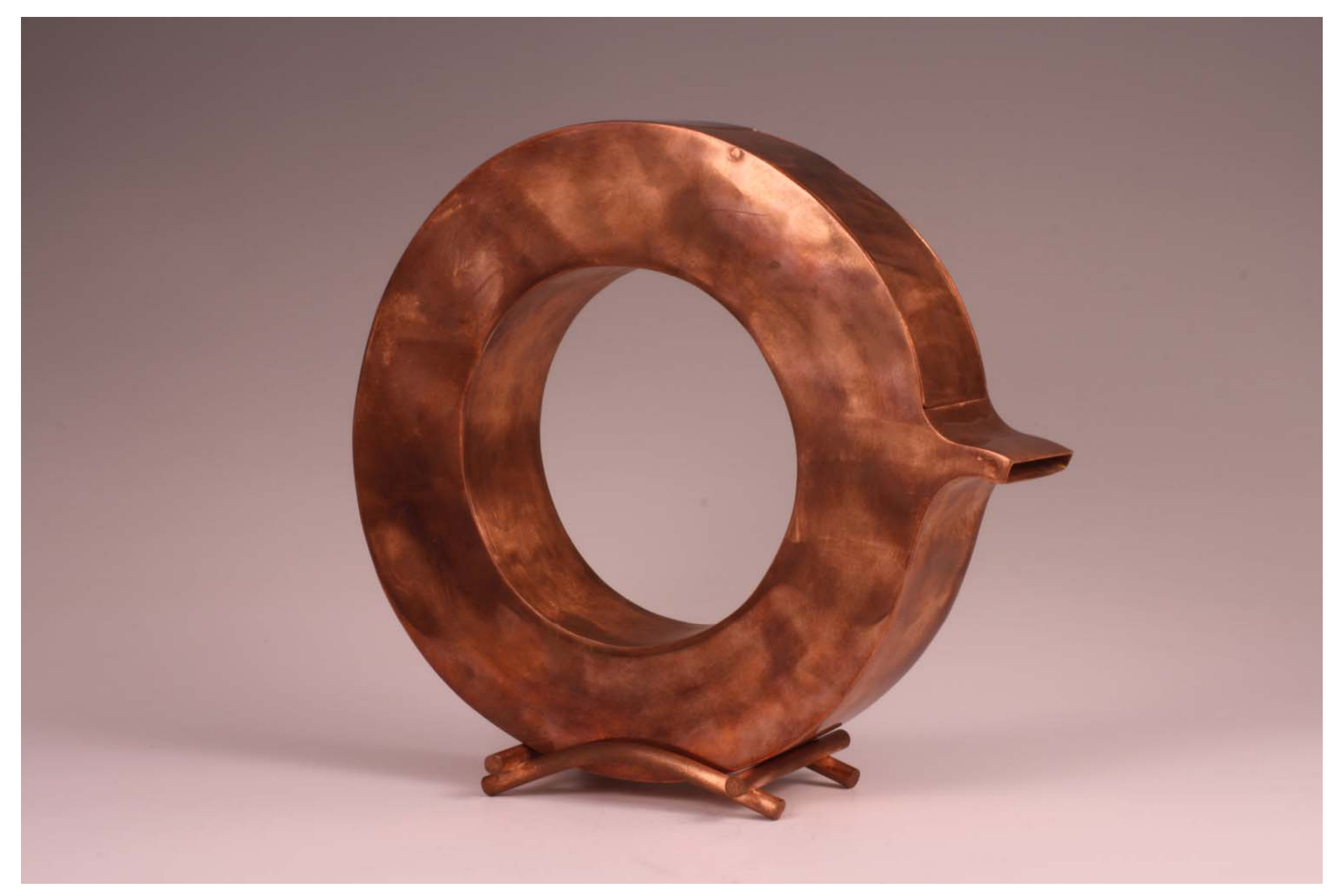
Figure 4: Copper Teapot.