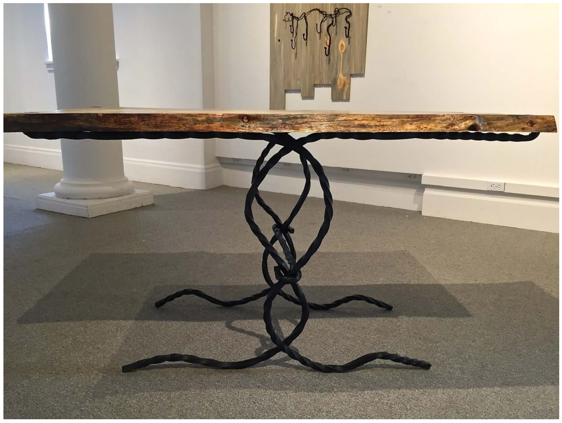
Figure 19: Forbidden Blue.