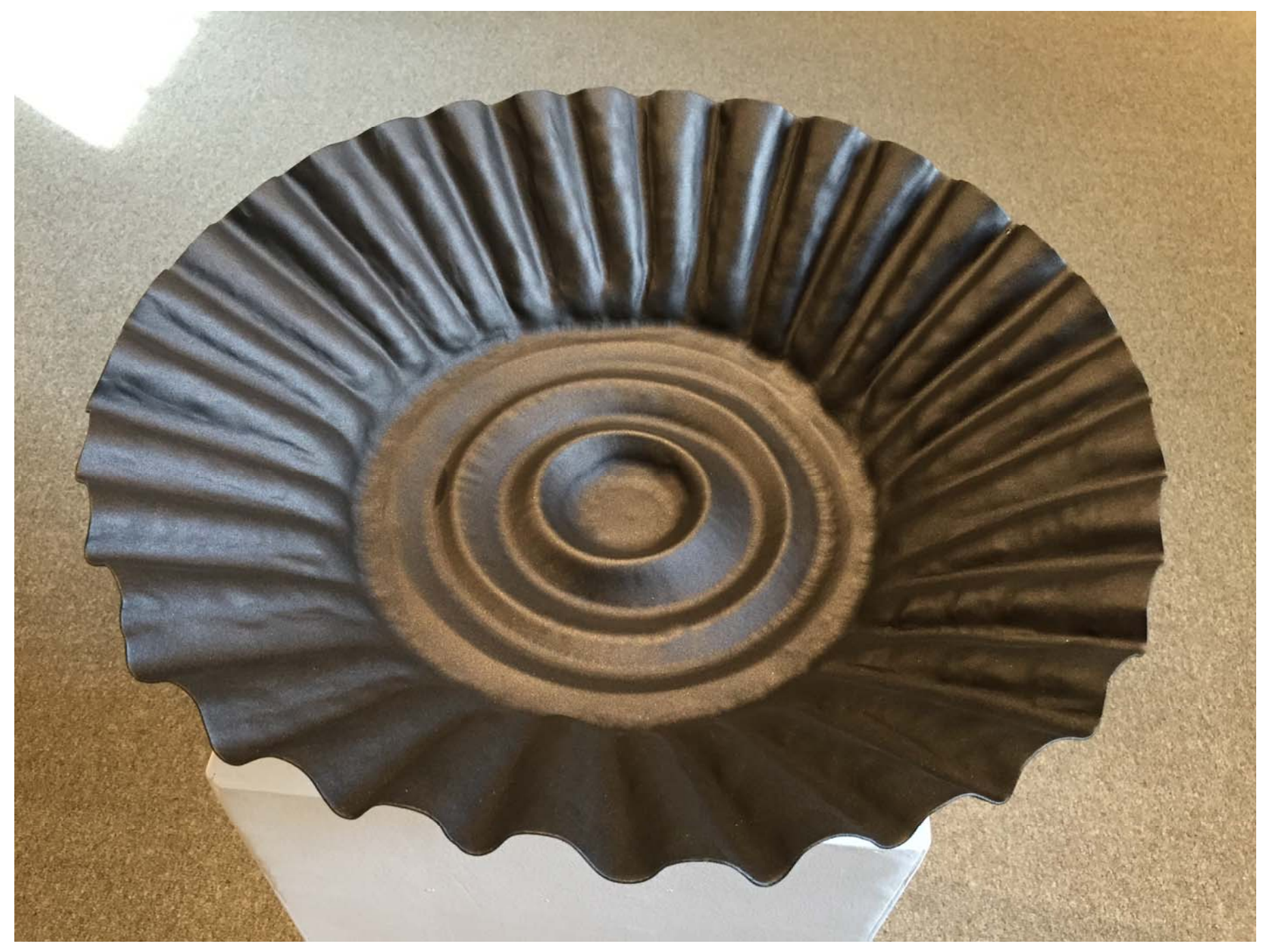
Figure 21: Water Drop.