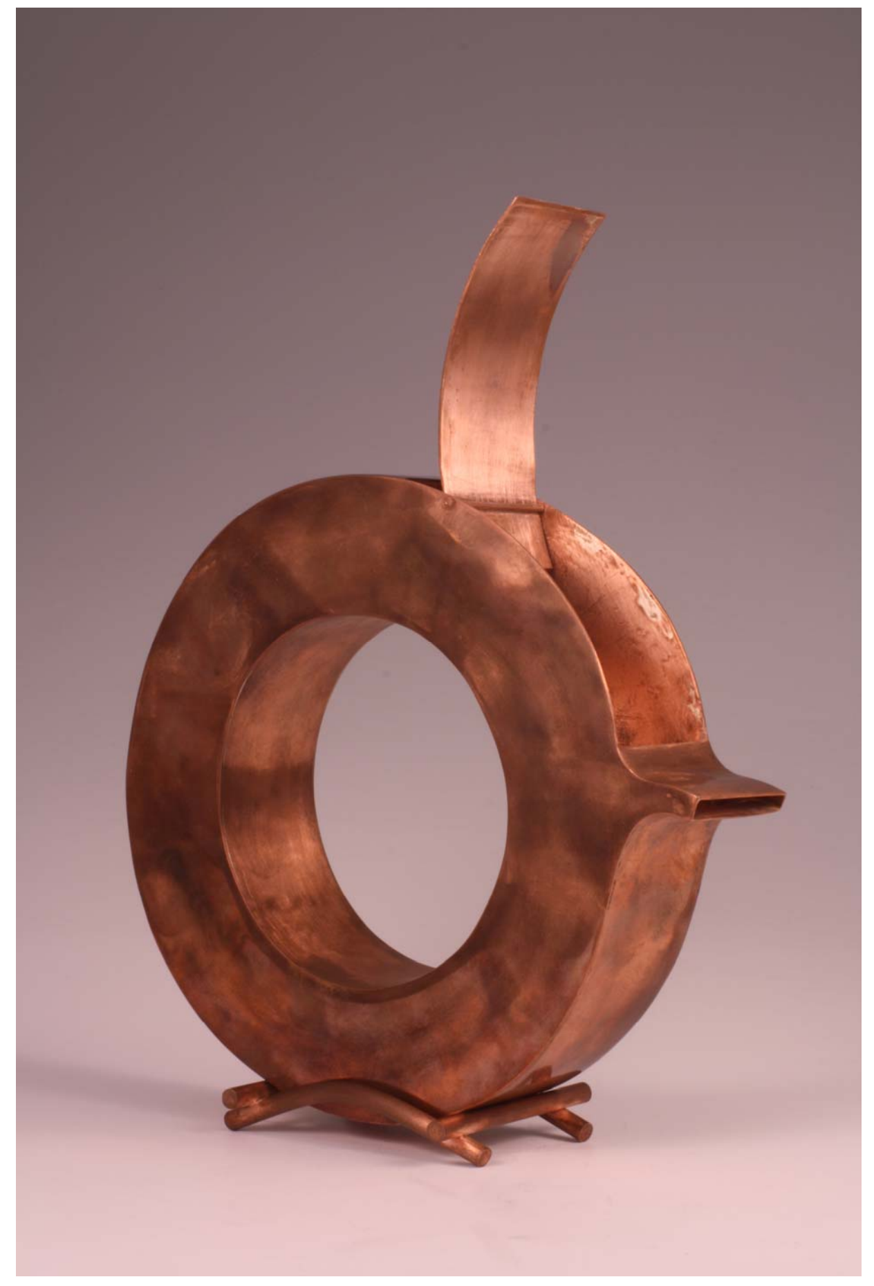
Figure 5: Copper Teapot - Detail.