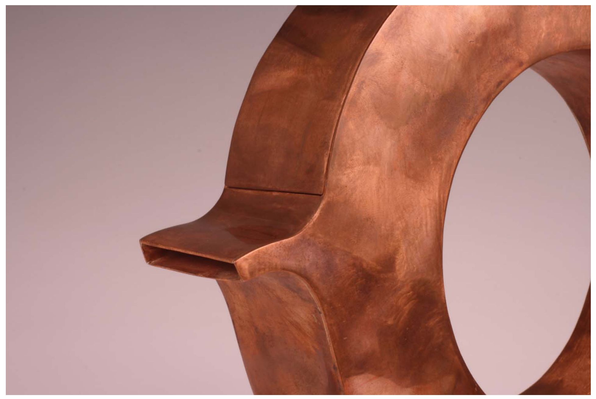
Figure 6: Copper Teapot - Detail 2.