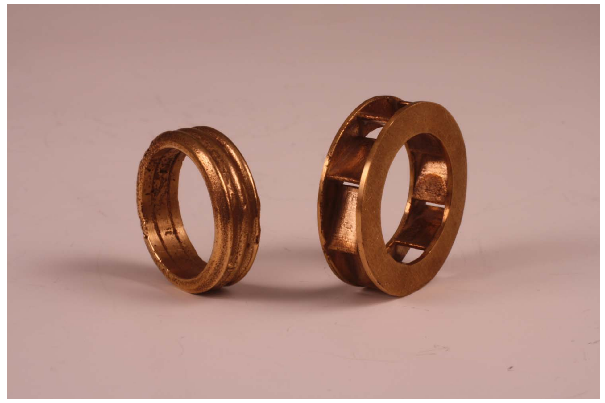
Figure 10: Casted rings - Detail.