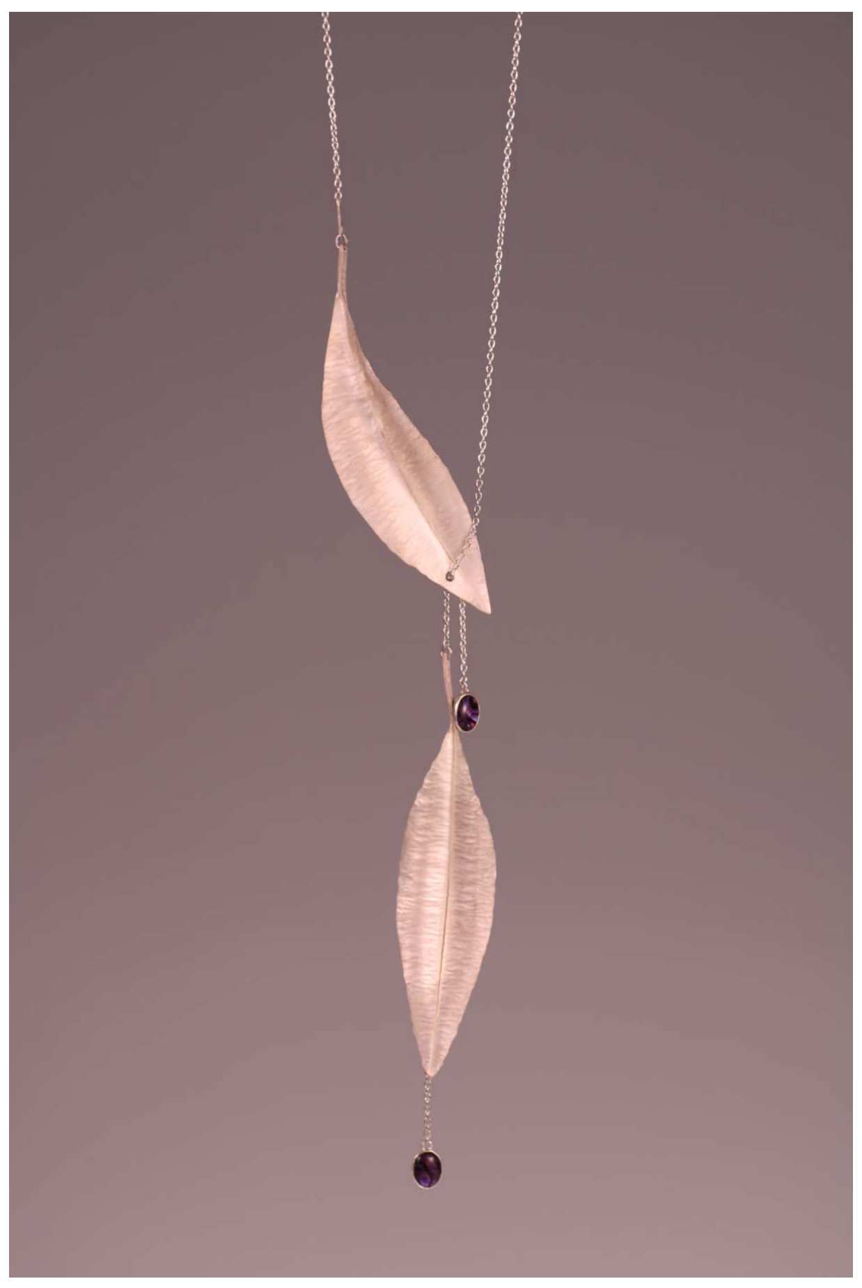
Figure 11: Snowy Leaves.