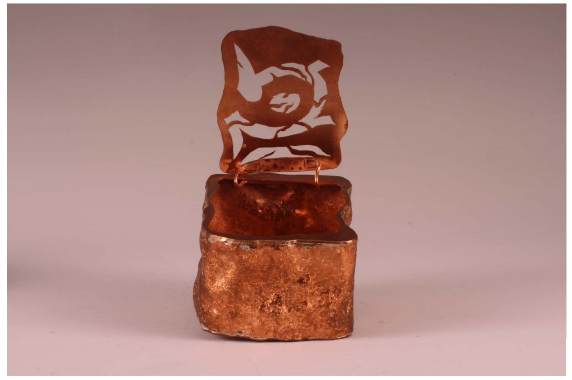
Figure 2: Rock Box-detail.