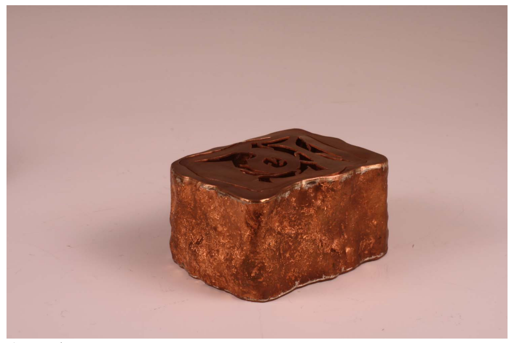
Figure 1: Rock Box.