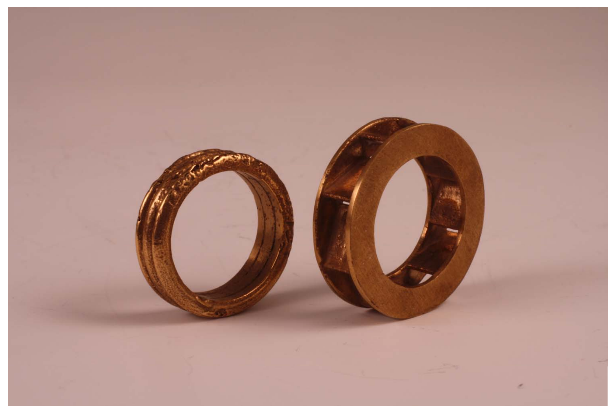
Figure 9: Casted rings.