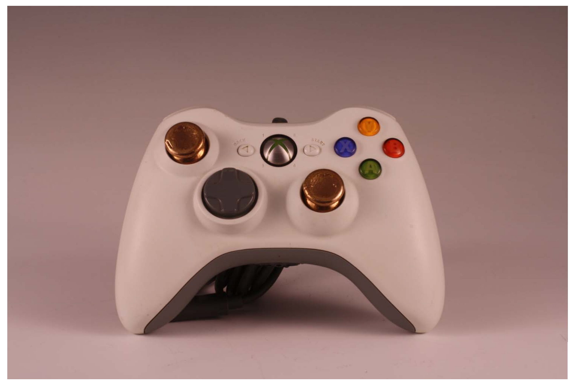
Figure 7: Brass Thumb Sticks.