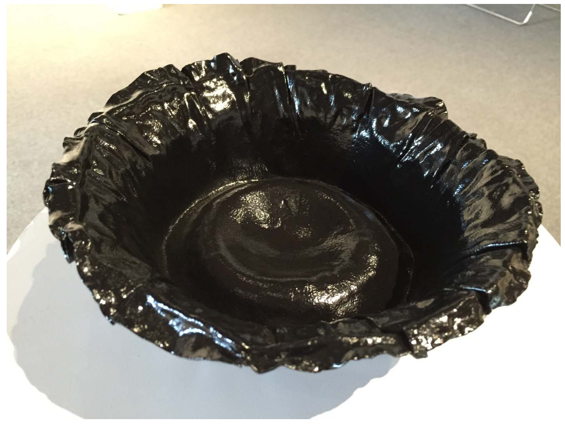
Figure 23: Distrot Bowl.