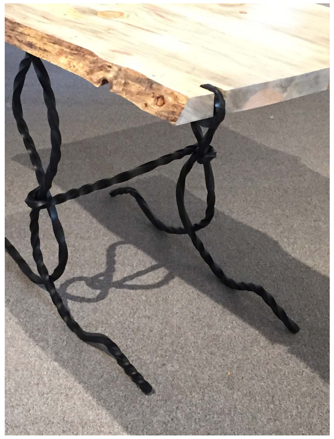
Figure 20: Forbidden Blue - Detail.