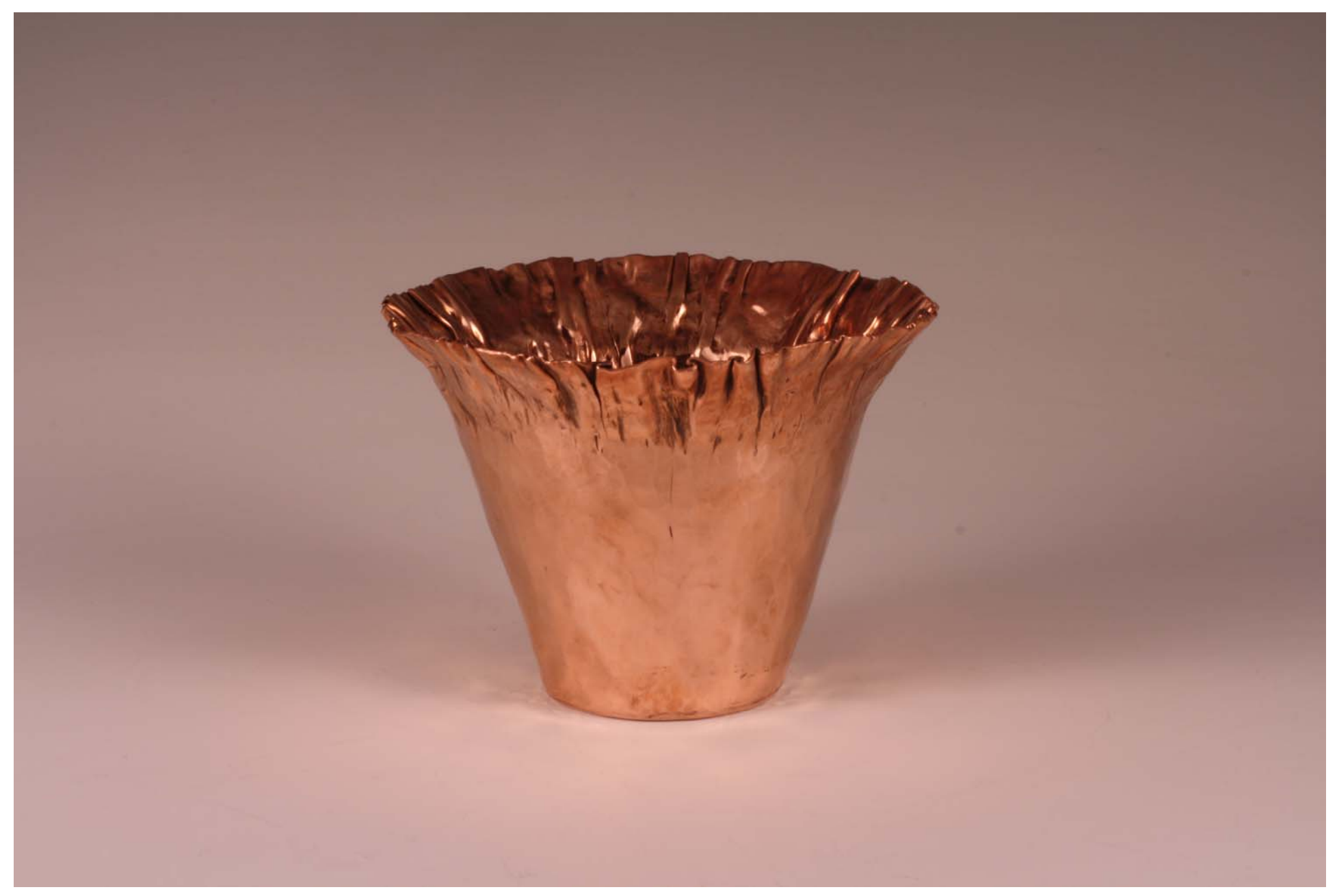
Figure 17: Stress Relief.