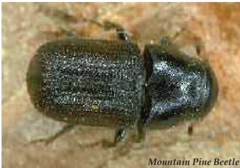
Mountain Pine Beetle

Many forest insects are a natural part of Colorado ecosystems that depend primarily on native tree species for survival. These insects are always present in Colorado forests, but insect populations can increase to epidemic proportions if conditions are right. Conditions that favor insect epidemics are warm climate cycles and drought, fire or other disturbances, as well as forests with larger trees. Insect epidemics can result in millions of trees turning red and eventually dying.