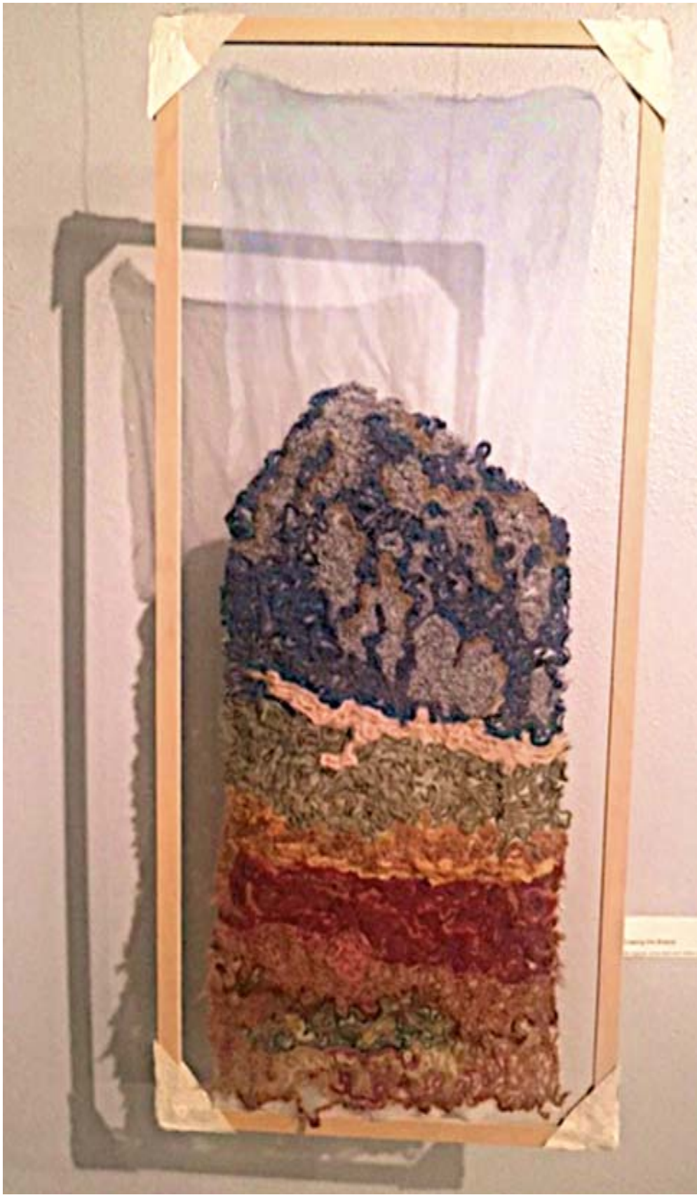
Figure 7: Drawing the Breeze.