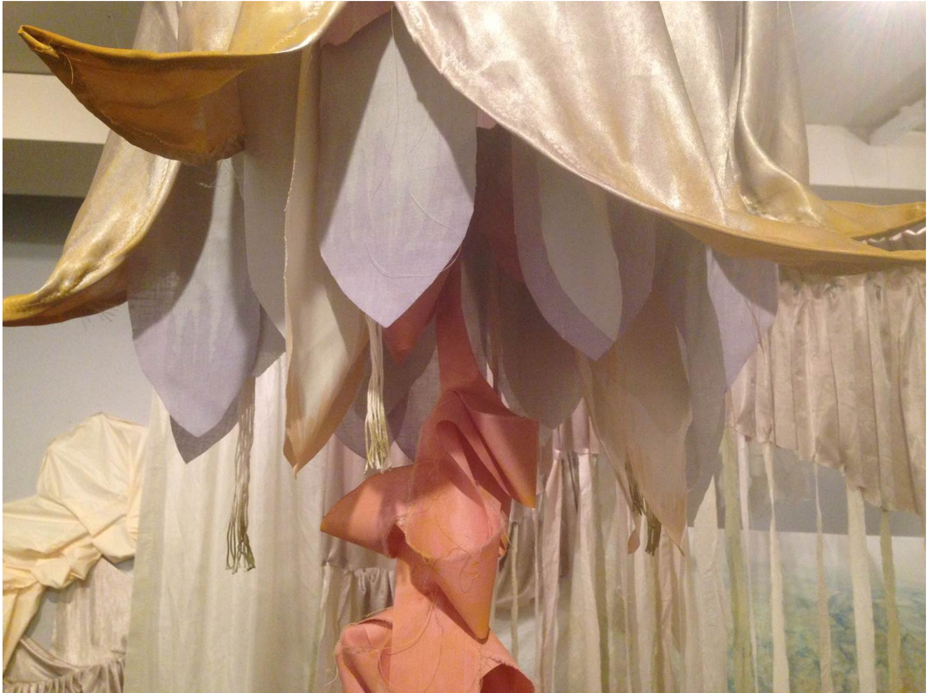
Figure 1: Fragrant, Fragile, and Free.