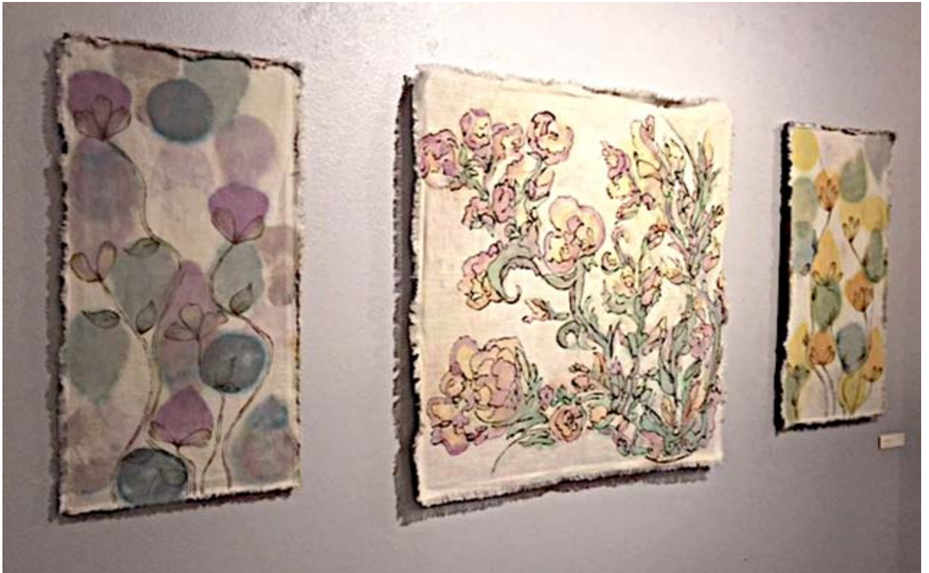
Figure 9: Remembrance.