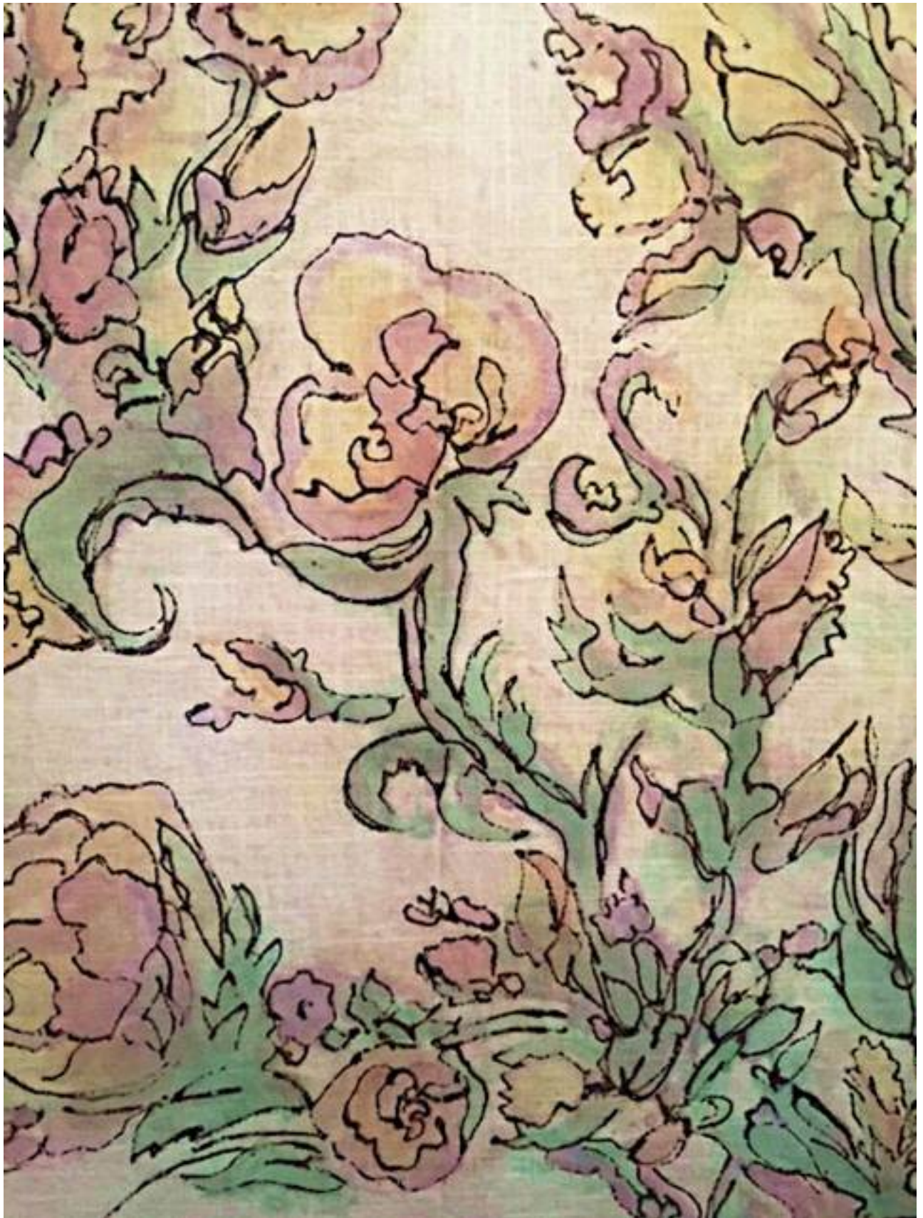
Figure 10: Detail: Remembrance.