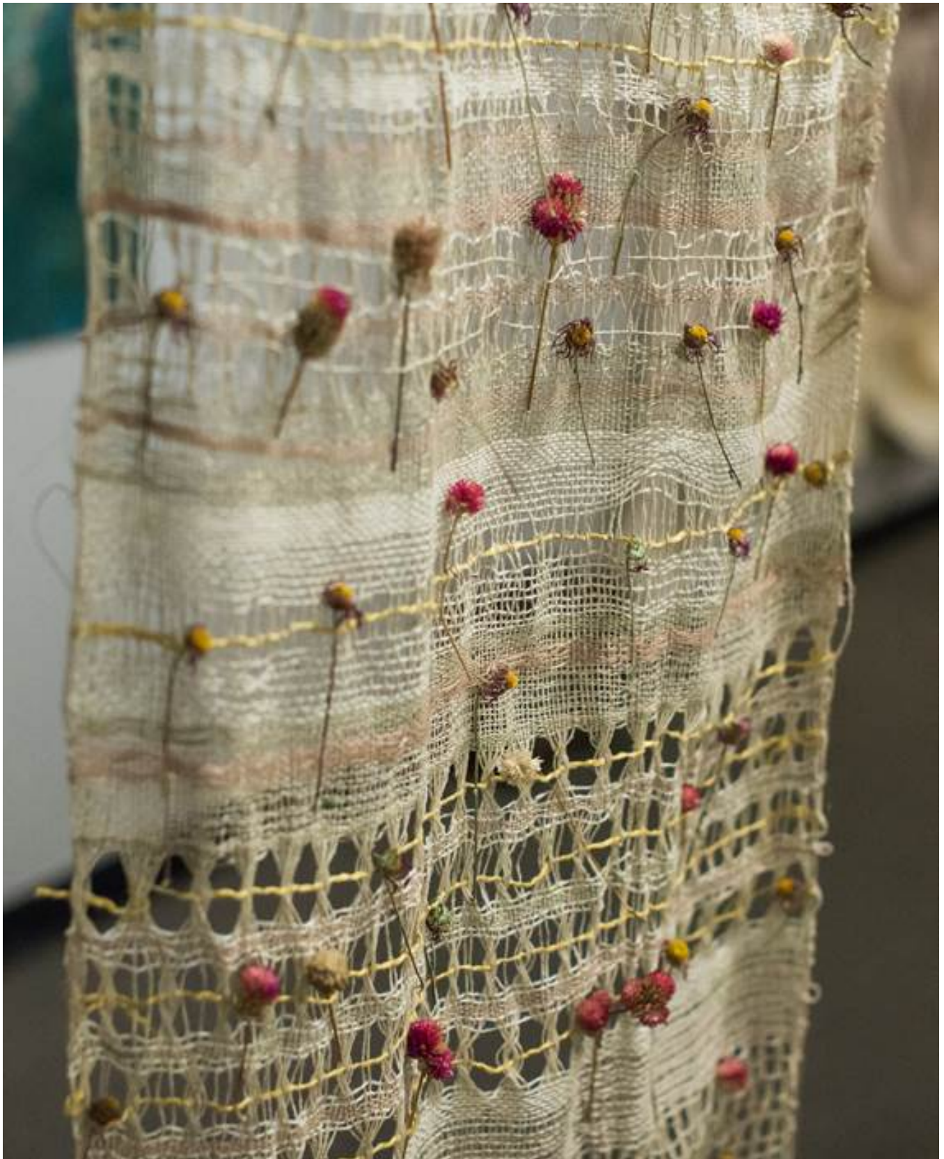
Figure 5: Spaces for Faces.