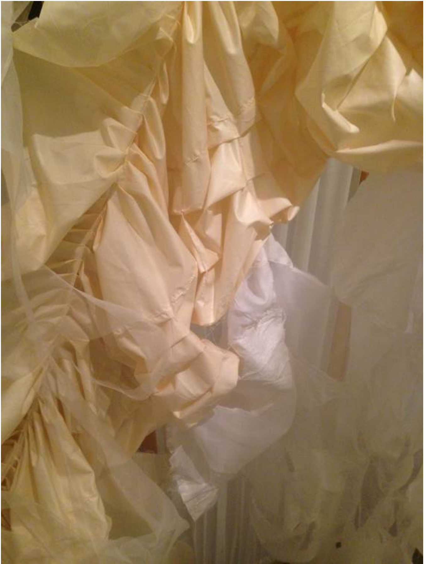
Figure 12: Detail: A Time to Tear, A Time to Sew.