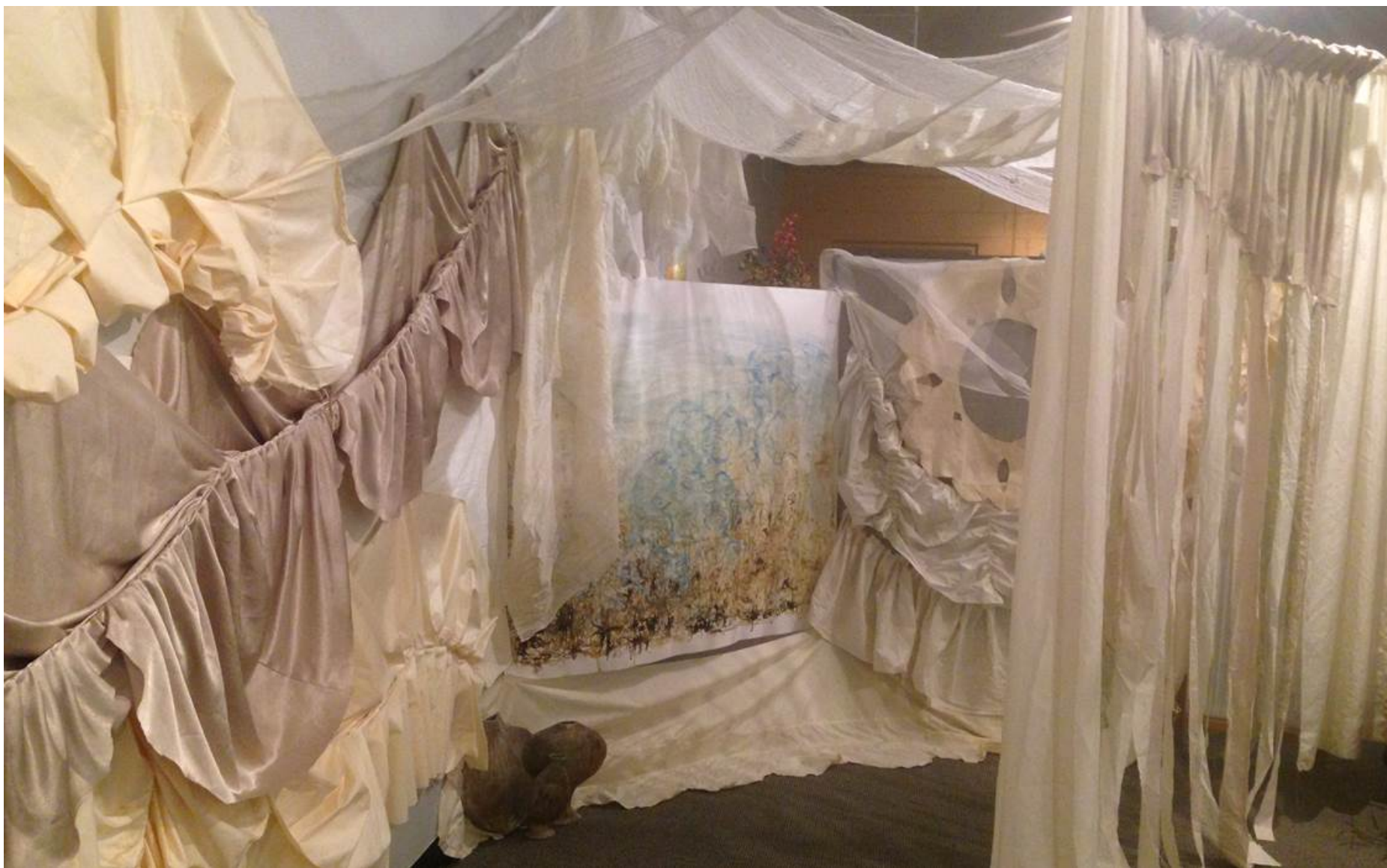
Figure 11: A Time to Tear, A Time to Sew.