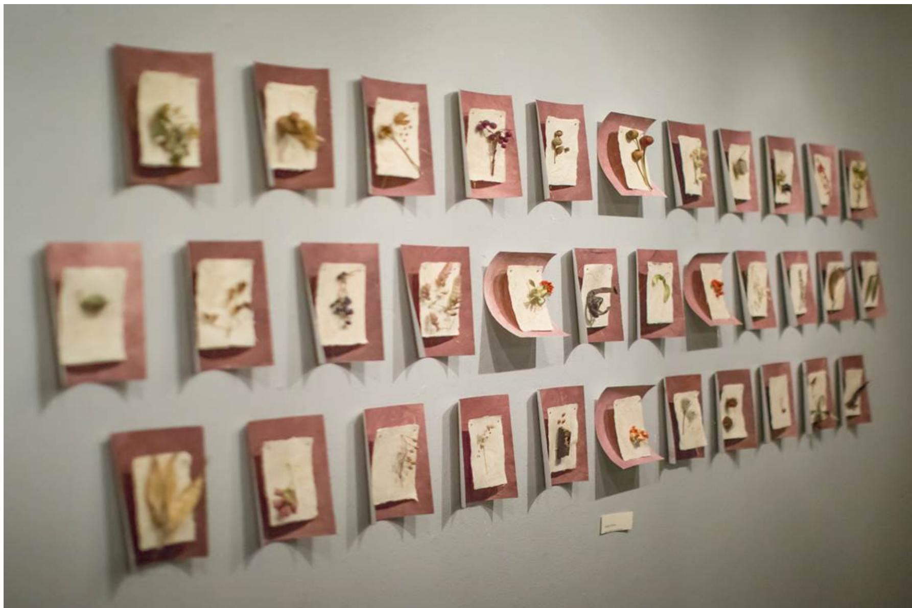
Figure 3: Seeds of Plenty.