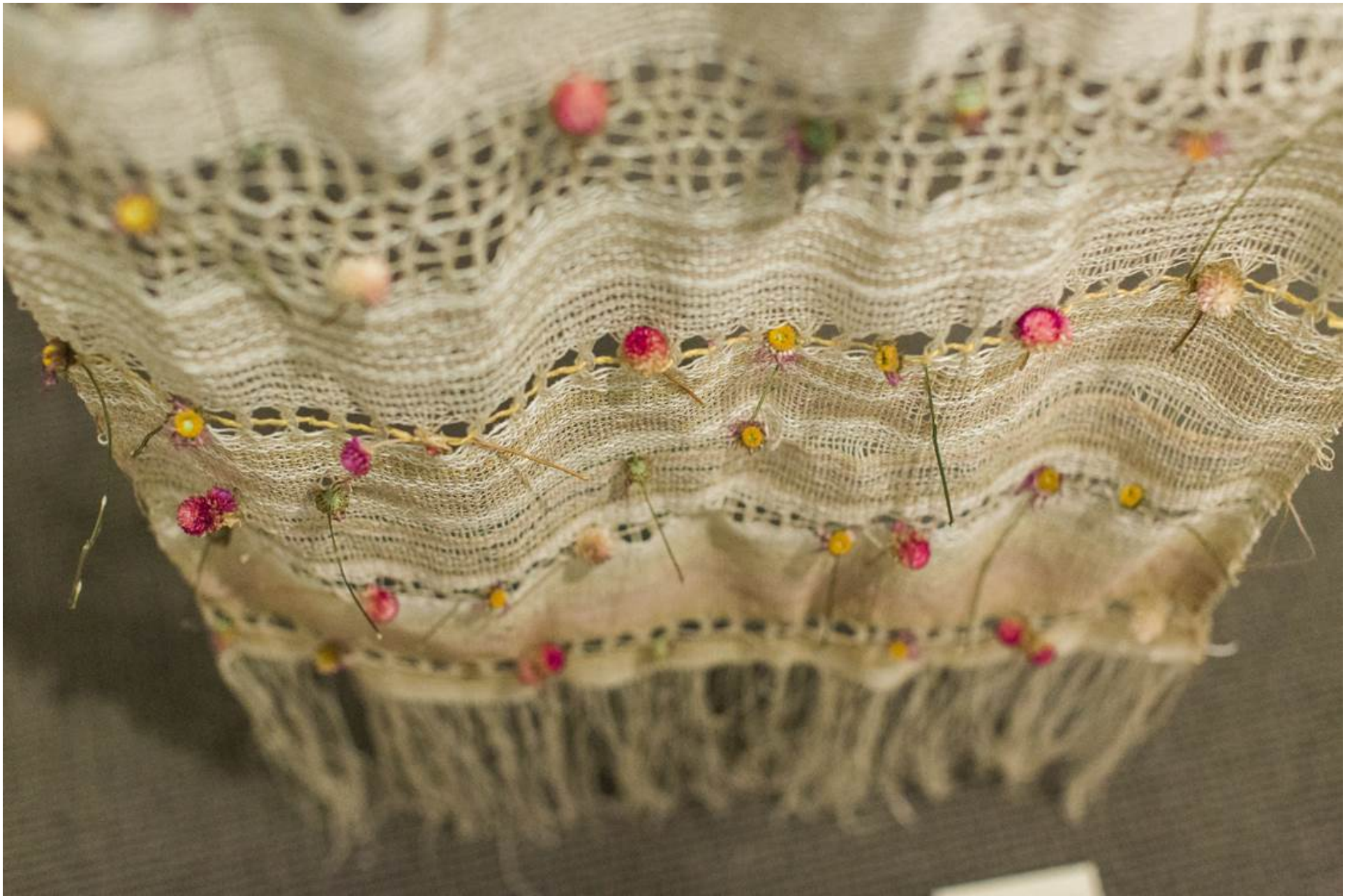
Figure 6: Detail: Spaces for Faces.