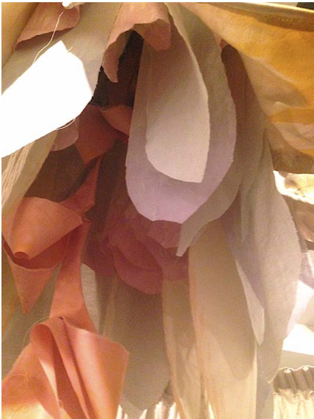
Figure 2: Detail: Fragrant, Fragile, and Free.