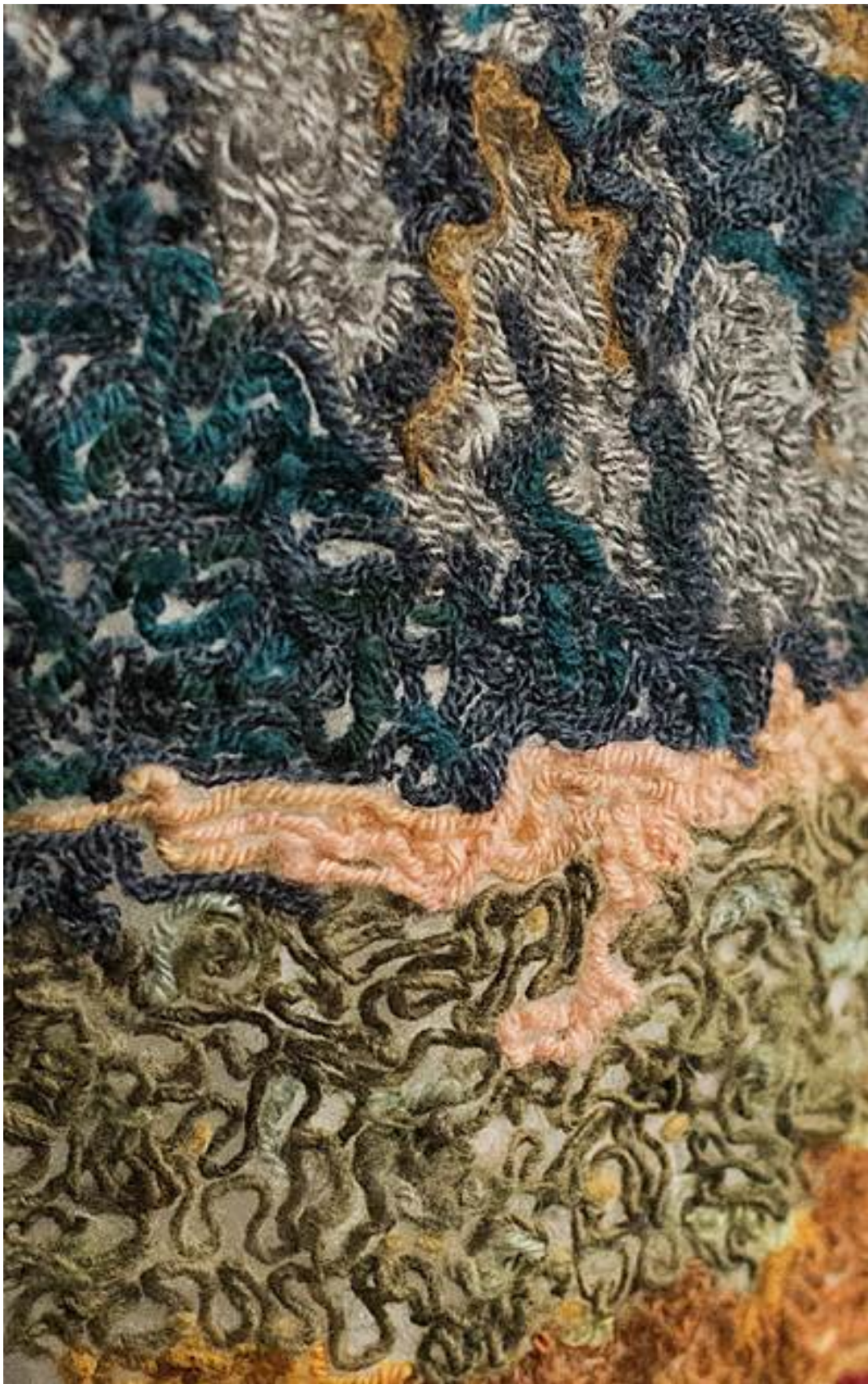
Figure 8: Detail: Drawing the Breeze.