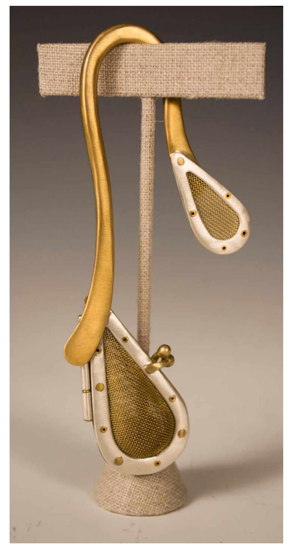
Figure 4: Tea Strainer Detail.