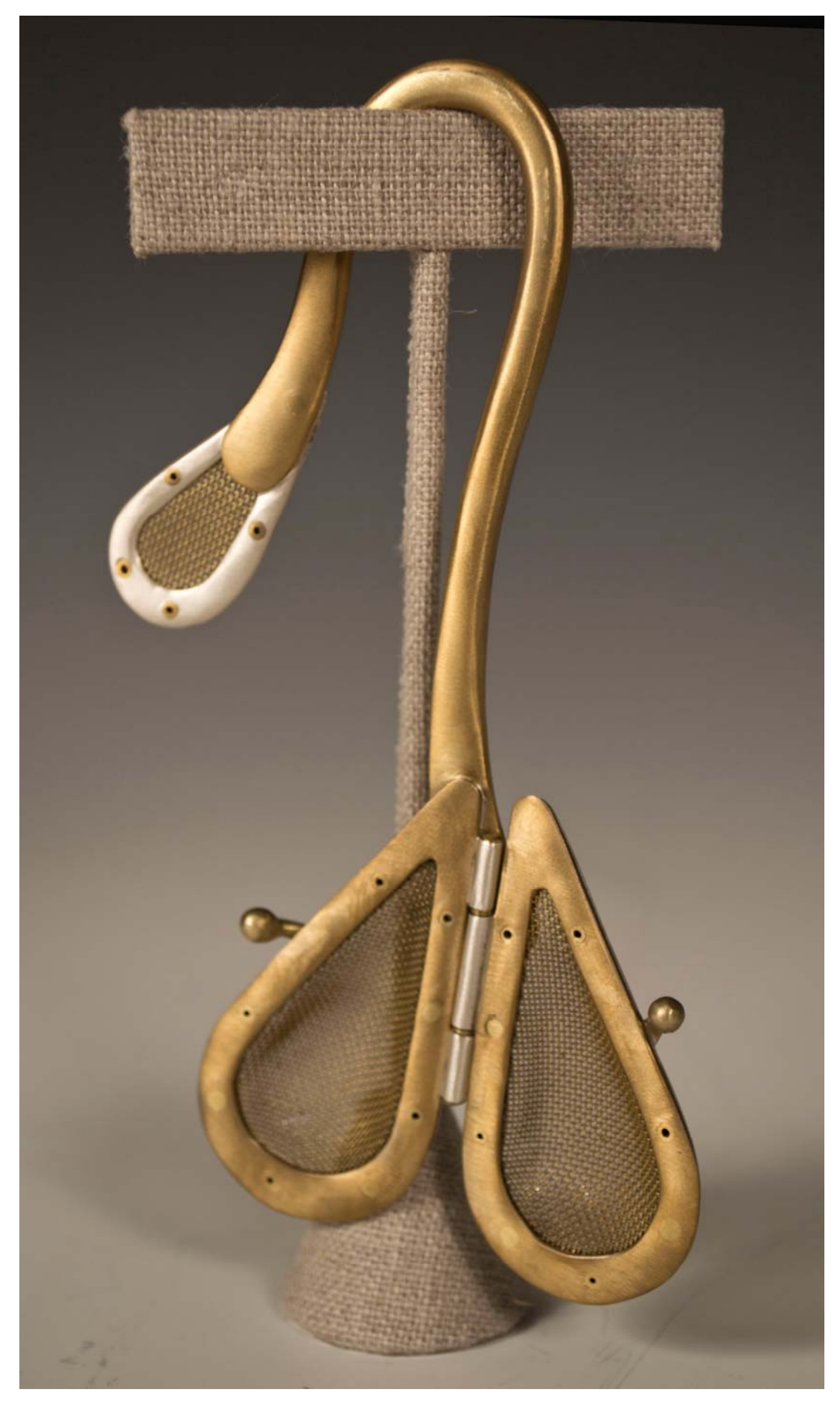
Figure 3: Tea Strainer.