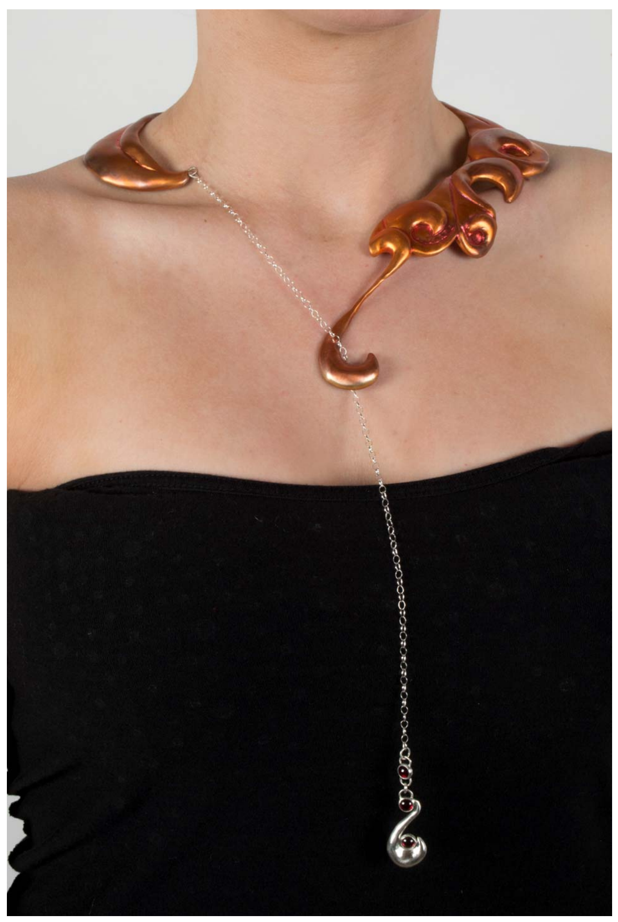
Figure 16: The Sirens Seduction.