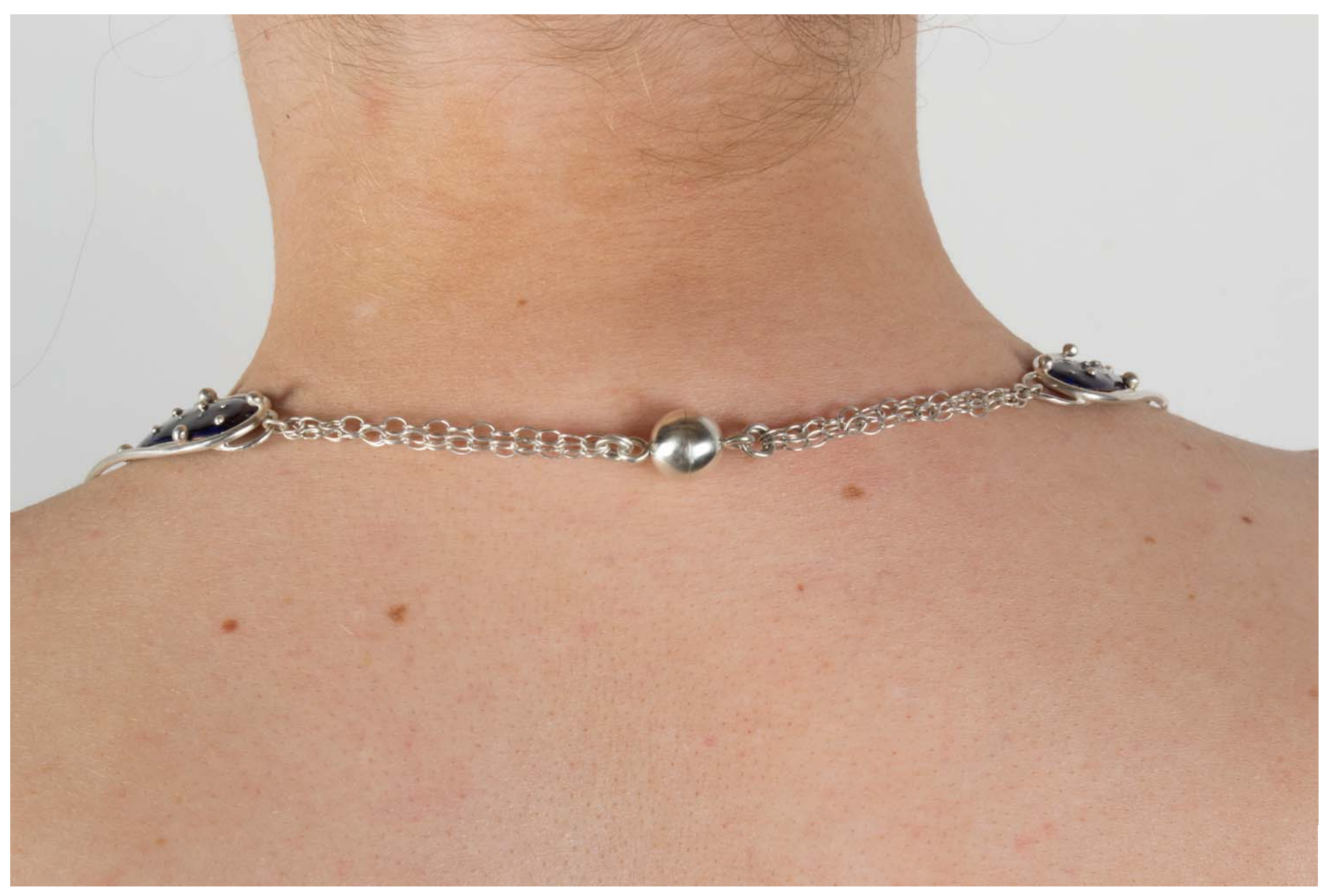
Figure 12: The Ballsy Necklace Detail.