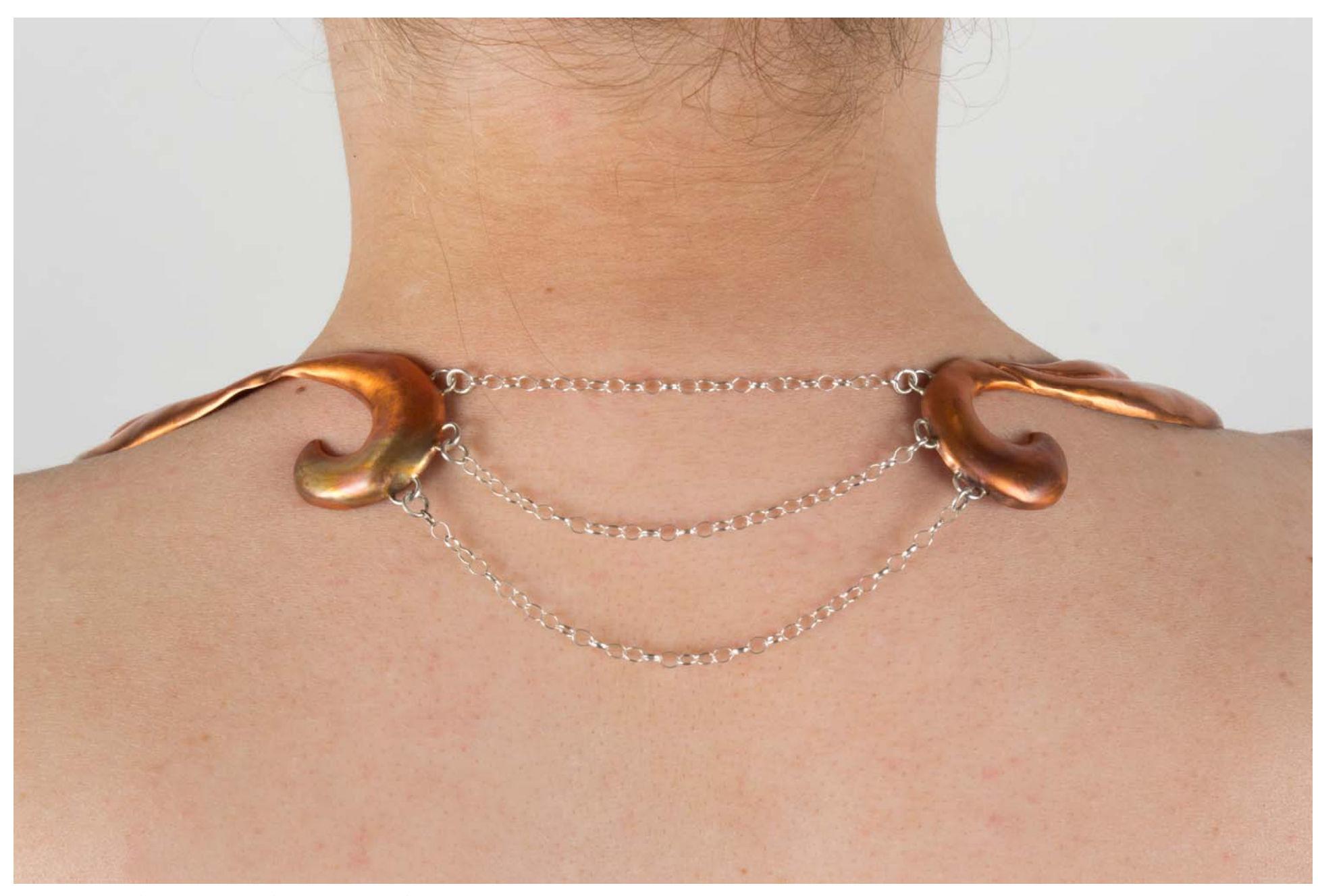
Figure 18: The Sirens Seduction Detial 2.