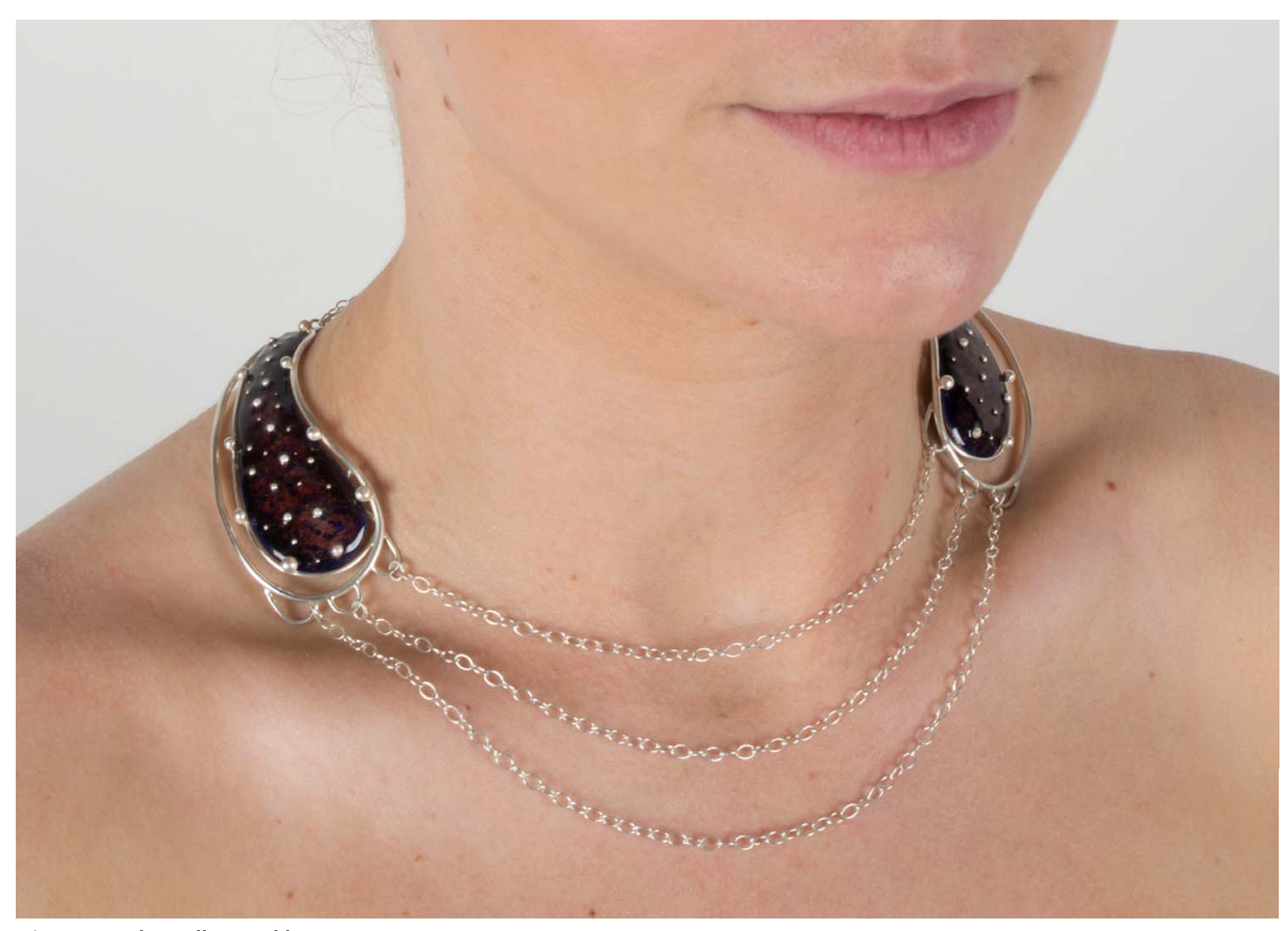
Figure 11: The Ballsy Necklace.