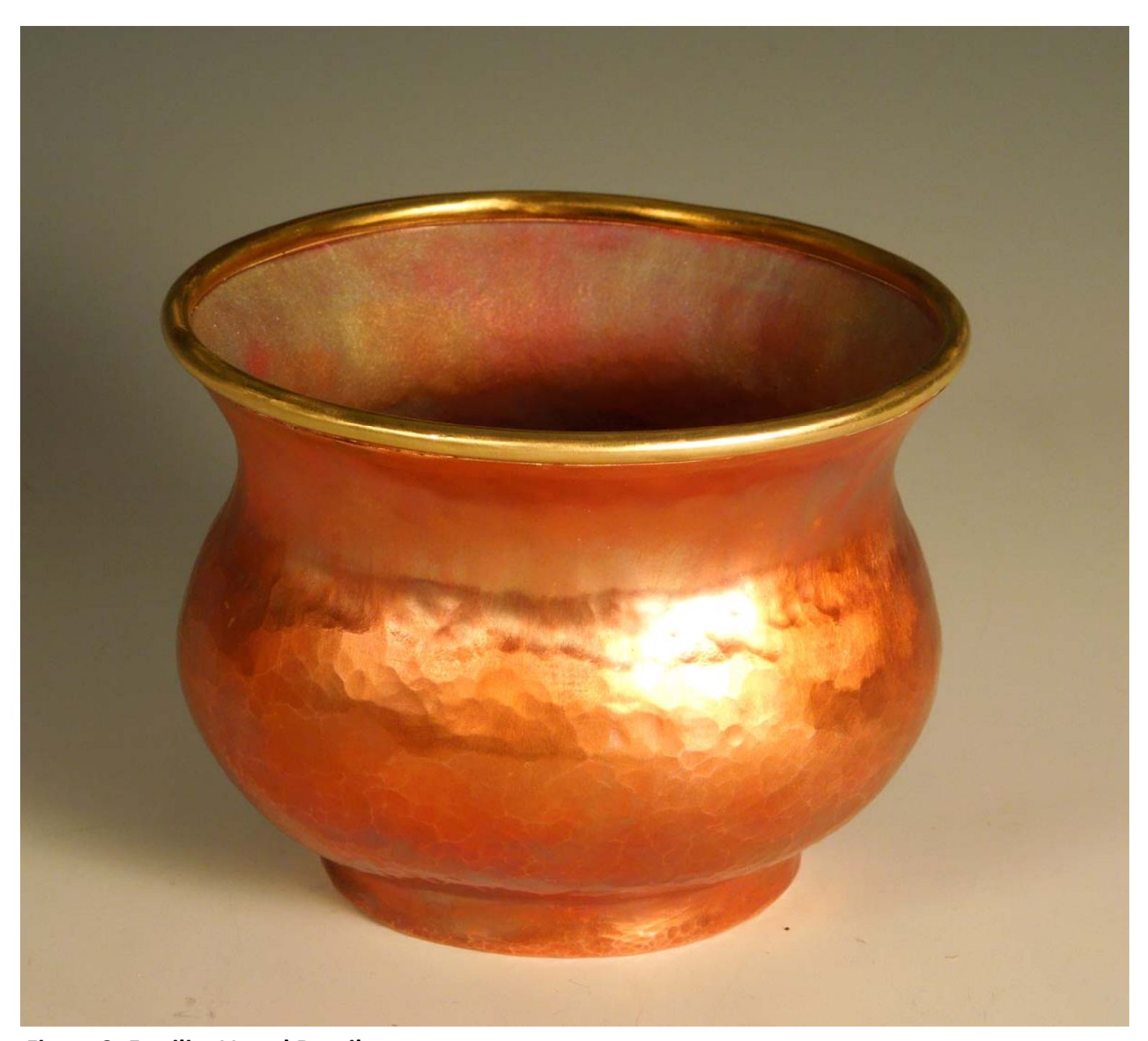
Figure 2: Fertility Vessel Detail.