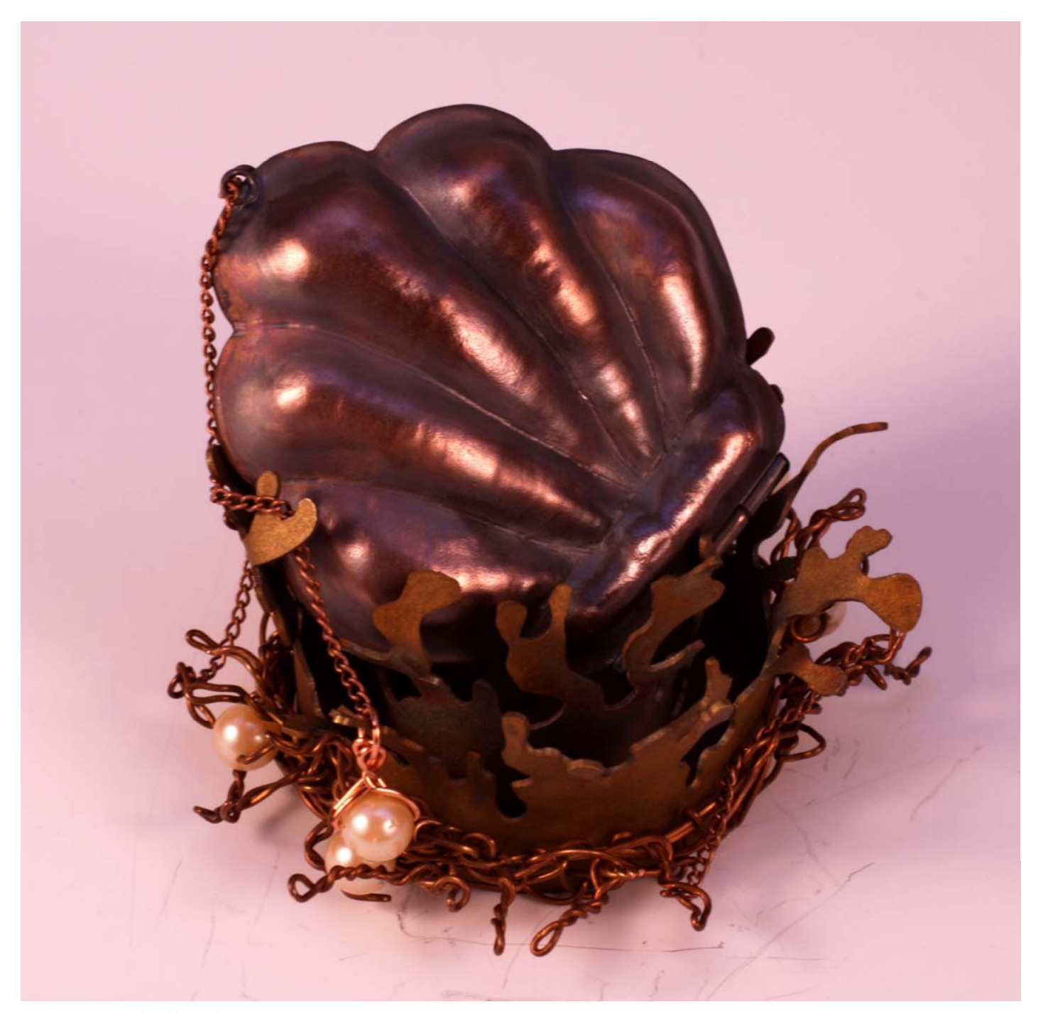
Figure 5: Shell Reliquary.