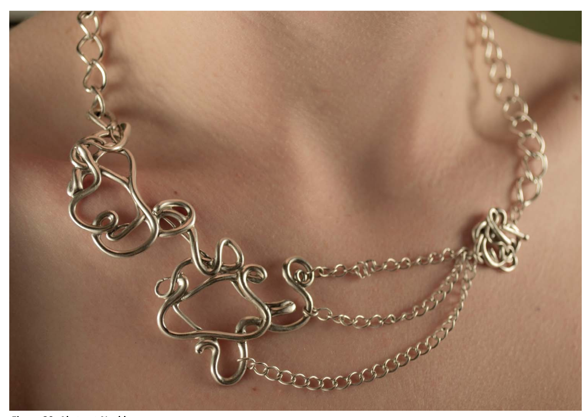
Figure 20: Abstract Necklace.