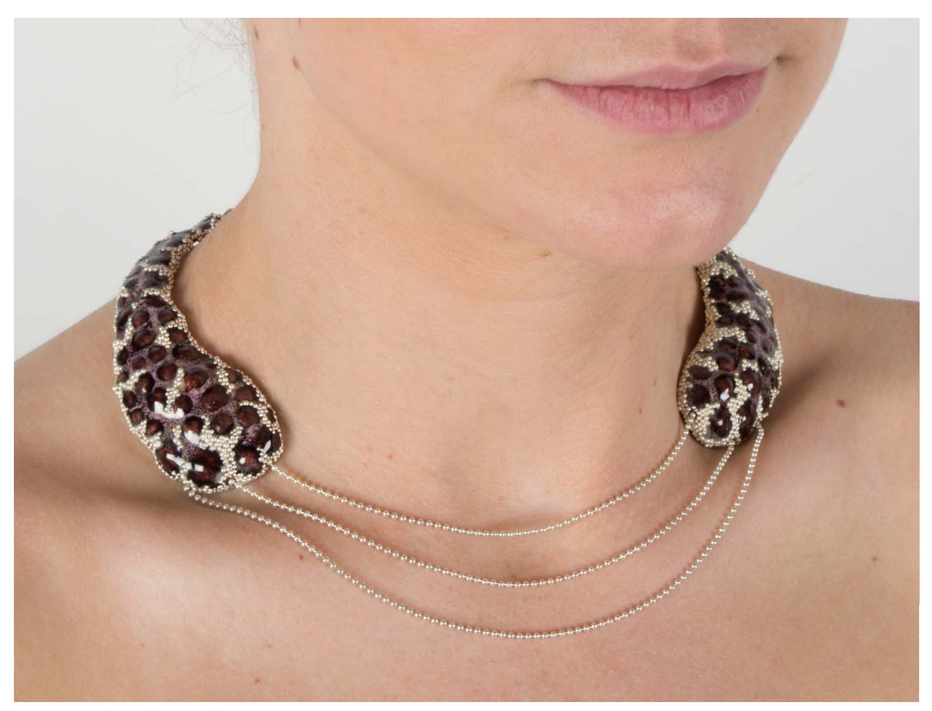
Figure 14: The Ballsy Necklace 2.