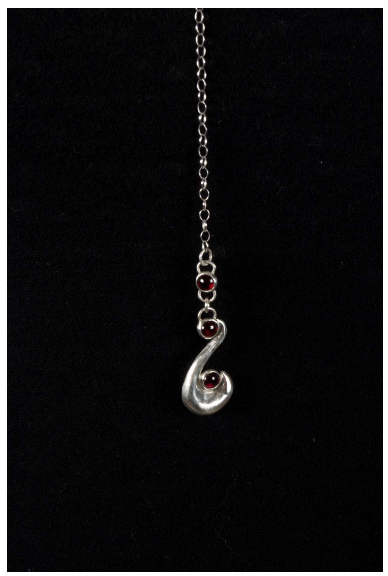
Figure 17: The Sirens Seduction Detail 1.