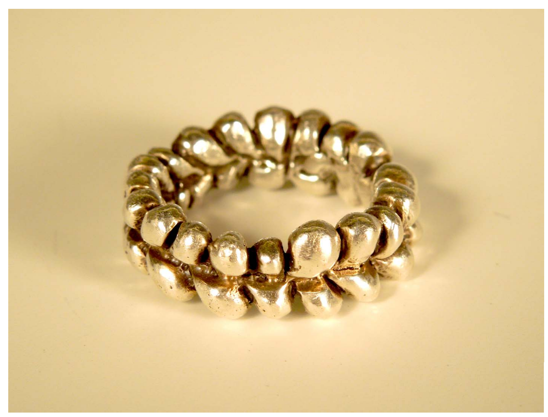
Figure 9: Cast Ring.