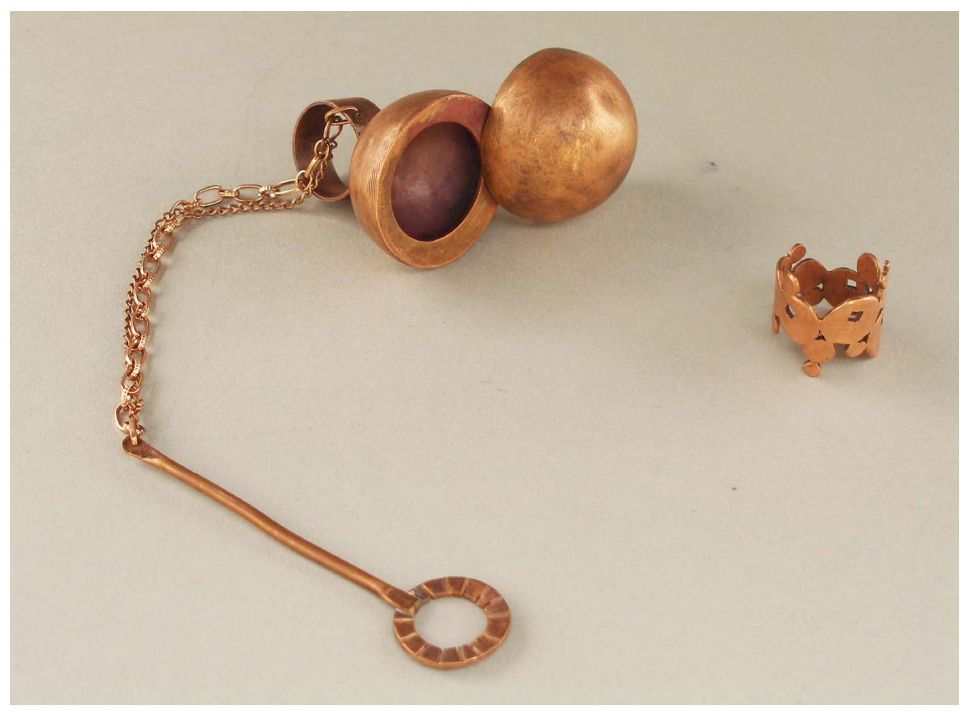
Figure 10: Bubbles Rings.