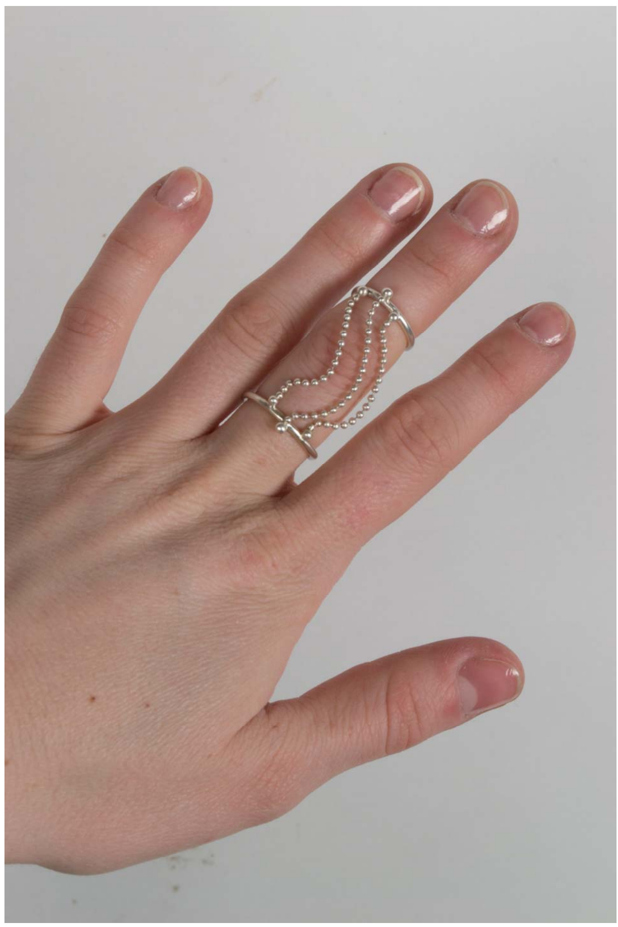
Figure 15: The Ballsy Rings.