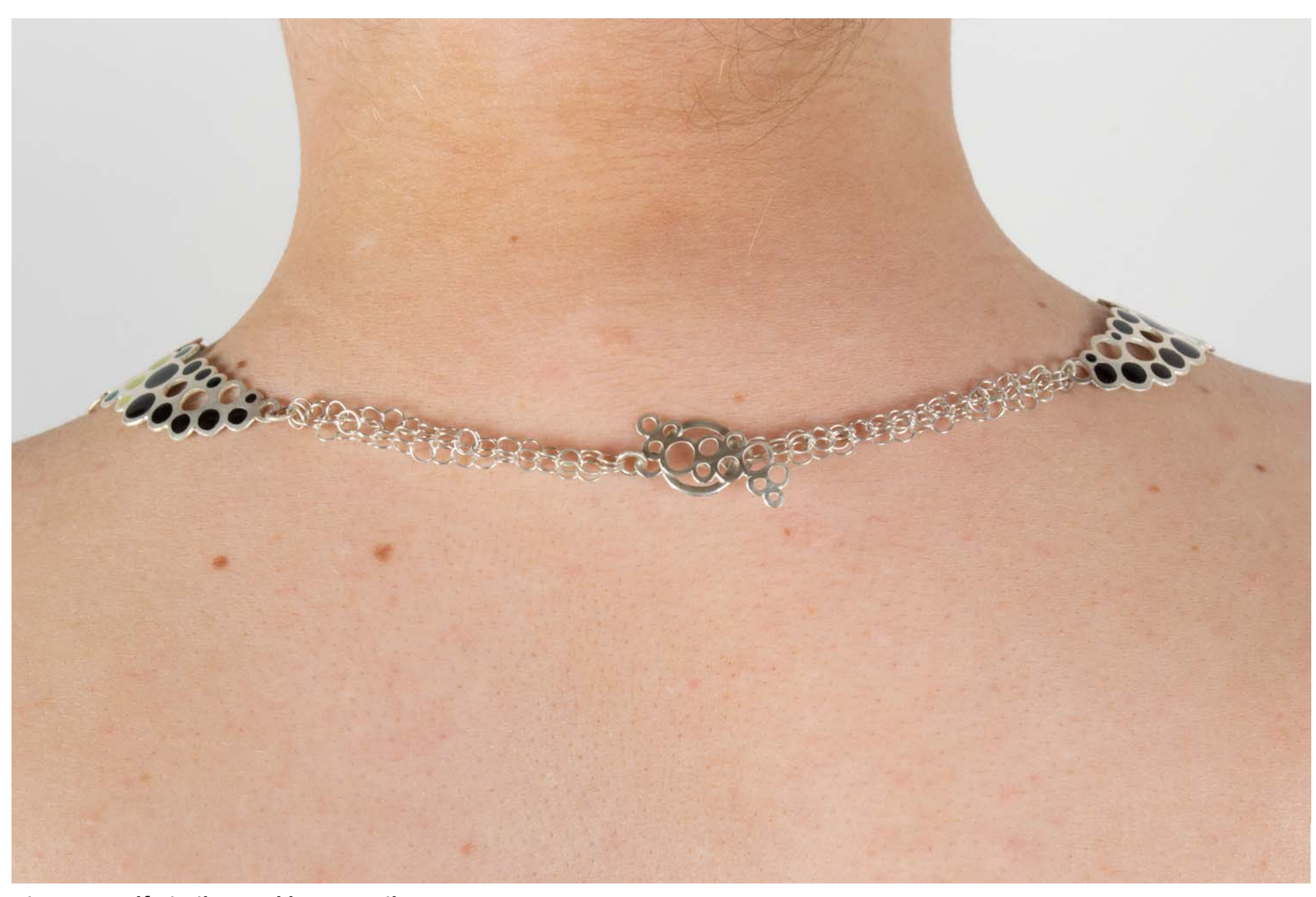
Figure 8: Self-Similar Necklace Detail.