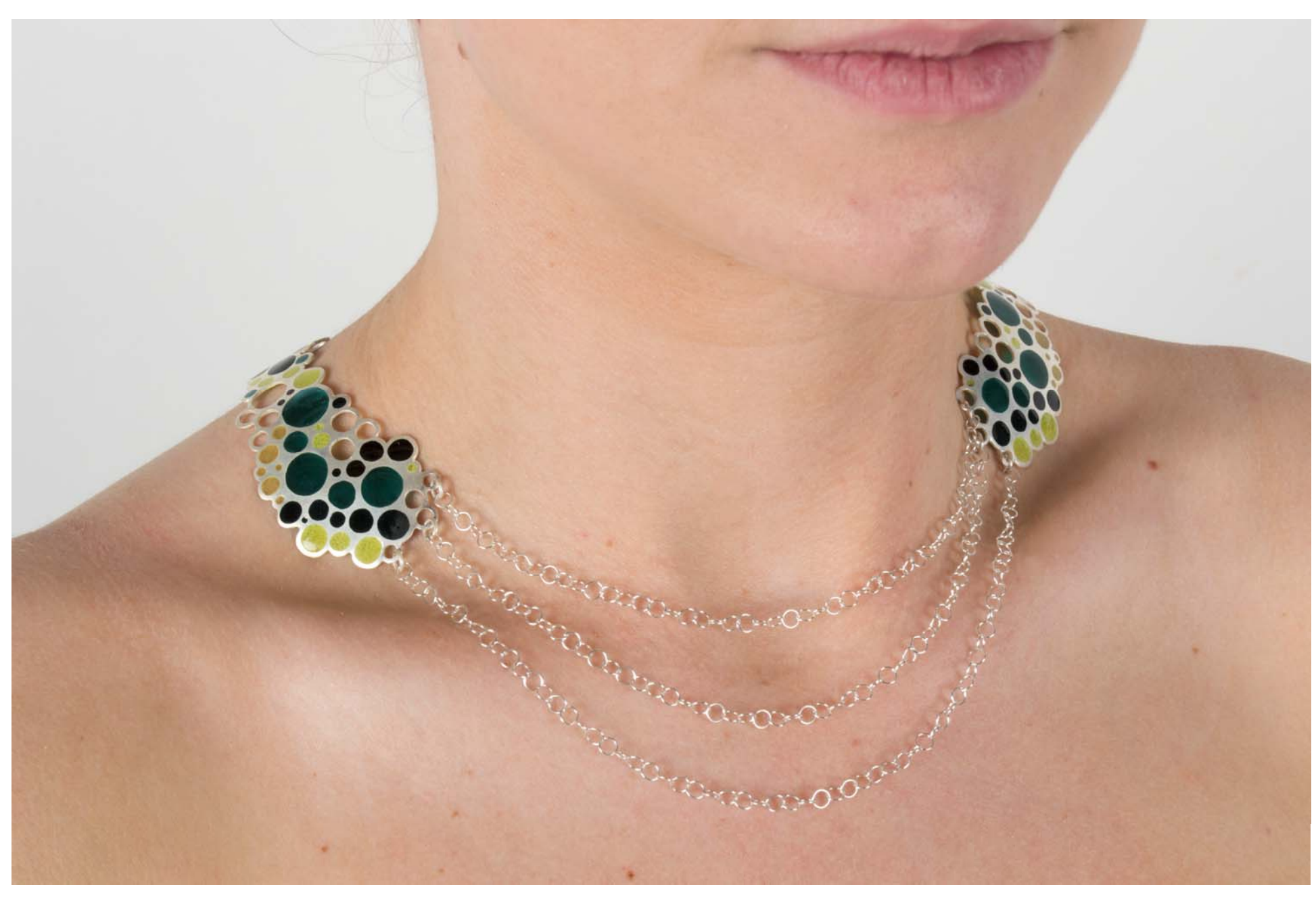
Figure 7: Self-Similar Necklace.