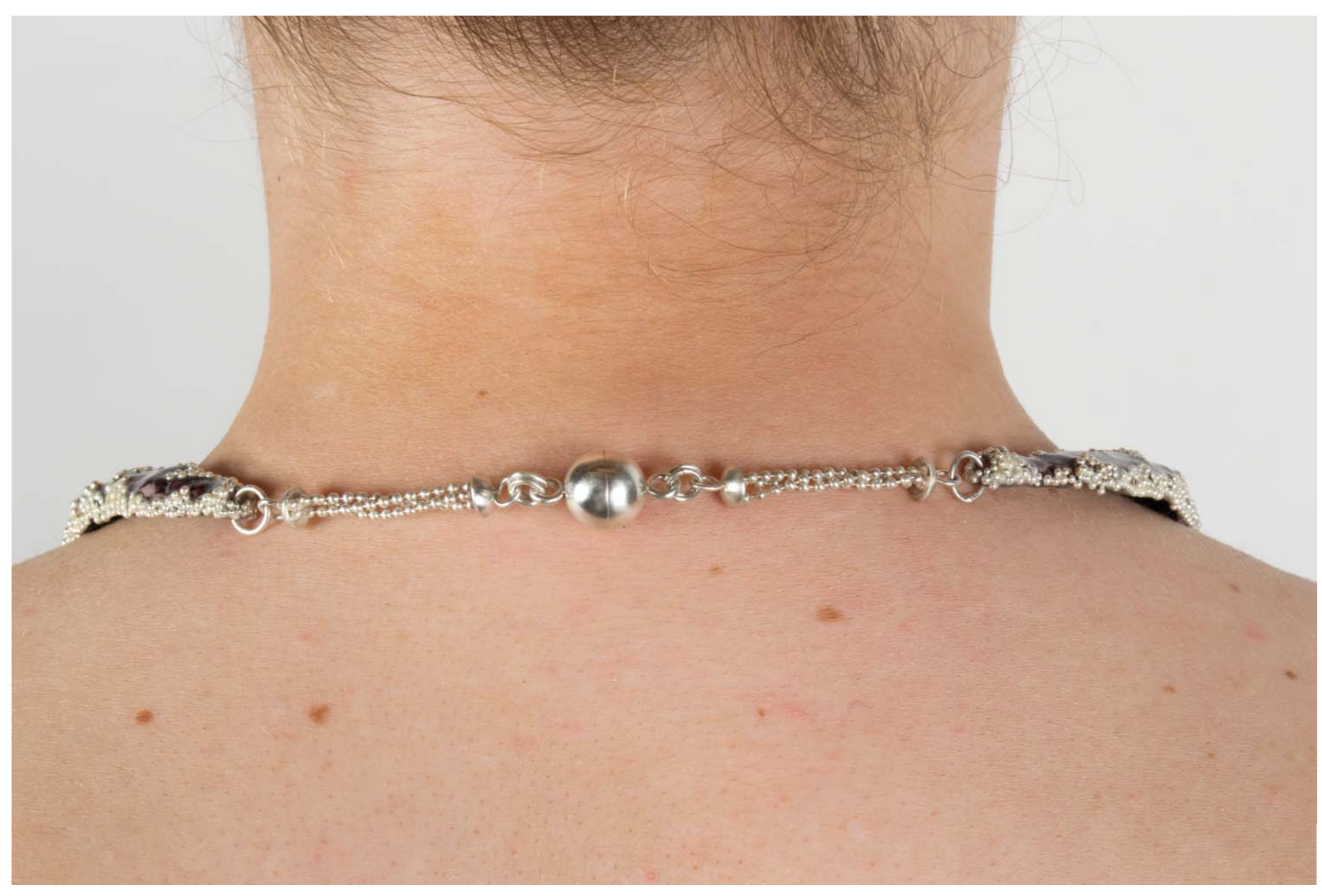
Figure 13: The Ballsy Necklace 2 Detail.