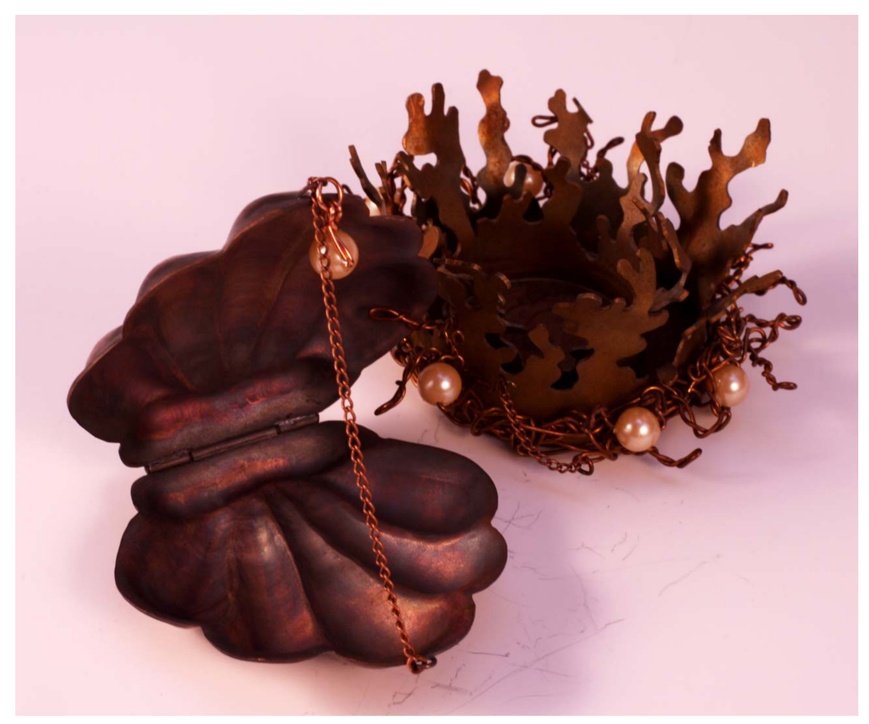
Figure 6: Shell Reliquary Detail.