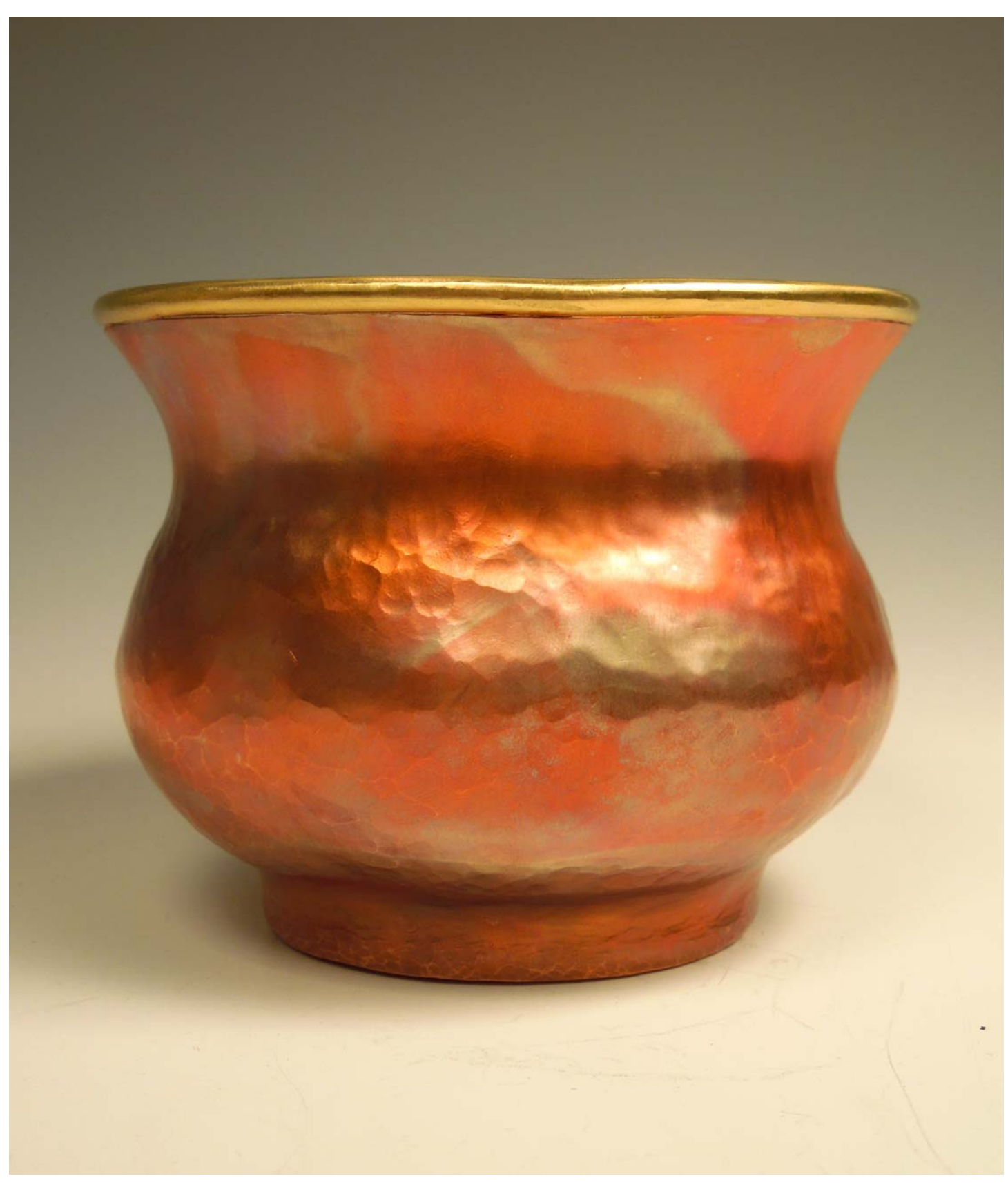
Figure 1: Fertility Vessel.