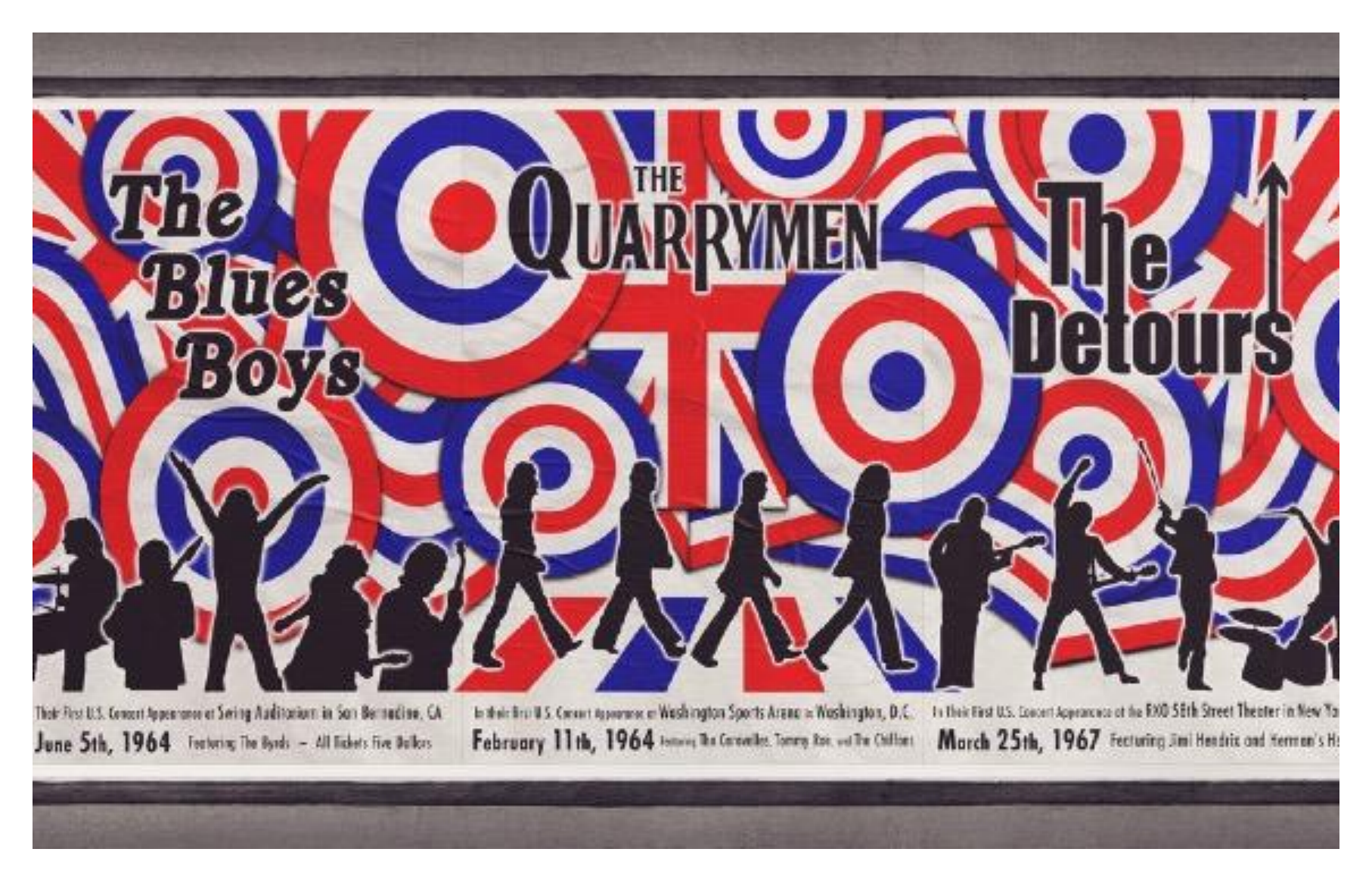
Figure 5: British Invasion Poster Series