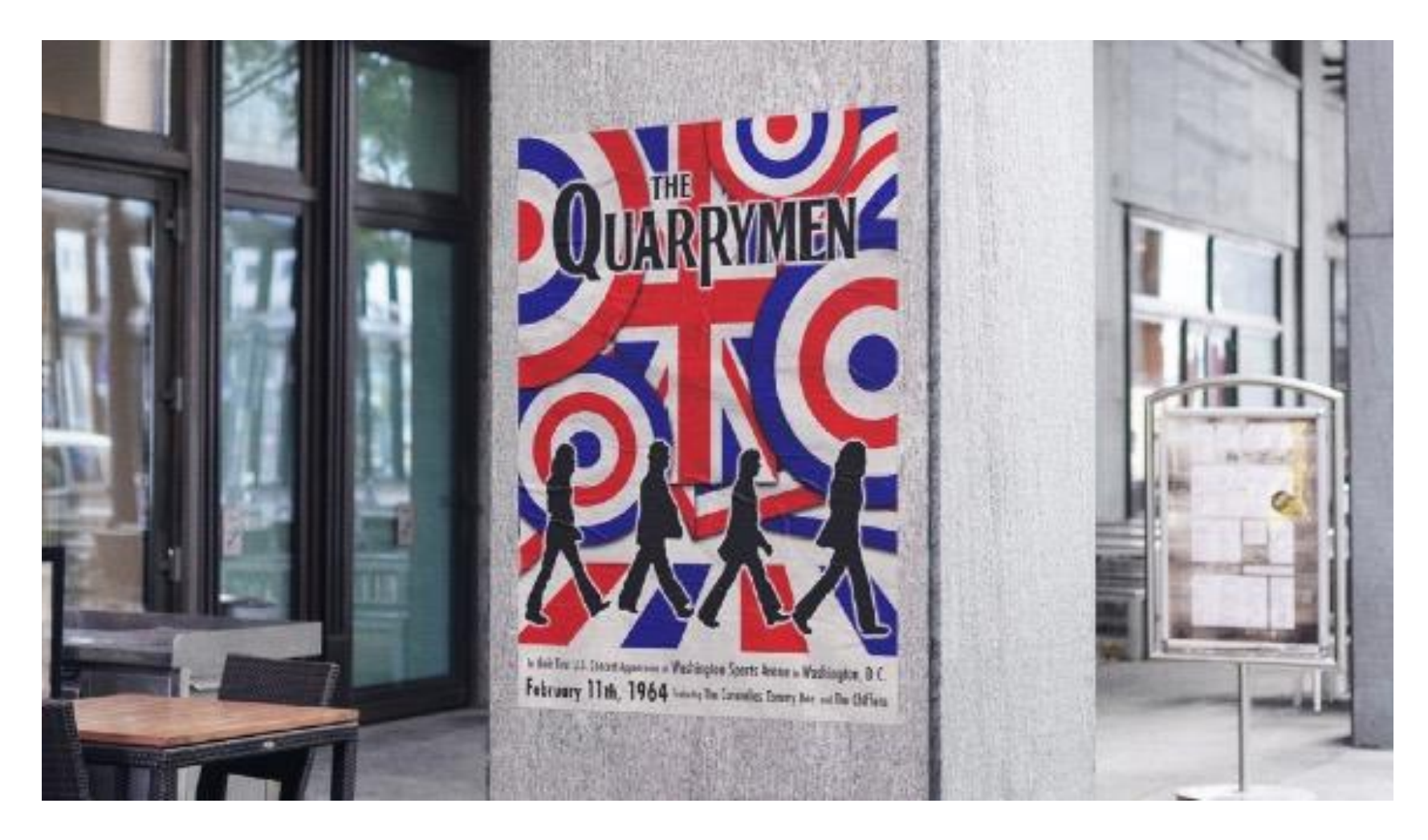
Figure 6: British Invasion Poster Single