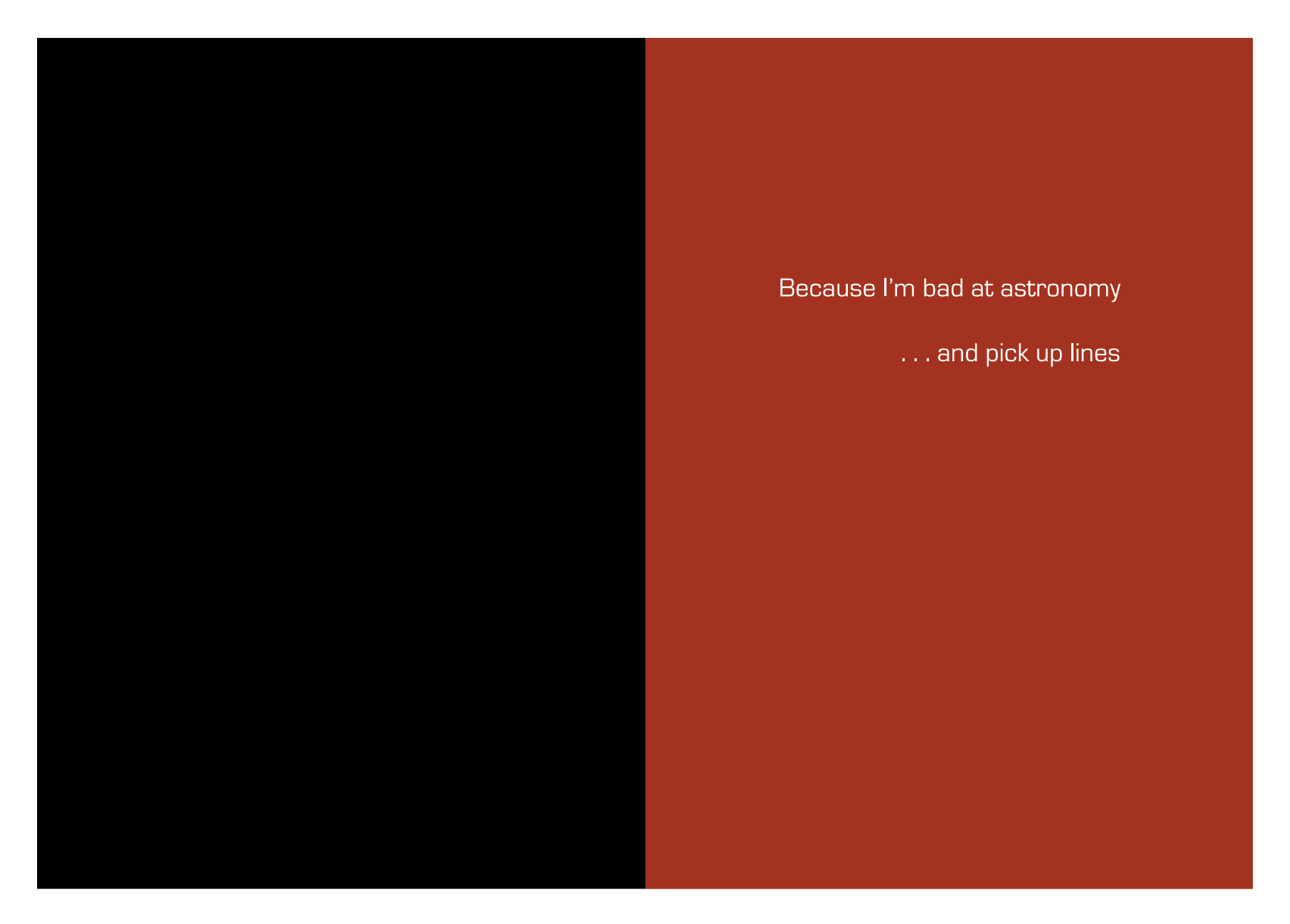
Figure 4: Space Cards – Greeting Card Design Inside