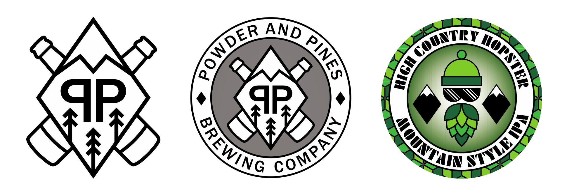
Figure 7: Powder and Pines Brewing Co. - Logo Designs