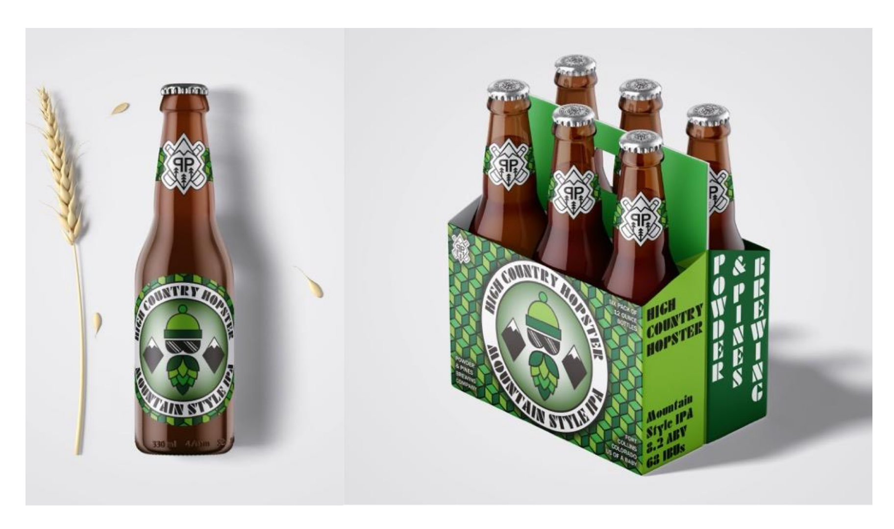
Figure 8: Powder and Pines Brewing Co. - Packaging Design