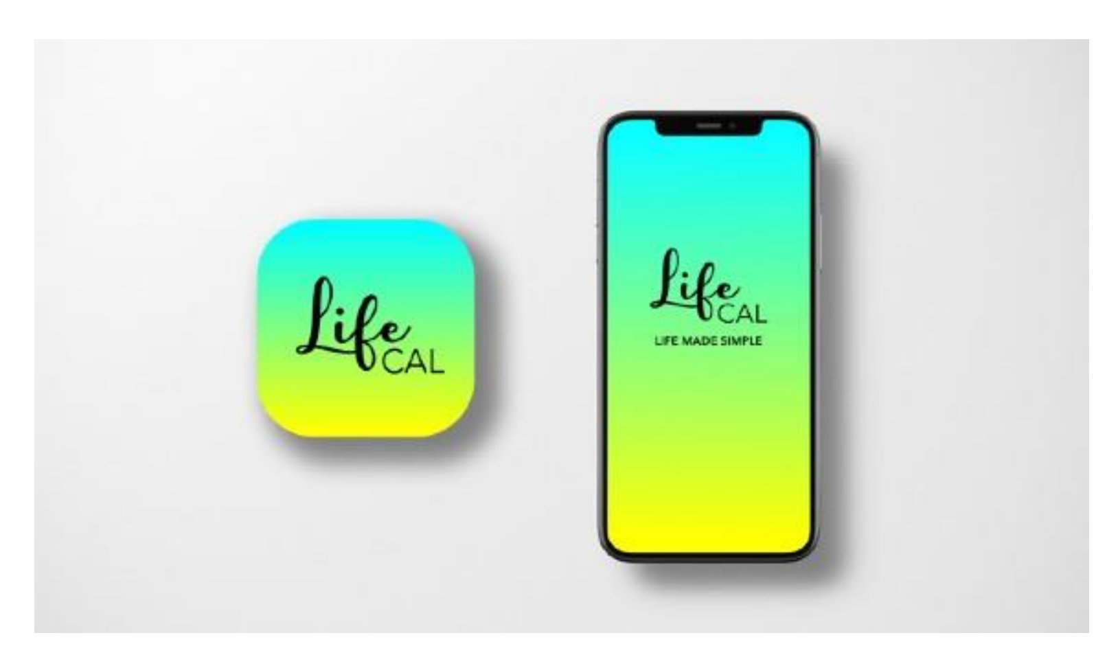
Figure 1: LifeCAL Application Design