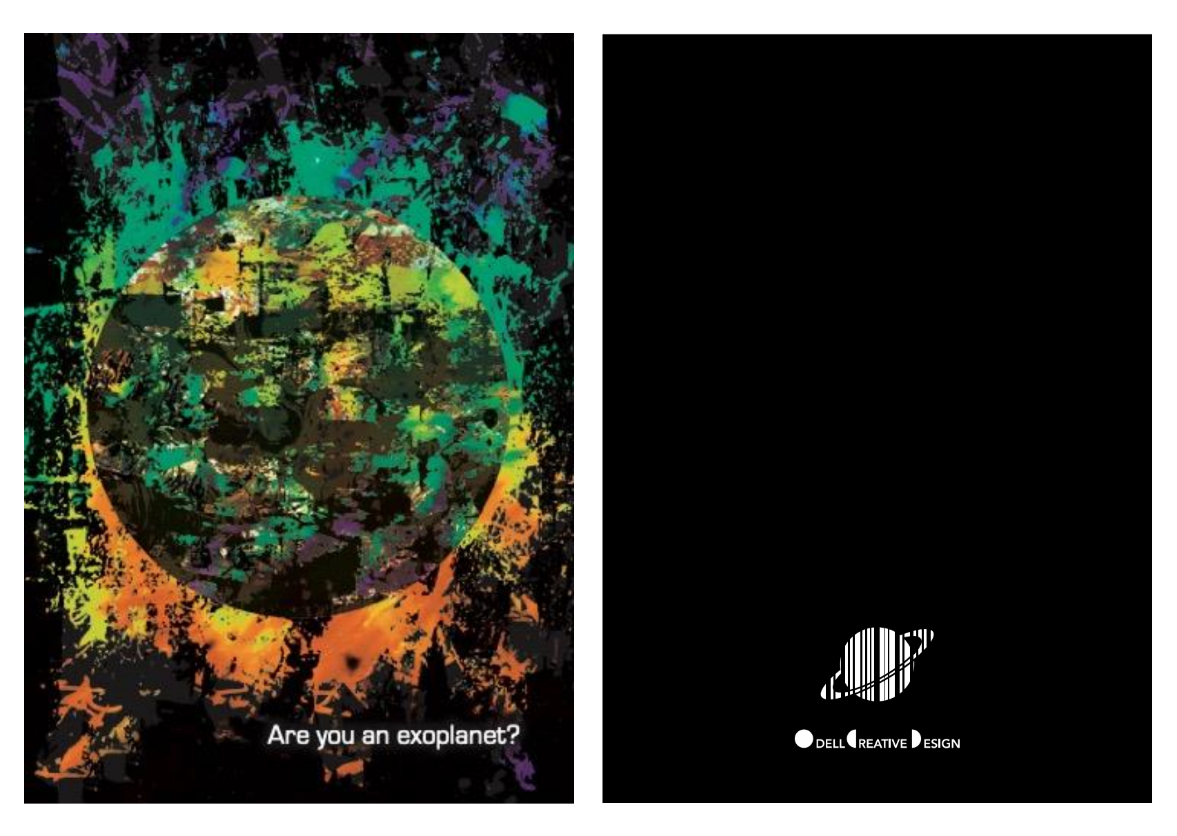
Figure 3: Space Cards – Greeting Card Design Outside