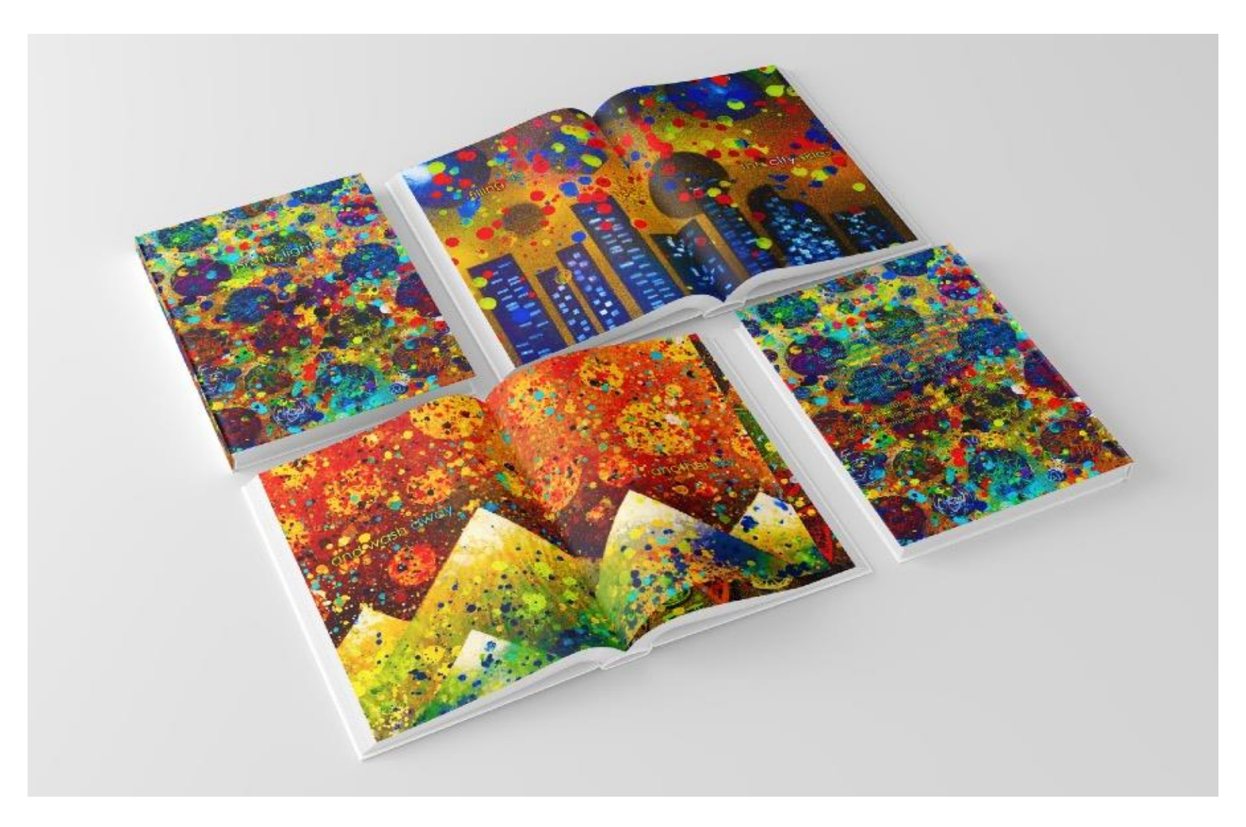
Figure 10: Pretty Lights Illustrated Poem and Book Design