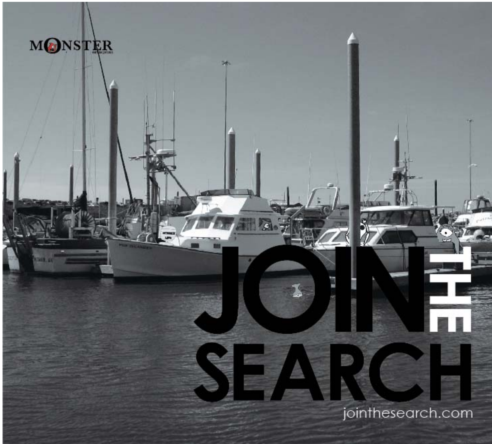
Figure 7: Monster Newspaper Ad.