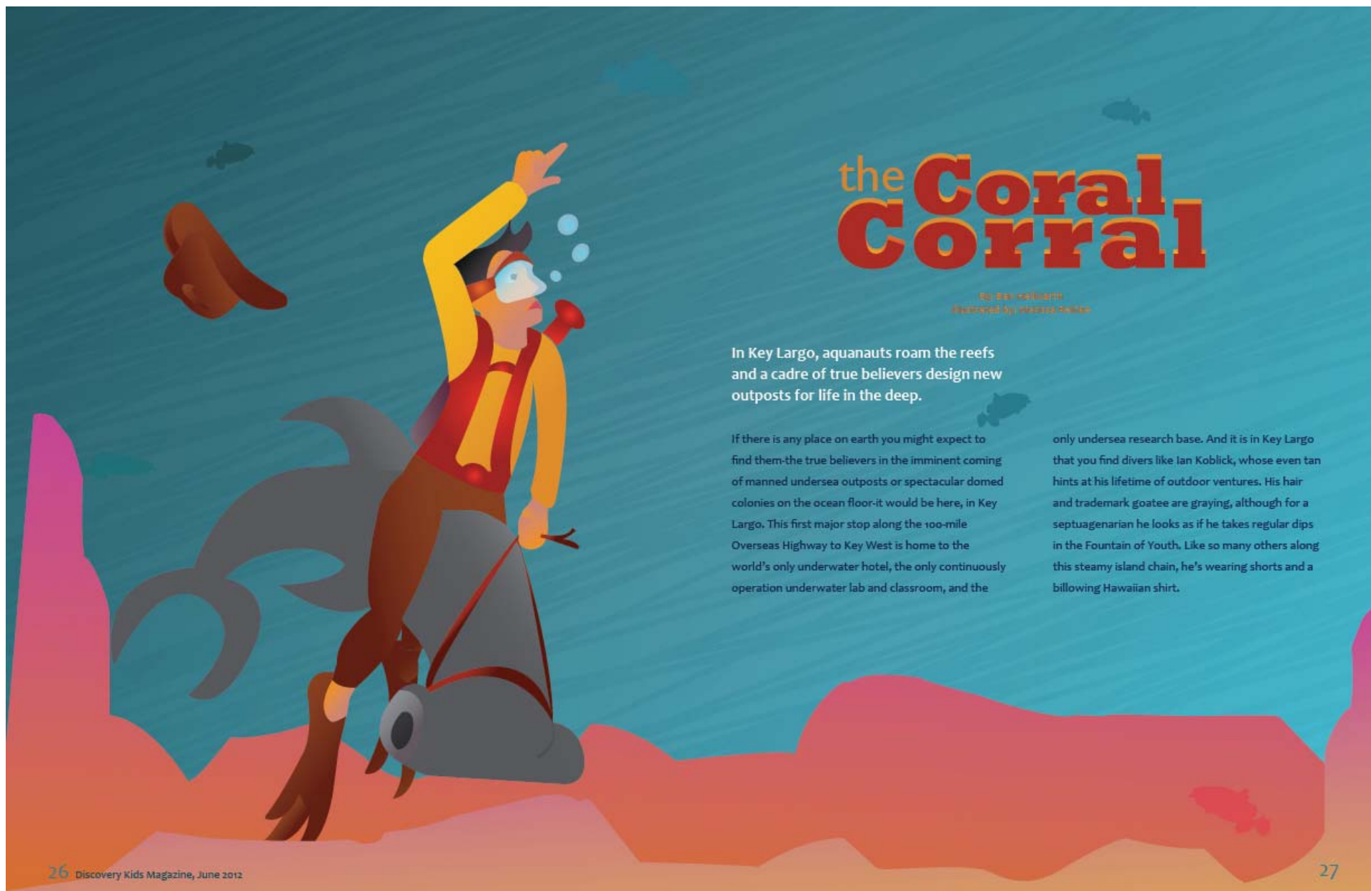
Figure 3: Coral Corral.