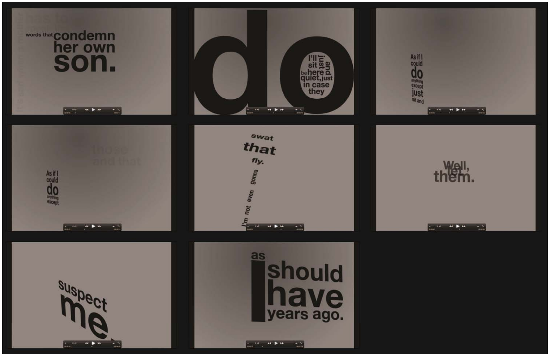
Figure 9: Psycho Story Board.