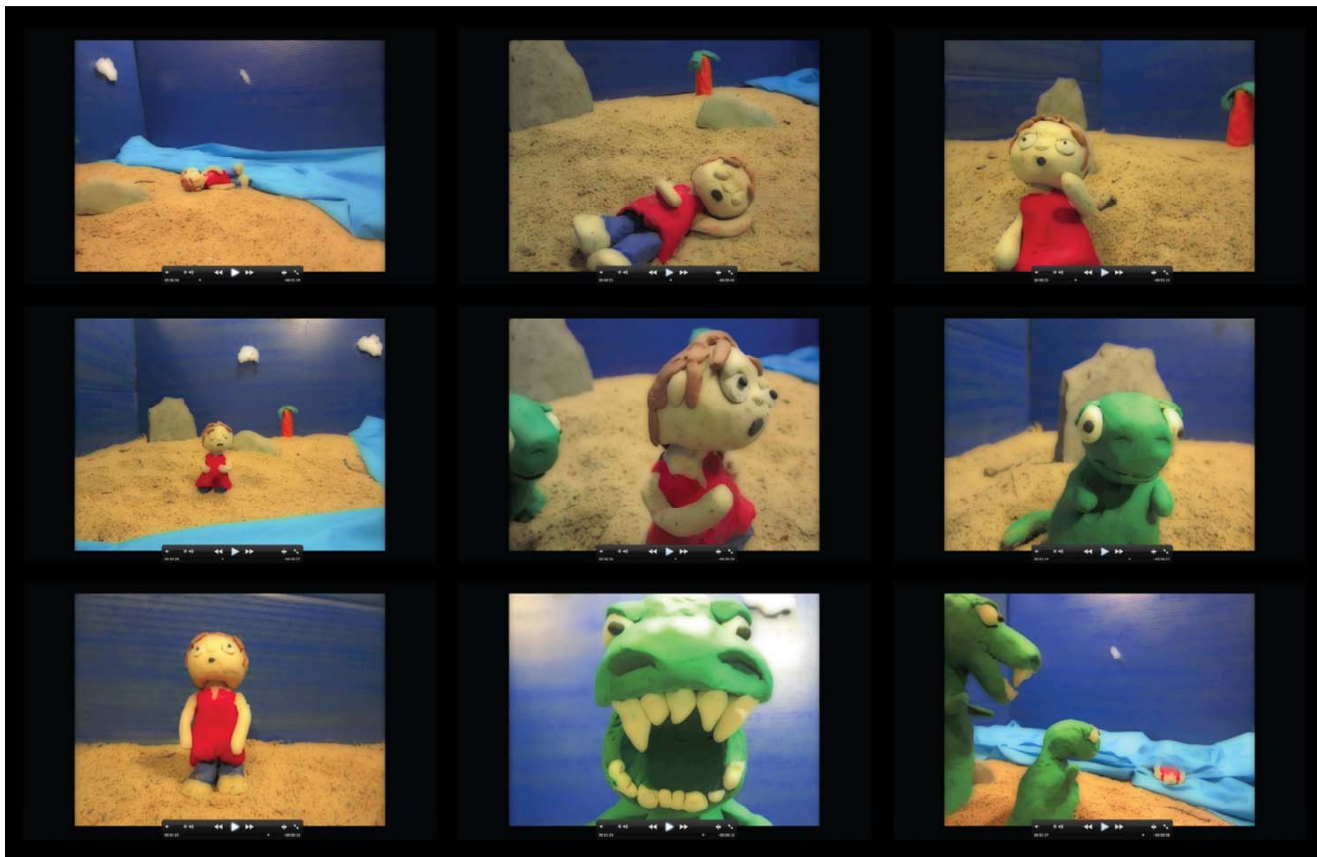
Figure 12: Reinke Stranded.