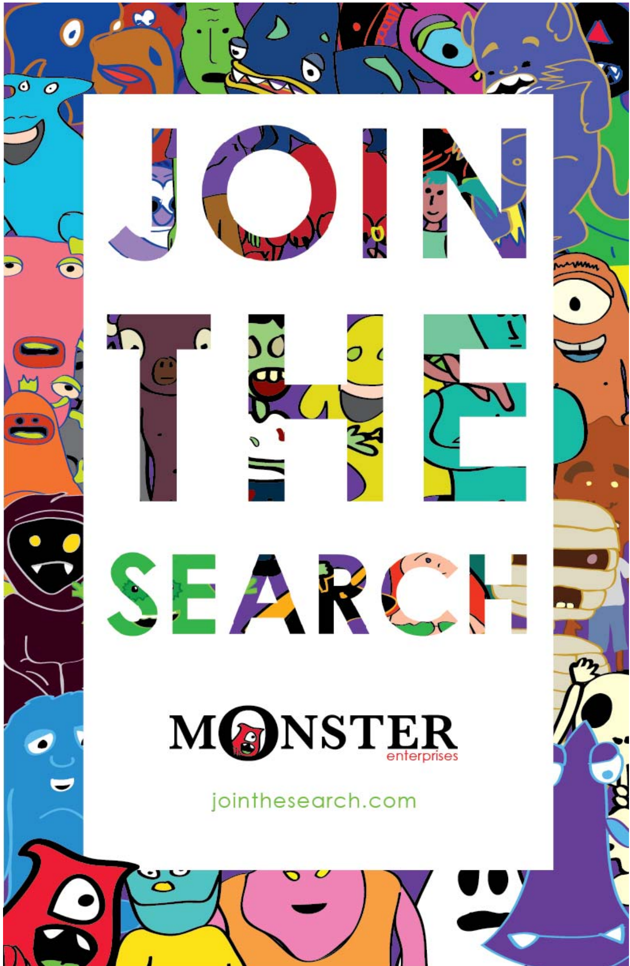
Figure 8: Monster Poster.