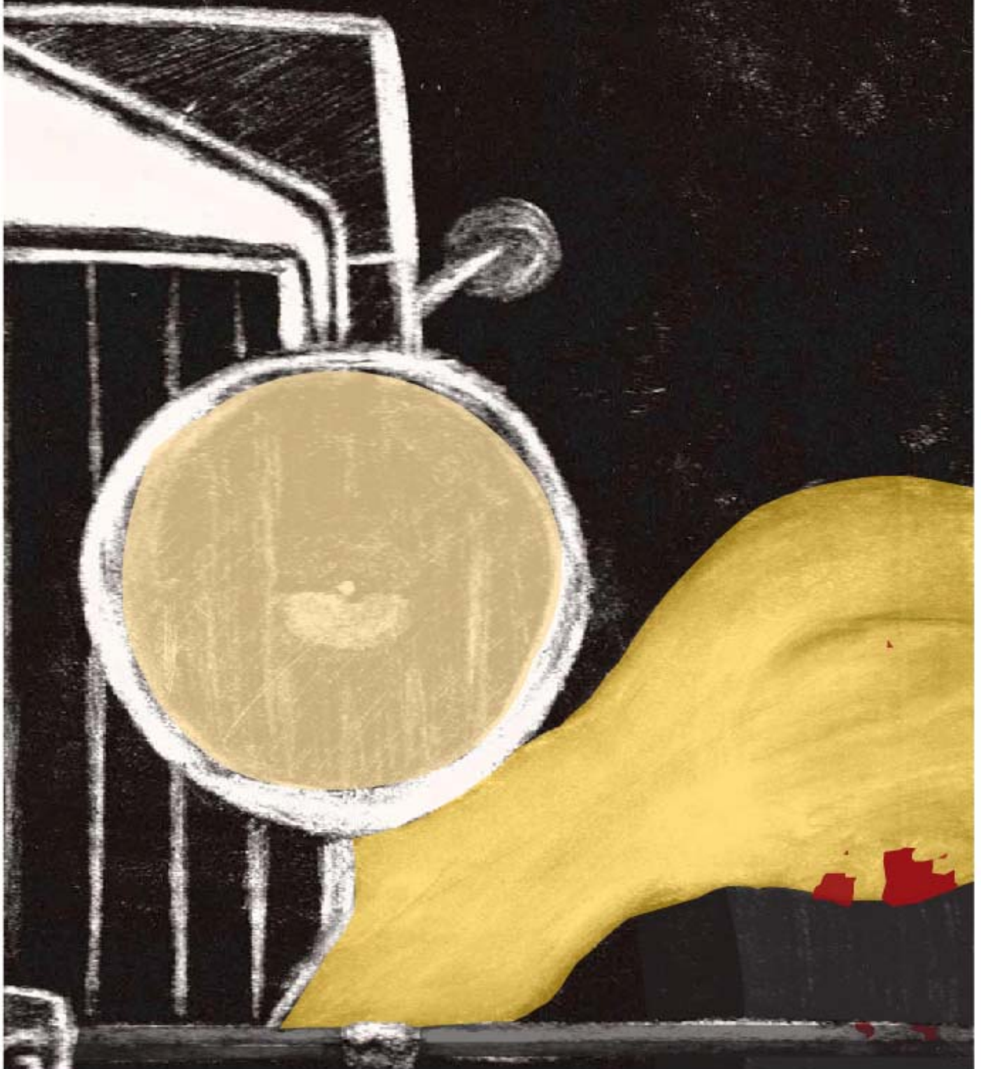
Figure 5: Great Gatsby.