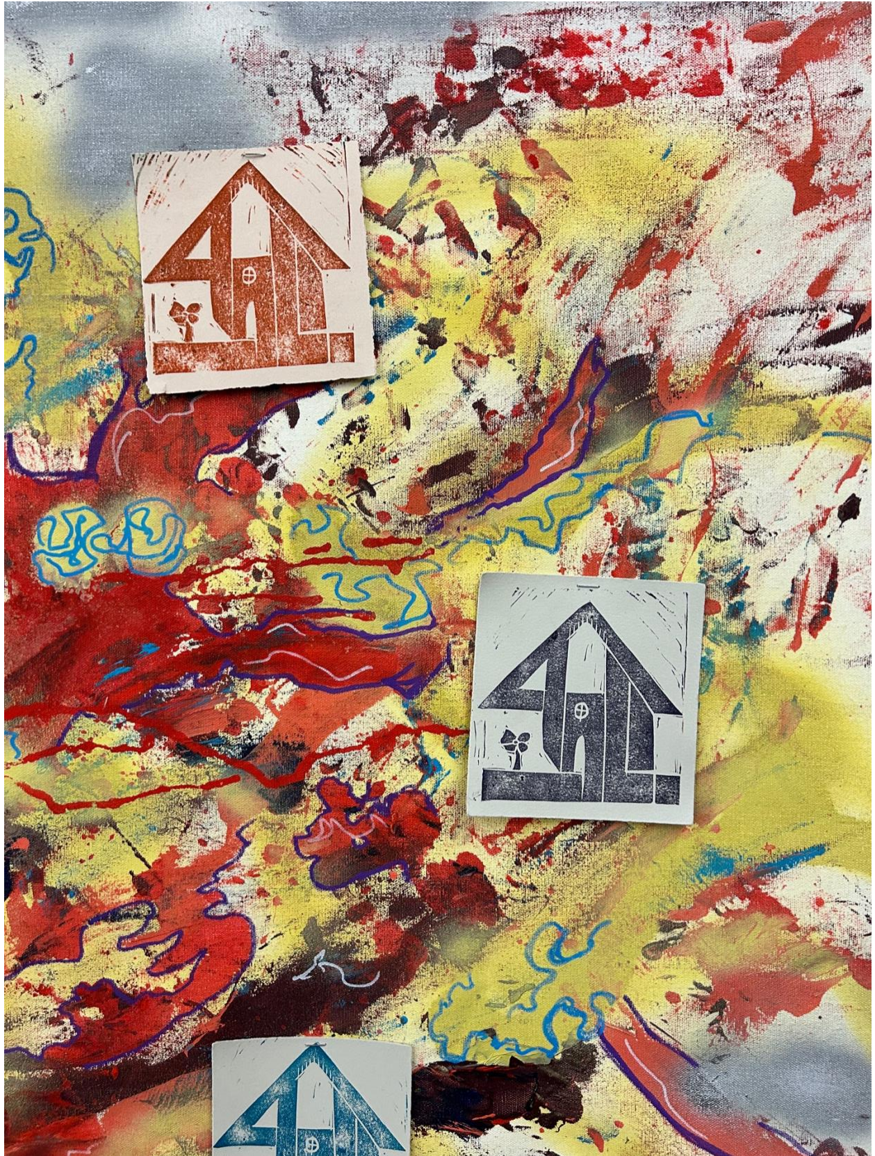
Figure 5: Worldly Frustrations (detail)