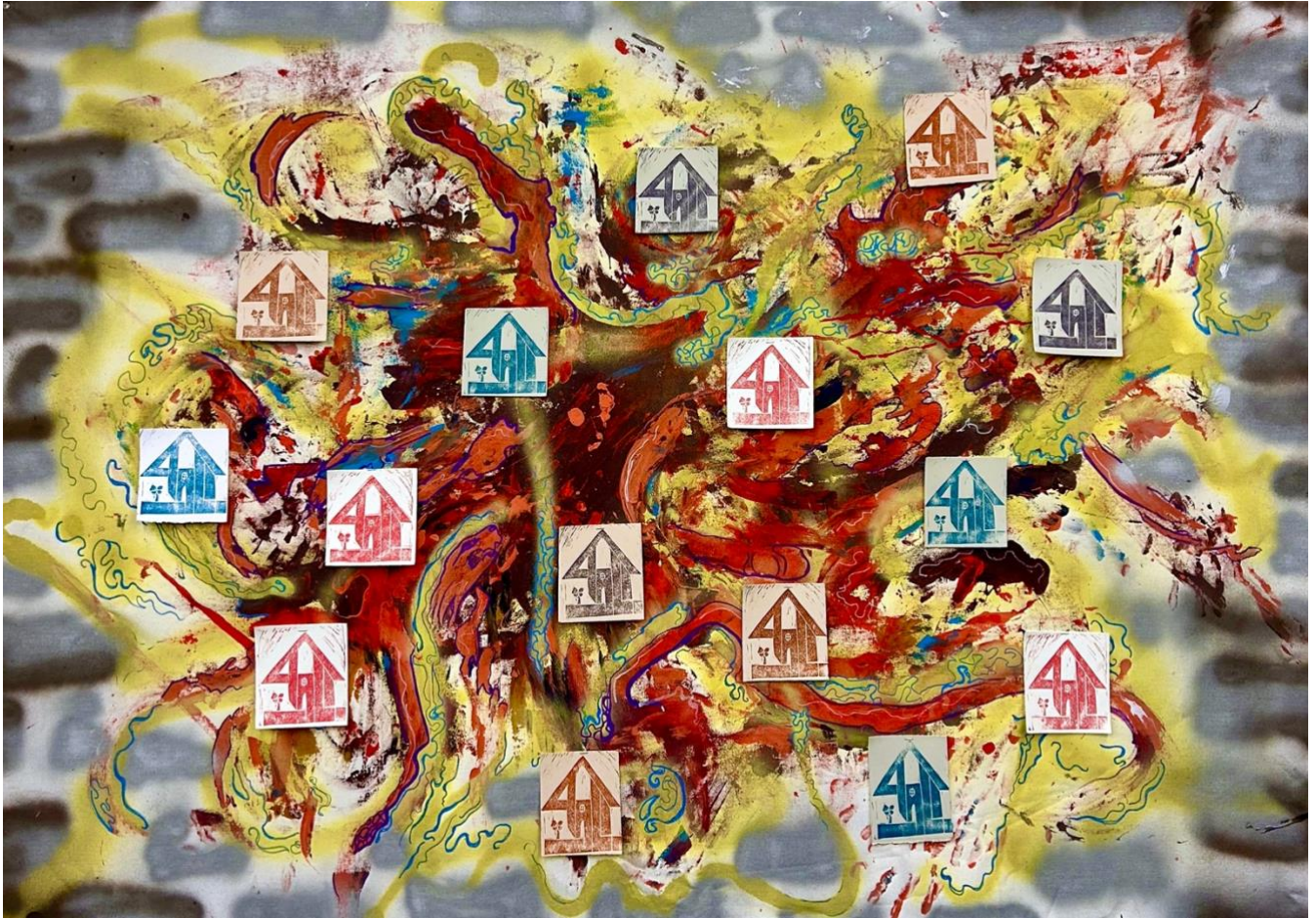
Figure 4: Worldly Frustrations