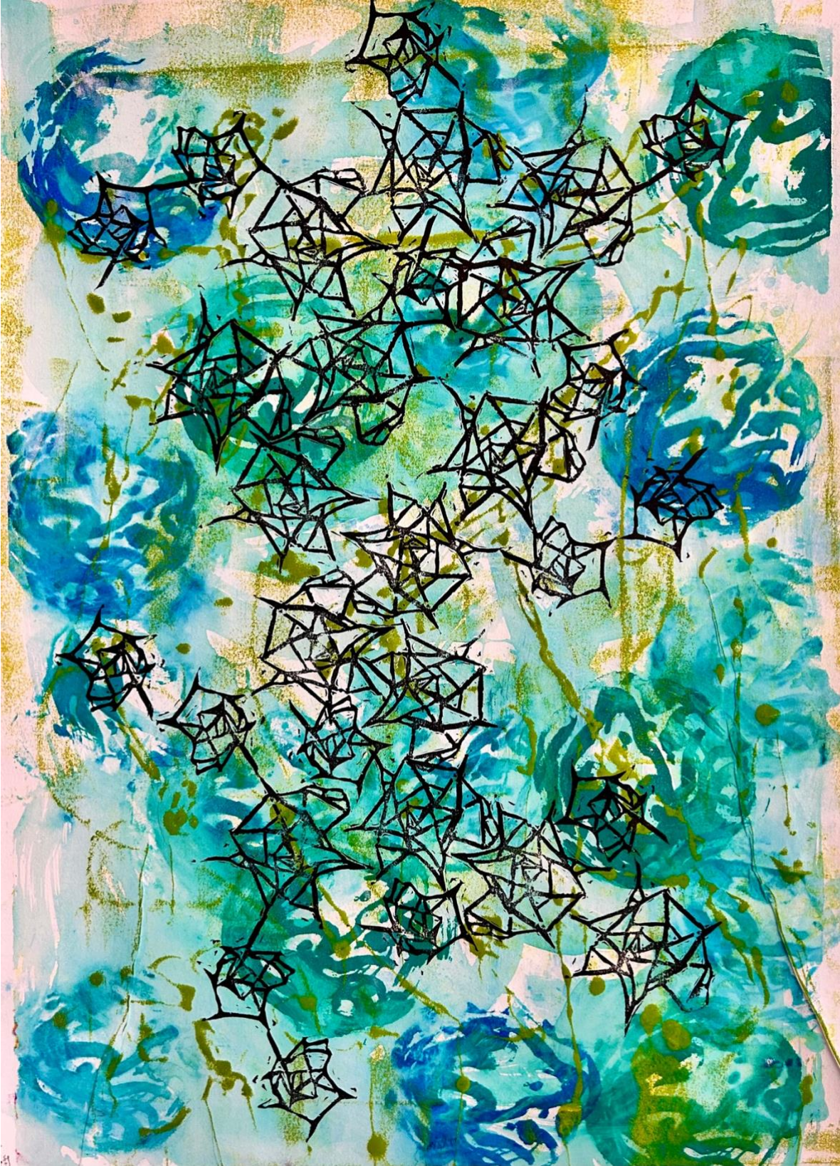
Figure 9: Navigating Improvisation