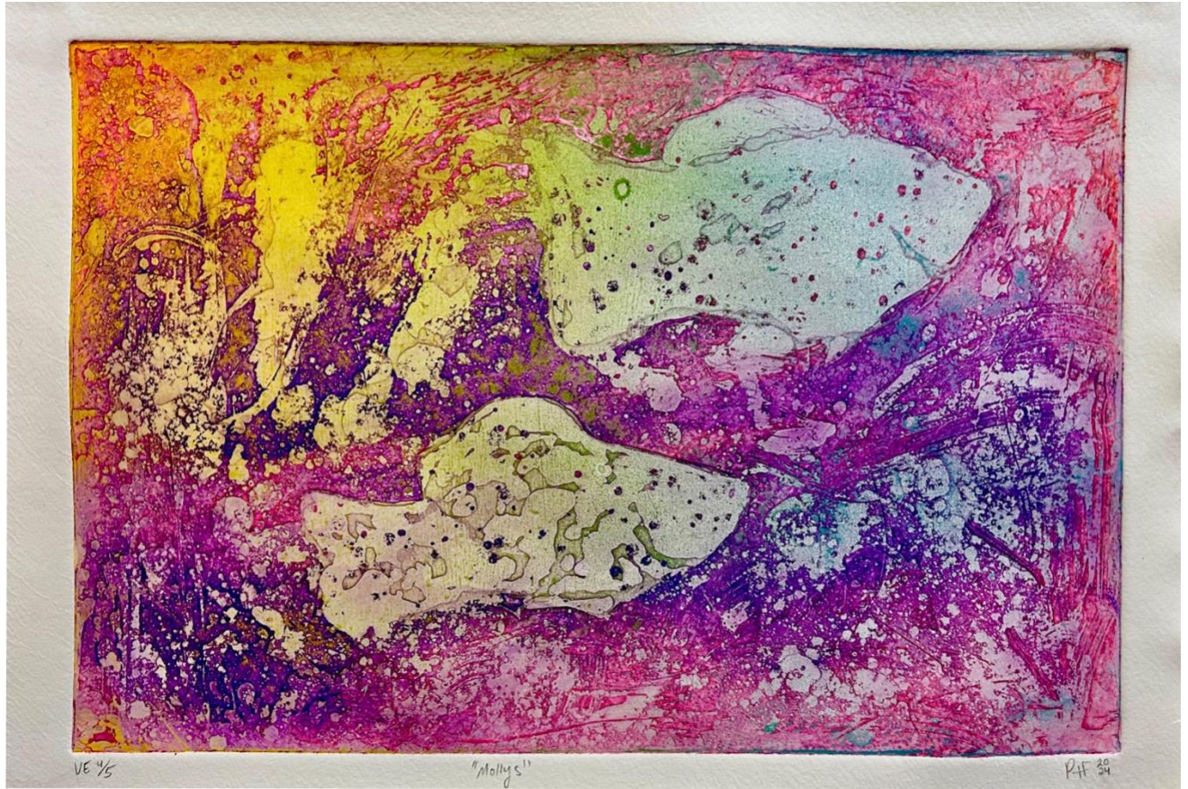
Figure 2: Mollies (Viscosity)