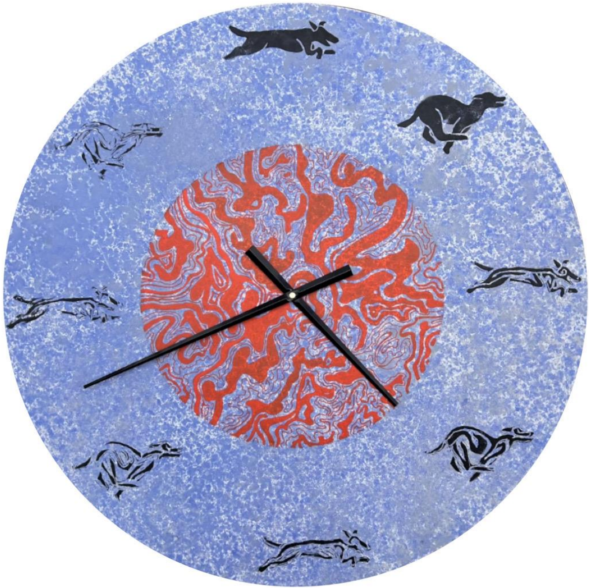
Figure 6: Dog Unwinding