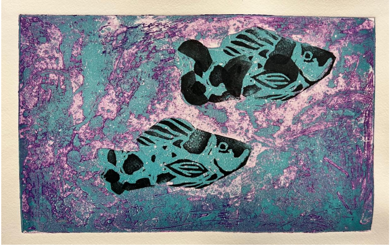
Figure 3: Mollies (Lino)