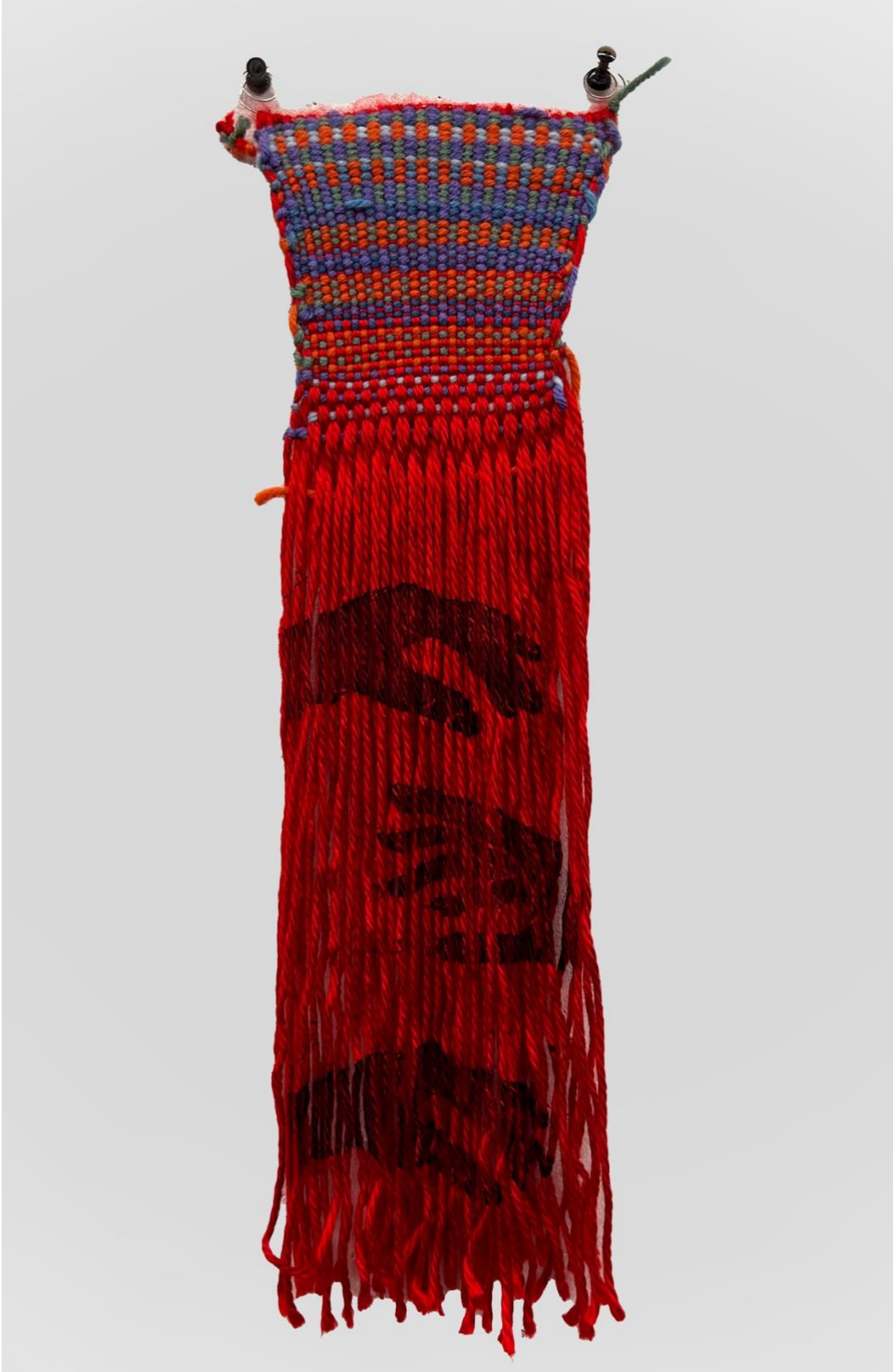
Figure 7: what is an artist without their hands?