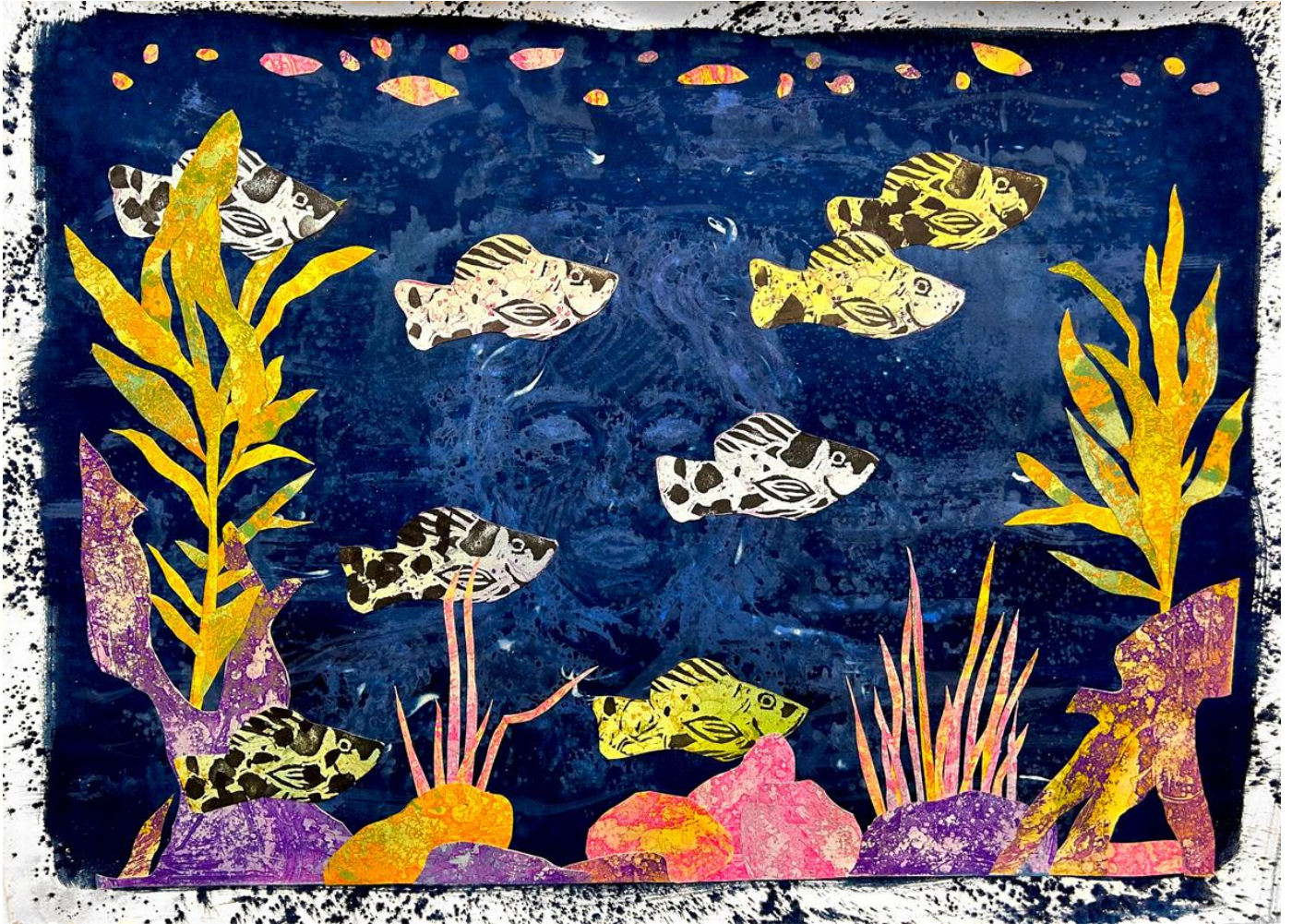
Figure 1: Mollies of Mine