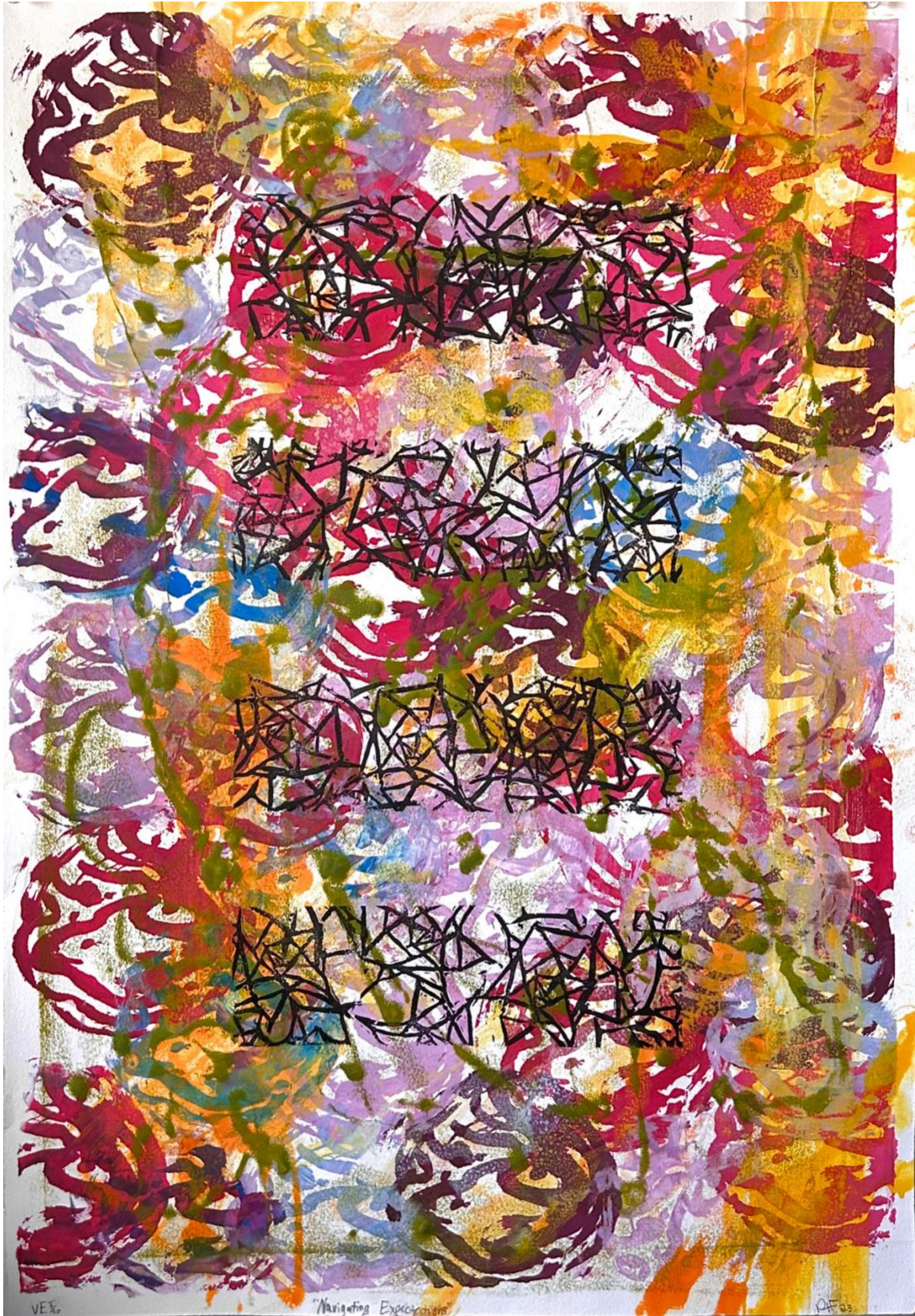
Figure 10: Navigating Expectations