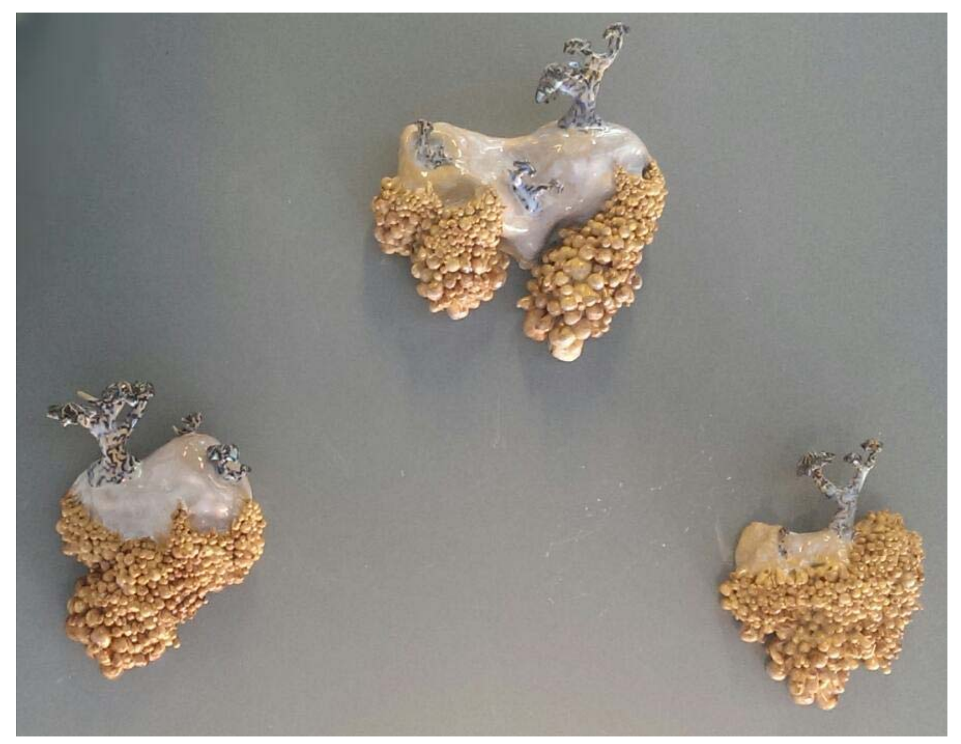
Figure 1: Mountainscape.