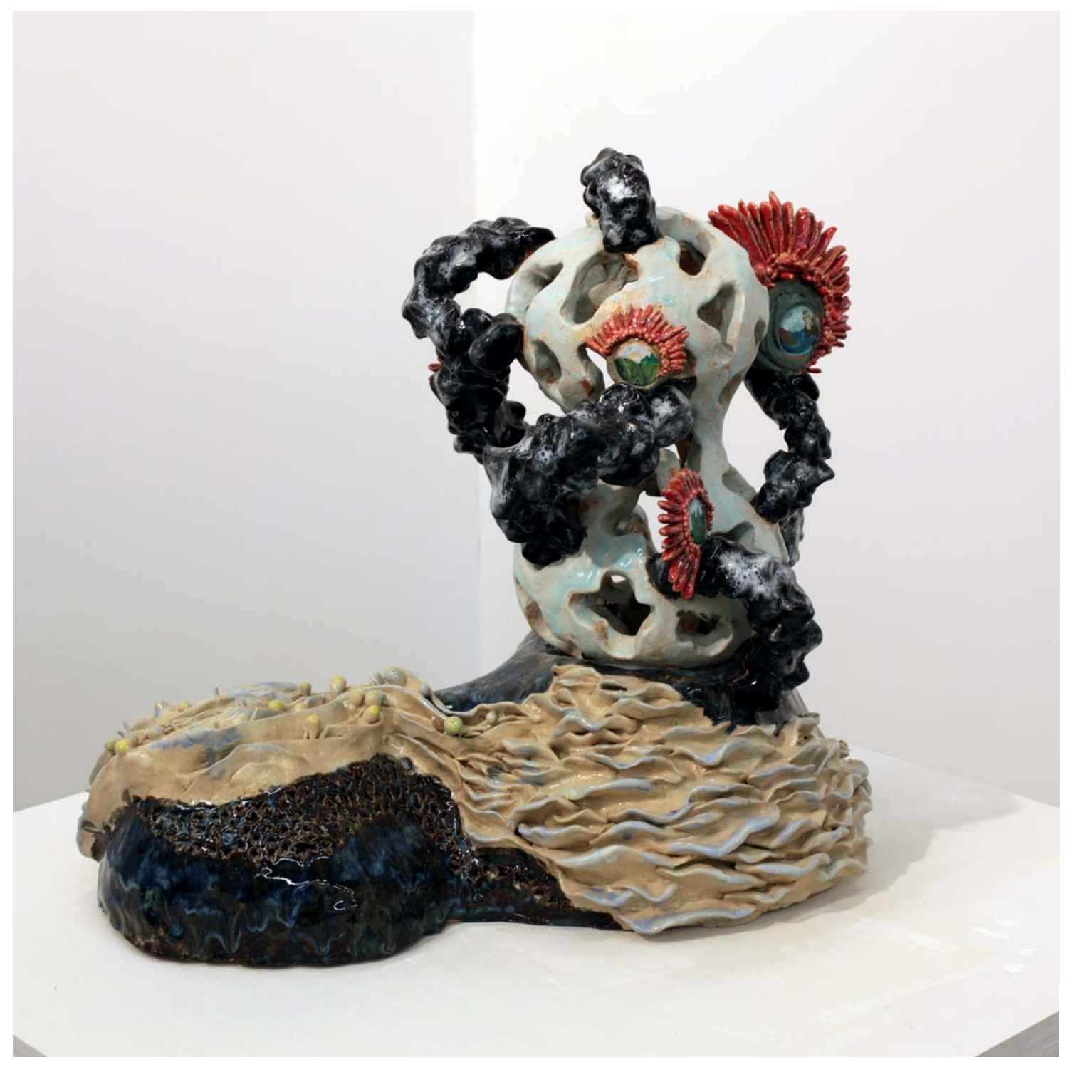
Figure 5: Pathways to a Coral Reefality, front view.