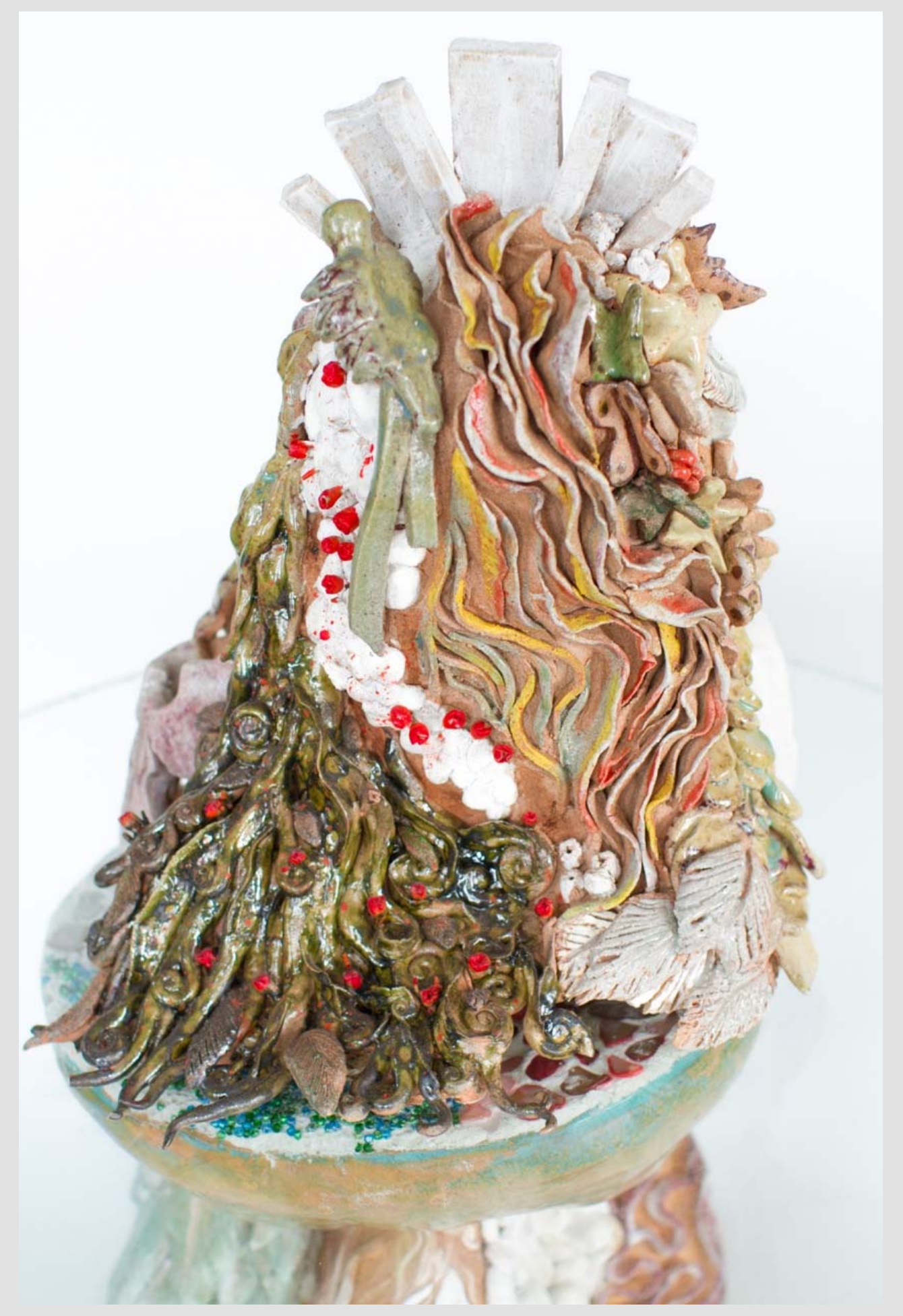
Figure 10: The Fifth Element, detail.