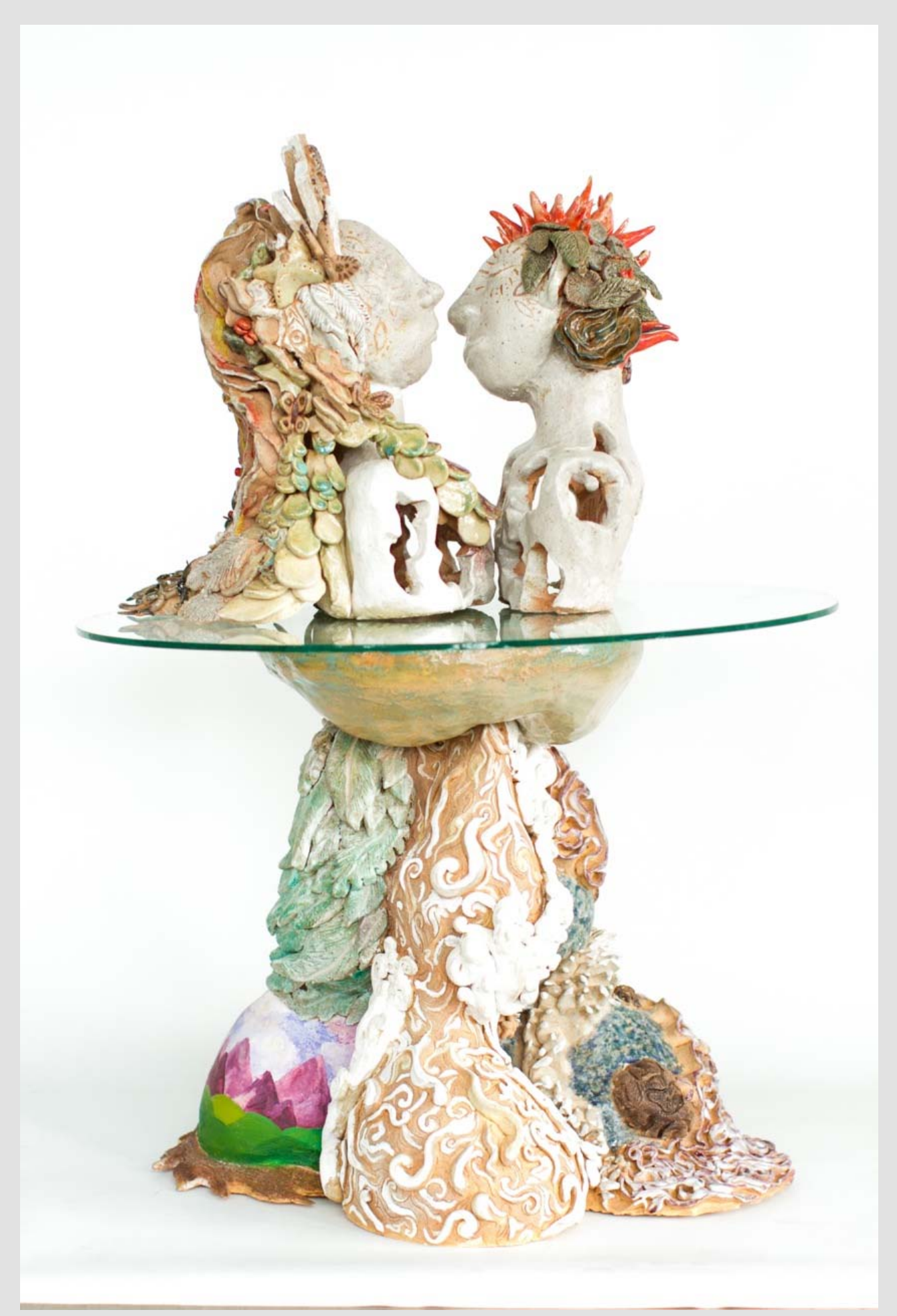
Figure 8: The Fifth Element.