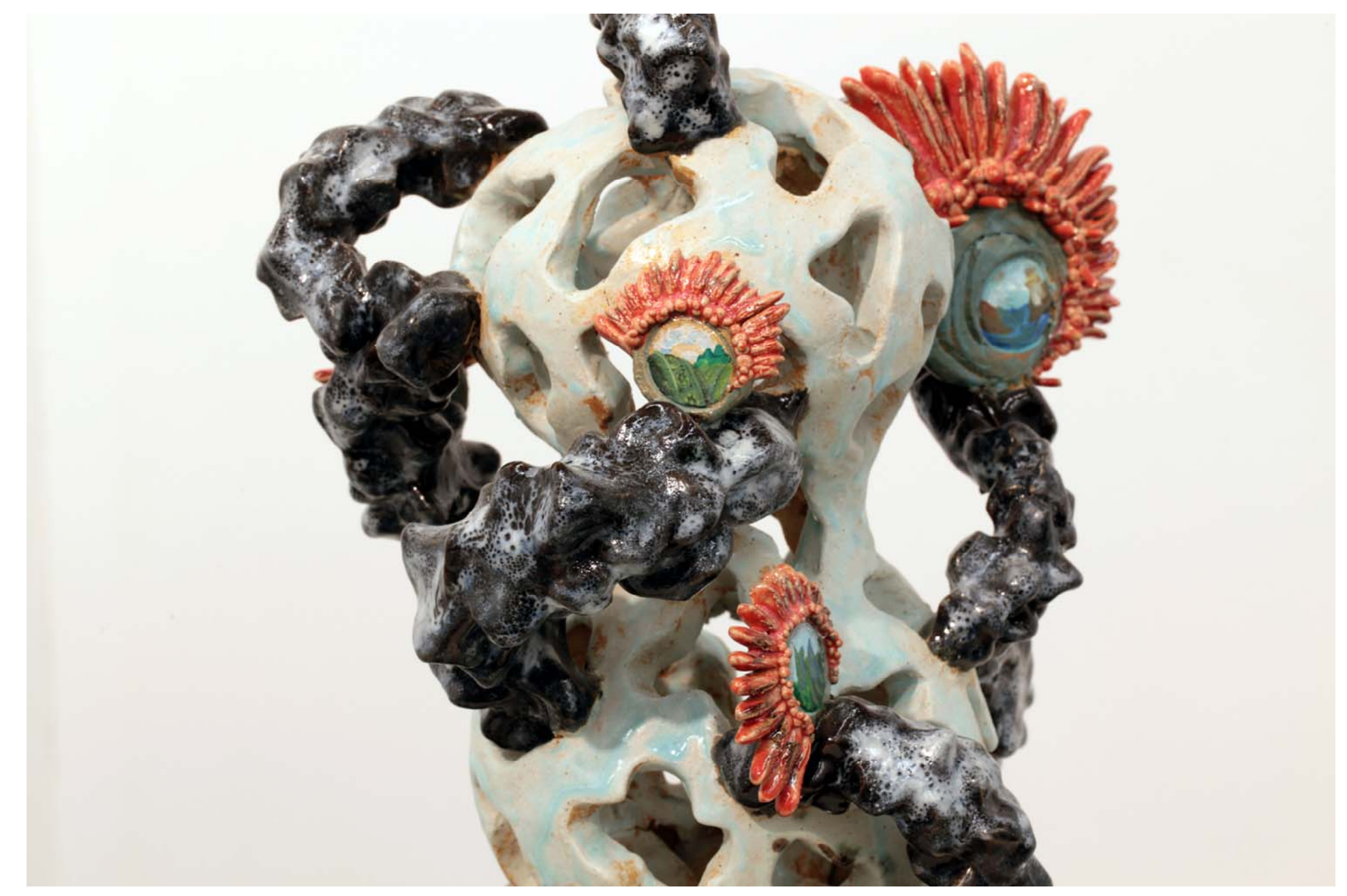
Figure 7: Pathways to a Coral Reefality, detail.