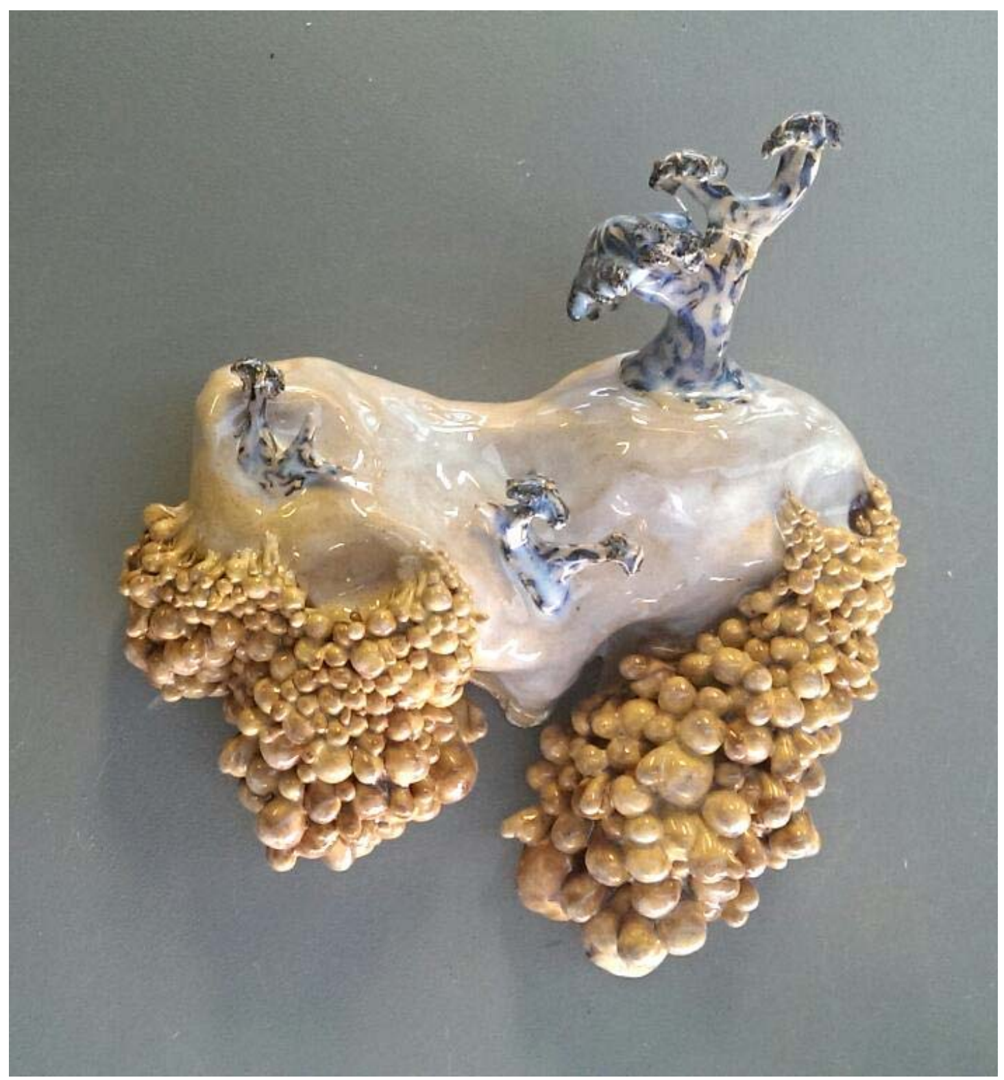
Figure 3: Mountainscape, detail.