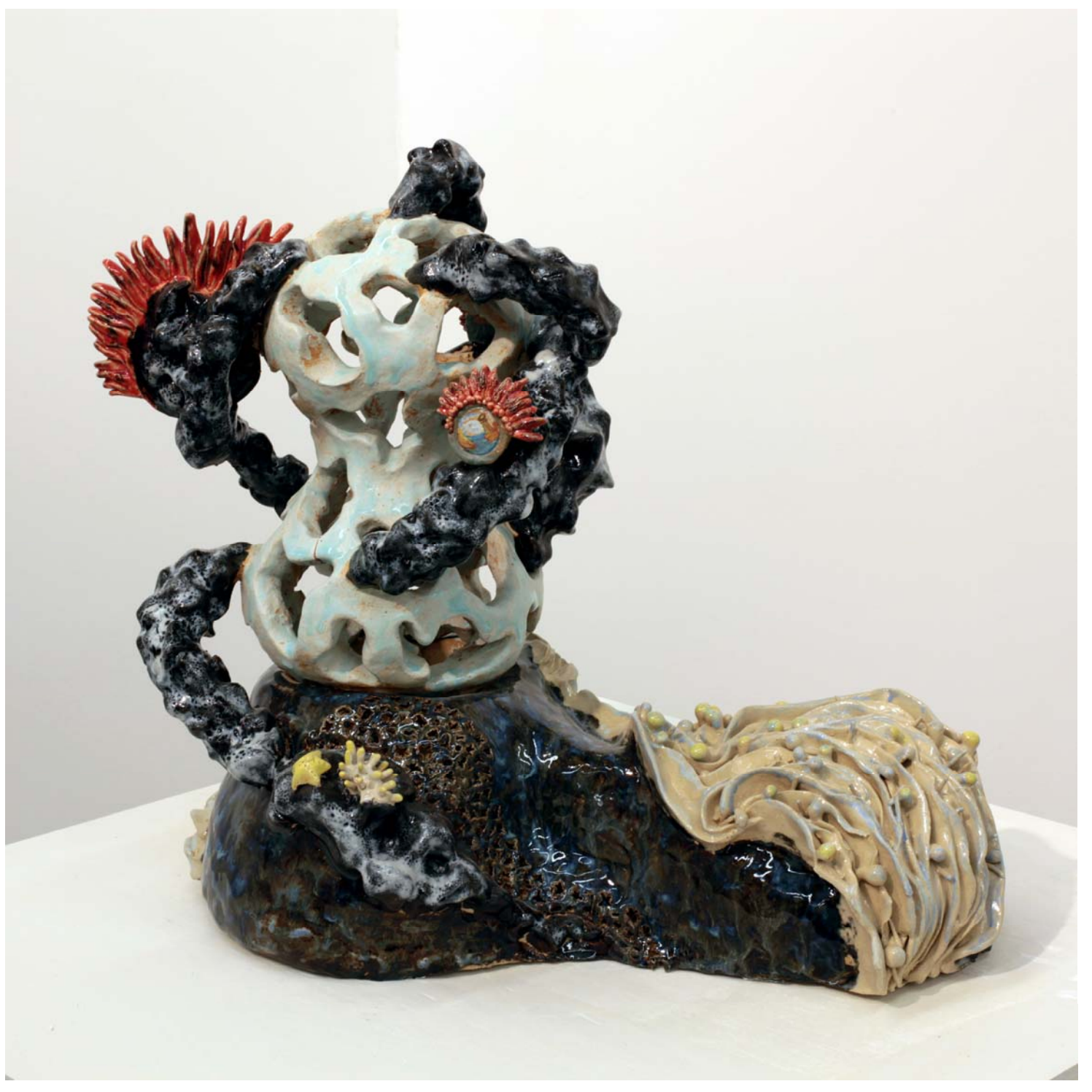
Figure 6: Pathways to a Coral Reefality, back view.