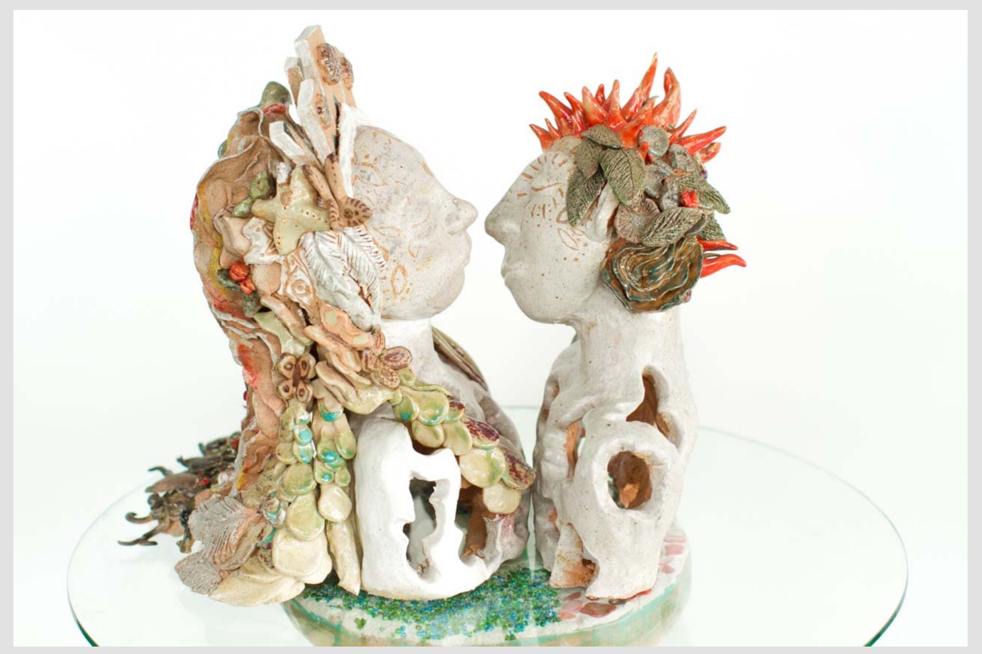
Figure 9: The Fifth Element, detail.