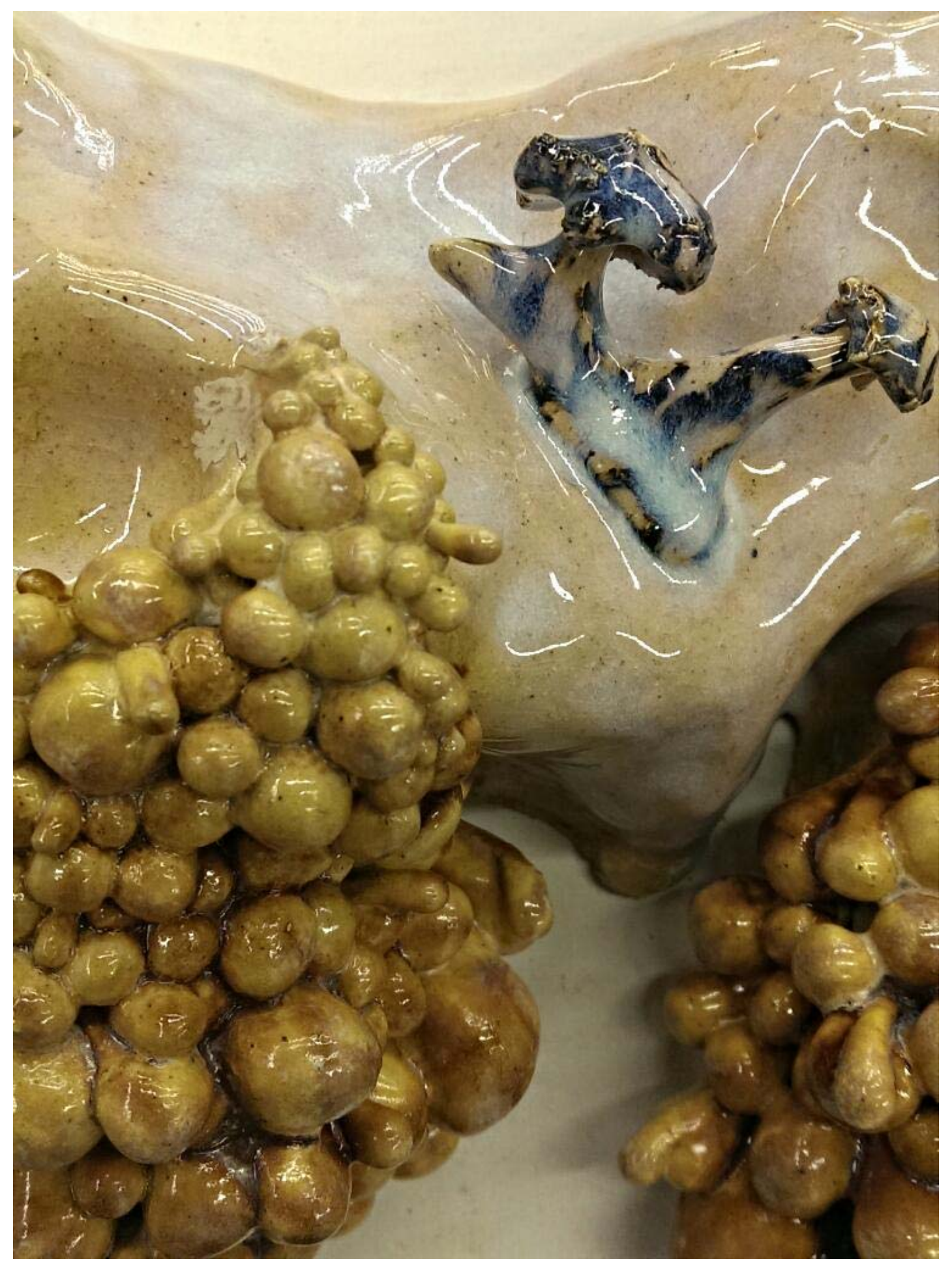
Figure 4: Mountainscape, detail.