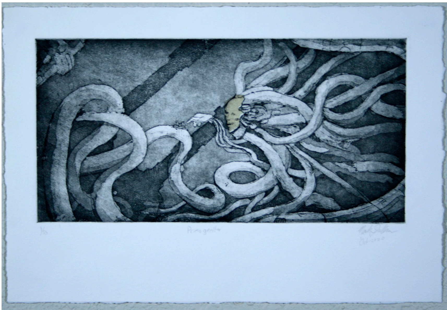
Figure 3: Primogenitor