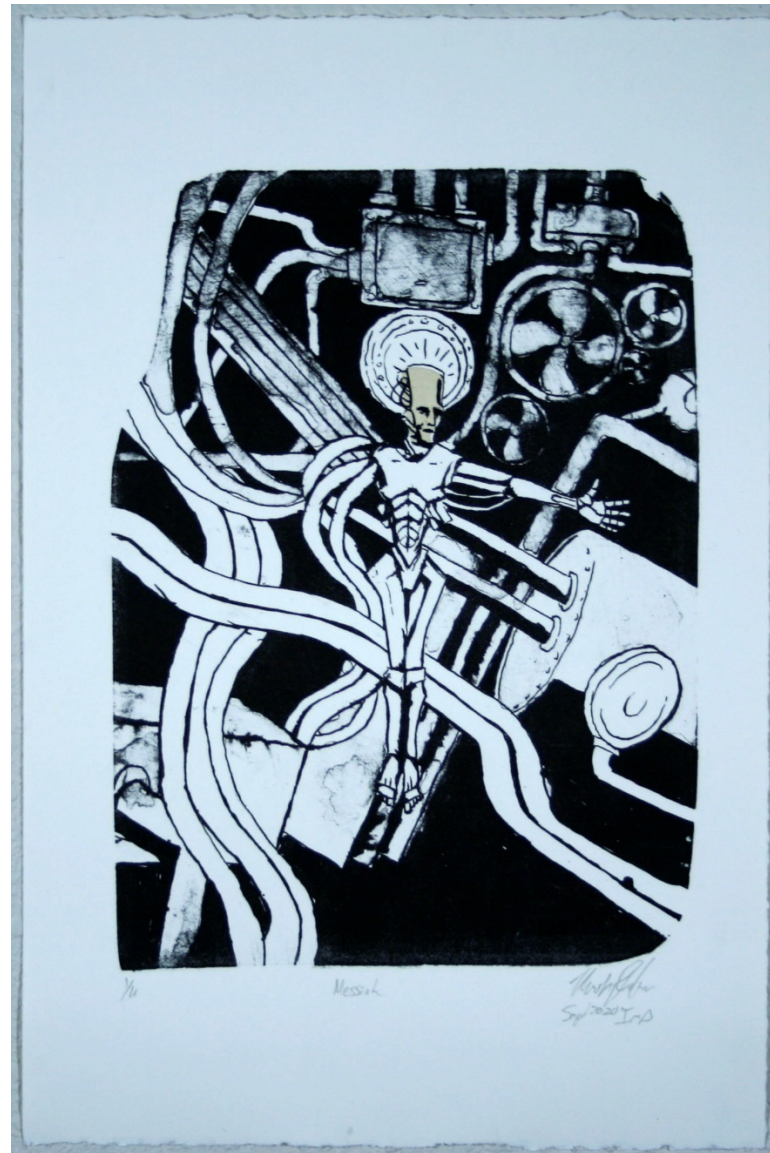
Figure 4: Messiah