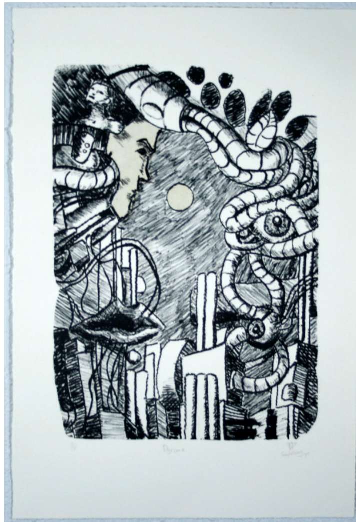
Figure 2: Dynamo