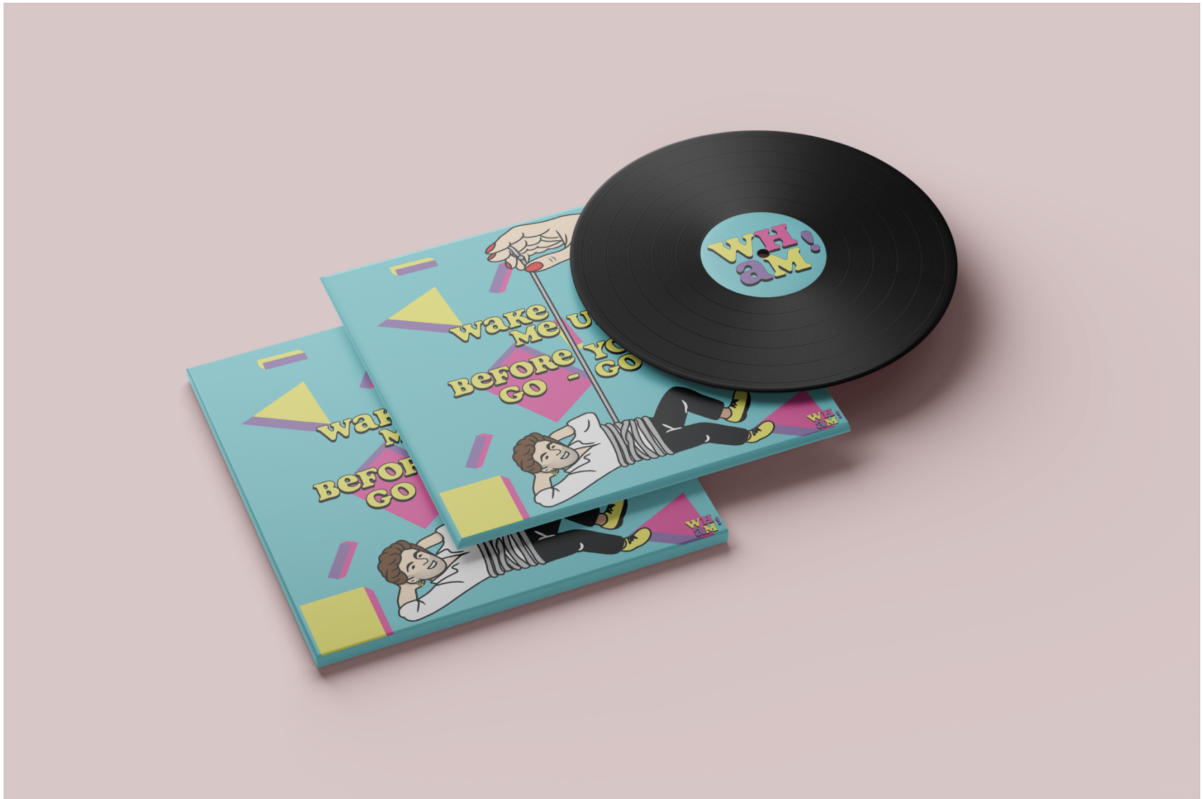
Figure 6: Album Cover Design