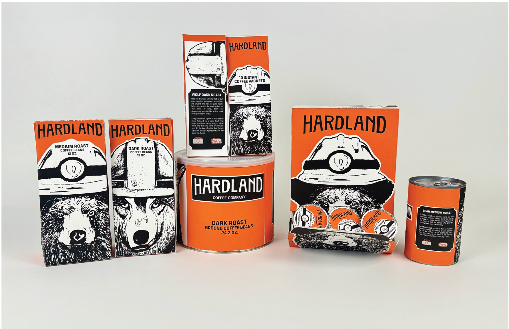
Figure 1: HardLand