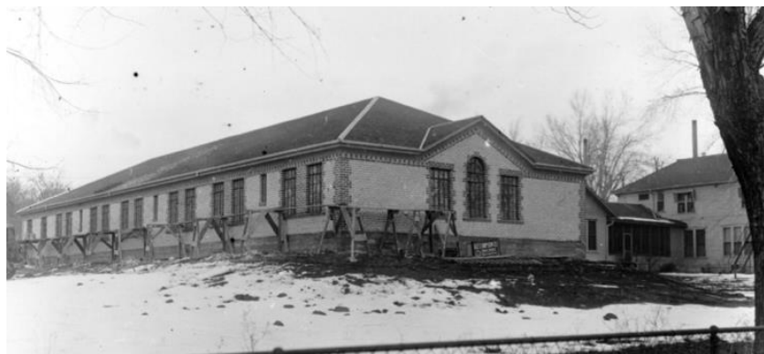
Figure 4- View of the brick addition to Sands House Sanatorium – 1931-32; Photo from “Photographs - Western History,” DC, https://digital.denverlibrary.org/nodes/view/1099599 .

Long served as the Medical Director of Sands House sanatorium for impoverished women and girls. In 1913, a young woman who had contracted tuberculosis arrived on the