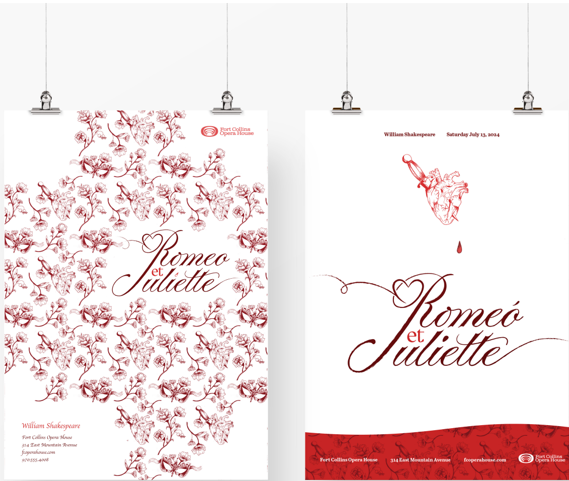
Figure 2: Romeo et Juliette Opera Poster