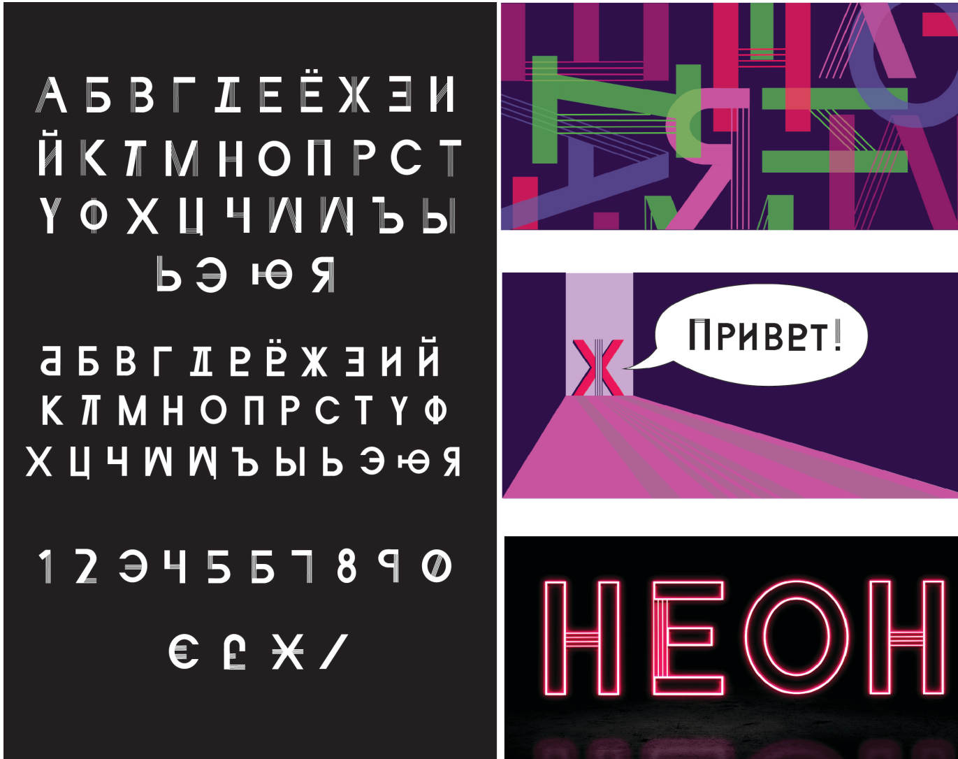
Figure 4: Cyrillic Typeface