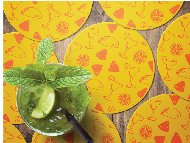
Figure 3: Tortilla Marissa's Rebrand