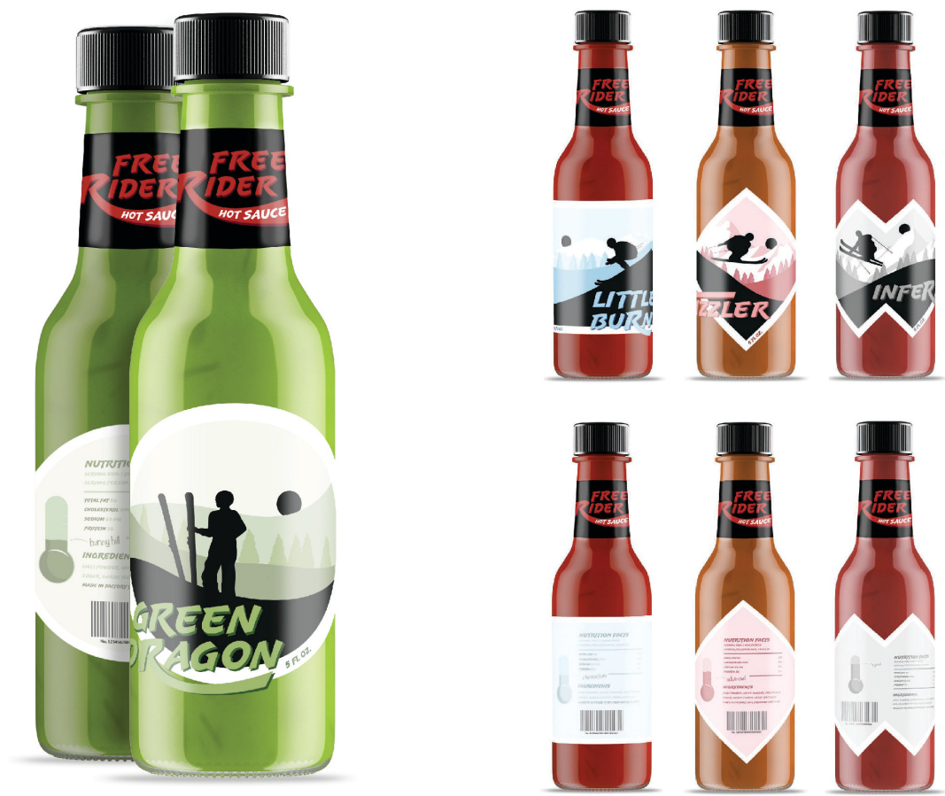
Figure 5: Free Rider Hot Sauce Bottles