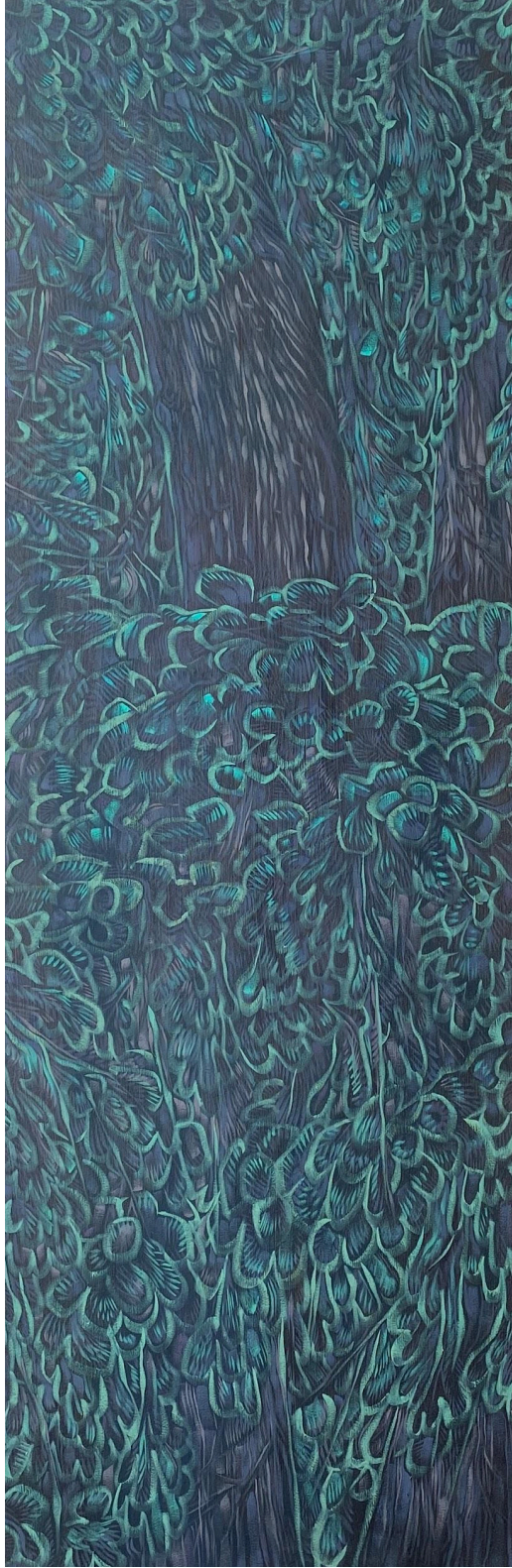
Figure 3: Archaic Forms 1