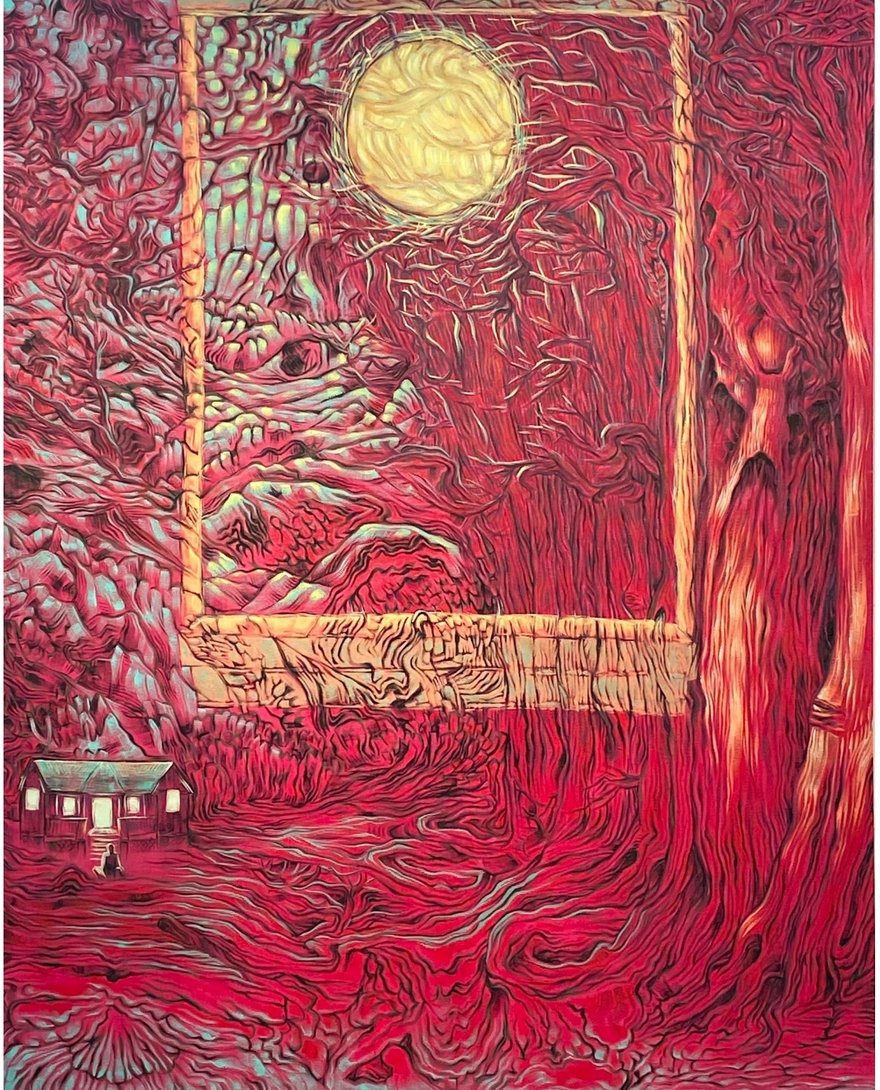
Figure 2: Witching Season