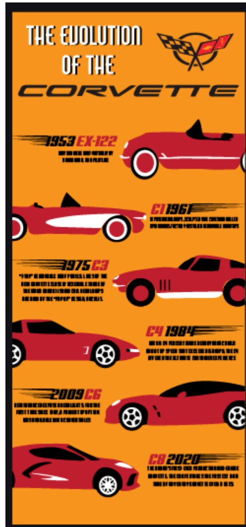
Figure 10: THE EVOLUTION OF THE CORVETTE