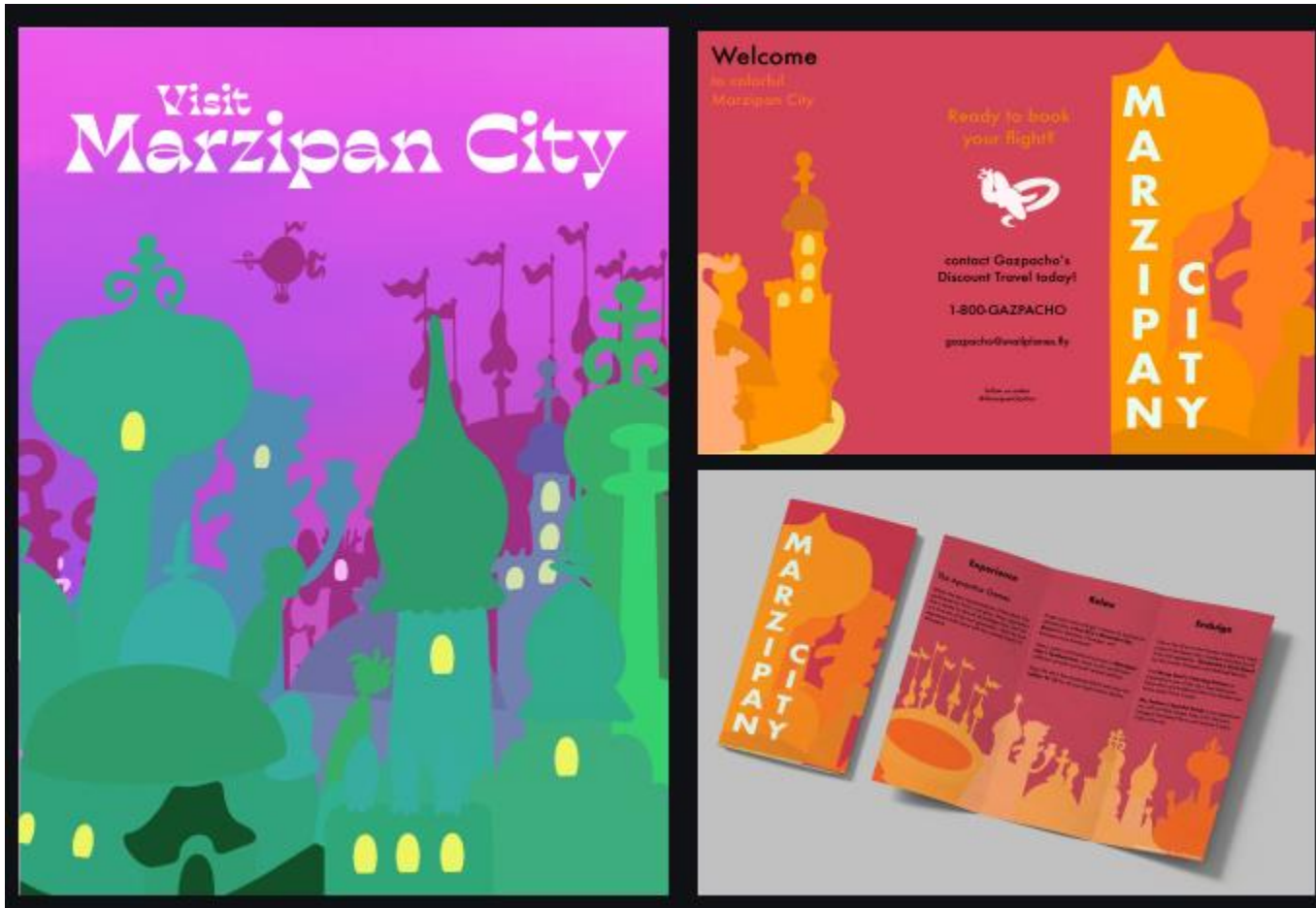
Figure 7: MARZIPAN CITY TRAVEL PROPOSAL