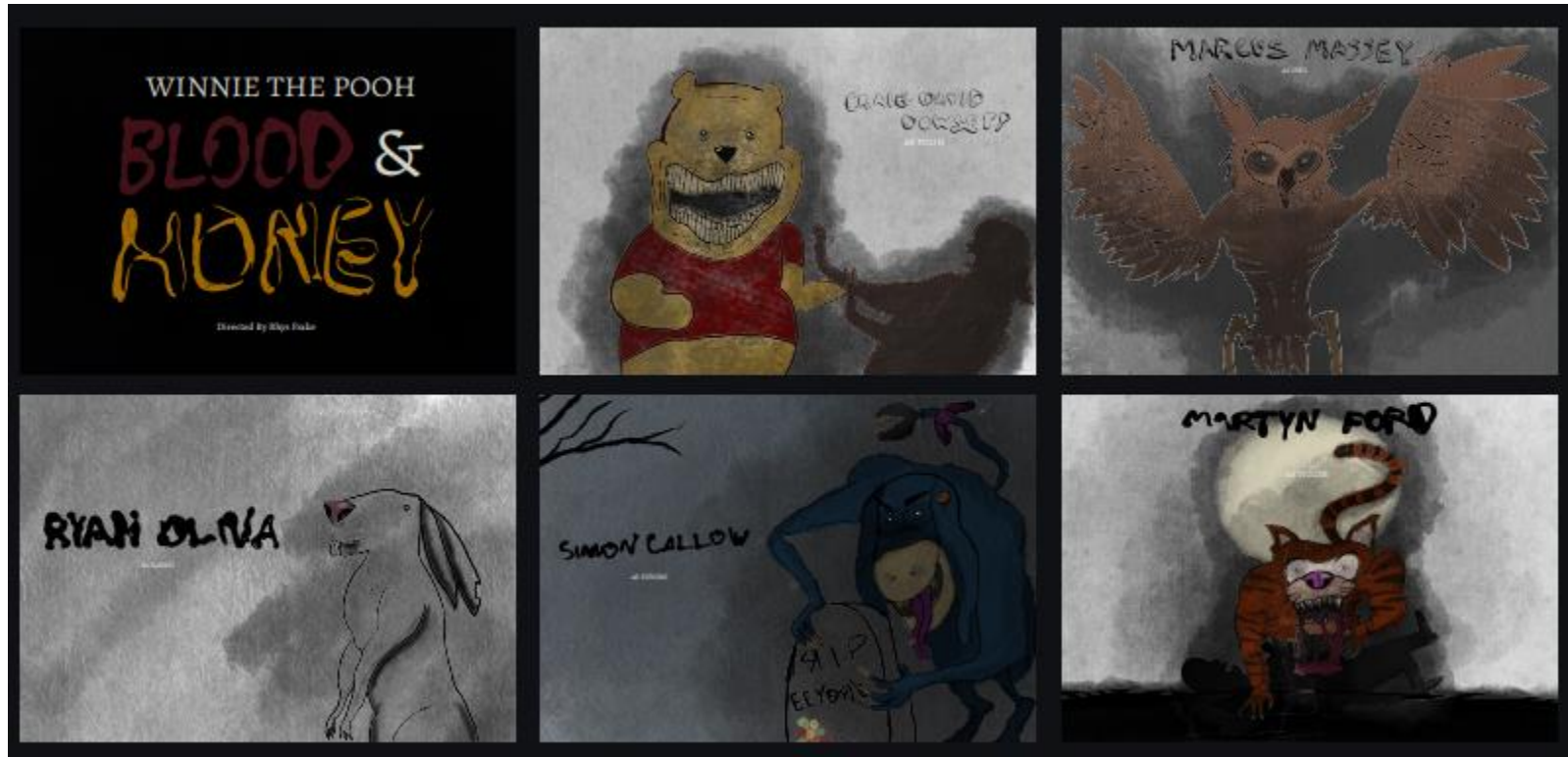
Figure 5: WINNIE THE POOH: BLOOD AND HONEY