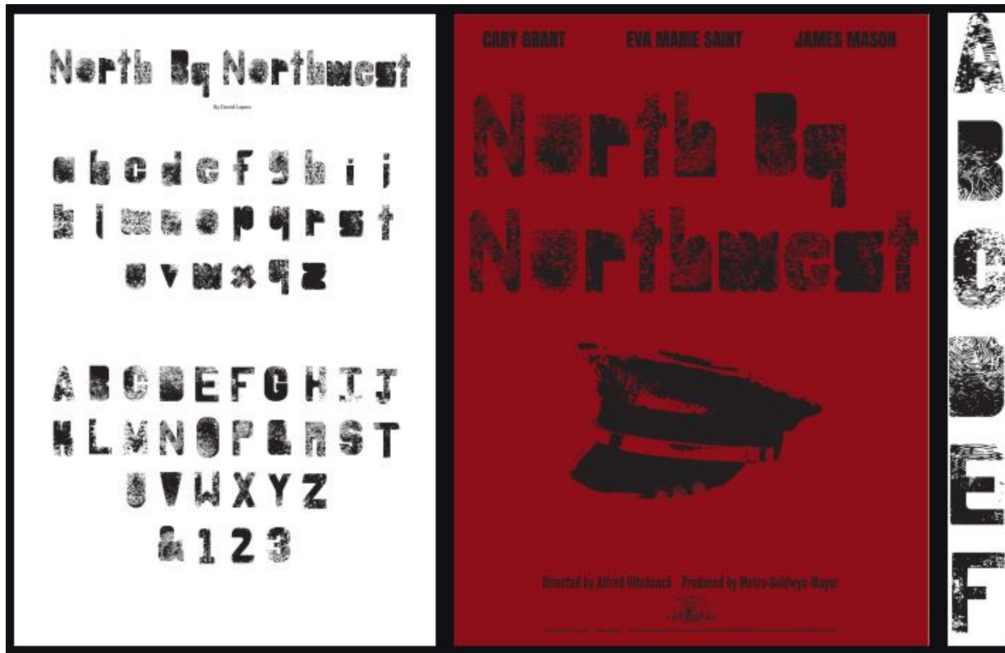
Figure 6: NORTH BY NORTHWEST