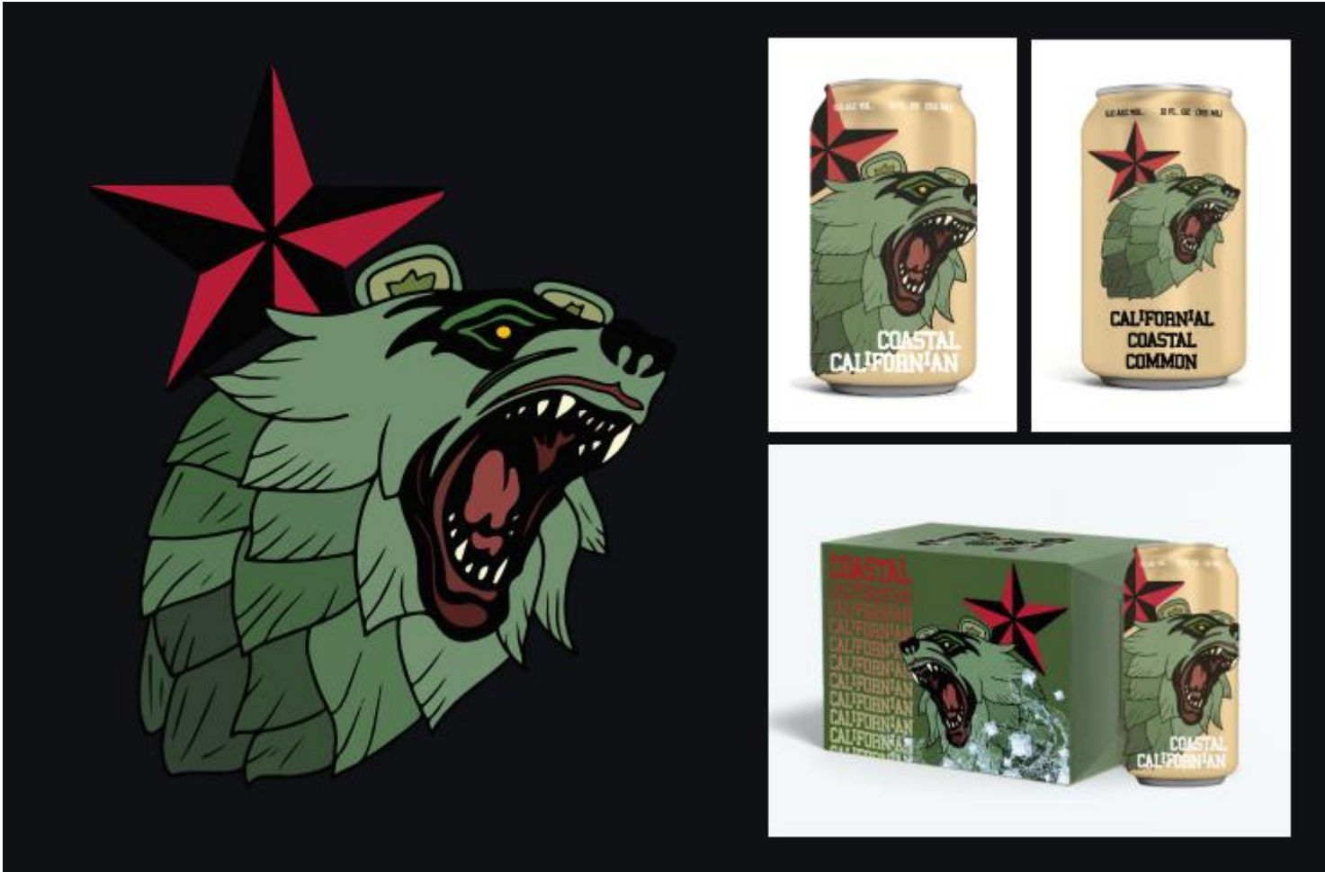
Figure 2: COASTAL CALIFORNIAN BRANDING