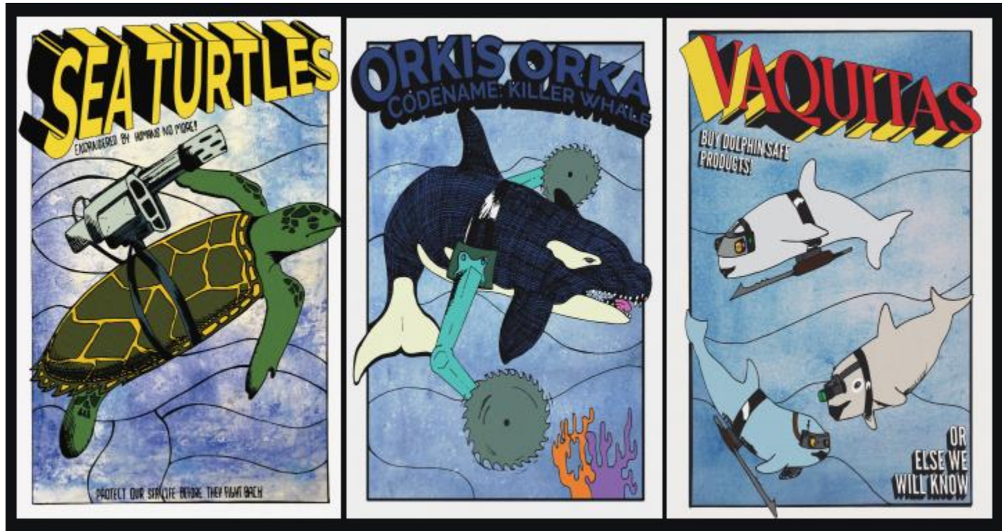
Figure 4: SEALIFE CONSERVATION SERIES