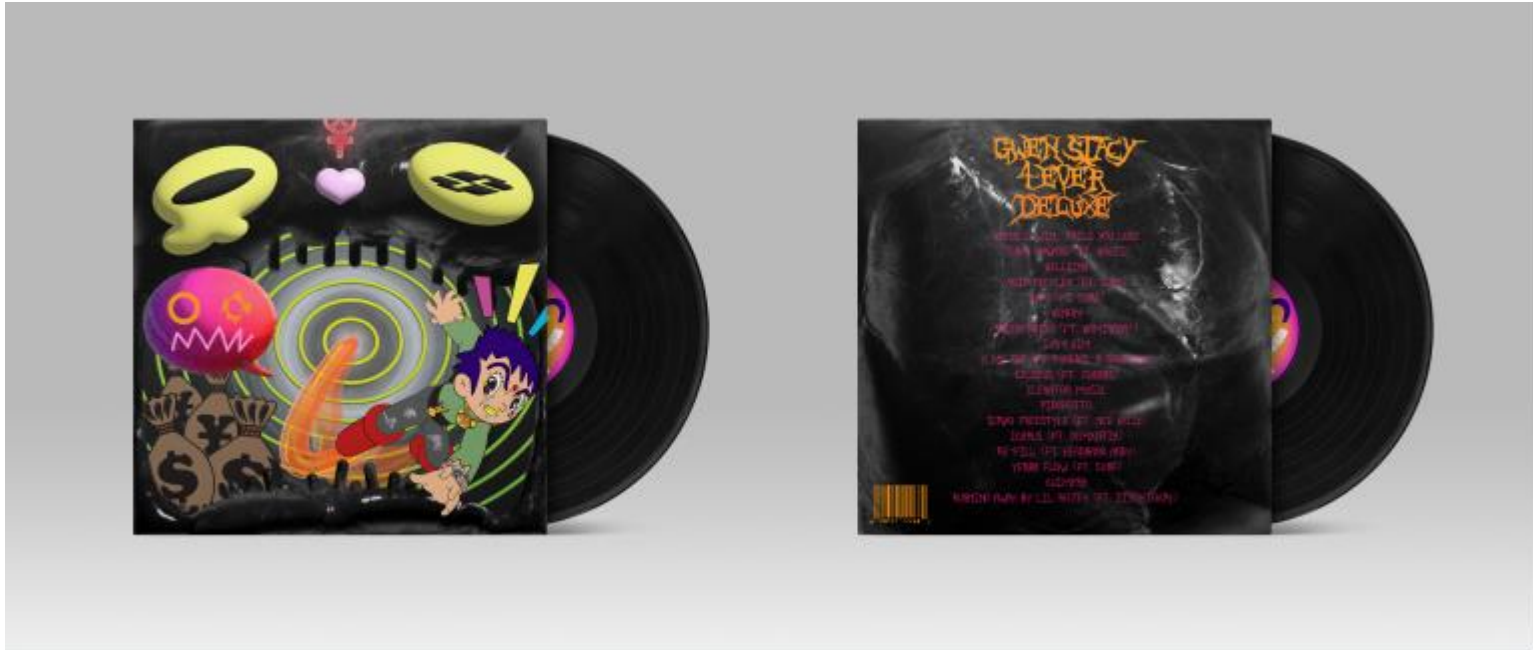
Figure 3: GWEN STACY 4EVER DELUXE REBRAND