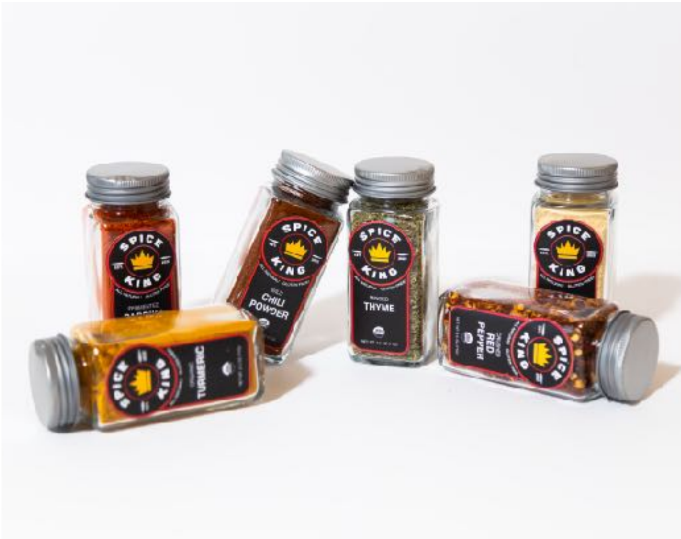
Figure 8: Spice King