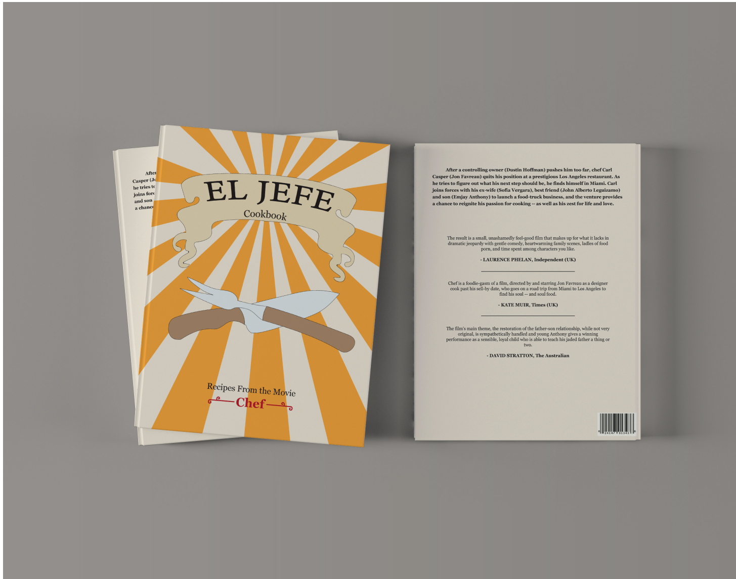
Figure 4: El Jefe