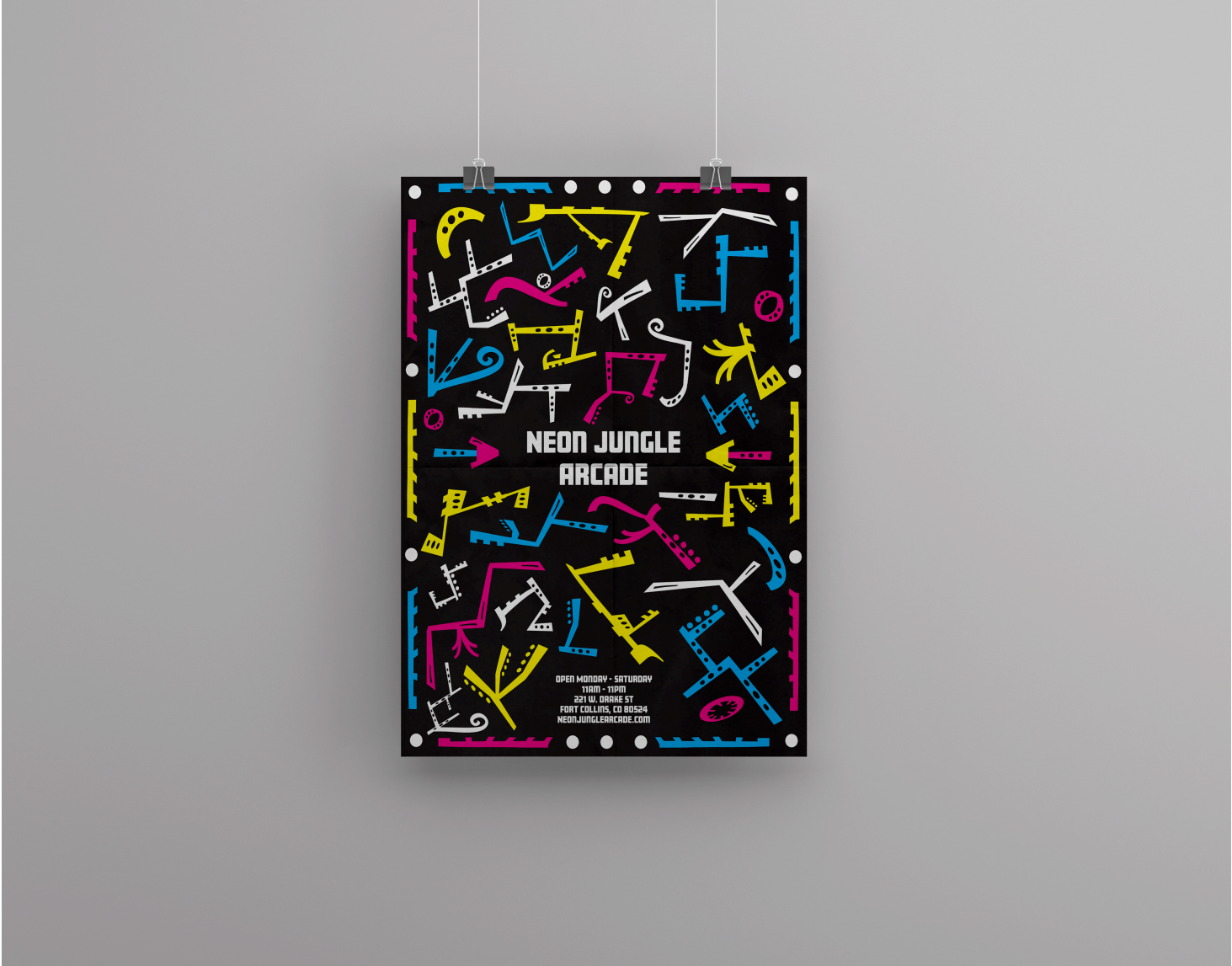
Figure 3: Neon Jungle Arcade Poster