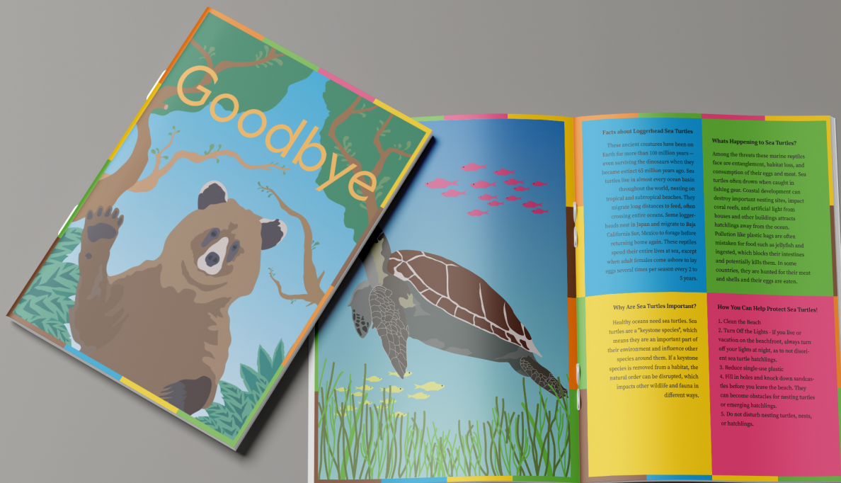
Figure 1: Goodbye