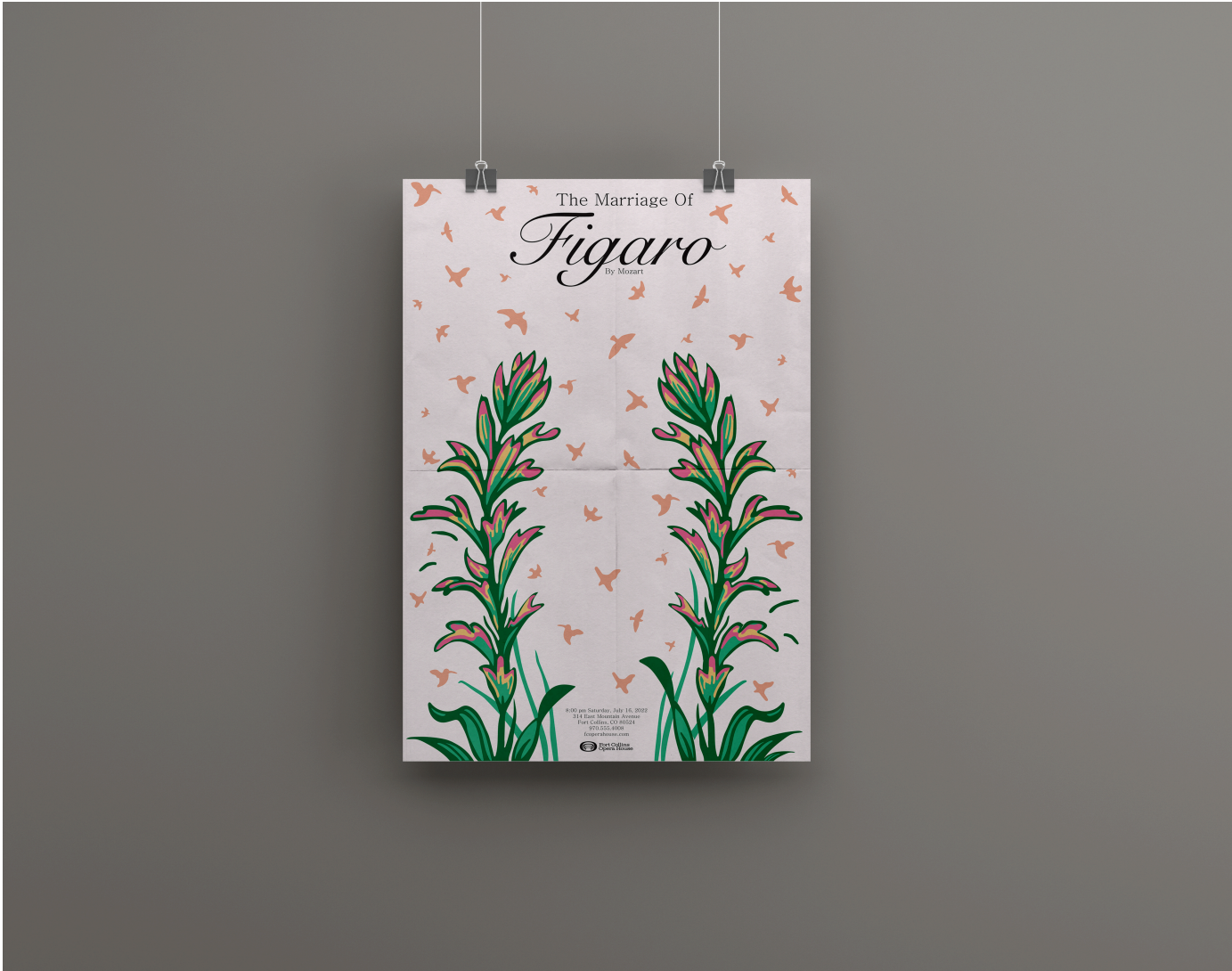
Figure 6: The Marriage of Figaro