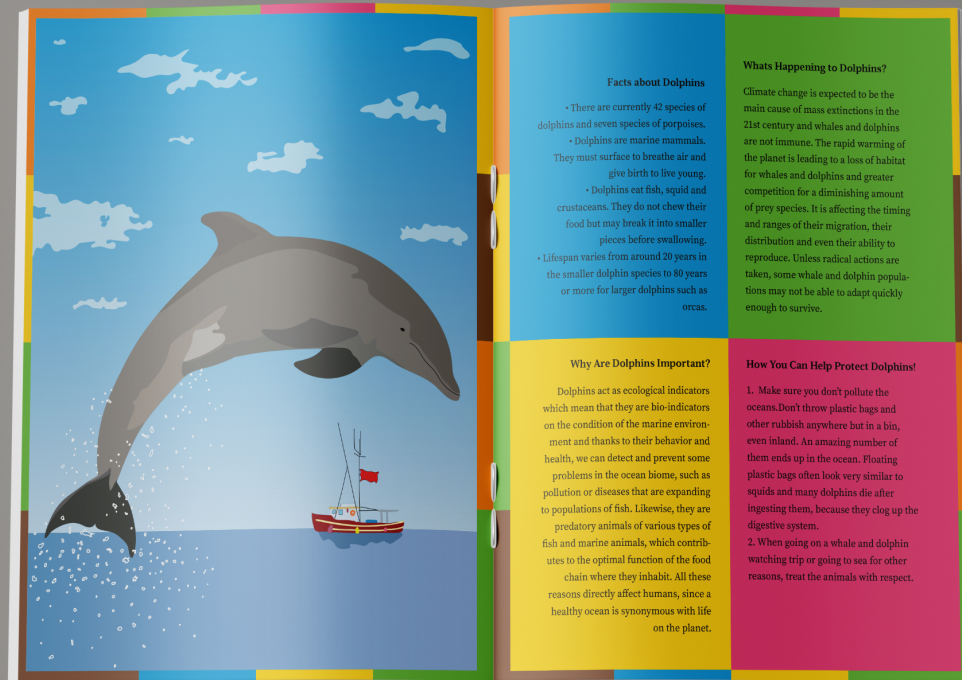
Figure 2: Goodbye (3-4)