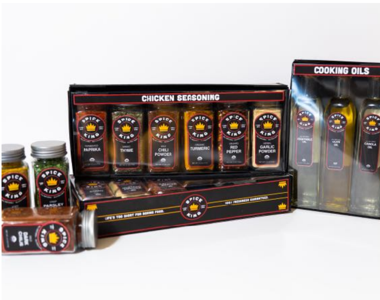
Figure 7: Spice King