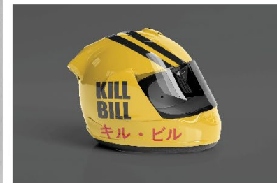
Figure 3: Kill Bill: Volume 1