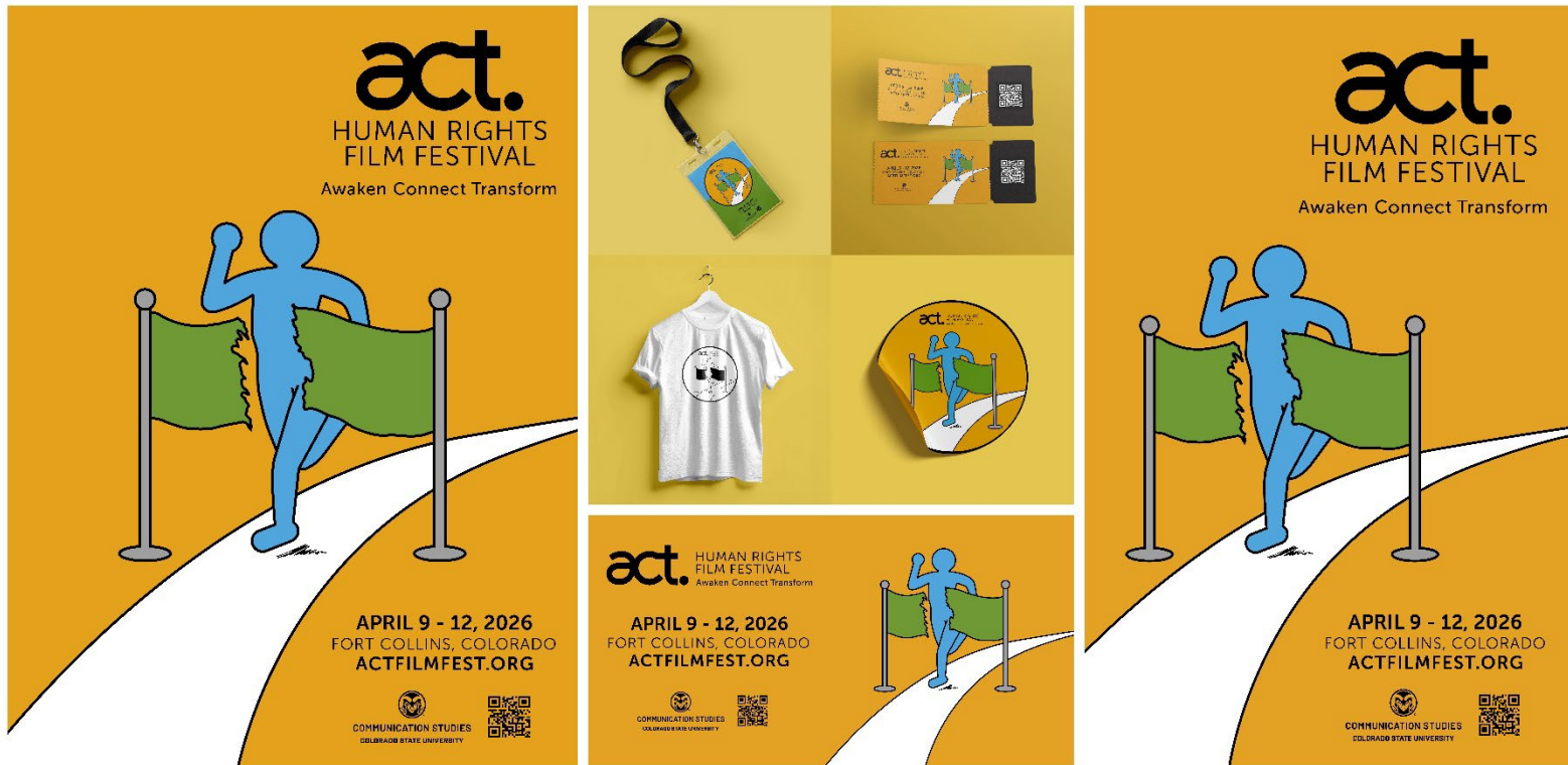
Figure 2: ACT Human Rights Film Festival