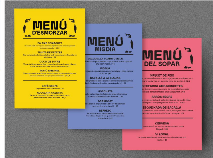
Figure 1: El Pingüi Català