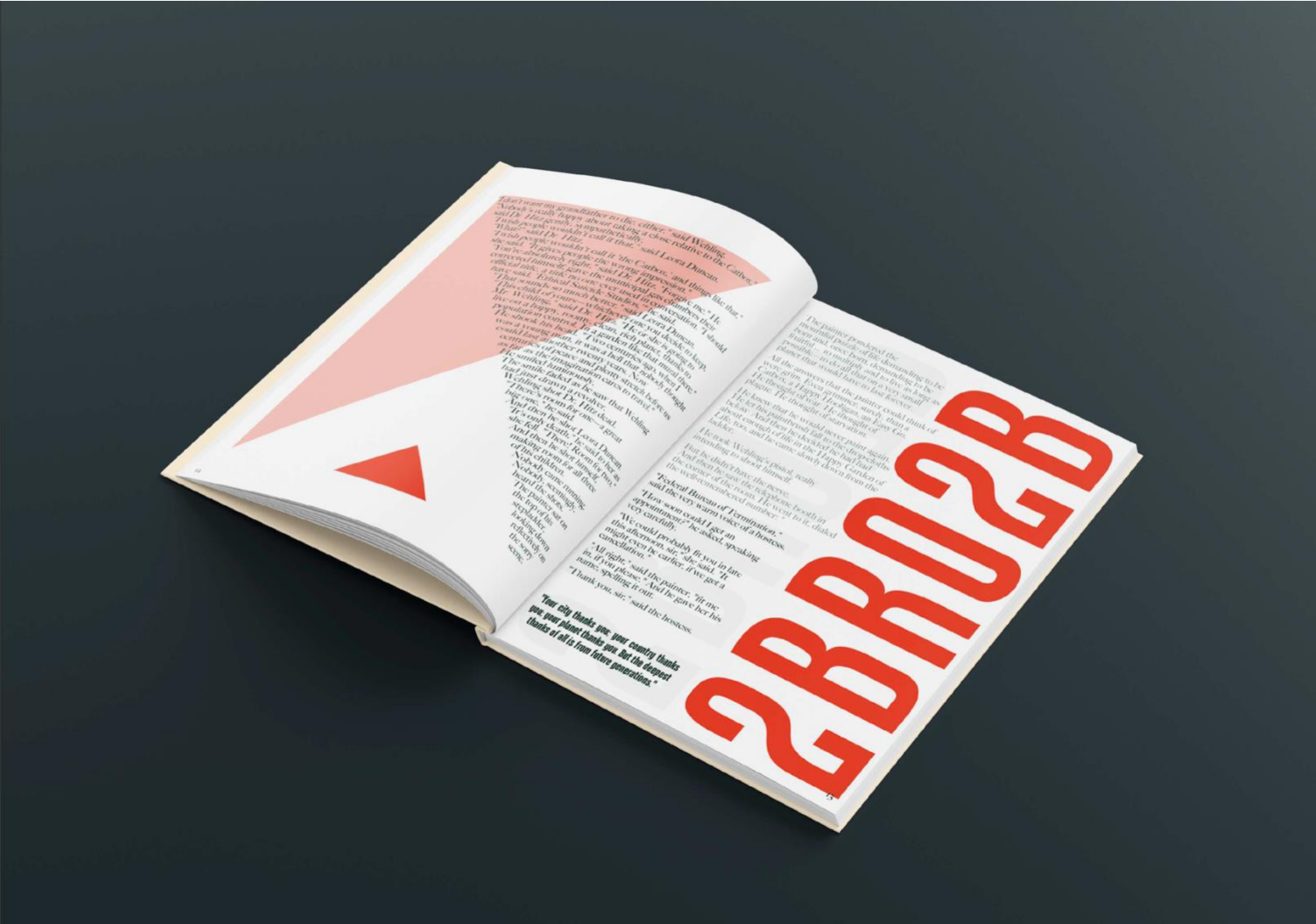
Figure 3: 2BR02B Type Based Book (detail 2)