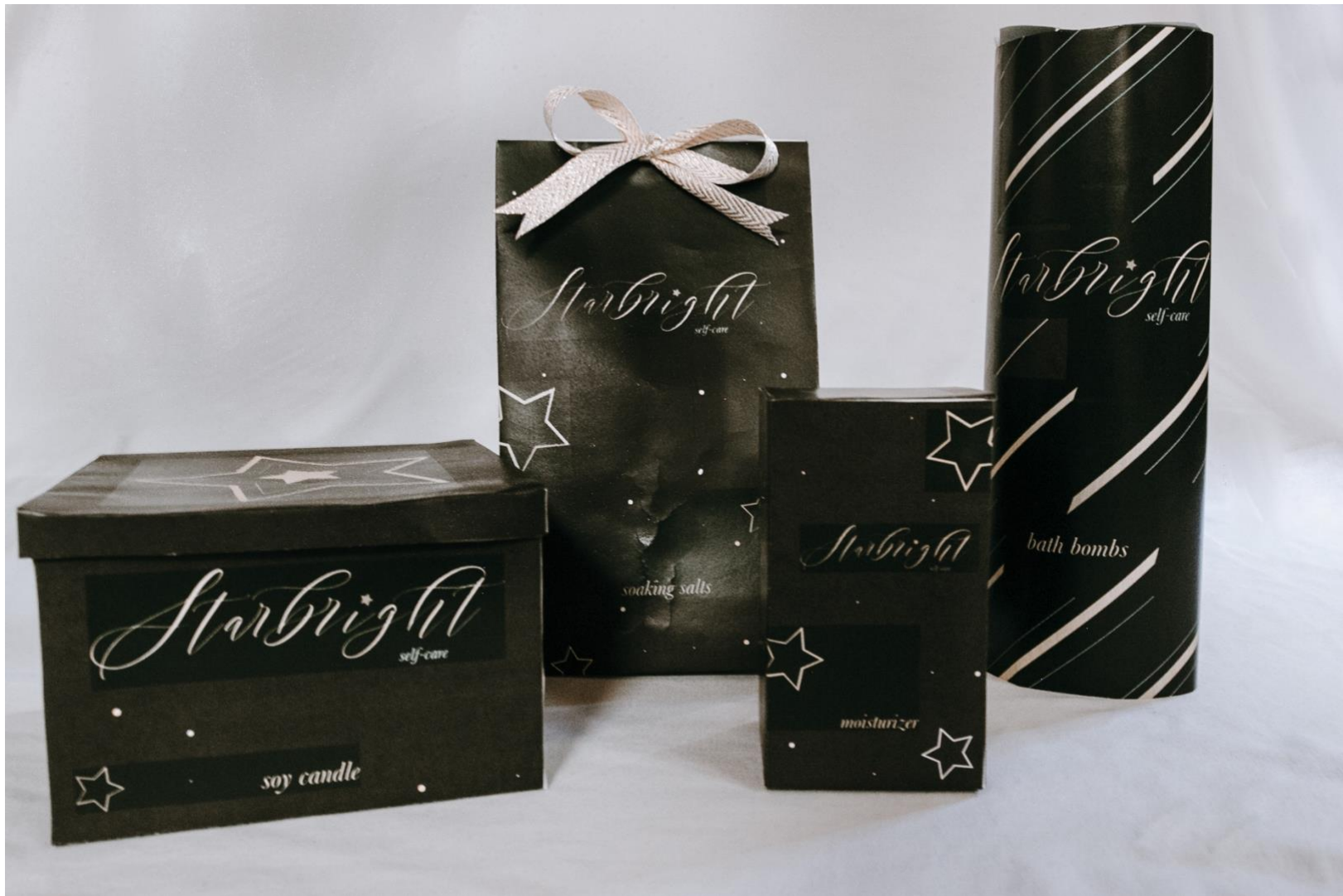
Figure 4: Starbright Beauty Branded Package (detail 1)