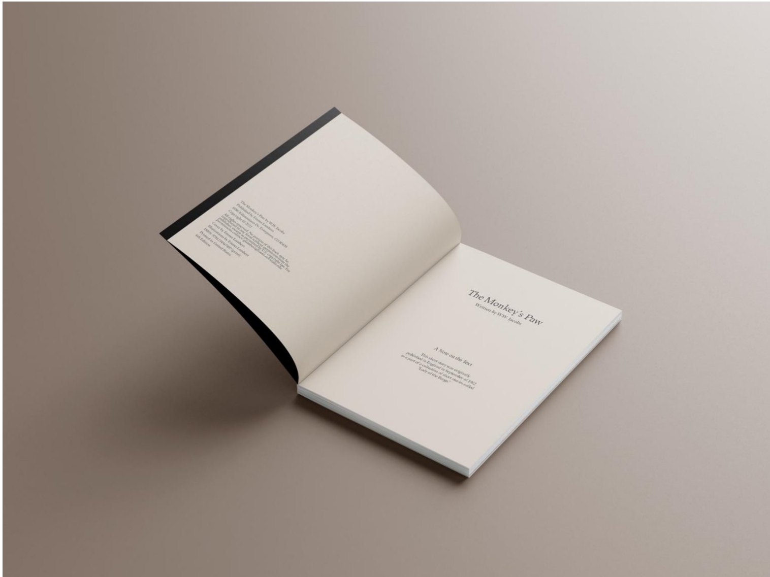
Figure 8: The Monkey's Paw Illustrated Book (detail 1)