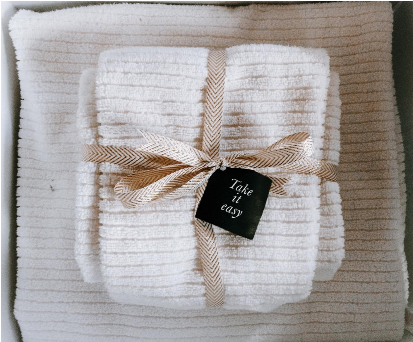
Figure 6: Starbright Beauty Branded Package (detail 3)