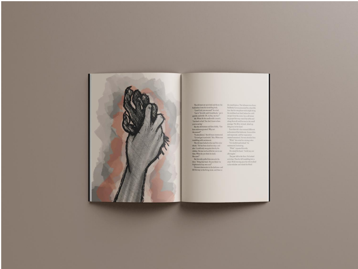
Figure 9: The Monkey's Paw Illustrated Book (detail 2)