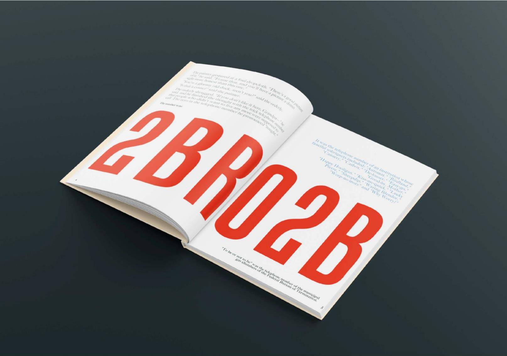
Figure 2: 2BR02B Type Based Book (detail 1)