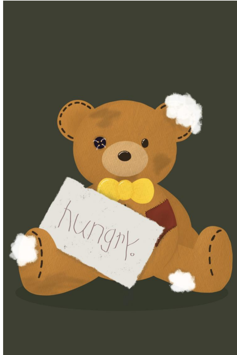
Figure 11: Hungry Poster