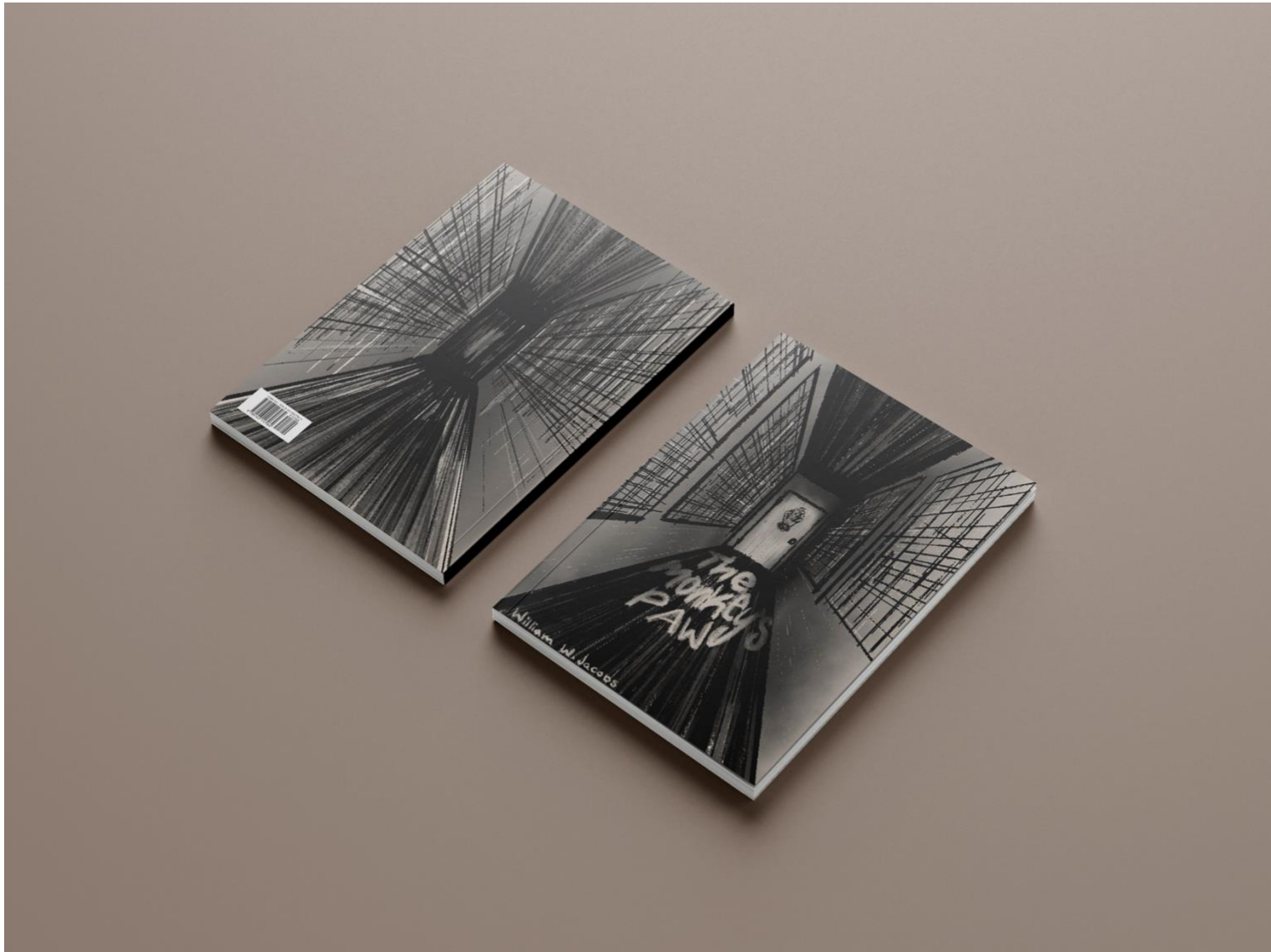
Figure 7: The Monkey's Paw Illustrated Book (Covers)