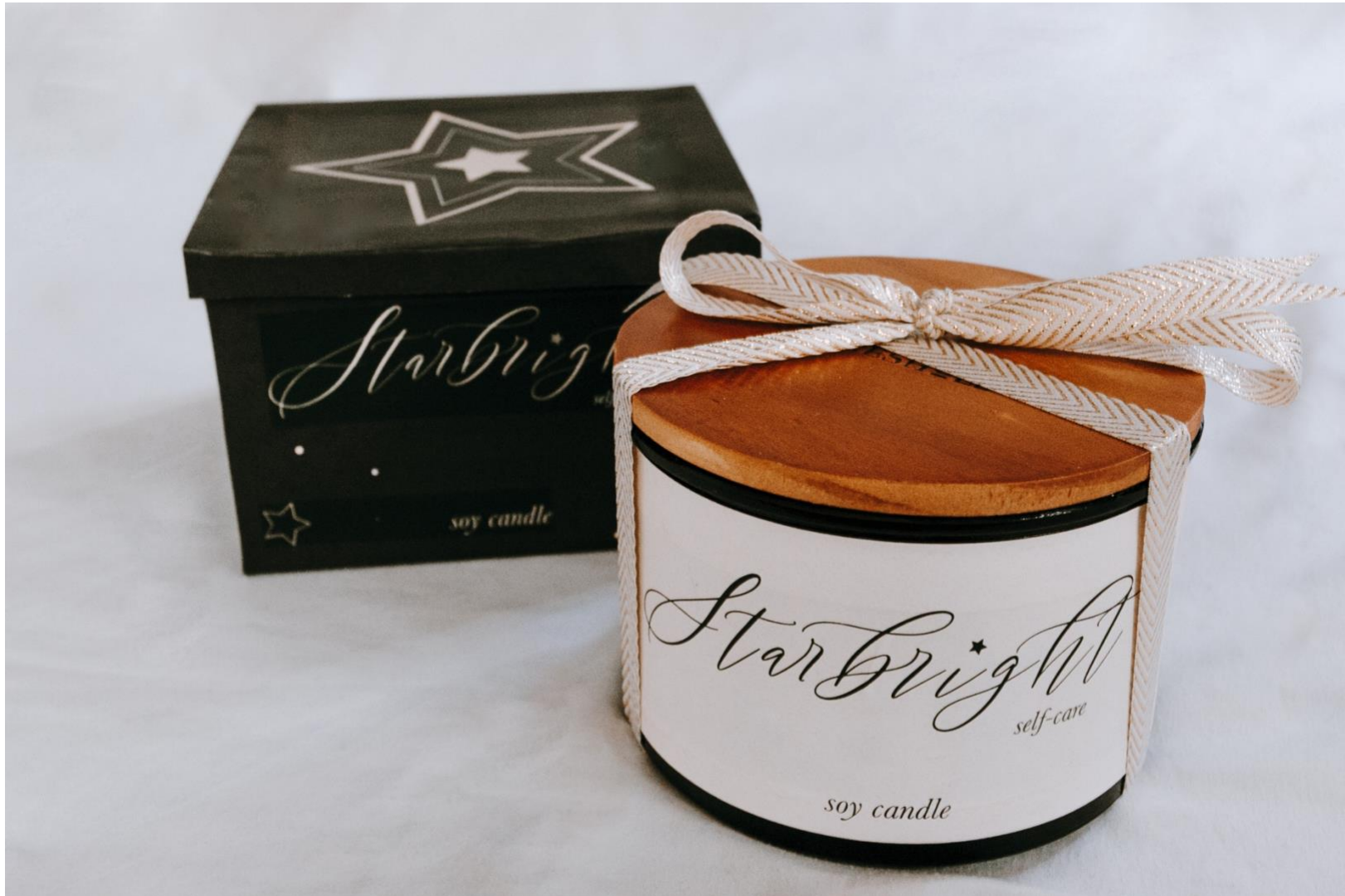
Figure 5: Starbright Beauty Branded Package (detail 2)