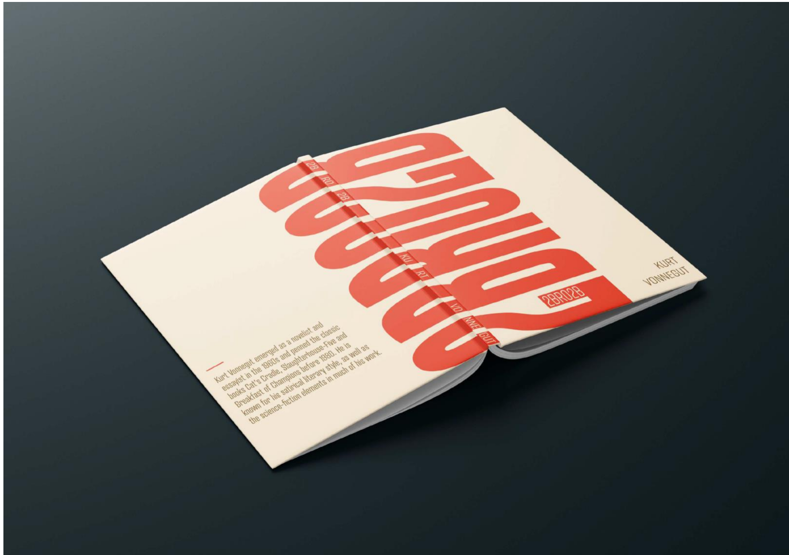
Figure 1: 2BR02B Type Based Book (covers)