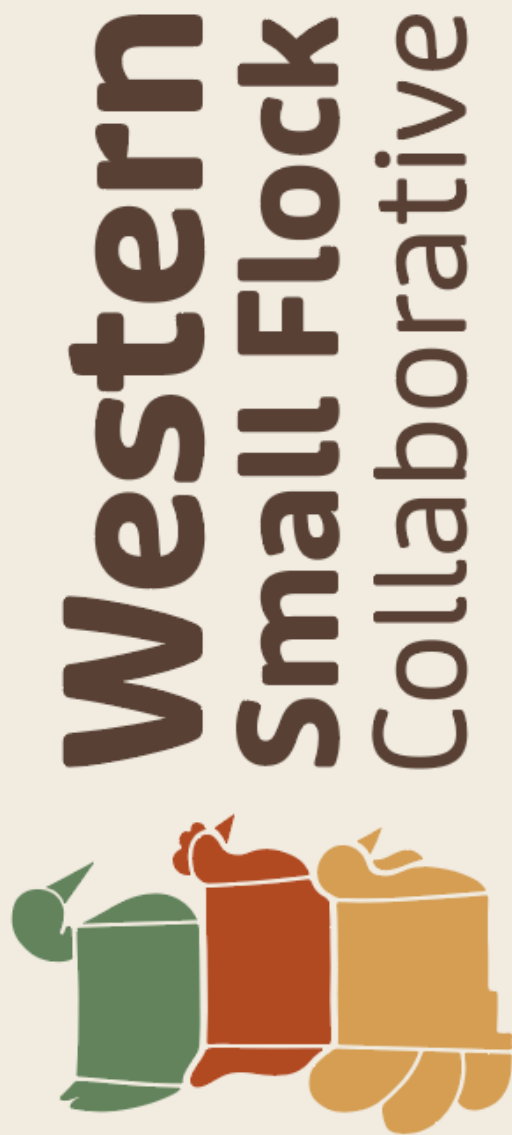
Figure 9: WSFC