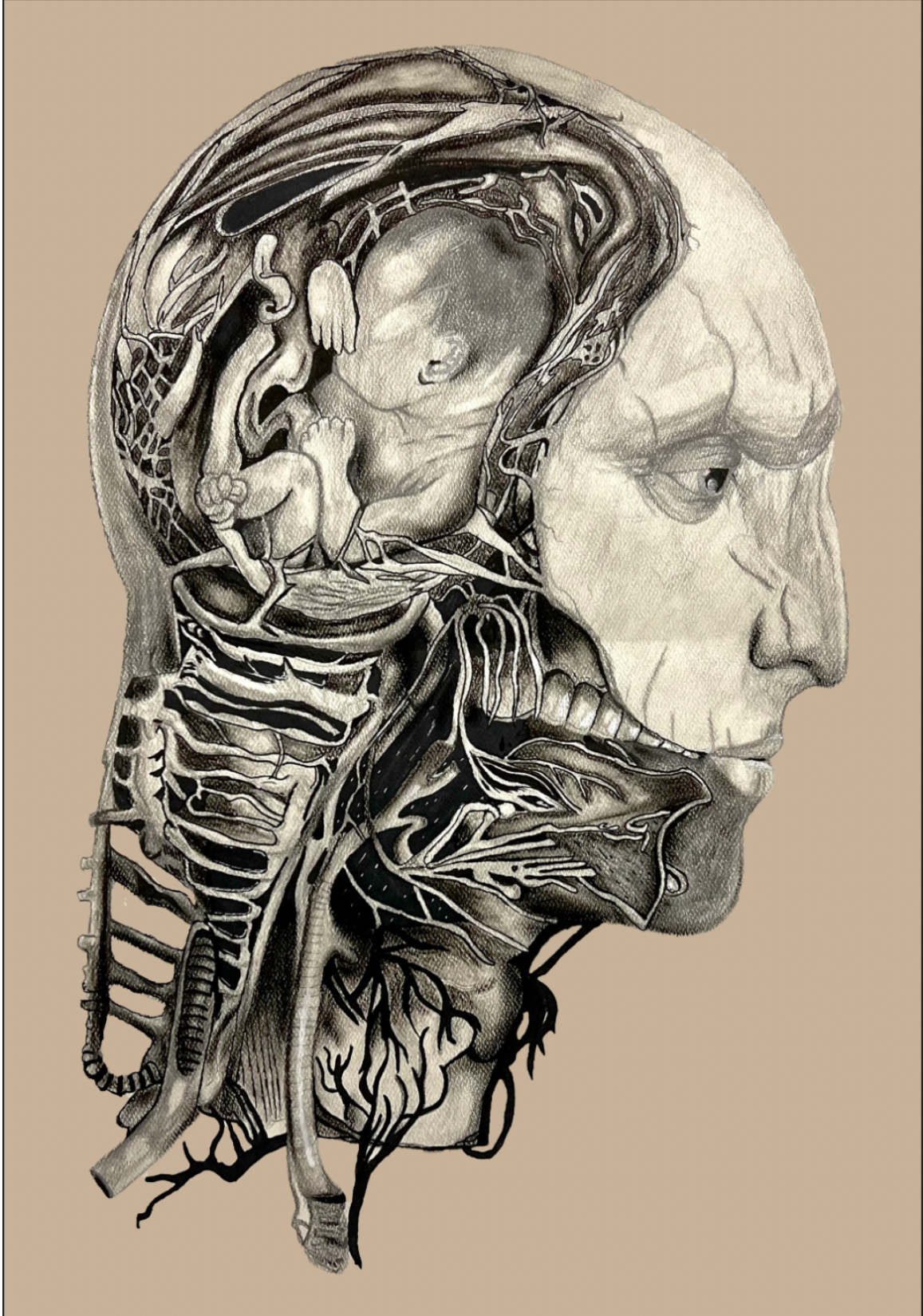
Figure 2: Born