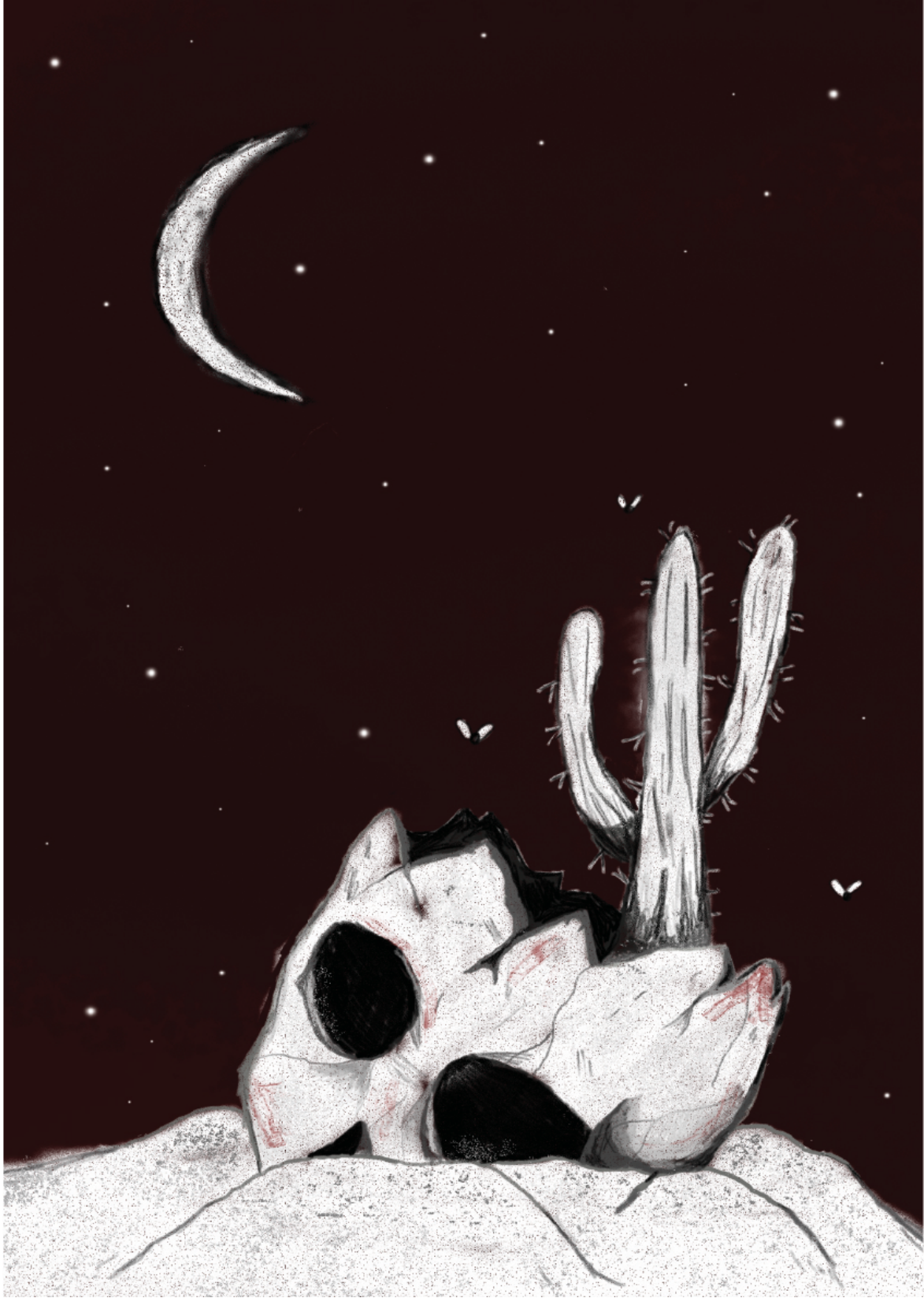
Figure 1: RED