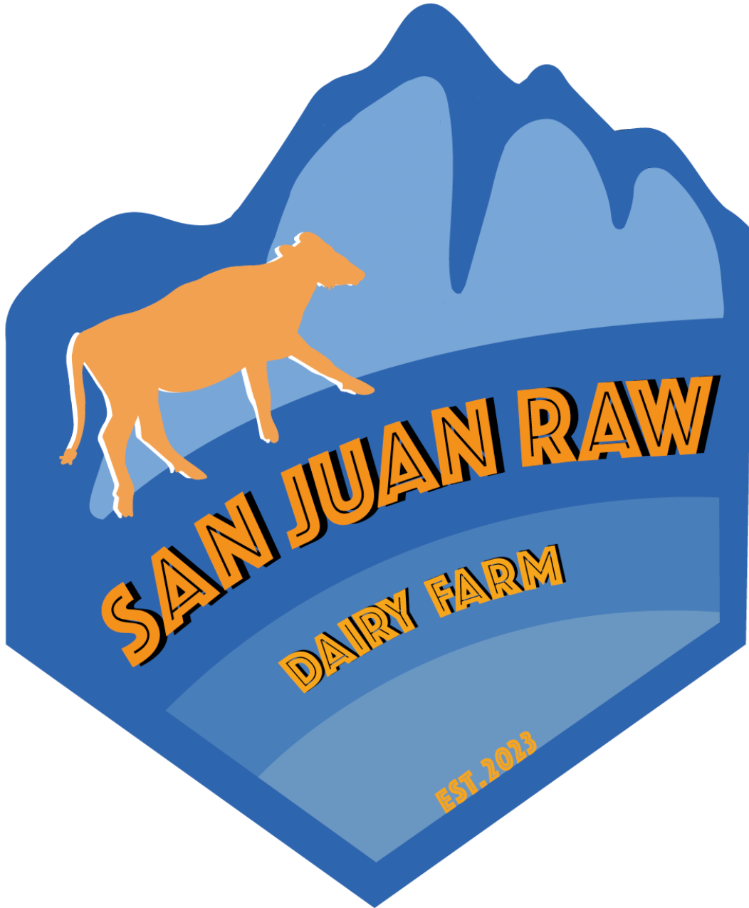
Figure 5: San Juan Raw