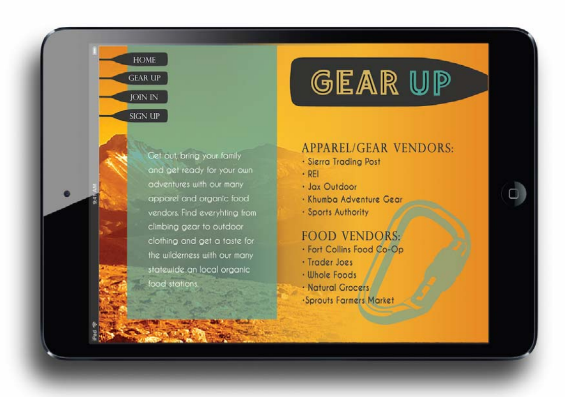
Figure 9: midtown ipad 1.