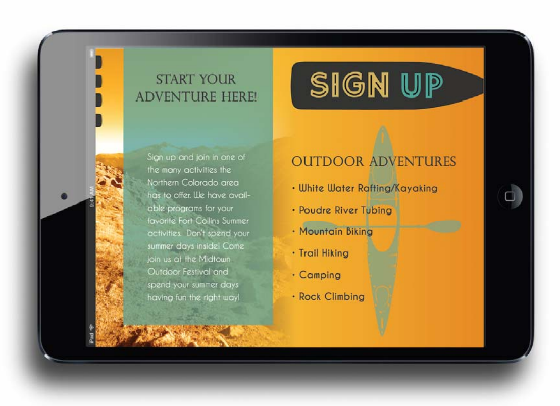
Figure 10: midtown ipad 2.