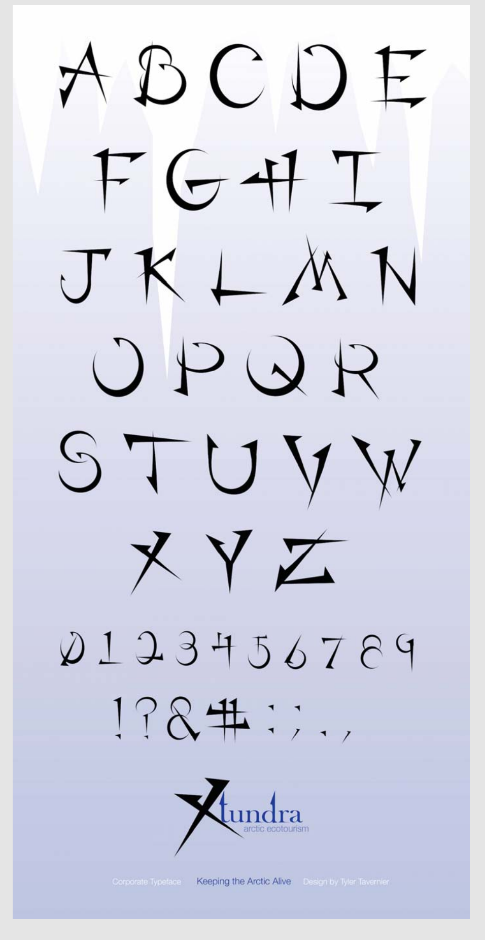
Figure 5: xtundra corporate font.