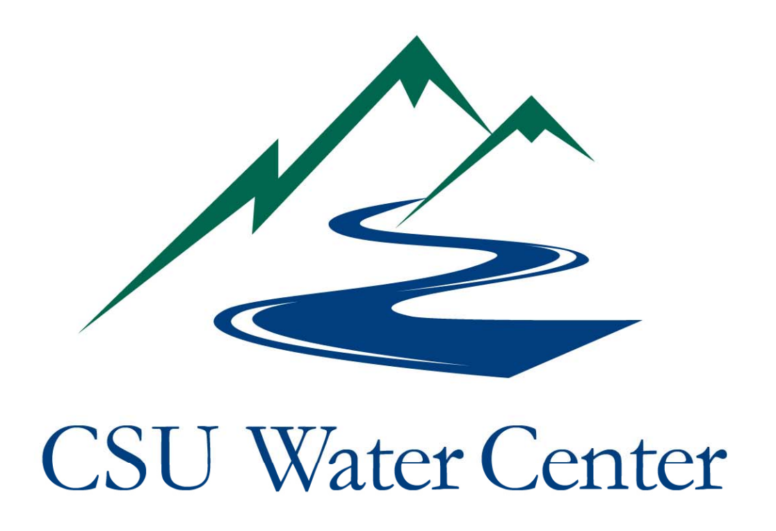
Figure 6: CSU Water Center logo.