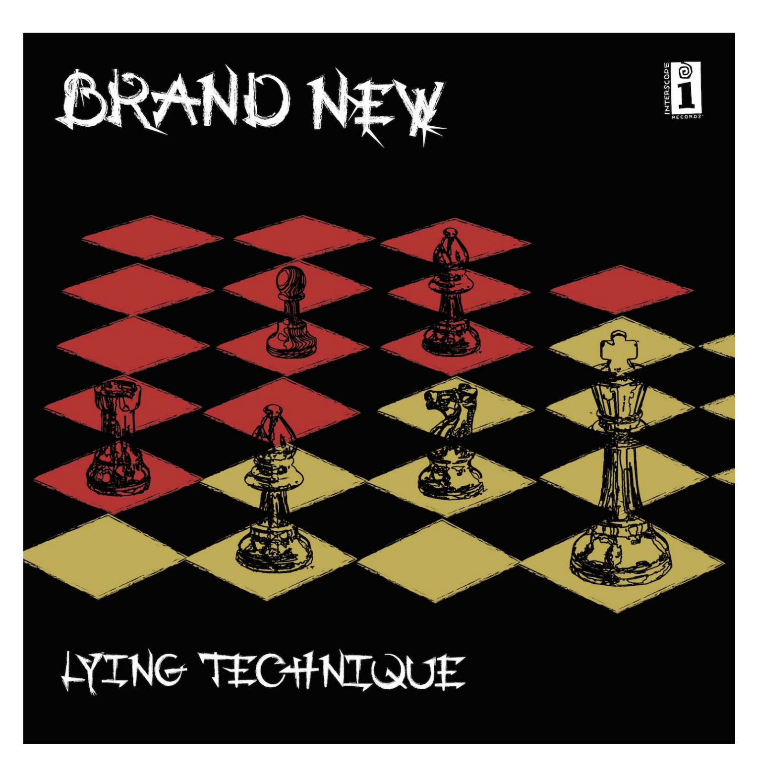
Figure 3: Brand New Vinyl Cover.