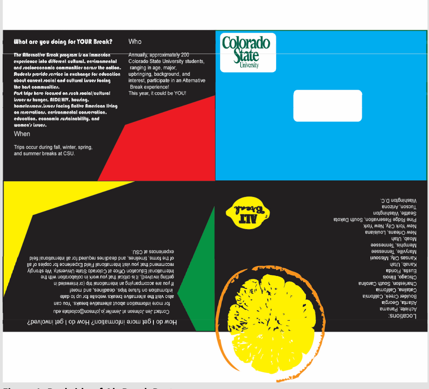
Figure 1: Backside of Alt Break Poster.