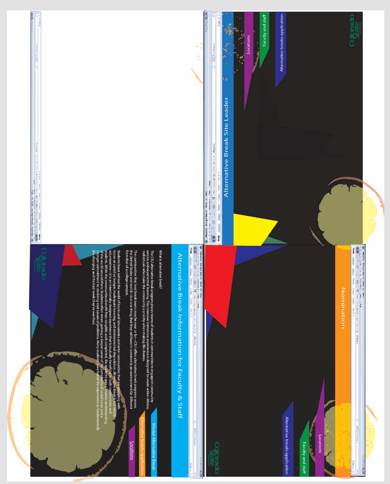
Figure 9: Alt break Website designs.