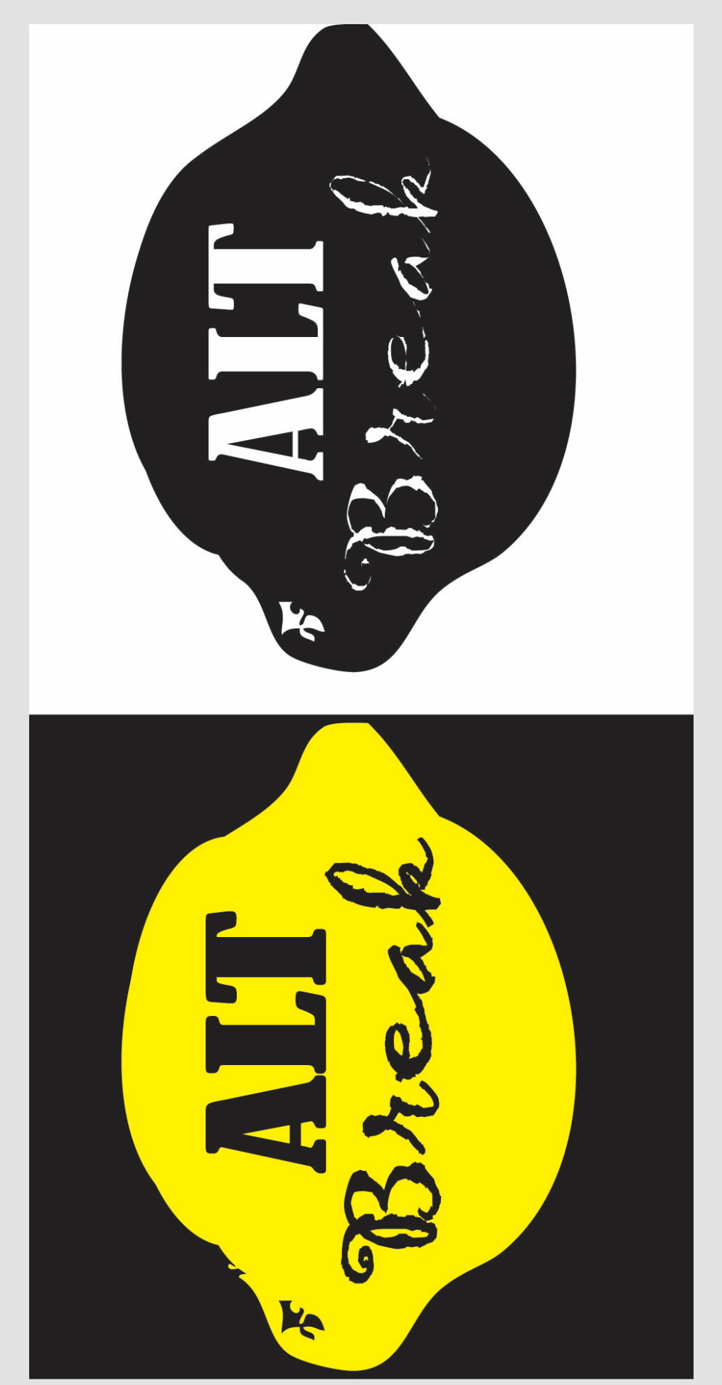
Figure 5: Lemon Logo- Alt Break Logo redesigned.