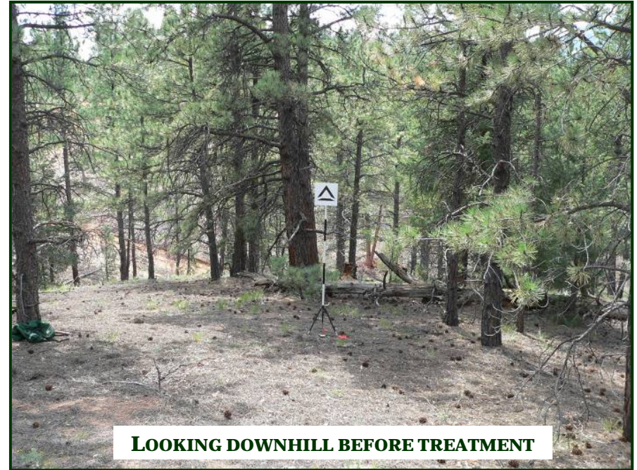
LOOKING DOWNHILL BEFORE TREATMENT

Average Slope: 20 percent Aspect: South Elevation: 7,050 feet Latitude & Longitude: N39.43920/W105.2176 Remarks: Denver Water Lower North Fork Area Pretreatment Plot in Mastication Unit 4