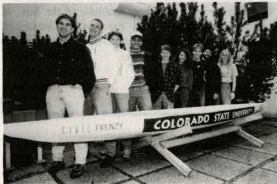
CSU Team with "Civil Frenzy"

With inspiration gained after hosting the National Concrete Canoe Competition last June, the Colorado State civil engineering team challenged themselves to build a sleek and maneuverable canoe of concrete to prove it is a versatile material and can be used to build swift watercraft. The competition is sponsored by the American Society of Civil Engineers (ASCE) and Master Builders, Inc.