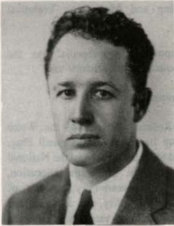
Thomas Hornsby Ferril

Born in Denver on February 24, 1896, Thomas Ferril published his first poem in 1906 at the age of ten. He attended Denver schools and graduated from Colorado College in Colorado Springs in 1918. After working for several Denver newspapers, Ferril was hired by the Great Western Sugar Company as a press agent. He worked there for 42 years.