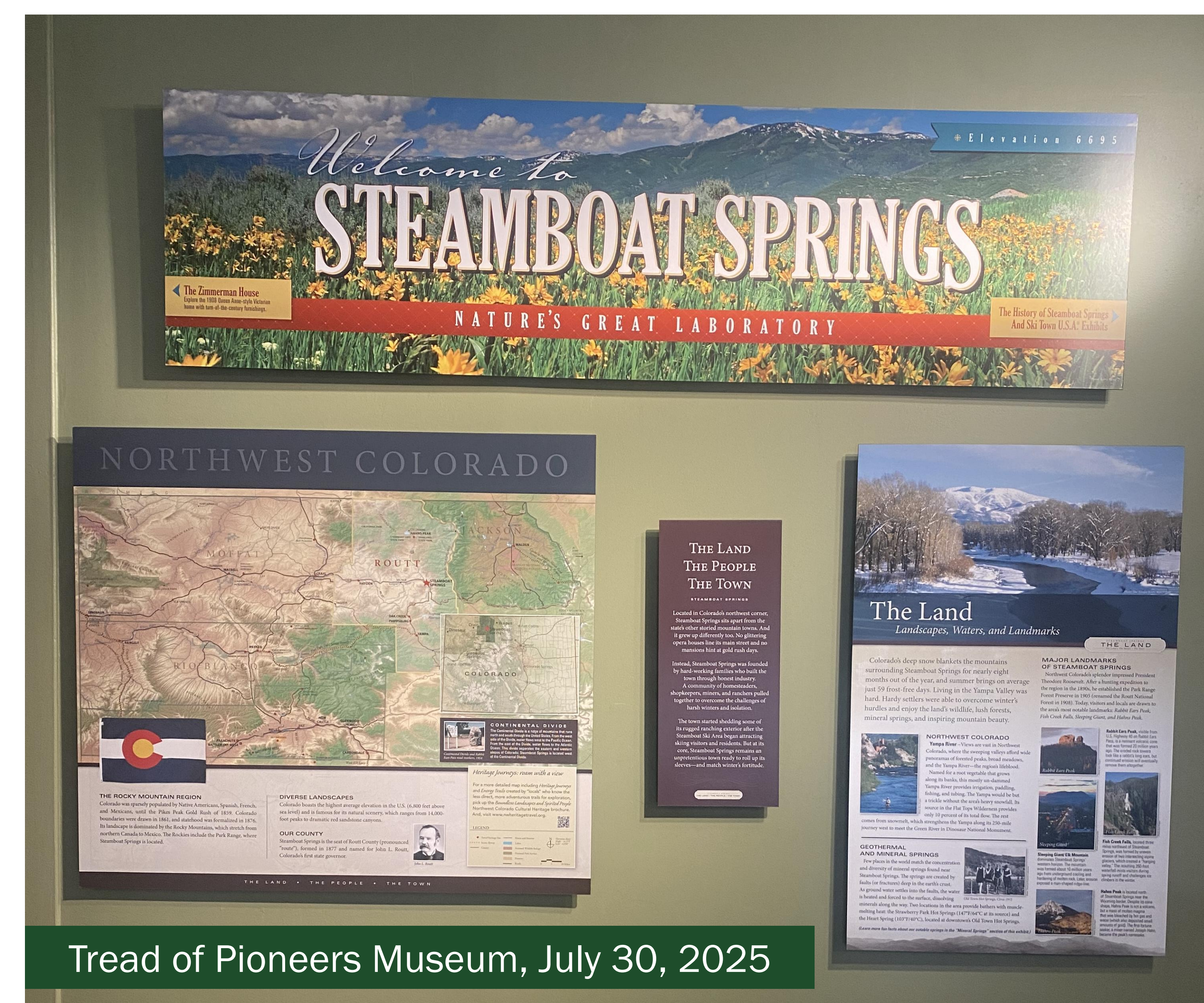
Tread of Pioneers Museum, July 30, 2025