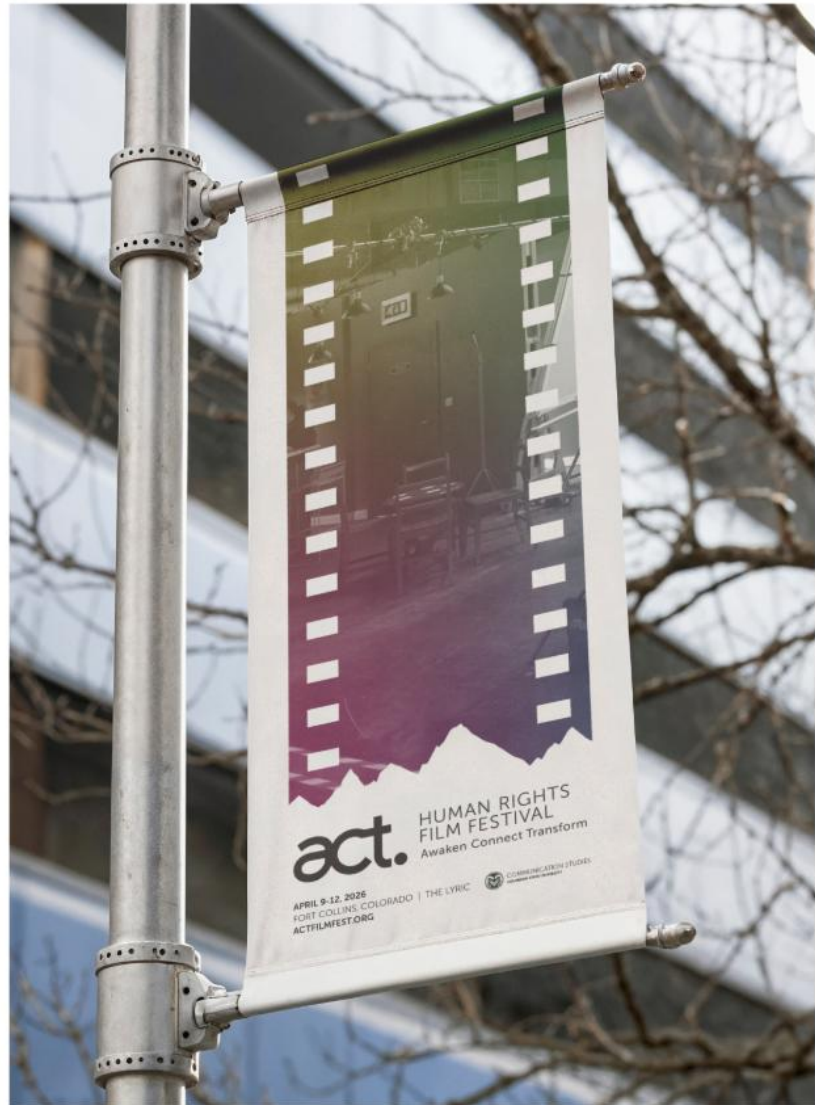
Figure 2: ACT Film Festival