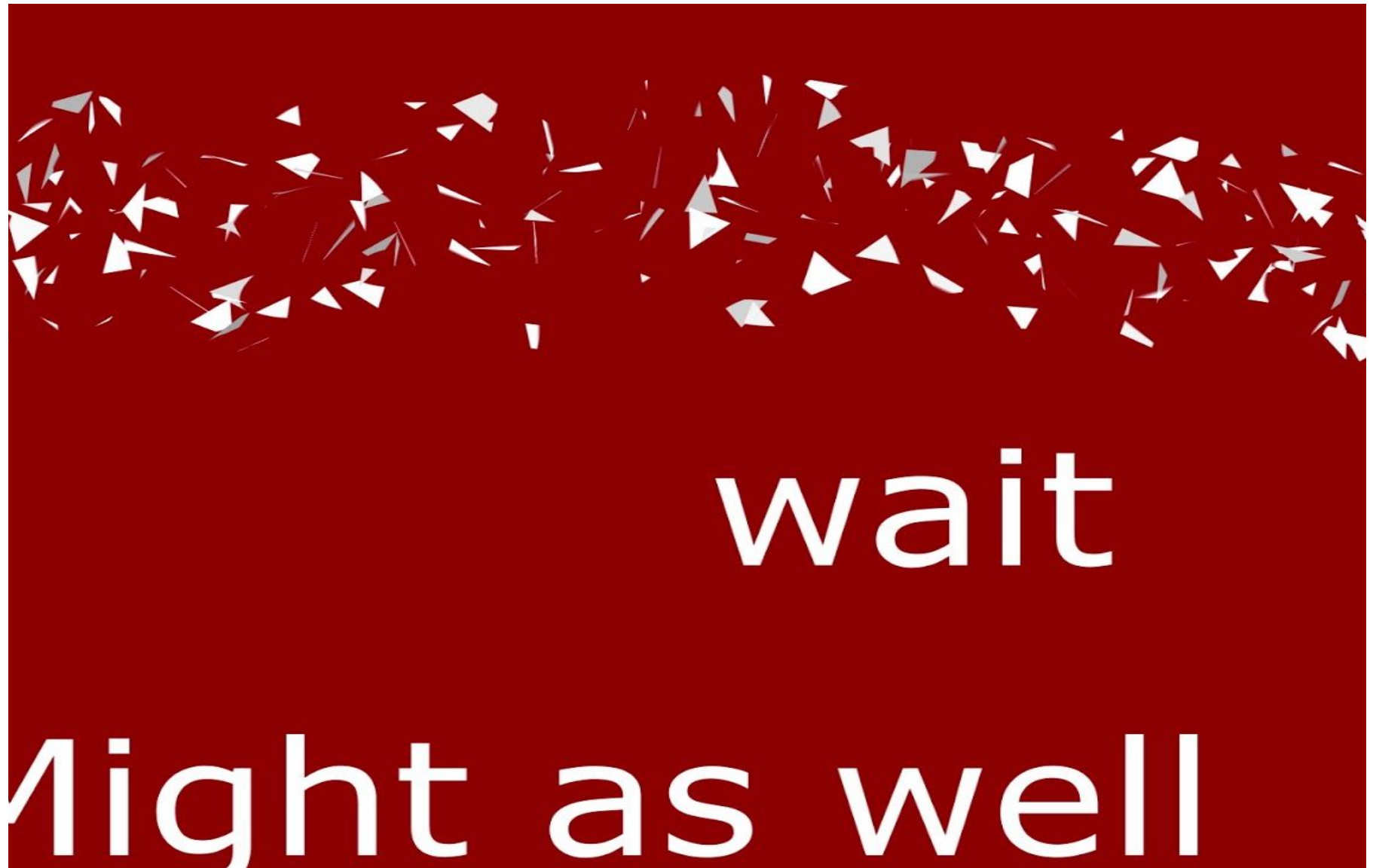
Figure 2: Healing