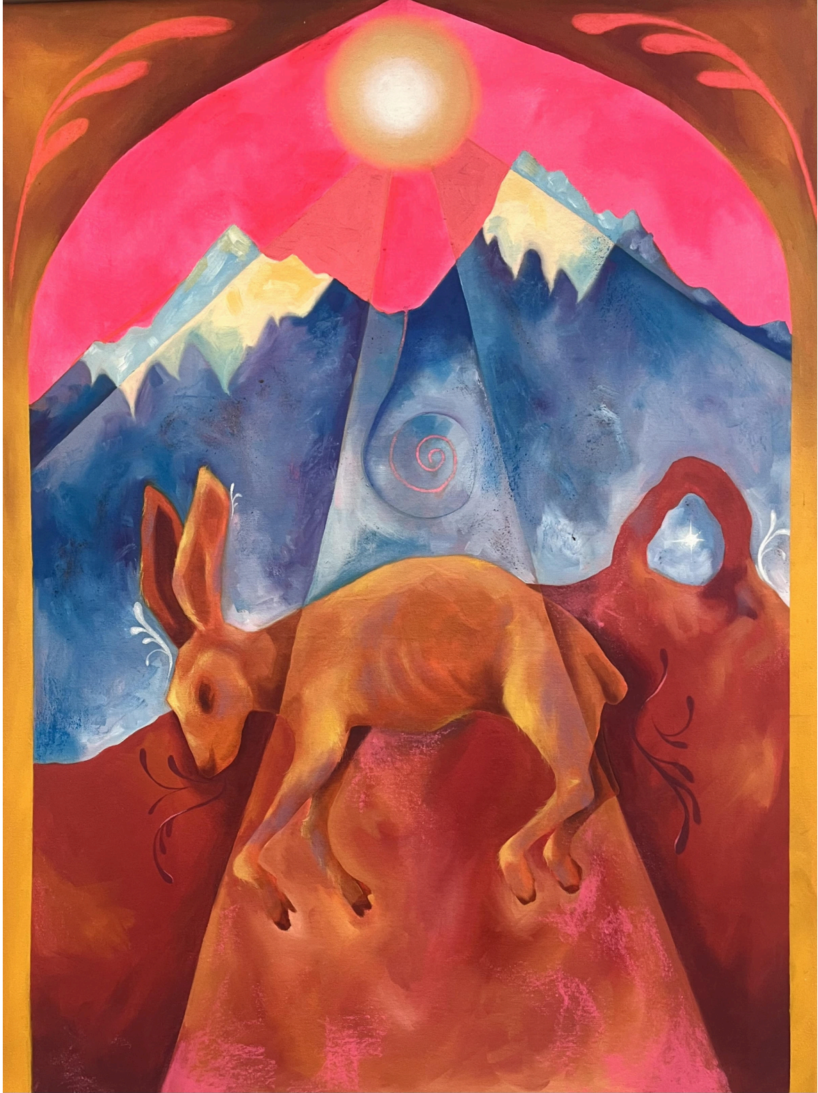
Figure 6: Talisman