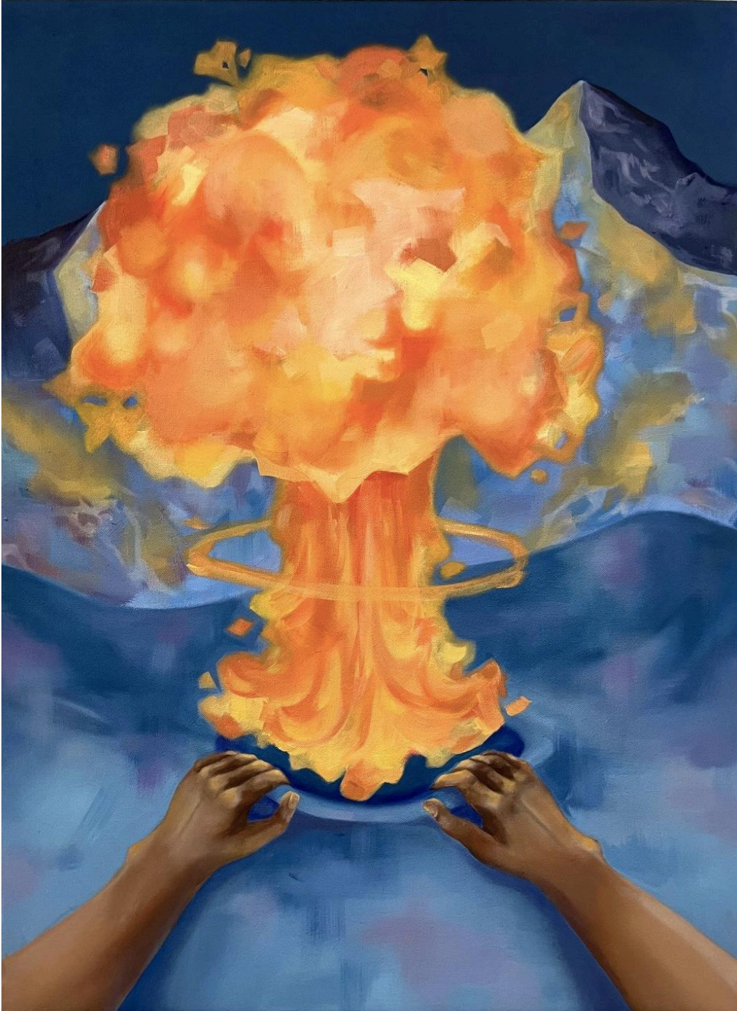
Figure 3: It Happened in My Dream