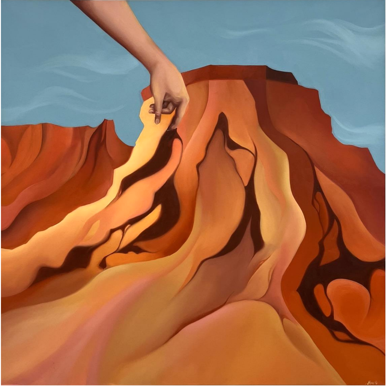
Figure 4: The West's Caress