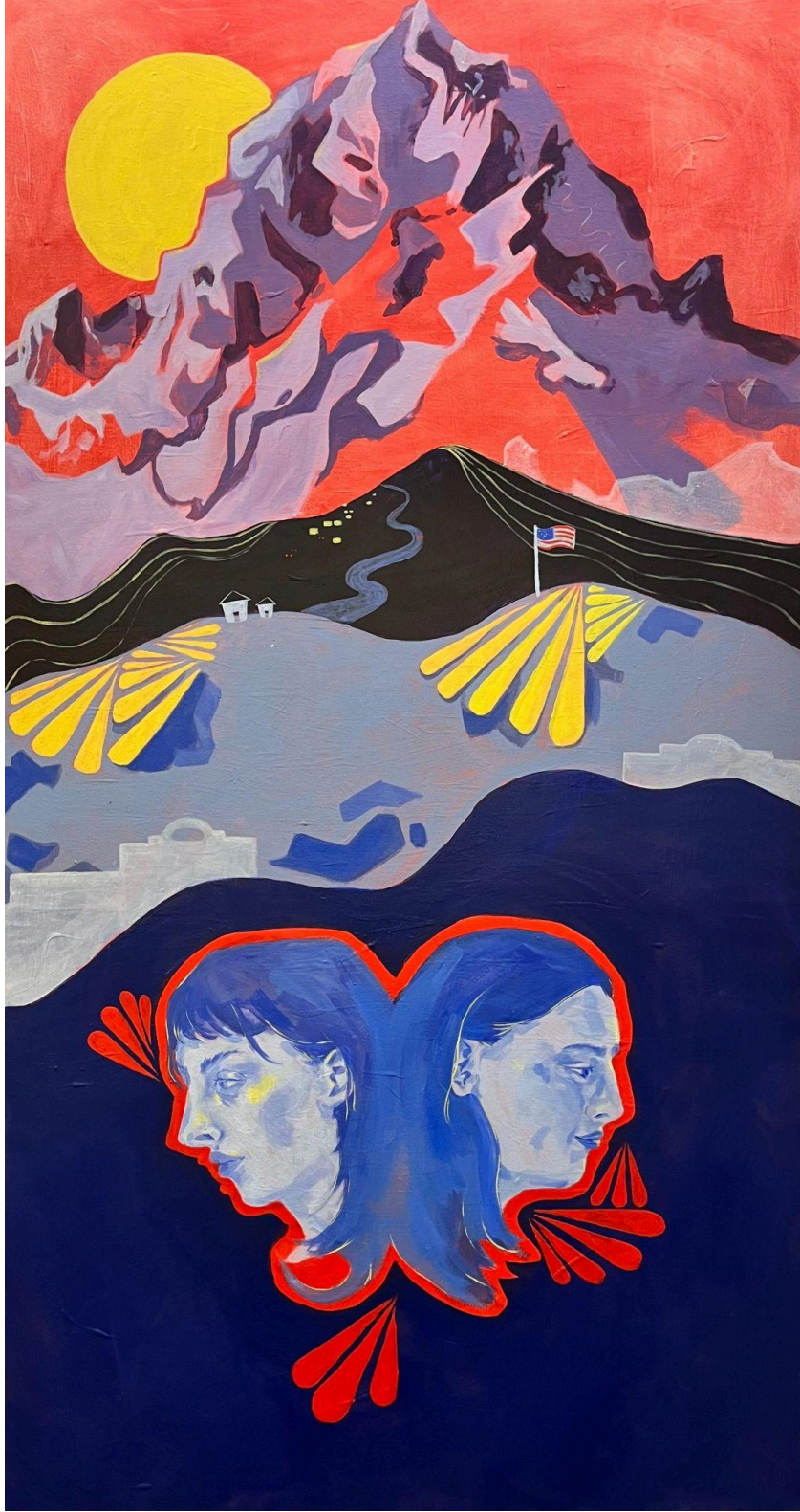
Figure 7: Under My Sky, Under Hers