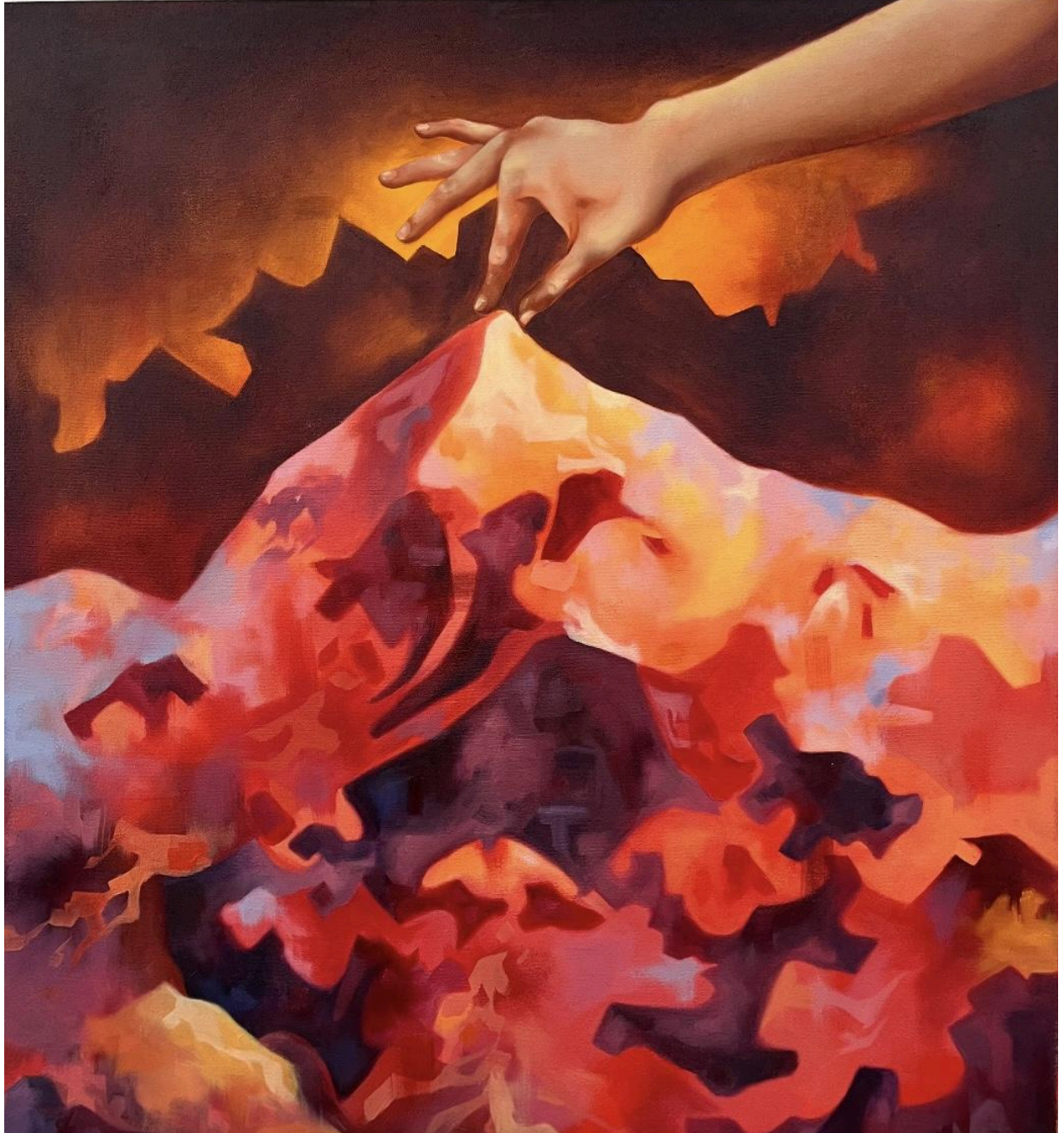
Figure 1: Atop Heaven's Peak