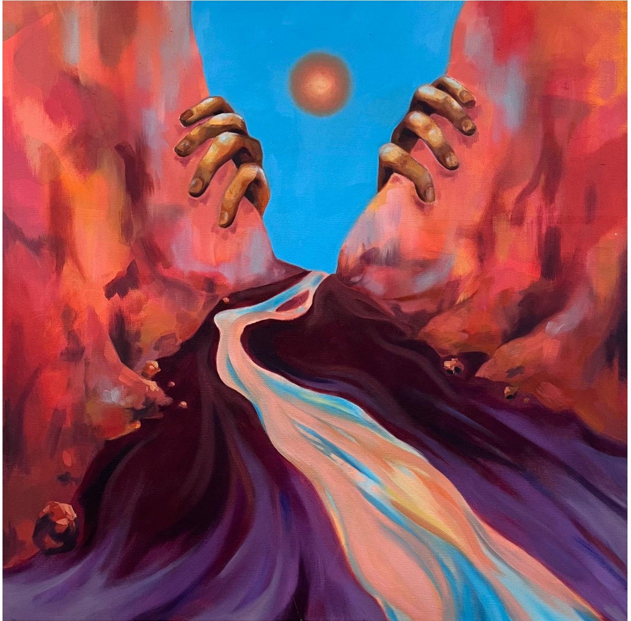
Figure 2: Down the Lonely Canyon